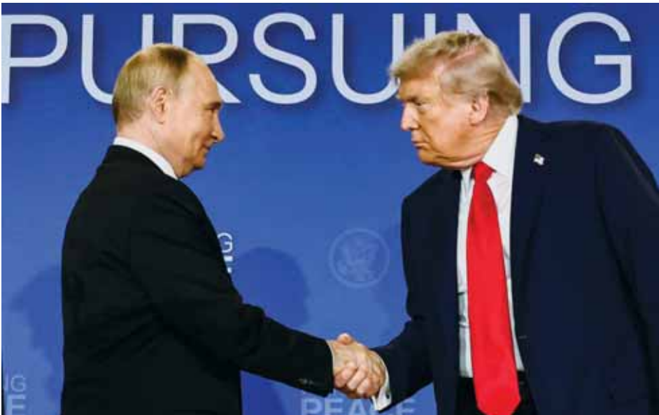
US President Donald Trump and Russian President Vladimir Putin shake hands during a press conference following their meeting to negotiate an end to the war in Ukraine, at Joint Base Elmendorf-Richardson, in Anchorage, Alaska, on August 15, 2025.

"Russia is prepared for any development. New threats to our security will be promptly and firmly countered," he said.