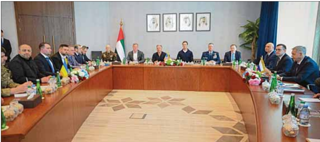
Members of the US, Russian and Ukrainian delegations attend the second round of trilateral talks in Abu Dhabi, yesterday. Ukrainian and Russian officials wrapped up a “productive” first day of new US-brokered talks, Kyiv’s lead negotiator said, as fighting in Europe’s biggest conflict since World War Two raged on.

to stop buying Russian oil, but the source said they were based on an assumed 30% drop in Indian purchases, an assumption that remains in place for now. The revenue decline comes as Russia and Ukraine are engaged in US-mediated direct talks in the United Arab Emirates this week, with all sides saying that progress is being made towards an eventual settlement. Russia has 4.1tn roubles in fiscal reserves that the government can draw on to cover the deficit, but analysts estimate that at the current pace of revenue decline those reserves would be largely depleted within a year. The source said that while a rising deficit and dwindling reserves would not trigger an economic collapse, they would require a response from financial authorities. “This is not a catastrophe. It is something that can actually be financed, but not at such interest rates,” the source said, adding that the finance ministry was likely to propose spending cuts, which would be the wrong move during an economic slowdown. Some assumptions in the current budget, such as an announced slight cut in military spending, are “unrealistic”, the source said.