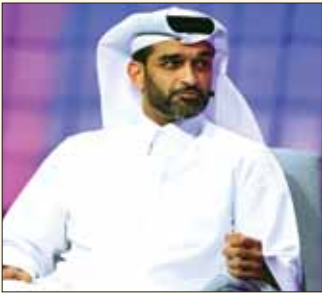
HE the Managing Director of Supreme Committee for Delivery and Legacy (SC) Hassan bin Abdullah al-Thawadi.

taking advantage of and building on it. He indicated that Arabic content is 'missing from the global narrative in particular.' He noted the importance of refuting the concept of entertainment being central to the West, as reality proves that entertainment is not linked to a specific geographical area, as evidenced by the existence of a film and creative industry in Korea, Japan, China and the Arab world. He said Arab culture has a role in storytelling, especially in the form of modern storytelling such as films, and there is a great history that testifies to this. However, the major markets are located in the West, which gave the impression that the industry is only Western, while the reality confirms that the market is global, and this is what happened when Qatar hosted the FIFA World Cup Qatar 2022. Al-Thawadi stressed that the