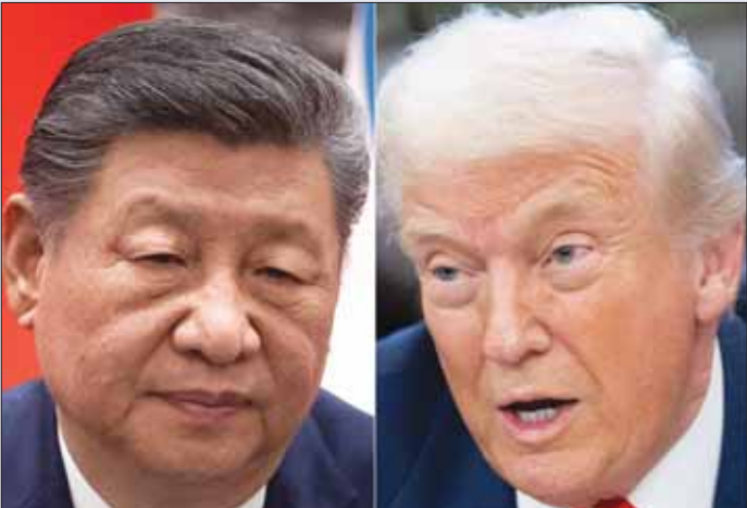
Chinese president Xi Jinping, and US President Donald Trump. China agreed to buy more US-farmed soybeans in what President Donald Trump called a “very positive” call with President Xi Jinping yesterday, even as Beijing warned Washington about arms sales to Taiwan.