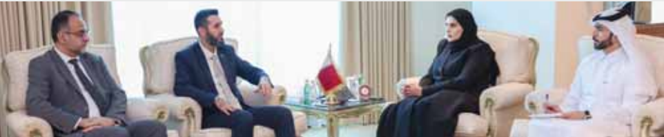
HE the Minister of State for International Co-operation Dr Maryam bint Ali bin Nasser al-Misnad met yesterday with visiting Head of the Planning and Statistics Authority in Syria Anas Salim. During the meeting, the two sides discussed co-operation between the countries and ways to support and strengthen them, particularly in the humanitarian fields, as well as early recovery and reconstruction projects. The meeting also addressed a number of issues of common interest. (QNA)