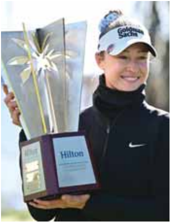
Nelly Korda poses with the trophy after winning Hilton Grand Vacations Tournament of Champions in Orlando.

Nelly Korda captured her 16th career LPGA title on Sunday at the season-opening Tournament of Champions after the event was shortened to 54 holes by sub-freezing temperatures. Korda completed an eight-under par 64 in the third round on Saturday at Lake Nona Country Club but six leaders were left on the course when play was halted on the Orlando, Florida, layout. They finished Sunday afternoon but none could catch Korda, the 27-year-old American winning for the first time since November 2024 in a seven-win season that qualified her for the tournament. "I really, over the off-season, was motivated to get back in the winner's circle," Korda said. Tokyo Olympic champion Korda, a two-time major winner, called her Saturday 64 in blustery and cold conditions among her greatest career rounds. "I would probably say a top-three round of my career," Korda said. "Conditions were brutal and they just got worse and worse throughout the day. Korda added that holes "17 and 18 were brutal. I think they were probably the hardest holes I've ever played in professional golf." After consulting with players and the grounds crew on Sunday, officials made the decision to complete 54 holes but cancel Sunday's scheduled final round.