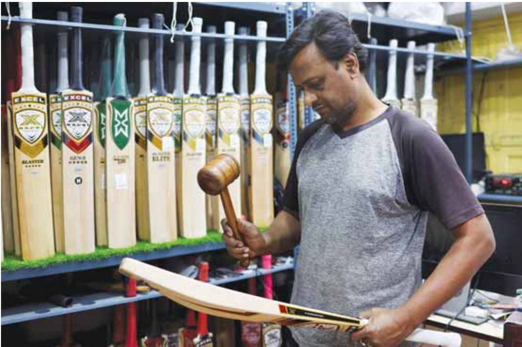
A man works on a cricket bat to prepare for sale at a sports gear shop in Kolkata, India, yesterday.

“Nothing is more important than the memory of Pakistani citizens and troops murdered by Indian proxy terrorists over the weekend,” Zaidi said. “With funer-