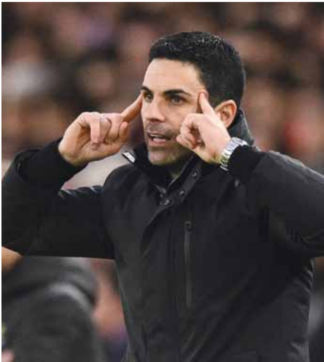
Arsenal’s manager Mikel Arteta gestures on the touchline during the Premier League match against Leeds United at Elland Road in Leeds.

“We really need to create the atmosphere, the energy, the belief that we’re going to do it.”