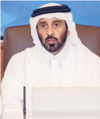
Qatar Athletics Federation president Mohammed al-Fadala.

value our athletes and take care of them, as well as providing the perfect stage for top quality competition. By continuing to