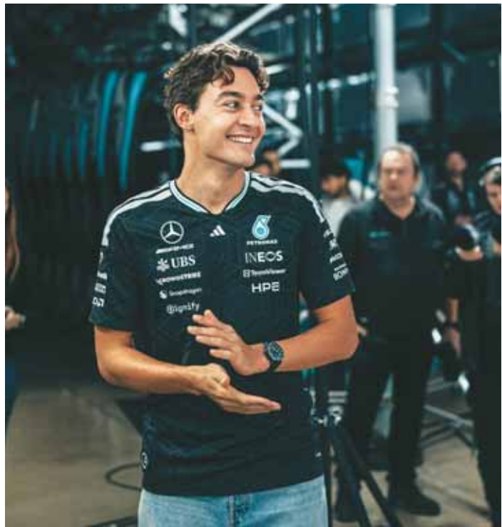
British F1 driver for Mercedes George Russell at the team’s digital launch yesterday.

There will be two three-day tests in Bahrain later this month before the season begins in Australia on March 8.