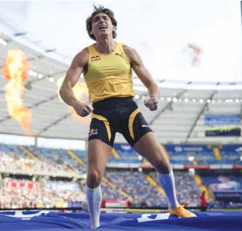
Multiple Olympic and world champion Mondo Duplantis of Sweden has confirmed he will compete in Doha.