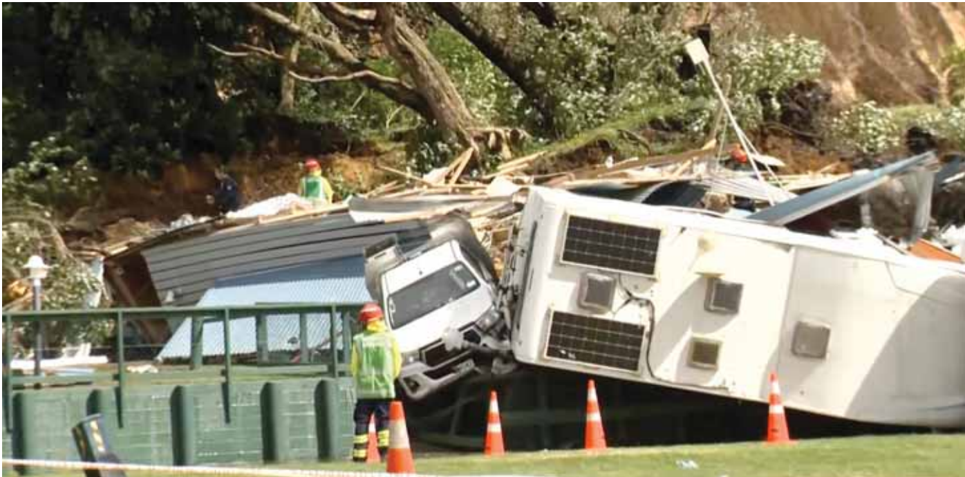
Damaged caravans and vehicles remain stuck amid rubble, in the aftermath of a landslide at a campsite triggered by heavy rains, in Mount Maunganui, New Zealand, yesterday.

Aleksandra Bielakowska, advocacy manager for Reporters Without Borders, said the verdict demonstrated a "blatant disregard for press freedom".