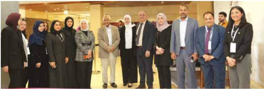
Officials of the Doha Institute for Graduate Studies at the 9th Career Fair.

Teams will compete in two vehicle categories: Urban Concept and Prototype, powered by internal combustion engines, battery electric systems, or hydrogen fuel cells, showcasing advanced engineering techniques and innovative designs. – QNA