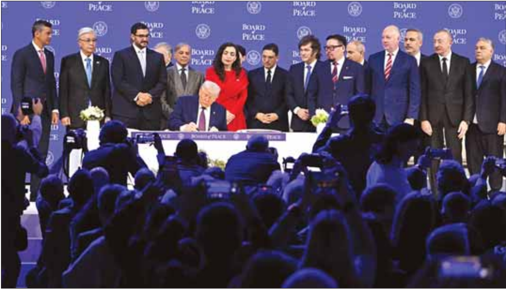
Paraguay's President Santiago Pena, Pakistan's Prime Minister Shehbaz Sharif, Kosovo's President Vjosa Osmani, Argentina's President Javier Milei, Armenia's Prime Minister Nikol Pashinyan, Bulgaria's former prime minister Rosen Zhelyazkov, Türkiye's Foreign Minister Hakan Fidan, Azerbaijan's President Ilham Aliyev and Hungary's Prime Minister Viktor Orban pose with US President Donald Trump signing a founding charter at the 'Board of Peace' meeting during the World Economic Forum annual meeting in Davos yesterday.

US President Donald Trump headed home from Davos yesterday after unveiling his new Board of Peace and once again casting himself as a global peacemaker, despite widespread scepticism over a plan that aims to rewrite the world order. Trump officials also unveiled ambitious plans for a "New Gaza" during the ceremony at the World Economic Forum, with the US leader describing the devastated Palestinian territory as "great real estate". Trump later met with Ukrainian President Volodymyr Zelensky, with both leaders describing their talks as good and the US leader saying Russia's nearly four-year-old war with Kyiv "has to end".