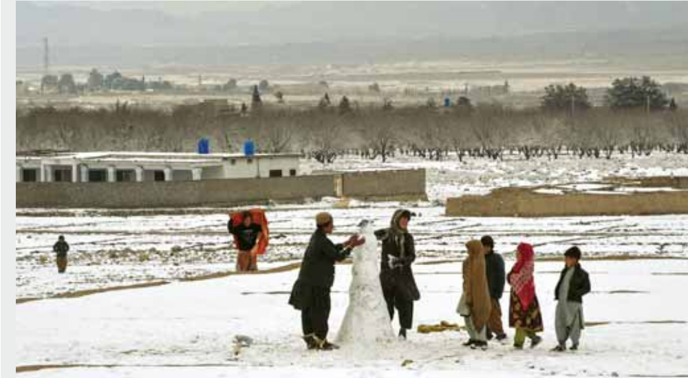
Children gather to play in a snow-covered area on the outskirts of Quetta in Pakistan yesterday. (AFP)