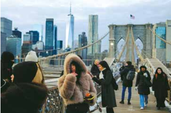
WINTER IS COMING: People brace the cold temperatures while walking on the Brooklyn Bridge in the Manhattan borough of New York City.