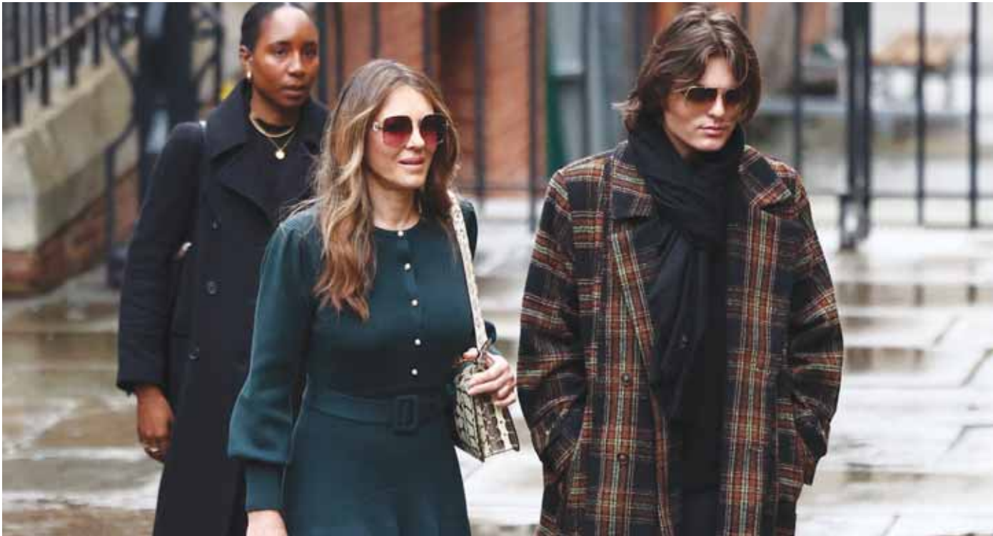
British actress Elizabeth Hurley arrives with her son Damian Hurley outside the High Court in London yesterday.

buy Iraqi Basrah and Omani crude to trader Trafigura and is in the market to buy Murban oil from the United Arab Emirates under a separate tender, said the sources, who sought anonymity. From April, Trafigura will supply four cargoes of Oman crude every quarter at 75 cents a barrel below Dubai quotes and one parcel of Basrah Medium at a discount of 40 cents a barrel to the grade’s official selling price, said two traders. BPCL and India’s oil ministry did not respond to Reuters requests for comments. The US, already seeking to narrow its trade deficit with India, doubled import tariffs on Indian goods to 50% last year to punish it for heavy purchases of Russian oil. State-run Hindustan Petroleum, Mangalore Refinery and Petrochemicals and private refiners HPCL-Mittal Energy have already stopped buying Russian oil. India’s Russian oil imports fell to their lowest in two years in December, while Opec’s share of imports hit an 11-month high, trade data showed. Apart from the Middle East, Indian refiners have also increased purchases from regions such as Africa and South America. Indian refiners have also boosted purchases of US oil to partly replace Russian oil and narrow the trade deficit with Washington, while also scouting for Venezuelan oil.