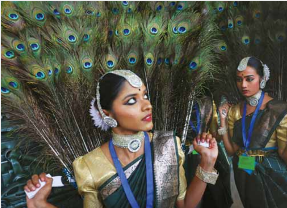
Artists rehearse during a media preview of tableaux participating in the Republic Day parade in New Delhi, India, yesterday.