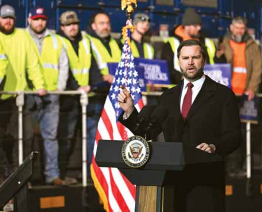
Vice-President JD Vance speaks at an industrial shipping facility in Toledo, Ohio, on the administration’s economic agenda and impacts on the Midwest.