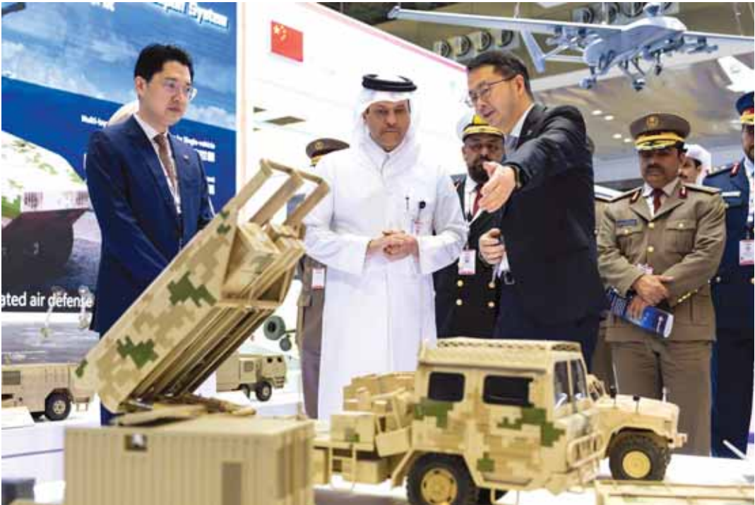
Dimdex 2026 showcased the latest innovations, technologies, and defence equipment across the maritime, land, and air domains, as well as support systems and advanced technologies.