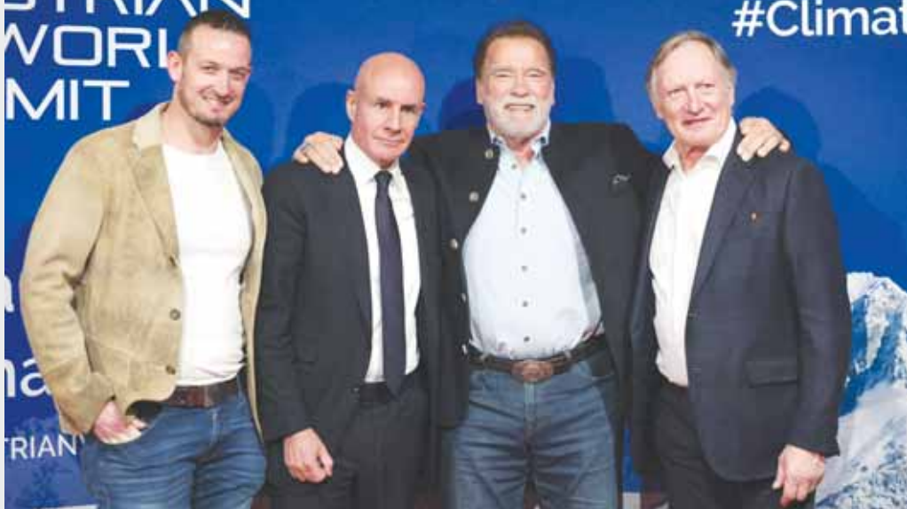
Italian ski athlete Dominik Paris, International Ski Federation head Johan Eliasch, US-Austrian actor Arnold Schwarzenegger and former Austrian ski athlete Franz Klammer pose for a photo during the charity auction 'Special Dinner for Climate Action' in Going, Austria, yesterday.