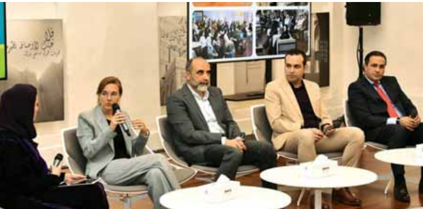
The panel shed light on stem cells and their use in medicine.

"The role of stem cells is growing in mod-