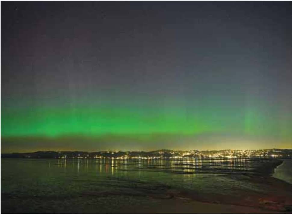
The Aurora Borealis, also known as the “northern lights”, illuminates the sky over Hamburg, Germany, yesterday.

French group Lactalis yesterday announced a recall of batches of infant formula in France and other countries including China, Australia and Mexico over worries they contained a toxin. Lactalis “is proceeding with a voluntary recall of six batches of Picot infant milk, available in pharmacies and mass retail, due to the presence of cereulide in an ingredient supplied by a supplier,” it said, referring to the toxin that can cause diarrhoea and vomiting. Lactalis published a list of six lot numbers, but stressed that all other batches were safe. “We are fully aware that this information may cause concern among parents of young children,” it said. But French authorities had not signalled to them “any claim nor any report related to the consumption of these products”. Outside France, countries concerned included Australia, Chile, China, Colombia, the Republic of Congo, Ecuador, Spain, Madagascar, Mexico, Uzbekistan, Peru, Georgia, Greece, Kuwait, the Czech Republic and Taiwan, a spokesperson said.