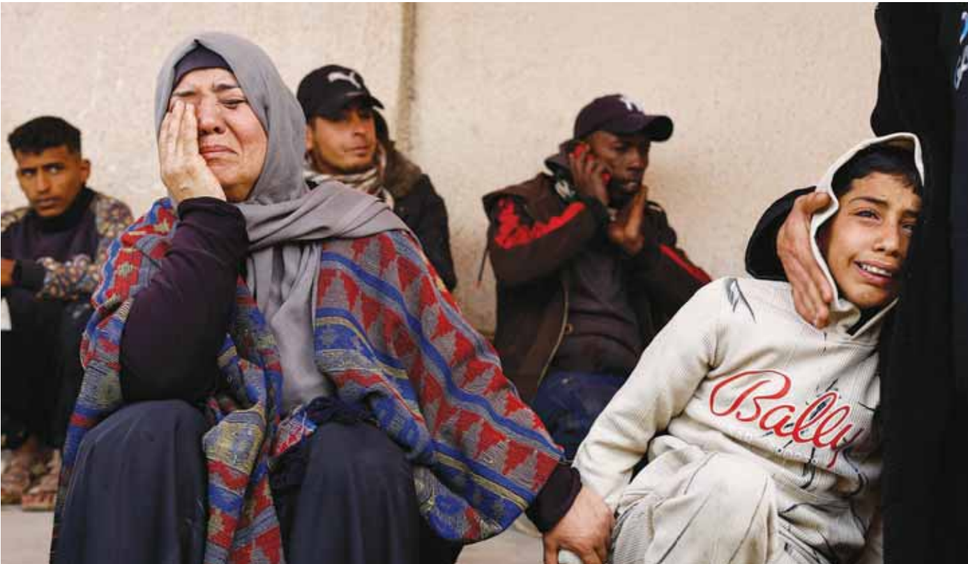
Mourners react during the funeral of Palestinians killed by Israeli strikes yesterday in Deir Al-Balah, central Gaza Strip.

"This case is about whether the Federal Reserve will set key interest rates guided by evidence and independent judgment or will succumb to political pressure," Cook, who attended the arguments, said in a statement afterward. "For as long as I serve at the Federal Reserve, I will uphold the principle of political independence in service to the American people," Cook added. Sauer told the justices that the allegations against Cook impugn her "conduct, fitness, ability or competence to serve as a governor of the Federal Reserve." "The American people should not have their interest rates determined by someone who was, at best, grossly negligent in obtaining favourable interest rates for herself," Sauer said. "Deceit or gross negligence by a financial regulator in financial transactions is cause for removal," Sauer added, arguing that the allegations require immediate removal. Cook has called the allegations against her a pretext to fire her over monetary policy differences as Trump heaps pressure on the central bank to cut interest rates and lashes out at Fed Chair Jerome Powell for not doing so more quickly. Conservative chief justice John Roberts asked Sauer to explain whether his argument that Cook should be immediately removed applies if the basis of the mortgage allegations - that she cited two different properties as a principal residence - is an "inadvertent mistake contradicted by other documents in the record."