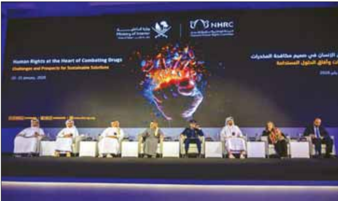
The panel of speakers.