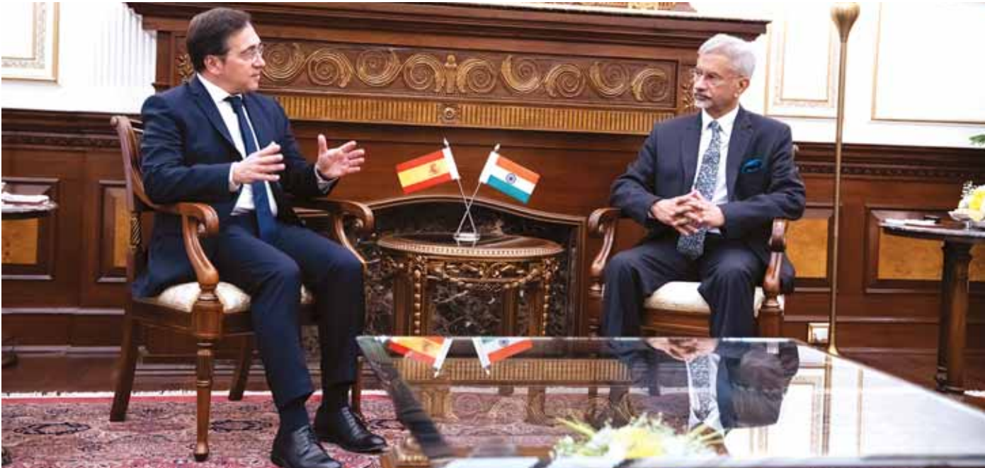
Spain’s Foreign Minister Jose Manuel Albares speaks with India’s Foreign Minister Subrahmanyam Jaishankar during a visit to New Delhi, India, yesterday.

Han is an experienced technocrat who served in senior posts under five presidents. He became acting president after Yoon was impeached, before his own impeachment on accusations of having aided Yoon in the martial law declaration.