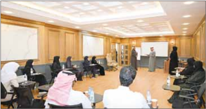
The course underscored that visual content creation is a comprehensive process, from idea to impact, requiring clear messaging, consistent production, and gradual mastery of tools.