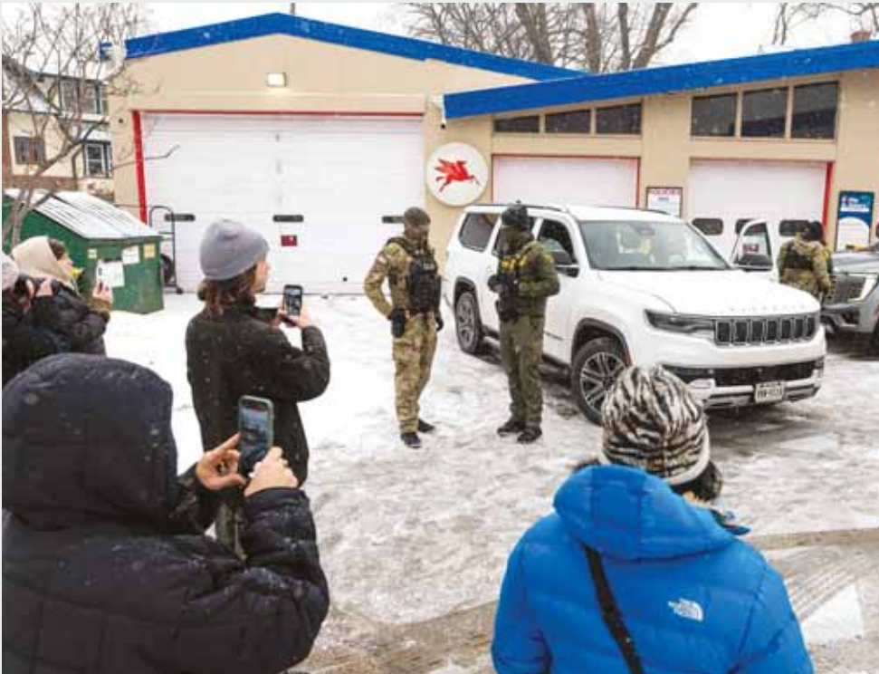
Members of the US Border Patrol are confronted by community members after stopping at a gas station in Minneapolis, Minnesota, yesterday. The Trump administration has sent a reported 3,000 plus federal agents into the area, with more on the way, as they make a push to arrest undocumented immigrants in the region.

Canadian beef will be exported to China following the relaxation of an import ban that had been in place since 2021, the agriculture minister said, though analysts cautioned it will likely be in small amounts. The reopening of what could be a vital market for Canadian beef follows the visit of Canadian Prime Minister Mark Carney, who reached an agreement with China's leadership to lower tariffs and do more business on a number of agricultural commodities, including canola. "We know that there's a large company that's shipping its first load of beef to China next week," said Canadian Agriculture Minister Heath MacDonald. Earlier on social media he said "China has lifted market access for Canadian beef." China's customs agency did not comment. The move is not expected to have an immediate major impact on Canadian beef exports or prices because North America has a shortage of domestic beef and prices are historically high. - Reuters