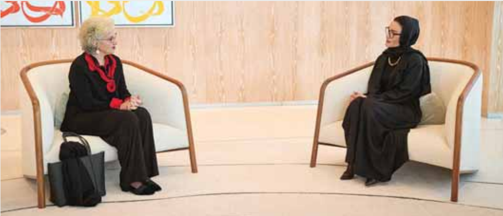
Her Highness Sheikha Moza bint Nasser, Chairperson of Qatar Foundation for Education, Science and Community Development (QF), met yesterday with Minister of Education and Higher Education of Lebanon Dr Rima Karami. They discussed ways to enhance co-operation between QF and educational institutions in Lebanon in the fields of education, technology, and curriculum development.