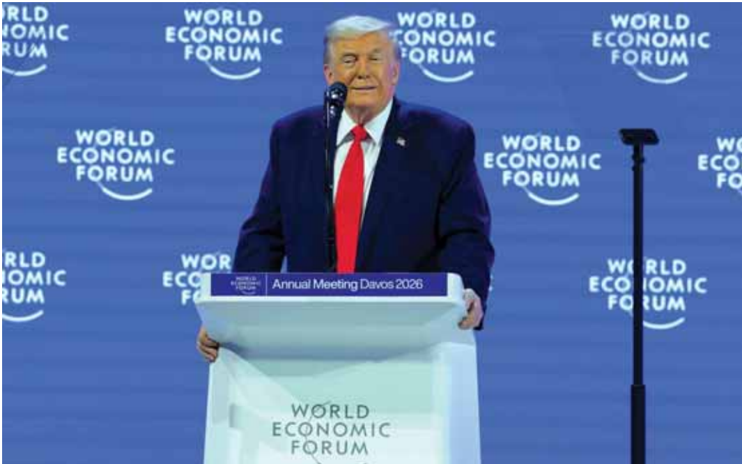
US President Donald Trump speaks at the 56th annual World Economic Forum (WEF) meeting in Davos, Switzerland, yesterday.

saying it was “not heading in the right direction”. Trump flew into Davos by helicopter, stepping onto a red carpet laid in the snow – but he flew into a growing international storm over Greenland. He arrived some two hours behind schedule, after an electrical issue earlier forced Air Force One to turn back to Washington and the president to switch planes. Europe and Canada had earlier closed ranks against what they view as a threat to the US-led global order from Trump’s territorial ambitions. Canada’s Prime Minister Mark Carney won a standing ovation at Davos on Tuesday when he warned of a “rupture” to the US-led system. French President Emmanuel Macron meanwhile said Europe would not be bullied. But Trump, who was due to meet a number of leaders in Davos, renewed his attacks on the two leaders, mocking Macron in particular for wearing sunglasses at Davos, which the French president said was because of an eye condition. Trump also repeatedly expressed doubts on Nato during his speech, saying Washington was treated “so unfairly” and questioning whether the alliance would defend the US if asked.