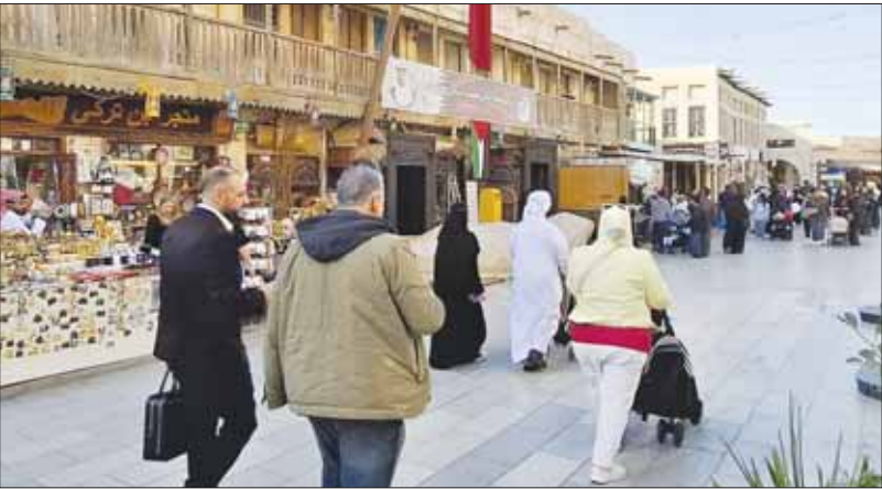
Many residents are expected to make the most of the winter climate by heading to popular outdoor destinations.

Saturday will see a slight warming trend, with temperatures rising to 21C during the day and 17C in the evening. Sunday is expected to be the warmest day of the period, with a high of 22C and a low of 15C. Temperatures are forecast to dip again on Monday, reaching 20C during the day and 13C at night, with stronger winds gusting to 31mph. On Tuesday, daytime temperatures will climb back to 22C, with a low of 14C. Humidity levels are also expected to rise, peaking at around 86% during the day, which may add to the chill in the air despite the sunshine. While the colder nights have caught some off guard, the overall weather remains pleasant by local standards. Many residents are expected to make the most of the winter climate by heading to popular outdoor destinations such as Al Bidda Park, Aspire Zone, the Doha Corniche, and traditional souqs, among other popular outdoor places such as Katara Cultural Village. These areas are likely to see increased activity, particularly in the afternoons and over the weekend, as families and fitness enthusiasts gather for picnics, recreation, and outdoor sports under clear winter skies.