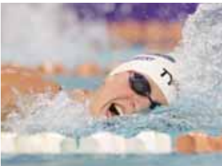
Katie Ledecky competes in the Women’s 1,500m freestyle final during the USA Swimming Pro Swim Series in Austin.

She has won both Olympic gold medals - at Tokyo in 2021