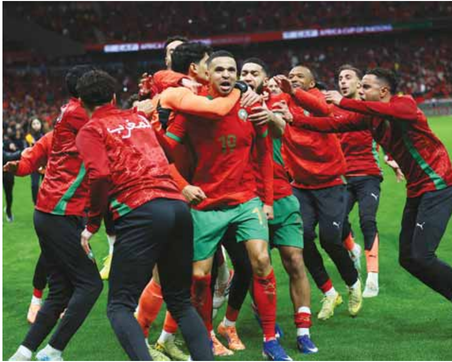
Morocco players celebrate after winning the Africa Cup of Nations semi-finals against Nigeria in the penalty shootout in Rabat, Morocco.

His team have also qualified for a third straight World Cup and the country is prepar-