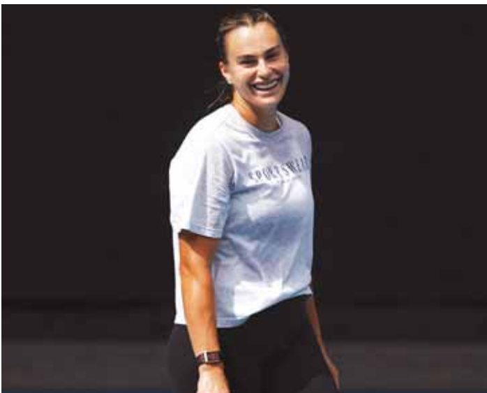
Belarus’ Aryna Sabalenka during a practice session in Melbourne yesterday.

After claiming her first Wimbledon crown last year, Swiatek will now set her sights on the missing piece of her puzzle - an Australian Open title that would complete a career Grand Slam.