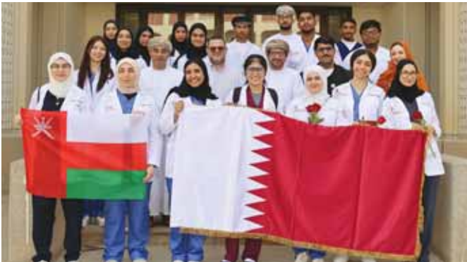
WCM-Q students during the trip.

The WCM-Q is a regional pioneer in the study of multi-omics, including metabolomics, metagenomics and proteomics, and has also developed advanced capabilities in AI and machine learning research in recent years.