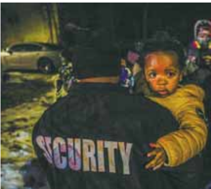
A person carries a child exposed to tear gas after law enforcement deployed tear gas and munitions against protesters in north Minneapolis.

The agents have arrested both immigrants and protesters, at times smashing