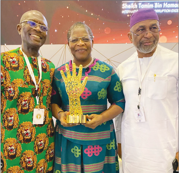
Dr Oby Ezekwesili (Centre) holding the 2025 International Anti-Corruption Excellence Award in Doha.