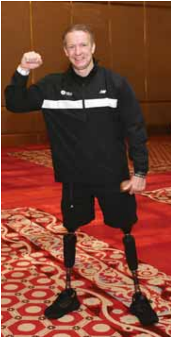
British marathon world record holder Richard Whitehead at the press conference.