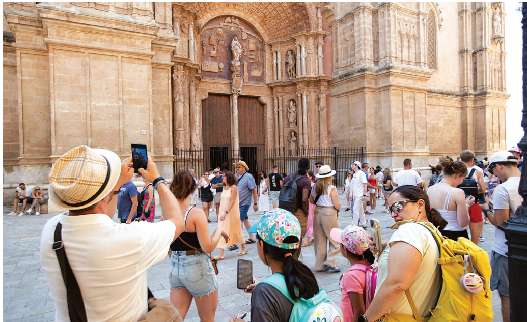
Tourists take photos with their phones as they visit the Cathedral in Palma de Mallorca on August 1, 2025. Spain received a record 97mn foreign tourists last year, up from 94mn in 2024, when the previous record was set, according to a preliminary report unveiled by Spain’s Minister of Industry and Tourism Jordi Hereu at a press conference in Madrid yesterday.

A record 97mn foreign tourists visited Spain in 2025 as the economically vital sector set a new benchmark for the second year running, the tourism minister said yesterday. The first estimation represented a 3.5% increase on the 2024 figure of 94mn, while spending climbed 6.8% to 135bn euros ($157bn), Jordi Hereu told a press conference in Madrid. “This is a collective success by the whole country that perfectly demonstrates Spain’s enormous attractiveness, because Spain is a country that seduces the world,” he said. Most visitors are European, with British, German and French holidaymakers accounting for around half of the arrivals, said Pedro Aznar, a professor at Esade business school. Like southern European neighbour Portugal, and Greece, Spain has rebounded from harsh austerity measures and heavy debt in the early 2010s, with a tourism rebound following the Covid-19 pandemic playing an important role. Tourism represents around 13% of the economy in the world’s second most-visited country after France, whose dynamic growth has outstripped EU peers. The Bank of Spain has predicted growth of 2.9% in 2025 for the European Union’s fourth-largest economy, more than double the