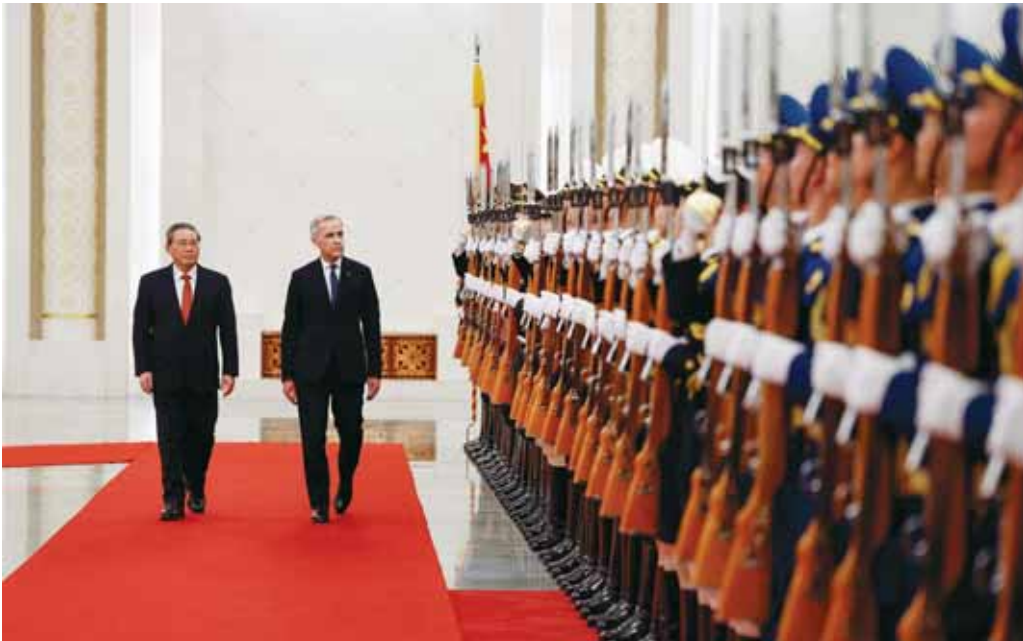
Canada's Prime Minister Mark Carney and China's Premier Li Qiang review the honour guard at an official welcoming ceremony, during the first visit by a Canadian prime minister to China since 2017, at the Great Hall of the People in Beijing, China, yesterday.

Fortinet has three offices in mainland China and one in Hong Kong, according to its website. Check Point's website lists support addresses in Shanghai and Hong Kong. Broadcom lists six China locations, while Palo Alto lists five local offices in China, including one in Macau.