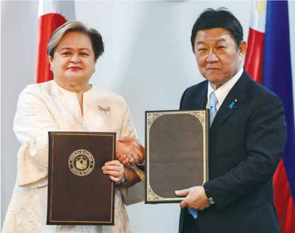
Philippine Foreign Minister Ma. Theresa P Lazaro and Japanese Foreign Minister Toshimitsu Motegi shake hands while holding signed bilateral agreements ahead of their joint press conference in Pasay City, Metro Manila, Philippines, yesterday.

Social media companies have collectively deactivated nearly 5mn accounts belonging to Australian teenagers just a month after a world-first ban on under-16s took effect, the country's internet regulator said, a sign the measure has had a swift and sweeping impact. The eSafety Commissioner said platforms had so far removed about 4.7mn accounts held by under-16s to comply with a law that went live on December 10. Some platforms had said they would start closing affected accounts in the weeks before the deadline. The figures represent the first government data on compliance and suggest platforms are taking significant steps to adhere to a law that could see them fined up to A$49.5mn ($33mn) for non-compliance, but does not hold children or their parents liable. The tally is far higher than estimates circulated before the law and equates to more than two accounts for every Australian aged 10-16, based on population data.