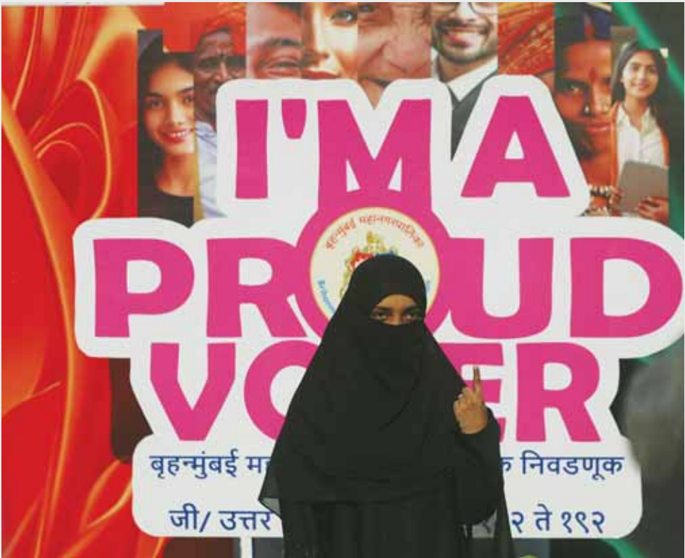
A woman poses next to a poster with her ink-marked finger after voting at a polling centre during the Brihanmumbai Municipal Corporation (BMC) elections in Mumbai, India, yesterday.