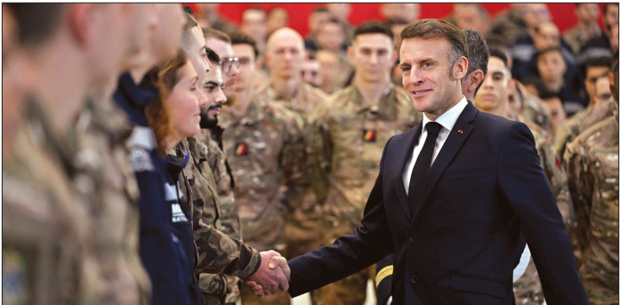
French President Emmanuel Macron shakes hands with soldiers after delivering his New Year’s address to the armed forces at the Istres military air force base, southern France, yesterday.

He said a coalition of some 35 countries was now providing all of the support, including financial, to Kyiv after Washington had decided to no longer fund or directly give weapons to Ukraine. “Where Ukraine was extremely dependent on American intelligence capacity, huge majority (of it) a year ago, in (the space of) a year, two-thirds is today provided by France,” Macron said. The comments are in contrast to Kyrylo Budanov, who was appointed head of Zelensky’s office and is the former chief of Ukraine’s military intelligence, who said in December that Kyiv was critically dependent on Washington for intelligence ranging from satellite imagery to early warning systems after ballistic missile launches. Ukraine’s GUR military intelligence agency declined to comment. A French defence ministry official declined to comment specifically on the president’s assertions, but said much of the intelligence was of technical origin.