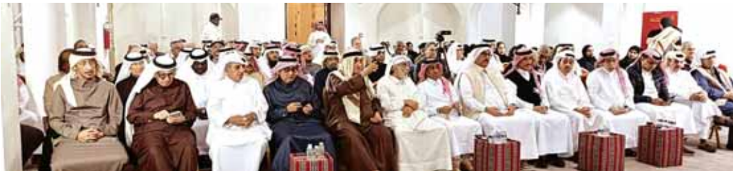
Part of the audience at the symposium.

This event, held in partnership with Al Qafila Club, affiliated with the Gulf and Arabian Peninsula Studies Unit in Bahrain, explored the challenges and transformations of the intellectual's role in light of contemporary changes.