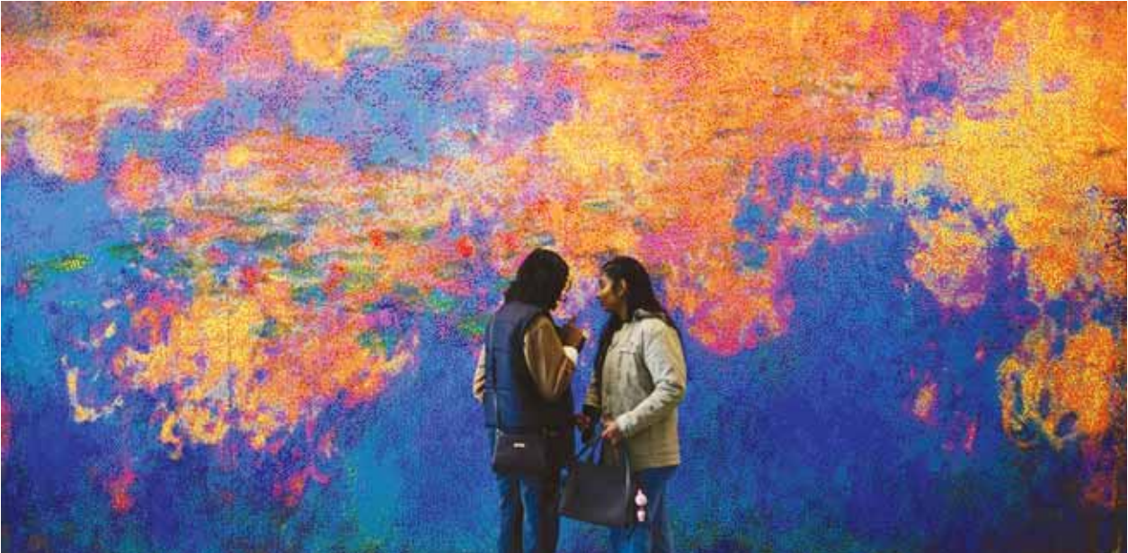
Visitors look at an artwork titled "Water Lilies" by Chinese artist Ai Weiwei displayed during his first solo exhibition in India, at the Nature Morte gallery in New Delhi yesterday.

respond to a request for comment. Farage said he had previously spoken with Jenrick and had "little doubt" that he was considering defecting to Reform, although an agreement was not imminent. Were that to occur, Jenrick would join a string of senior Conservative Party figures to switch allegiance to join the right-wing Reform, which holds a solid lead in the polls. "I'm very surprised that this news has broken," Farage told reporters in Scotland. "Was I on the verge of signing a document with him? No. But have we had conversations? Yes." Jenrick, who held various ministerial roles in the previous Conservative government, has undergone a transformation from being a staunch party centrist to moving towards the right with his strong criticism of immigration policies. At least a dozen prominent Conservatives have joined Reform, although Jenrick would be only the second sitting lawmaker to have switched to Farage's party. Current opinion polling puts Reform ahead of both Prime Minister Keir Starmer's Labour Party and Badenoch's Conservatives. That points to a possible 2029 Reform election win which would make Farage prime minister - a potentially seismic shift in a political system dominated by Labour and the Conservatives for more than a century.