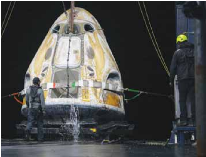
Support teams onboard the SpaceX recovery ship SHANNON work around the SpaceX Dragon Endeavour spacecraft shortly after it landed, in the Pacific Ocean off the coast of California.

Mexico’s foreign ministry did not immediately respond to a Reuters request for comment outside regular business hours.