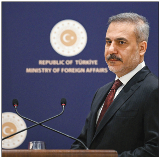
Turkish Minister of Foreign Affairs Hakan Fidan looks on as he addresses the audience during a press briefing meeting in Istanbul yesterday.

Nato member Turkiye is holding talks with Pakistan and Saudi Arabia to join a defence alliance established in September between the two countries, Foreign Minister Hakan Fidan said yesterday. “At present, there are discussions and talks underway, but no agreement has yet been signed,” Fidan told reporters. Turkish President Recep Tayyip Erdogan’s “vision is broader, more comprehensive, and aimed at establishing a larger platform”, he added. The defence agreement be-