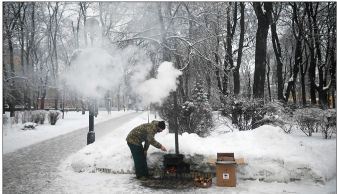
A lady cooks boursak, a traditional Central Asian bread, on a potbelly stove at a heating point in a park in Kyiv yesterday.

After running her stiff fingers along the keys, Ukrainian piano teacher Yevgenia retreated to her fort of mattresses and sheets to shelter from the cold reigning in her Kyiv flat. Ukraine’s President Volodymyr Zelensky said the country would declare a “state of emergency” in its energy sector, battered by massive Russian strikes and buckling as temperatures dip as low as -20C. A Russian barrage of drones and missiles last week left half of the Ukrainian capital without heating, prompting mayor Vitali Klitschko to call on residents to temporarily leave the city if able to do so. Six days later, some 300 apartment buildings still lack heating and the capital is facing prolonged emergency rolling blackouts, imposed by the authorities to ration precious supplies. In Yevgenia’s flat, the temperature was hovering at a chilly 12C. The heating in her building connected to city’s electric grid gets cut off with every blackout, as backup batteries do not have the capacity to take over. “We’ve been without power for 12 hours,” she told AFP. “And that’s not even the worst scenario.” Every hour without power, the temperature in her living room dropped further. “With each passing day, we’re getting closer to zero.” ‘To break people’ Equipped with her flashlight