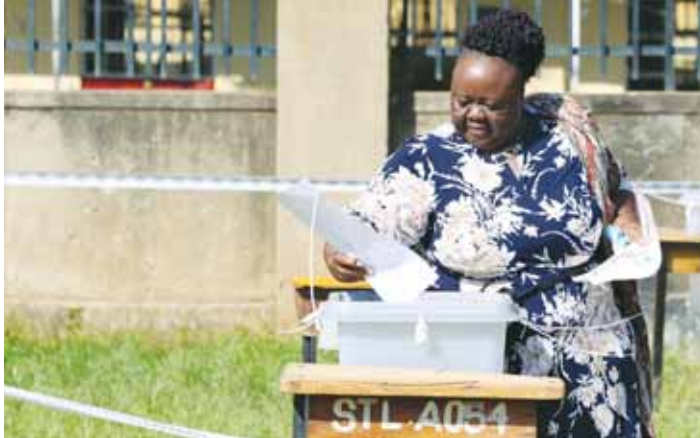
A woman casts her vote at a polling centre in Kampala.

“I put my right... thumbprint. The machine did not accept it. I put my left, it did not accept it,” he told journalists, adding that the machine finally accepted a scan of