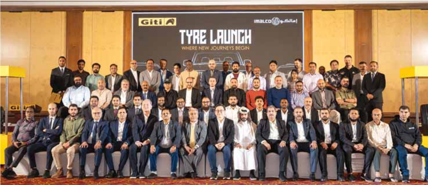
The Giti Tires launch was attended by management and executives from Giti Tires and Imalco's leadership team, as well as trade customers.

He also noted Giti's strong global presence as one of the world's top 10 tyre manufacturers, with annual production exceeding 100mn tyres, and reaffirmed Imalco's commitment to delivering safe, reliable, and performance-driven mobility solutions to the Qatar market.