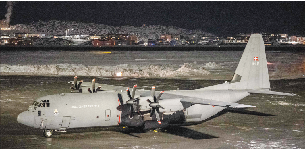
A Royal Danish Air Force Lockheed C-130J Super Hercules is parked on the tarmac at Nuuk international airport yesterday.

in the Gulf region, raises many questions, particularly about its possible nuclear component, given Islamabad possesses nuclear weapons. The Pakistan-Saudi pact was signed just months after Pakistan and India fought an intense four-day conflict in May that killed more than 70 people on both sides in missile, drone and artillery fire, the worst clashes between the nuclear-armed neighbours since 1999. Pakistan and India, also a nuclear power, have long accused each other of backing militant forces to destabilise one another. Saudi Arabia is believed to have played a key role in defusing the conflict.