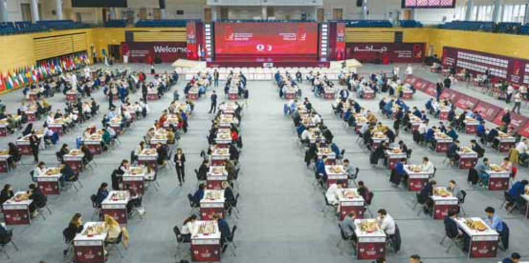
A general view of chess players in the tenth round of the FIDE World Rapid & Blitz Championships at the Sports and Events Complex, Qatar University, in Doha yesterday.