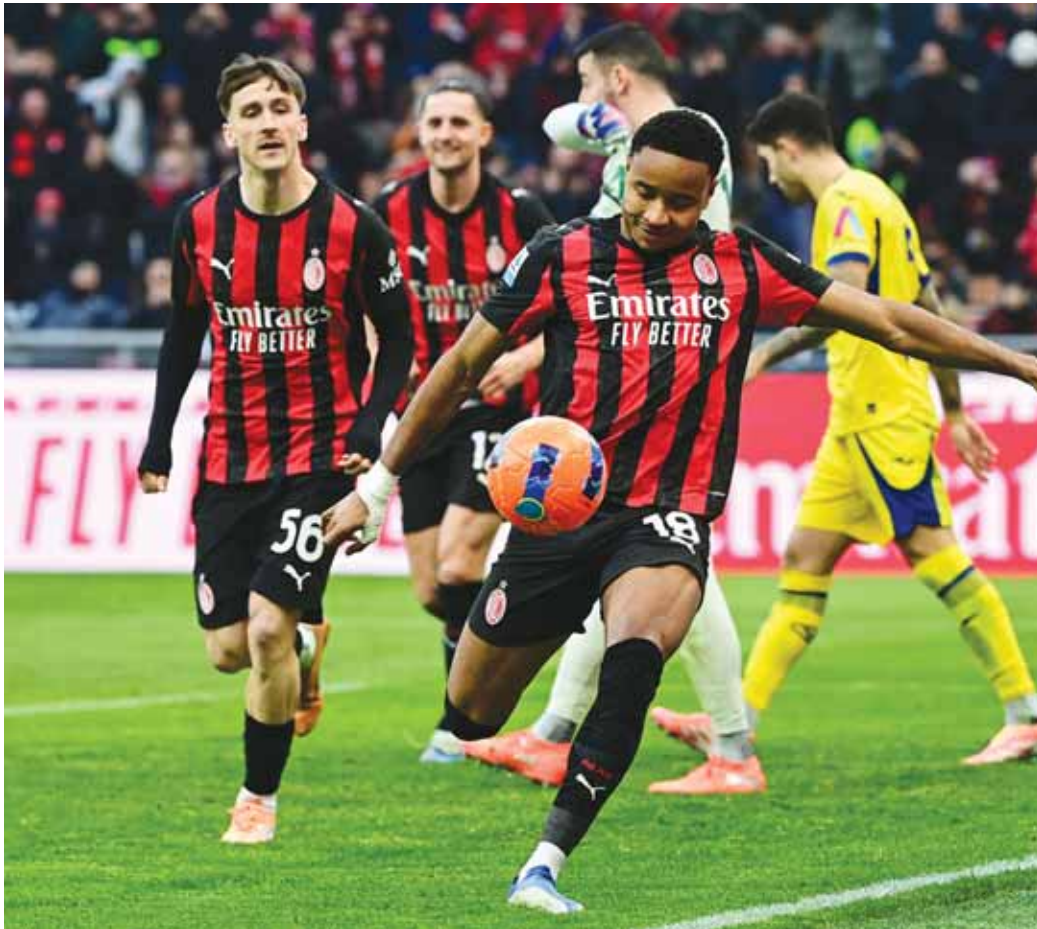
AC Milan's Christopher Nkunku (centre) celebrates after scoring his team's second goal during the Serie A match against Hellas Verona in Milan yesterday.

sistance when he prodded home Adrien Rabiot's flick-on at a corner in the first minute of stoppage time at the end of the first half.