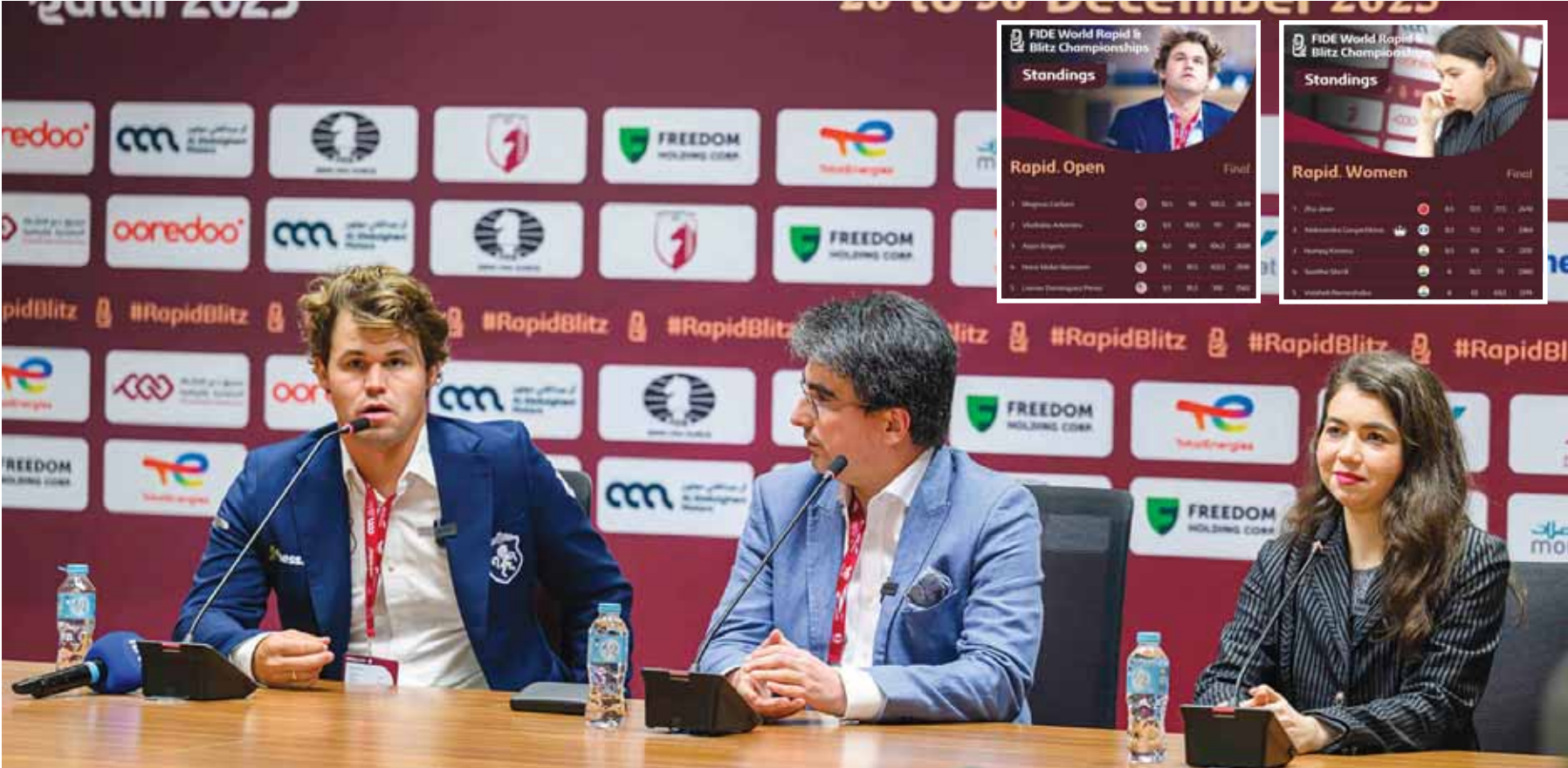
Norway's Magnus Carlsen and Russia's Aleksandra Goryachkina attend the official press conference after emerging men's and women's title winners at the 2025 World Rapid & Blitz Championships in Doha yesterday.