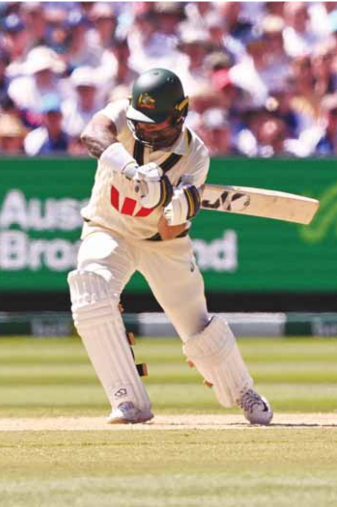
Australian batsman Jake Weatherald is bowled by England’s Ben Stokes on the second day of the fourth Ashes Test at the MCG in Melbourne on Saturday.

Head was promoted to opener in the second innings at Perth when Usman Khawaja was sidelined with back spasms and has