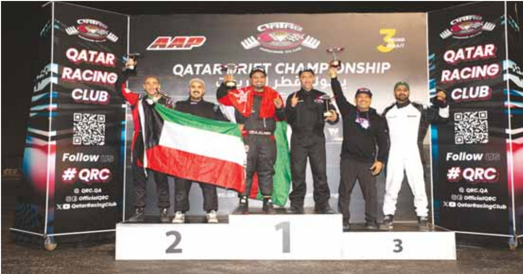
Qatar Drift Championship's third round winners celebrate on the podium.

The action began with the first round, which featured eight races.