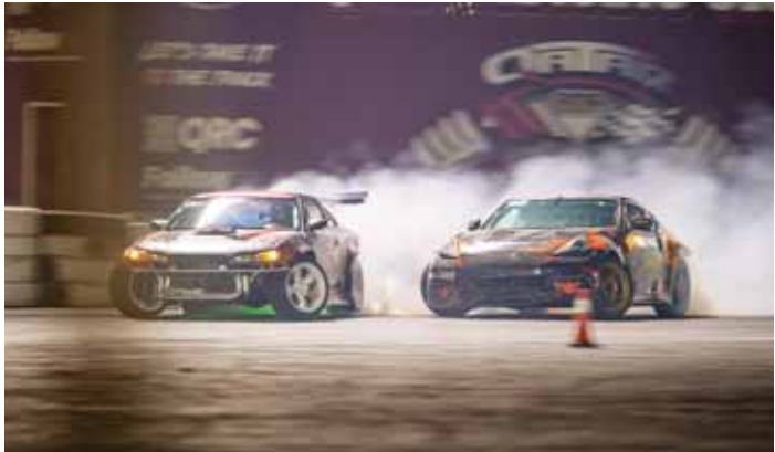
Action from the third round of Qatar Drift Championship.