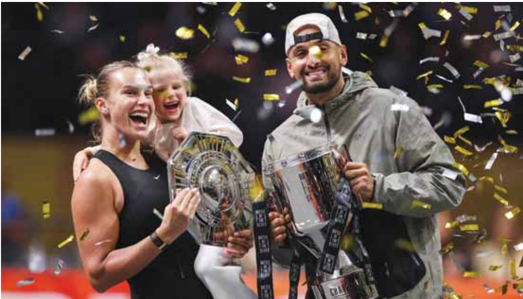
Belarus' Aryna Sabalenka (left) and Australia's Nick Kyrgios celebrate with trophies at the end of the exhibition match in Dubai yesterday.

Playing in front of a sold-out crowd at Dubai's Coca-Cola Arena, Kyrgios negotiated the slightly smaller "equaliser" court on women's world number one Sabalenka's side to secure victory after an entertaining contest played under modified rules.