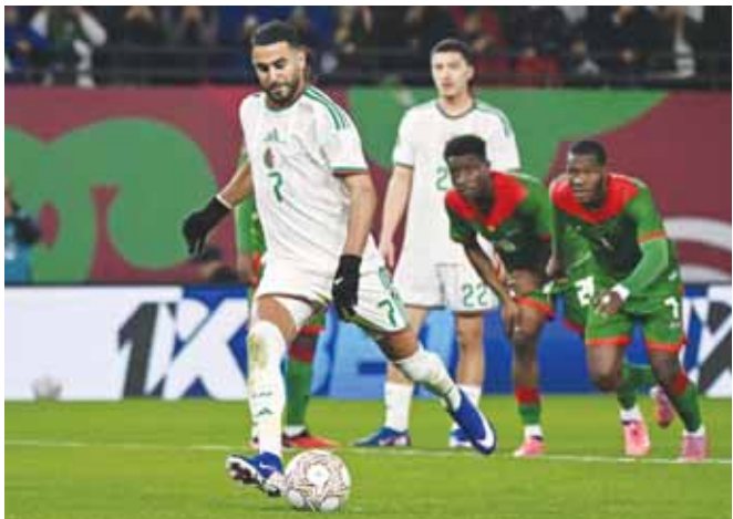
Algeria's Riyad Mahrez scores his team's first goal from the penalty spot during the Africa Cup of Nations match against Burkina Faso at Moulay Hassan Stadium in Rabat yesterday.