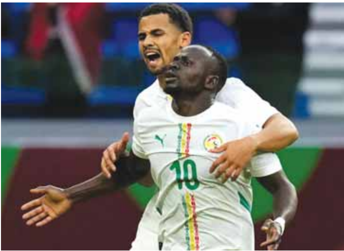
Senegal’s Sadio Mane celebrates after scoring a goal during the Africa Cup of Nations Group D match against DR Congo in Tangiers, Morocco.

Senegal, fresh from beating Botswana 3-0 and seen as perhaps the biggest threat to Morocco’s chances of winning the title on home soil, had more of the possession and more chances on the day. However, the Leopards took the lead in the 61st minute when Theo Bongonda – scorer of the only goal in their opening win against Benin – had a shot at the end of a fine move parried by goal-