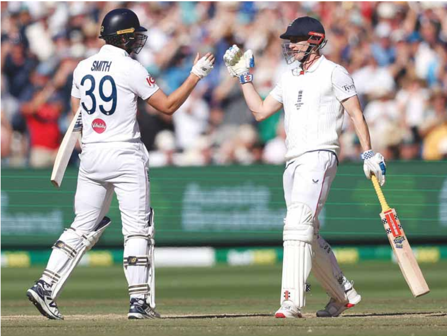
England's Harry Brook (right) and Jamie Smith celebrate after hitting the winning runs during the second day of the fourth Ashes Test at the MCG in Melbourne yesterday.

Mitchell Starc in his first over while Crawley slammed Michael Neser for a six and a four in successive balls. They brought up a whirlwind fifty opening partnership but next ball Duckett was bowled by a Starc yorker for 34. Fast bowler Brydon Carse then strode to the middle as