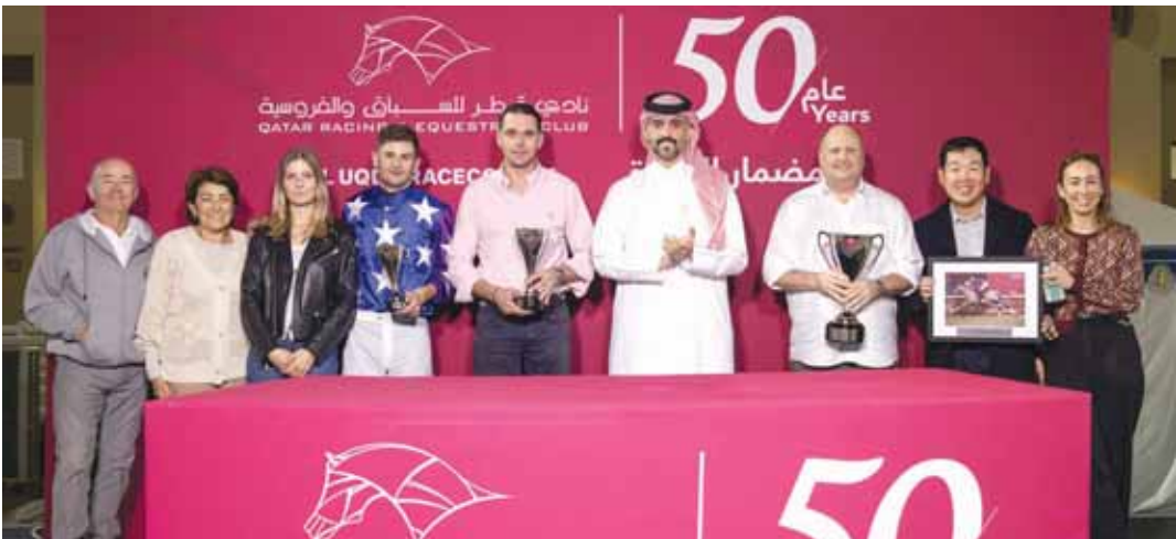
Connections of Mubkhar Al Shahania celebrate after the grey colt won the Ras Mlajji Cup at the Al Uqda Racecourse yesterday.