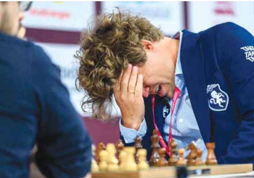
Magnus Carlsen of Norway reacts during his match against Maxime Vachier-Lagrave of France at FIDE World Rapid Championship at the Sports and Events Complex at Qatar University in Doha yesterday.