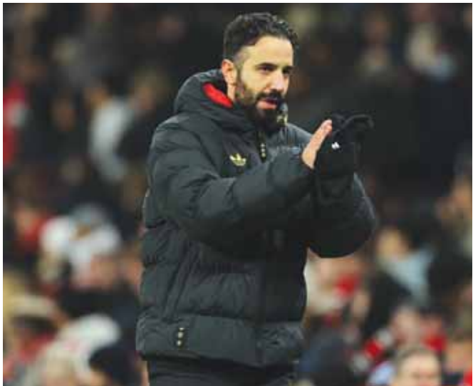
Manchester United manager Ruben Amorim celebrates after the Premier League match against Newcastle United at the Old Trafford in Manchester on Friday.

The one negative on the night was the loss of Mason Mount after the first half due to injury. “He felt something at halftime,” Amorim said.