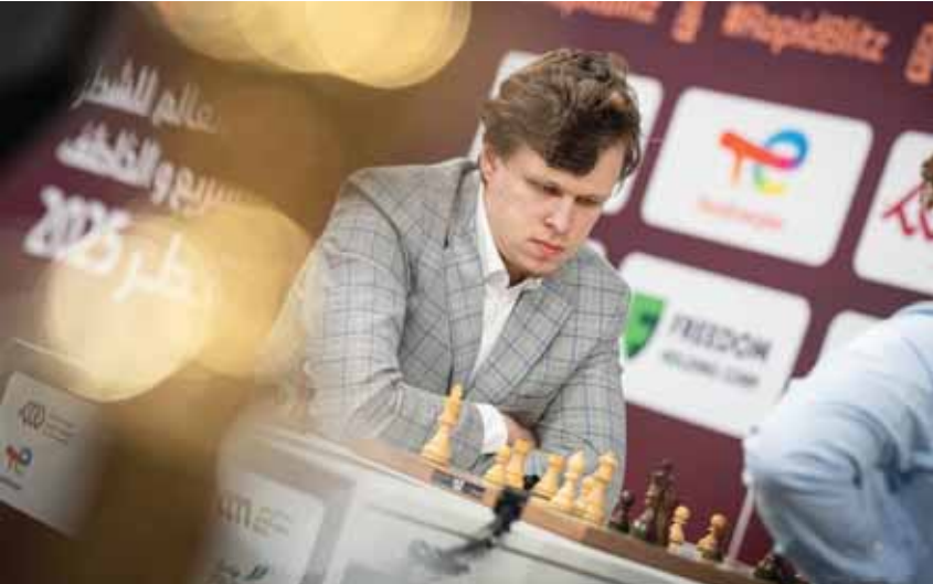
Russian Grandmaster Vladislav Artemiev had a remarkable day, opening with a victory over Arjun Erigaisi before inflicting Magnus Carlsen's sole defeat in nine rounds.

India's young star Gukesh, initially modest about his prospects, has impressed with his resilience so far in the tournament, staying just one point behind the leaders along with Arjun Erigaisi (6.5 points) and 12 others, even as his compatriots R Praggnanandhaa and Nihal Sarin (both on six points) dropped to joint 20th.