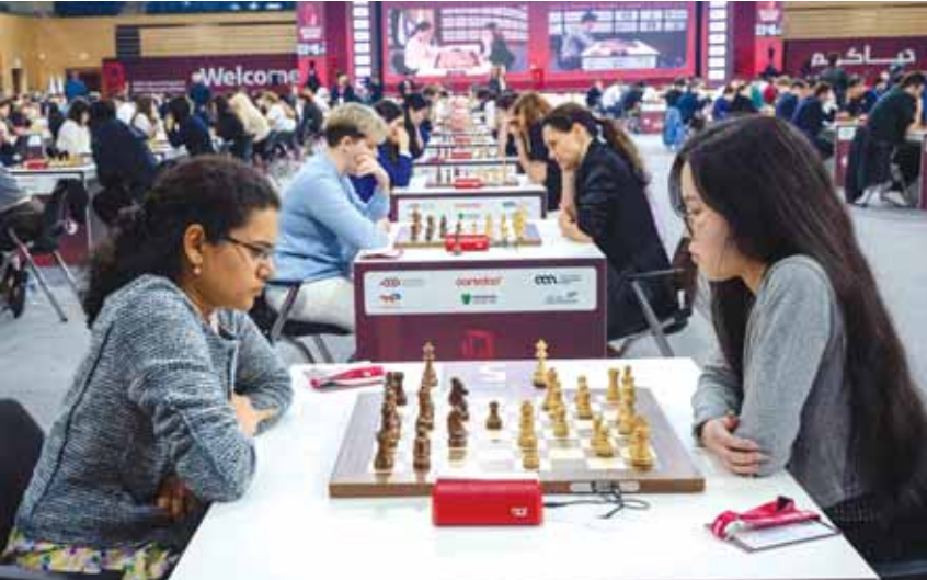
Reigning Women's World Rapid Champion Koneru Humpy (left) of India put on a strong show yesterday as she finished the day as co-leader with China's Zhu Jiner.

After winning a comfortable White game in round 7 against Sarasadat Khademalsharieh, Humpy almost repeated her success against Goryachkina as she was lost at some point, but found a way to keep the game going and eventually end up in a winning position. Unfortunately for Humpy, she missed multiple chances to convert and had to settle for a draw.