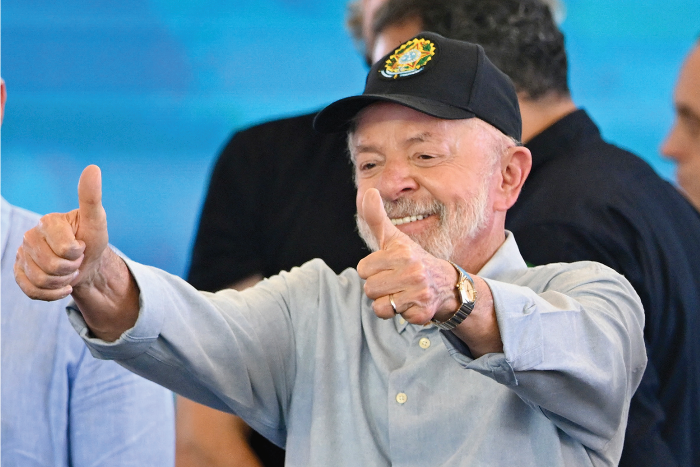
Brazil’s President Luiz Inacio Lula da Silva: ambitious plans.