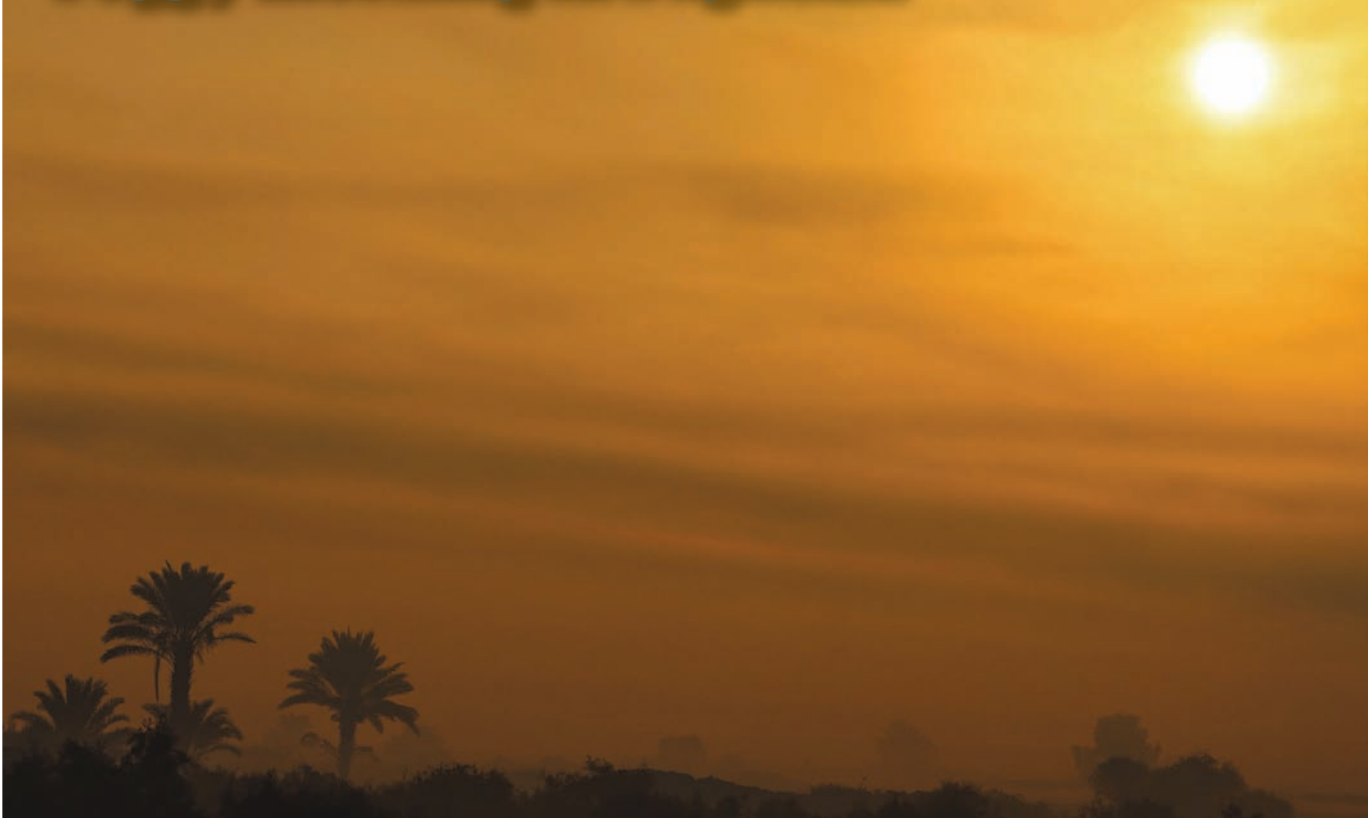
Palm trees are silhouetted through the fog as the sunrises just outside the city of Hilla, south of the capital Baghdad, Iraq, yesterday.