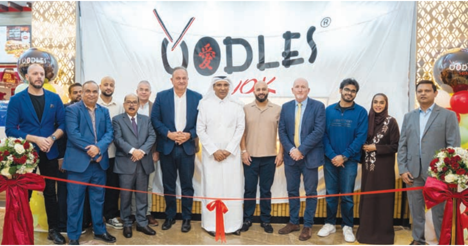
Ooodles Wok opened at the City Center Doha in Qatar on December 7.