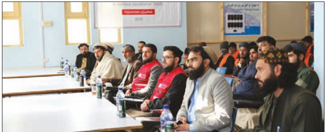
Afghan communities benefit from QRCS' humanitarian and development projects.