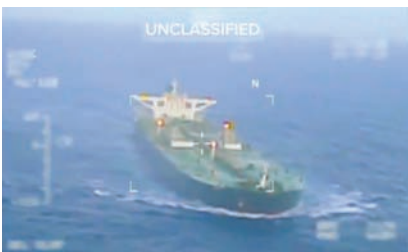
This screen grab taken from a video posted on the X account of US Secretary of Homeland Security Kristi Noem shows the Centuries crude oil tanker as it is apprehended by the US Coast Guard on Saturday.

Another official said the tanker was under sanctions, but added that it had not been boarded so far and that interceptions can take different forms – including sailing or flying close to vessels of concern.