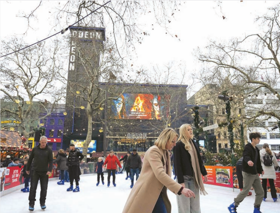
People skate on an ice rink in Leicester Square in central London yesterday. Retail sales in Britain dipped unexpectedly in November as shoppers remained cautious in the run-up to Christmas, according to official figures.