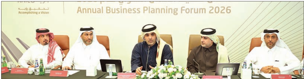
HE the Minister of Transport Sheikh Mohammed bin Abdullah bin Mohammed al-Thani speaks in the presence of HE the Minister of Environment and Climate Change Dr Abdullah bin Abdulaziz bin Turki al-Subaie, as well as Qatar Rail senior and executive management, during his visit to the company's headquarters.