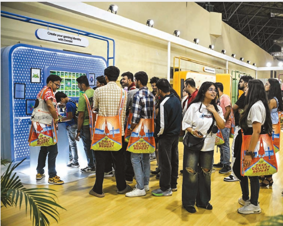
Visitors queue to create gaming identity using a model of Google’s AI assistant Gemini installed at the Bengaluru Comic Con 2025 fest in Bengaluru, India, yesterday.