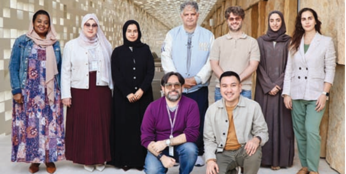
The researchers along with the ambassadors of the project.

"The action-research approach of the project allows for a broader engagement and collaborations with stakeholders and institutions to close the gaps between the various efforts in the country to address digital citizenship education," he noted.