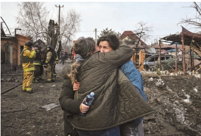
This picture taken last week shows residents at the site of a Russian air strike, in Zaporizhzhia, Ukraine.

Washington last month stunned Ukraine and its European allies by presenting a 28-point plan to end the war widely seen as caving in to the Kremlin’s key demands, which has since been redrafted following