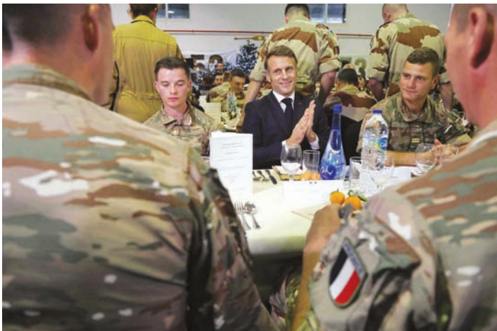
Macron claps during a dinner with the troops of the 5th Cuirassier Regiment’s base in Zayed Military City, near Abu Dhabi.

ies into replacing the Charles de Gaulle in 2018, with preliminary work beginning two years later.