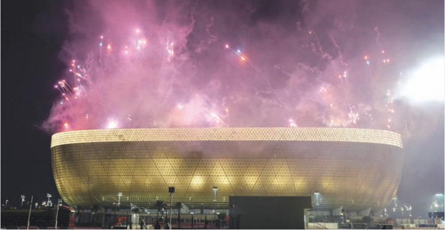
Fireworks illuminated the sky above Lusail Stadium last night as celebrations followed the Arab Cup finals 2025, turning it into a centrepiece of national pride on Qatar National Day.