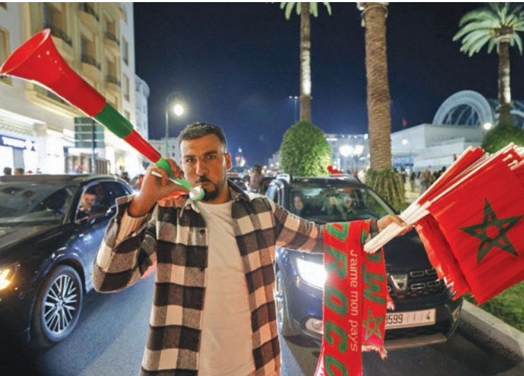
A man blows on a vuvuzela as he sells national flags in Rabat during celebrations following their team's victory in the FIFA Arab Cup 2025 final at Lusail Stadium in Doha.