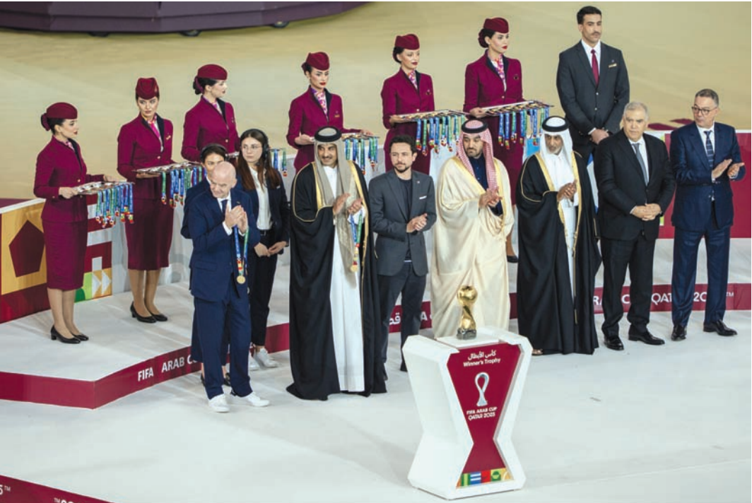
His Highness the Amir Sheikh Tamim bin Hamad al-Thani at the closing ceremony of the FIFA Arab Cup Qatar 2025 at Lusail Stadium last night. His Highness the Amir handed over the championship trophy to the Moroccan team, who secured the title after a 3-2 victory over Jordan.