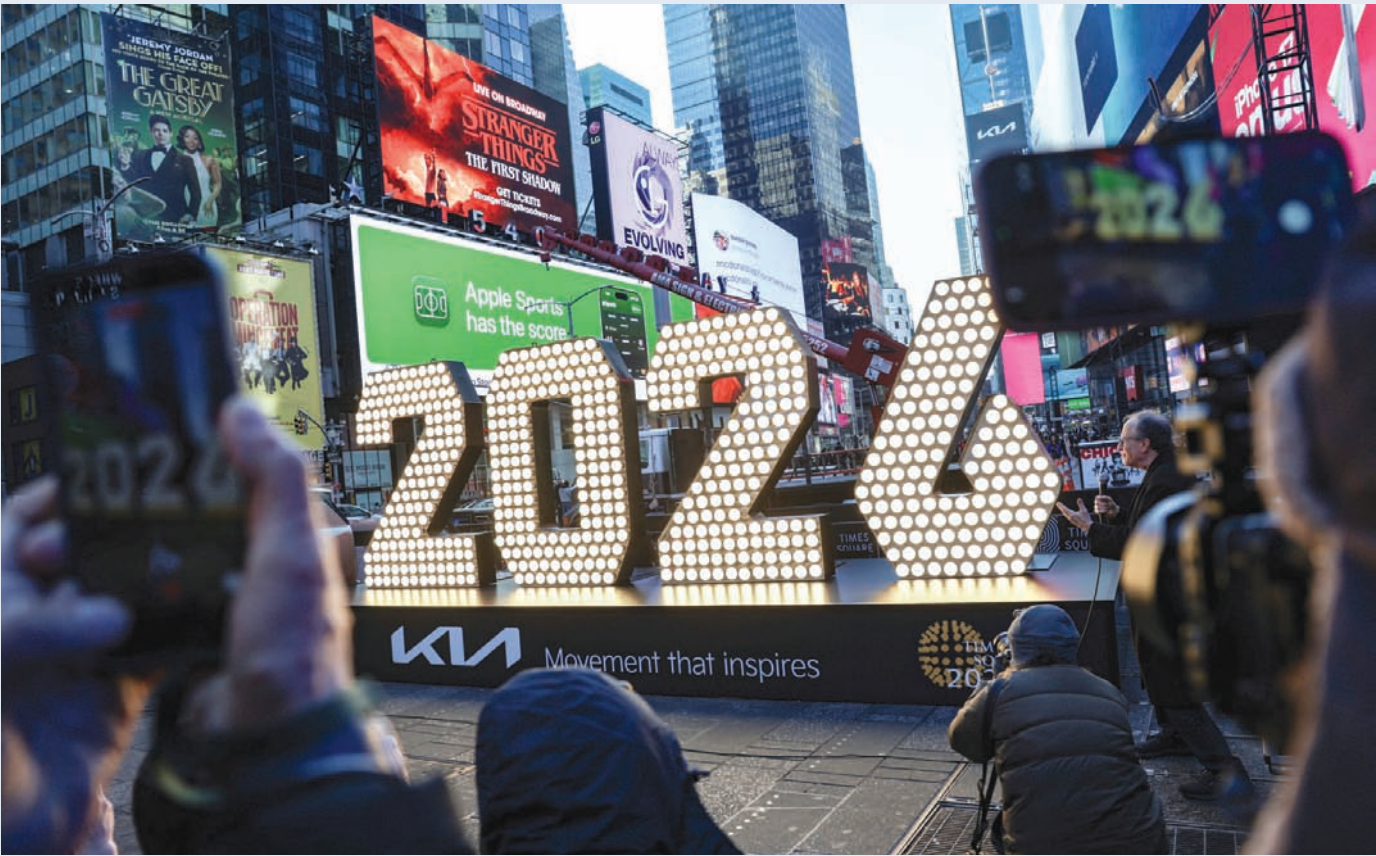
The numerals ‘2026’ arrive for the Times Square New Year’s Eve celebrations in New York City yesterday.