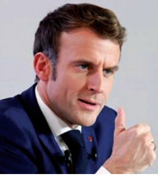
By Emmanuel Macron Paris

It has been ten years since the United Nations Climate Change Conference in Paris (COP21), where 195 states made a historic commitment to work together to keep the long-term rise in global temperatures well below 2°C above pre-industrial levels, and to pursue efforts to limit the temperature increase to no more than 1.5°C. France played its full part in making this great moment of co-operation and universal solidarity a success. A decade later, we can be proud of how far we have come.