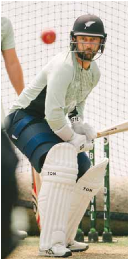
Devon Conway of New Zealand bats during a team training session in Christchurch yesterday.