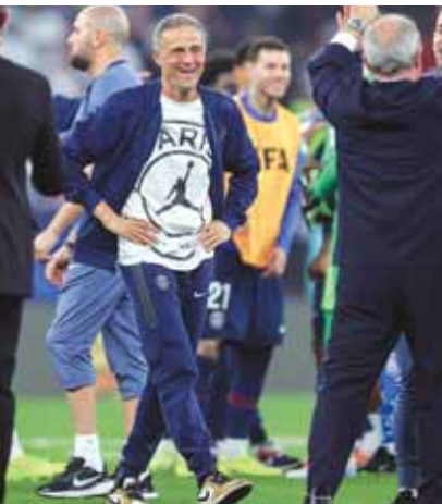
Paris Saint-Germain's coach Luis Enrique is delighted after his side's Intercontinental Cup triumph.

When the final save was made, teammates swarmed Safonov in celebration.