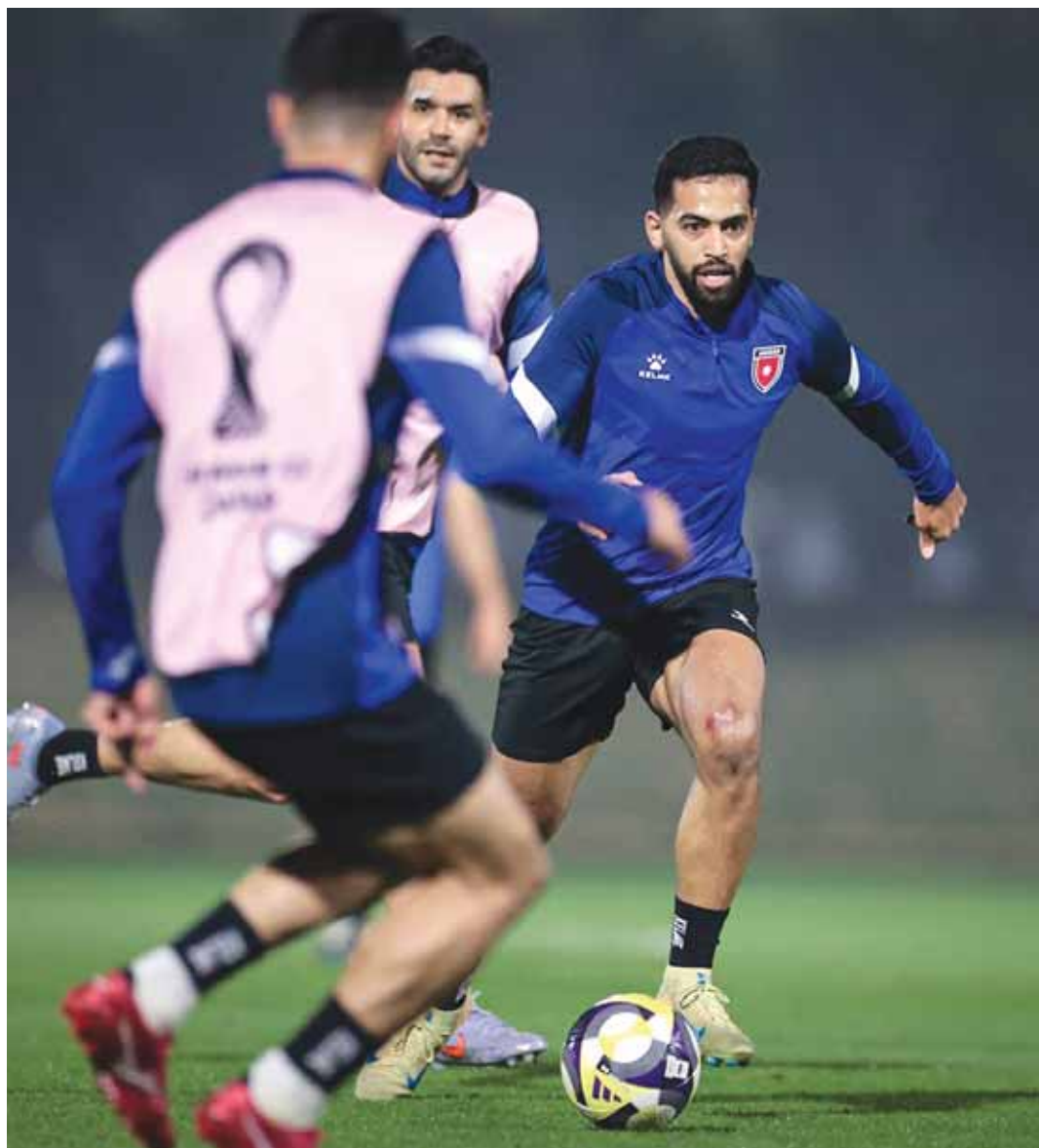
Jordan players in action during a training session yesterday, on the eve of the Arab Cup final against Morocco.