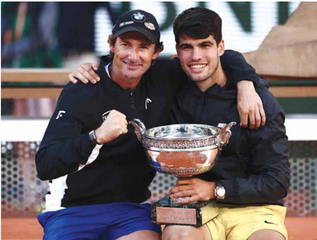
Spain's Carlos Alcaraz celebrates with coach Juan Carlos Ferrero after winning the French Open final against Germany's Alexander Zverev at Roland Garros in Paris on June 9, 2024.

“I wish I could have continued. I am convinced that good memories and good people always find a way to cross paths again,” he added.