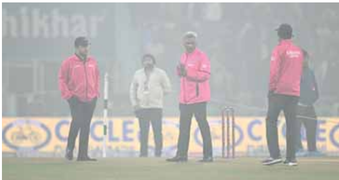
Officials inspect the pitch during the fourth Twenty20 international between India and South Africa at the Ekana Cricket Stadium in Lucknow yesterday.