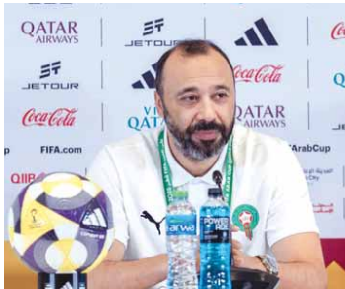
Morocco coach Tariq Sektioui addresses the media yesterday.

final, Moroccan coach Tariq Sektioui stressed the scale of the task ahead, noting that both teams fully deserve their place after consistently high-level performances