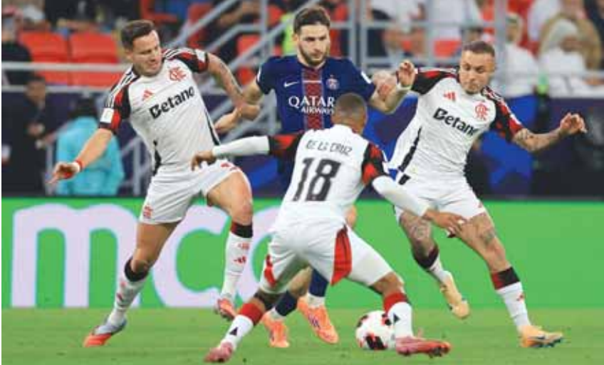
PSG's winger Khvicha Kvaratskhelia attempts to get past Flamengo defenders.