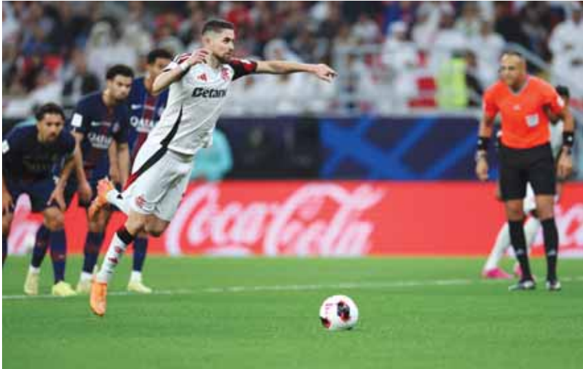
Flamengo's Jorginho scores a penalty to equalise in the 62nd minute.

utes of regulation time remaining as PSG searched for a winner. The clearest chance fell to Marquinhos, but the defender sliced wide from inside the six-yard box, sending the final into extra time.