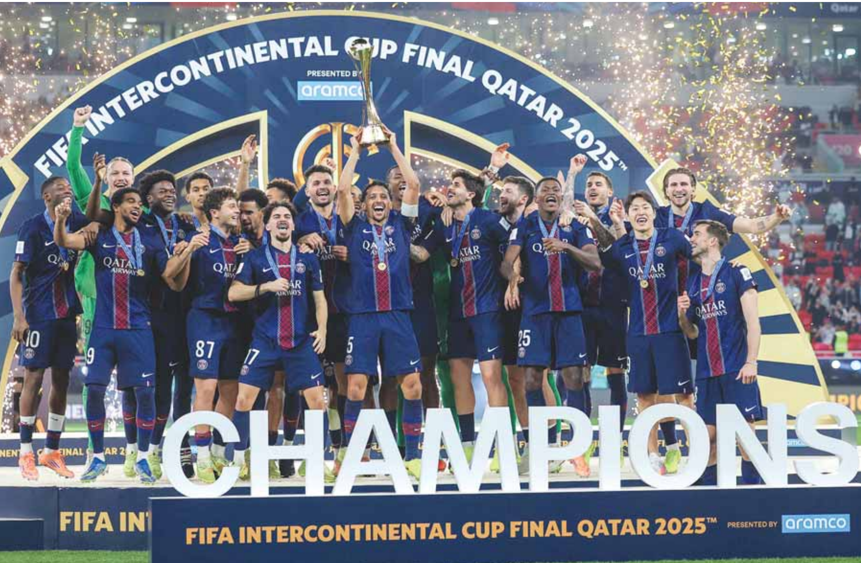
Paris Saint-Germain players celebrate after winning the FIFA Intercontinental Cup at the Ahmad Bin Ali Stadium in Al Rayyan yesterday.