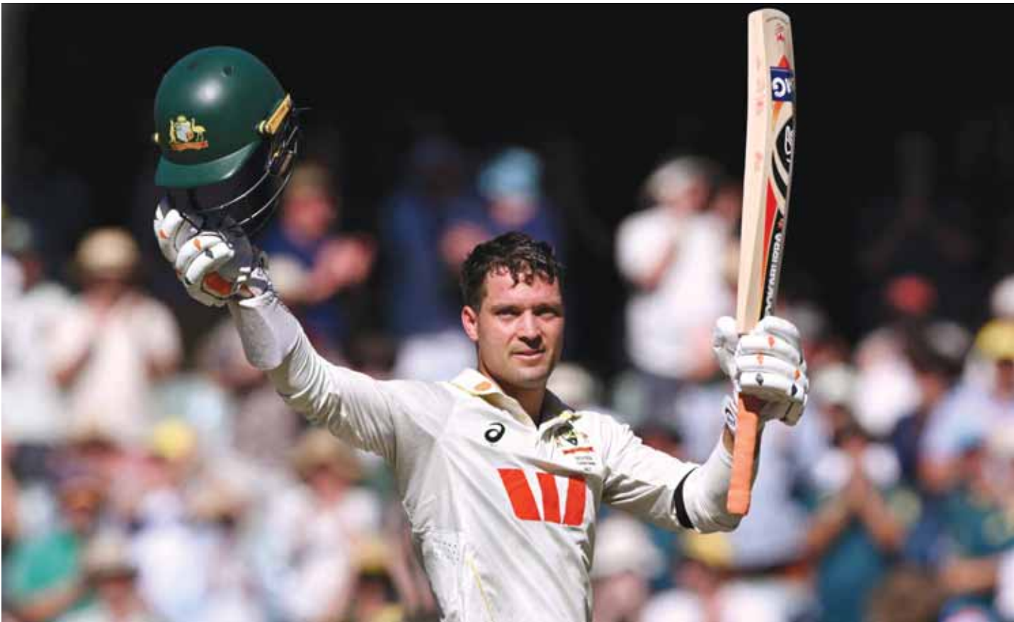
Australian batsman Alex Carey celebrates scoring a century on the first day of the third Ashes Test at the Adelaide Oval in Adelaide yesterday.