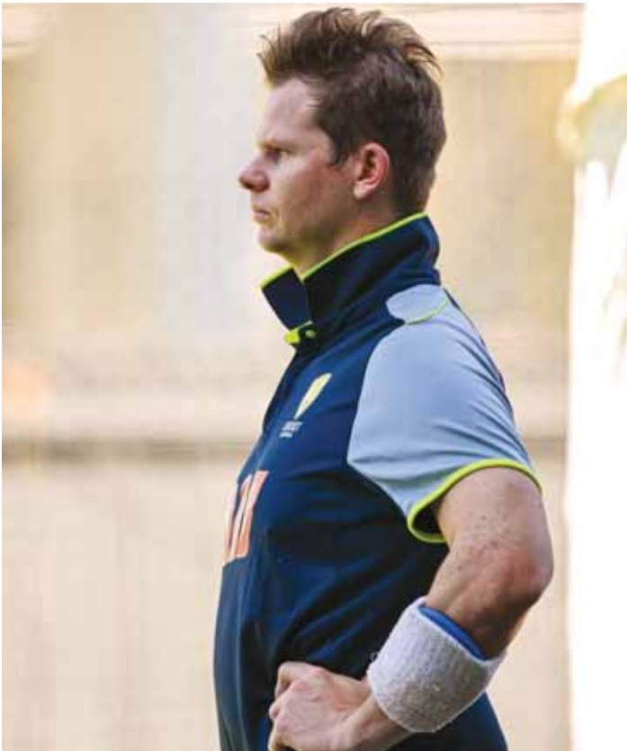
Australia's Pat Cummins bowls in the nets during a training session ahead of the third Ashes Test match against England yesterday. Centre: England's Joe Root bats in the nets during a training session. Right: Australia's batsman Steve Smith in the nets in Adelaide yesterday.