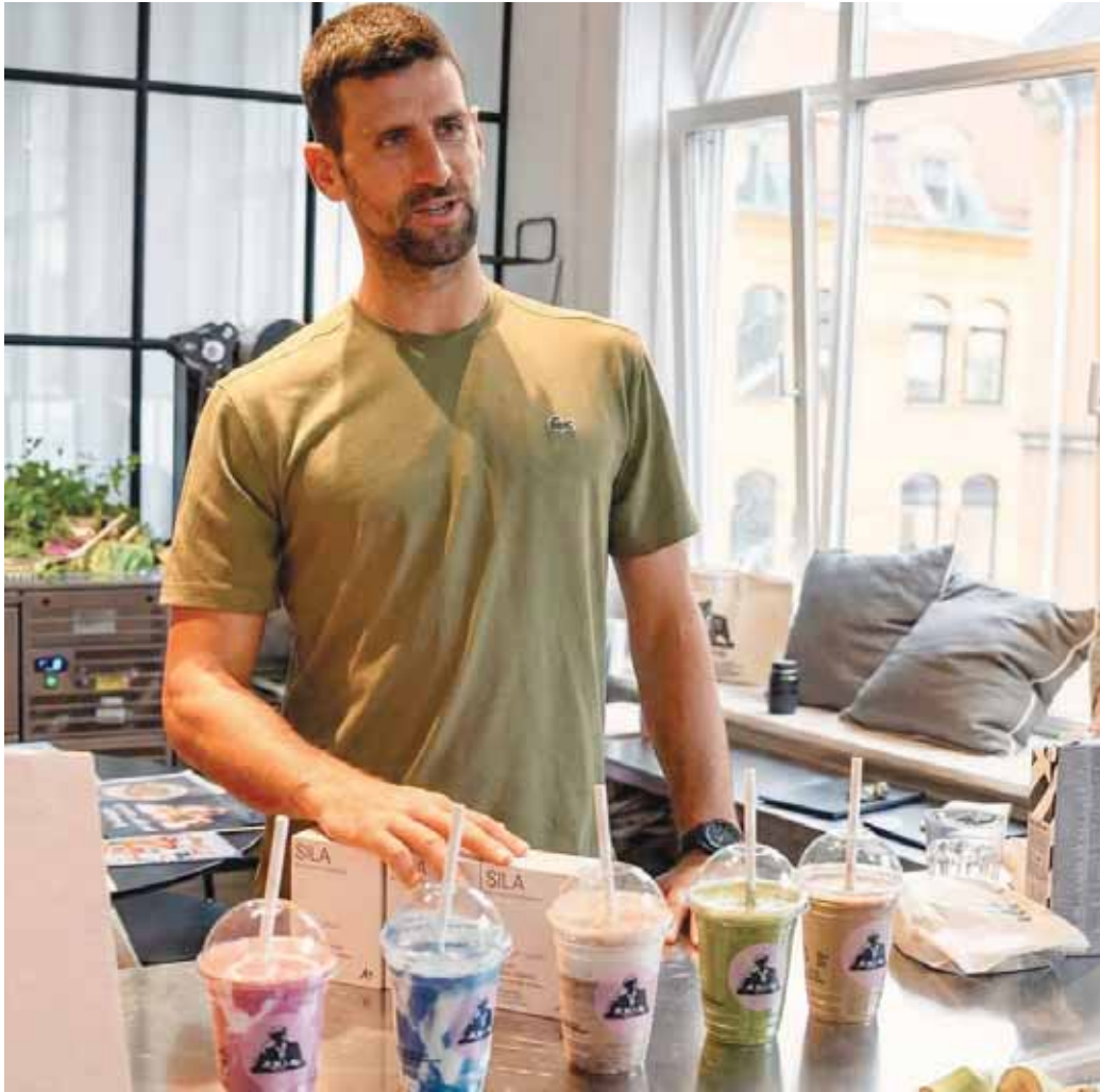
Novak Djokovic, who reached the semi-finals at all four Grand Slam tournaments in 2025, is playing Adelaide to tune up for the Australian Open where he will play for a record-extending 25th Grand Slam championship.

In October, Danish tennis star Holger Rune called temperatures of more than 30C and humidity soaring past 80 percent at the