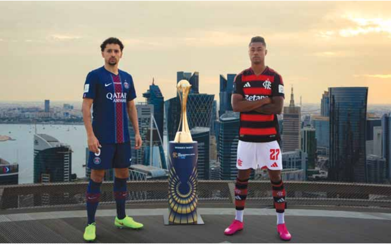
PSG captain Marquinhos (left) and his Flamengo counterpart Bruno Henrique pose with the Intercontinental Cup trophy with Doha skyline as a backdrop ahead of today's final.

Georgian winger Kvaratskhelia said having won five trophies this year has not