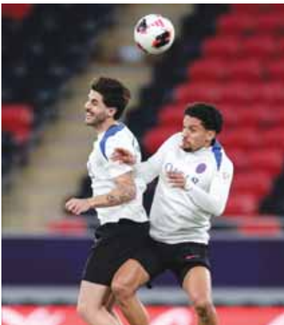
Paris Saint-Germain's Lucas Beraldo (left) and Brazilian Marquinhos duel for a ball at a training session.

that. This group is capable of anything, of making history. I believe in them and they believe it's possible," added Luis, who played as a left-back for Atletico Madrid and Flamengo before switching to a coaching role.