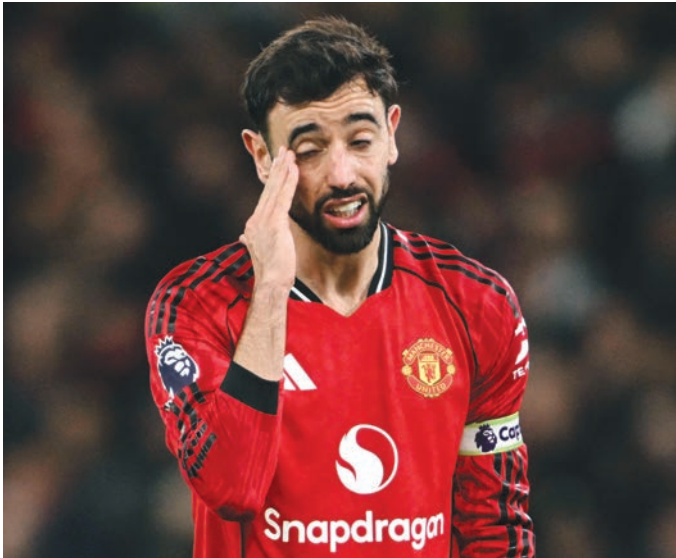
Manchester United's Bruno Fernandes reacts during the Premier League match against Bournemouth at Old Trafford in Manchester.

The playmaker said he had considered a move to Saudi Arabia, following in the footsteps of compatriot Cristiano Ron-