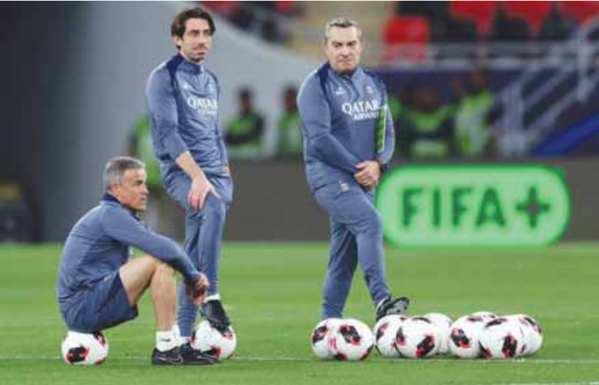
Paris Saint-Germain's Spanish coach Luis Enrique (left) speaks to his staff during a training session at the Ahmad Bin Ali Stadium in Al Rayyan.

diminished their hunger as they hunt for a sixth today. "All trophies count, this is an important title for us, we are ready for it. This is our last chance to win a trophy this season, so it's important to do everything we can to win it," he said.