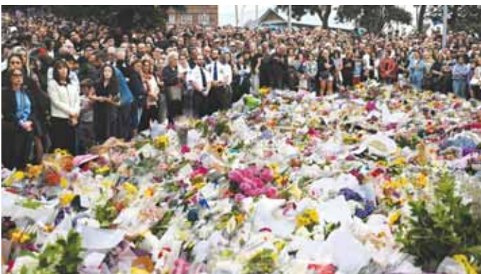
Mourners gather at a tribute at the Bondi Pavilion in memory of the victims of a shooting at Bondi Beach in Sydney yesterday.

Police armed with rifles will be part of a beefed up security presence at the third Test between Australia and England at Adelaide Oval after the Bondi Beach shooting attack, officials said. South Australia state Premier Peter Malinauskas said extra measures would be in place for the Ashes clash that starts today, although there was no intelligence pointing to an elevated threat level. "Given the events that have occurred in Sydney, there will be additional protocols put in place at Adelaide Oval," he said late Monday. "This is done only as a precautionary measure, but it is appropriate that we are an increasing sense of alertness just at