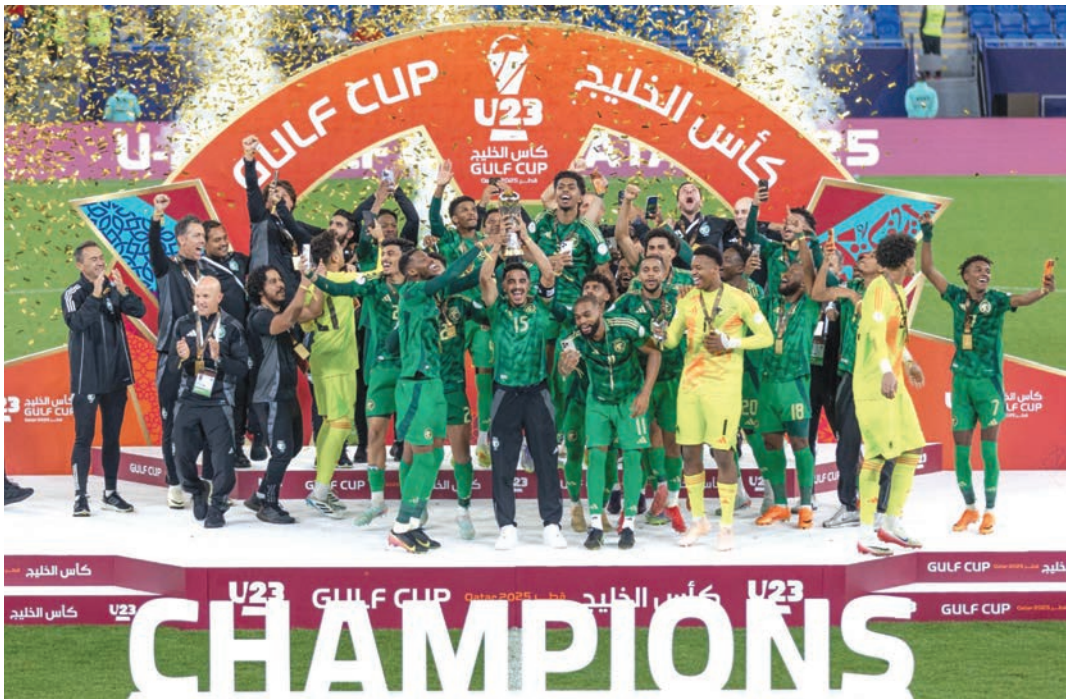
Saudi Arabia players celebrate after winning the AGCFF U-23 Gulf Cup in Doha yesterday.