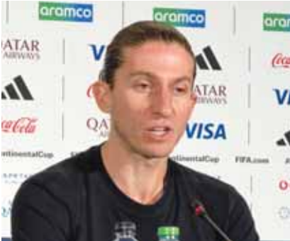
Flamengo coach Filipe Luis speaks at a press conference yesterday.