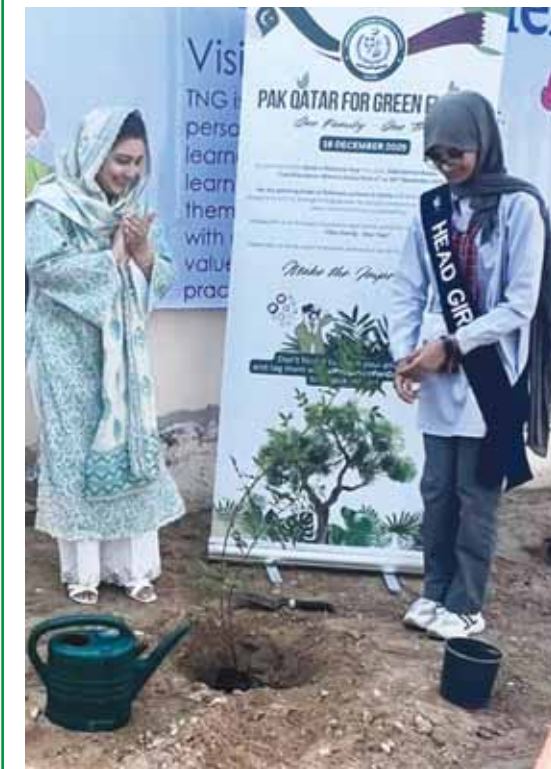
The event concluded with a tree planting activity within the school premises.