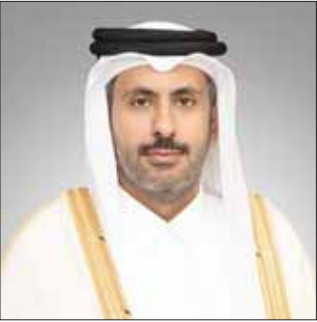
HE the Minister of Commerce and Industry Sheikh Faisal bin Thani bin Faisal al-Thani

HE the Minister of Commerce and Industry Sheikh Faisal bin Thani bin Faisal al-Thani has issued Ministerial Decision No. (102) of 2025, adopting the Qatari Technical Regulation on Shelf Life of Food Products, No. QS 10050:2025. The new regulation replaces Technical Regulation QS GSO 150-1:2013/Amd1/Amd2:2023, which was adopted under Ministerial Decision No. (17) of 2024, as well as Standard QS GSO 150-2:2013/Amd1:2024, adopted under Ministerial Decision No. (17) of 2025. The new regulation aims to ensure the safety and quality of food products circulating in the local market by adopting shelf-life periods based on scientific principles and modern international standards. This will help enhance consumer confidence and reduce food waste through