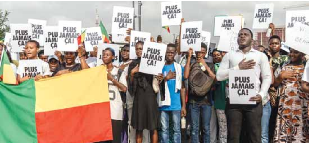
Young people hold placards and flags as they sing the national anthem during a rally organised by youth in support of Beninese President Patrice Talon and the preservation of democracy at Amazon Square in Cotonou, yesterday.