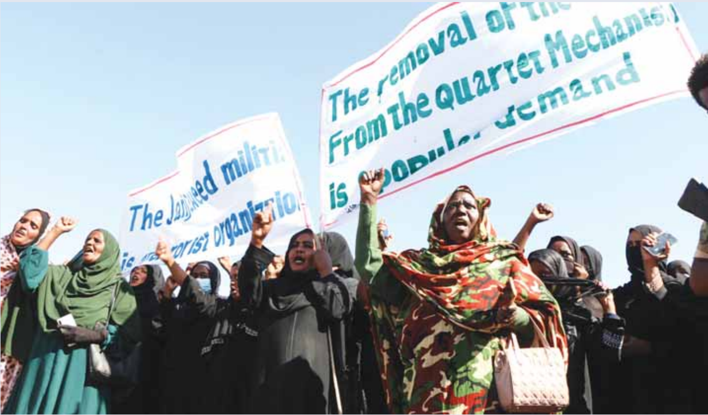
Sudanese take to the streets during a rally in support of the Sudanese Army, in the Merowe, 350km north of the capital Khartoum, yesterday. The war between the Sudanese Army and Sudan’s Rapid Support Forces which controls areas of western Sudan, erupted in April 2023, and has caused what the UN has described as the world’s worst humanitarian crisis.

By Javier Solana and Angel Saz-Carranza Madrid