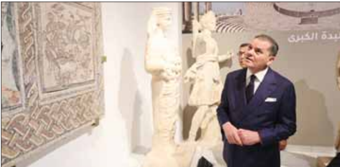
Libya’s Prime Minister Abdulhamid al-Dbeibah visits the National Museum, the largest in Tripoli, following its reopening after nearly 14 years of closure.

Libya’s national museum, formerly known as As-Saraya Al-Hamra or the Red Castle, has reopened in Tripoli, allowing the public access to some of the country’s finest historical treasures for the first time since the revolt that toppled Muammar Gaddafi. The museum, Libya’s largest, was closed in 2011 during a Nato-backed uprising against longtime ruler Gaddafi, who appeared on the castle’s ramparts to deliver a fiery speech. Renovations were started in March 2023 by the Tripoli-based Government of National Unity (GNU), which came to power in 2021 in a UN-backed political process. “The reopening of the National Museum is not just a cultural moment but a live testimony that Libya is building its institutions,” GNU Prime Minister Abdulhamid al-Dbiebah said at a reopening ceremony. Built in the 1980s, the museum’s