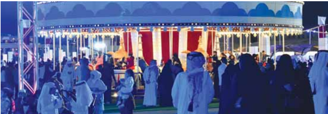
A large turnout of Qataris during Darb Al Saai in Umm Salal yesterday.