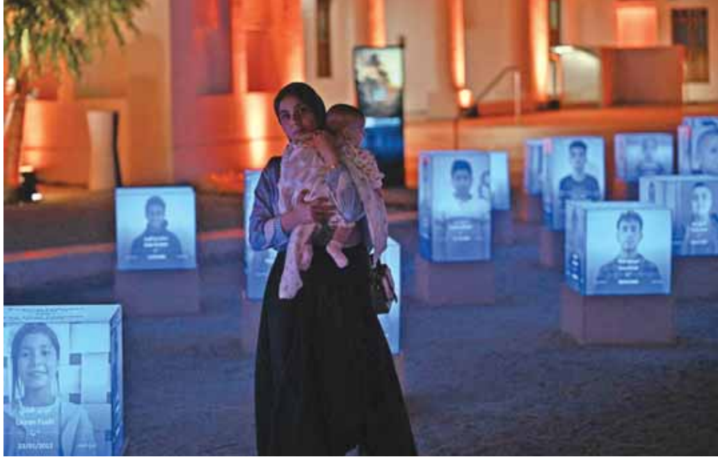
People attend an exhibition displaying portraits of 241 young victims of the war in Gaza at Msheireb Museums in Doha yesterday. The exhibition organised by Qatar Charity features 241 portraits of sponsored orphan children cared for through the compassion of donors, bringing their presence into a space where their names, faces and stories can be known and remembered.