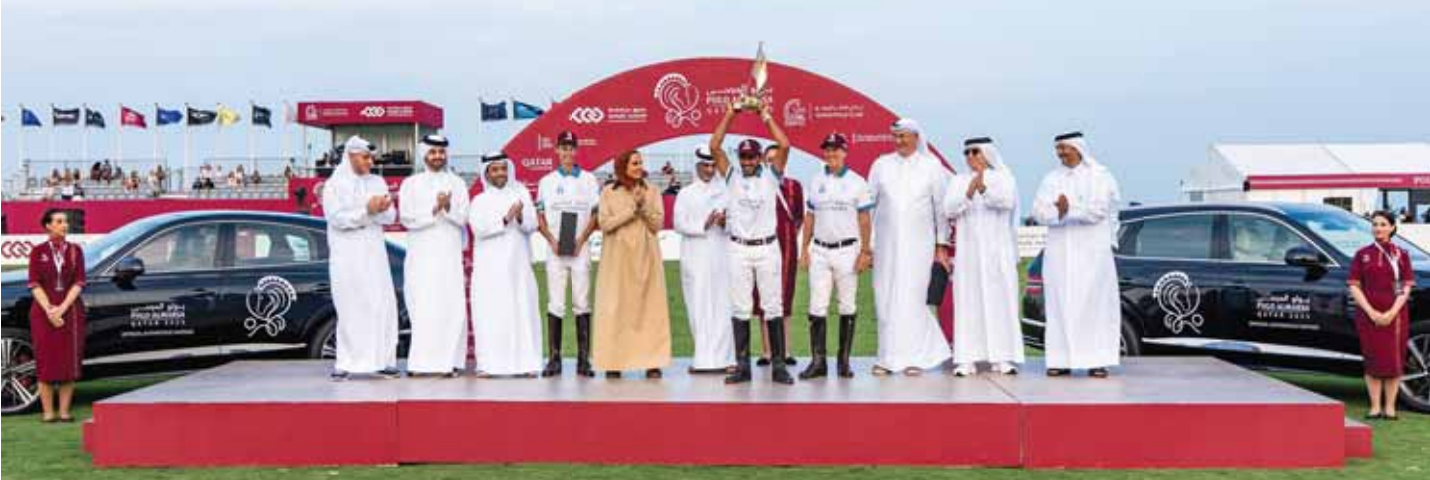
HE Sheikha Al Mayassa bint Hamad bin Khalifa al-Thani presented the Polo AlMarsa Qatar 2025 Championship Cup to Team Lusail yesterday. Sport Page 1