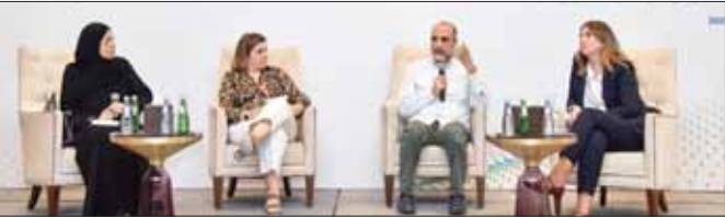
One of the sessions during the workshop.