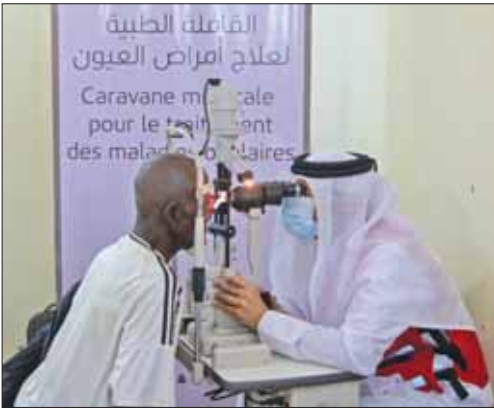
QRCS has recently implemented a series of sustainable development and humanitarian projects to support Niger's health sector by strengthening the capacities of national health facilities. The efforts have given hope to thousands of patients to access specialised treatment and restore their vision. It also comes under an official partnership agreement signed with the NEHP to enhance eye care services in underserved areas lacking vital healthcare.

Qatar Red Crescent Society (QRCS) has concluded a specialised medical convoy dedicated to treating eye diseases in Niamey, the capital of Niger. The initiative, in support of Niger's health system, was implemented in collaboration with Hamad Medical Corporation and the National Eye Health Programme (NEHP) under Niger's Ministry of Health, and in co-ordination with QRCS's office in the West African country. The official launch ceremony follows a formal meeting that brought together the HMC team, officials from the NEHP, the secretary-general of Niger's Ministry of Health, and local medical staff. The 16-day convoy aimed to deliver comprehensive services, including medical examinations, cataract surgeries, distribution of medicines and eyeglasses, and health education programmes to raise awareness about eye disease prevention, treatment, and management. A total of 1,463 successful surgeries (663 men and 800 women) were performed, along with the diagnosis and examination of 13,160 cases (6,179 men and 6,981 women). This contributed to reducing the pressure on health centres in Niamey and its surrounding areas, while improving the quality of life for thousands of residents.