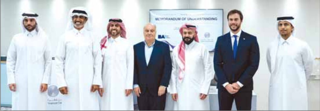
Officials at the signing of a new MoU between the QFC and the Ministry of Economic Development of Buenos Aires.