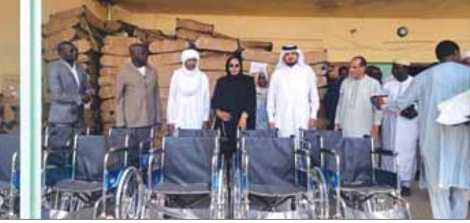
The handover ceremony took place at the Pharmaceutical Procurement Centre (Centrale Pharmaceutique d'Achat) in N'Djamena.

Qatar Charity (QC) has delivered a significant consignment of medical equipment to Chad's Ministry of Public Health, reinforcing efforts to improve healthcare and social services for the country's most vulnerable communities. The aid, funded by generous donors in Qatar, includes 1,200 blood pressure monitors and 600 wheelchairs. The handover ceremony took place at the Pharmaceutical Procurement Centre (Centrale Pharmaceutique d'Achat) in N'Djamena, attended by Dr Abdelmajid Abdelrahim, Minister of Public Health; Zara Mahamat Issa, Minister of Social Welfare; and Lt Gen Issakha Maloua Djamous, Minister of National Defence and Veterans, alongside representatives from the Embassy of Qatar and QC's Chad office. The initiative underscores QC's commitment to strengthening Chad's health institutions, fostering effective partnerships that