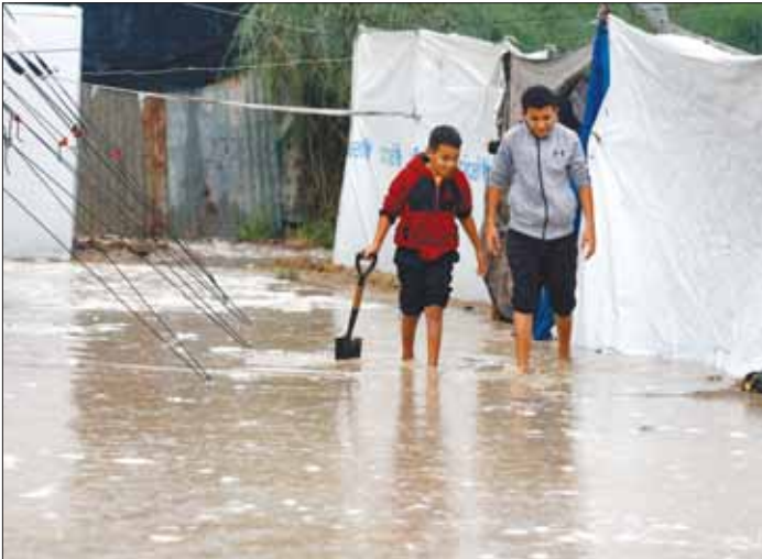
Displaced Palestinians walk through rainwater as they shelter in a flooded tent camp on a rainy day in Nuseirat, central Gaza Strip.

The UN Children’s Fund (Unicef) warned yesterday of the growing risk of disease outbreaks among children in the Gaza Strip, urging for intensifying the entry of humanitarian aid, particularly winter clothing and tents, amid harsh weather conditions. Palestine’ news agency (Wafa) yesterday quoted Unicef as saying that the current situation poses an escalating threat to children’s safety given severe weather and the delay in the delivery of essential supplies. Unicef urged that humanitarian aid, including large quantities of winter supplies currently stockpiled at the Gaza border, to be allowed into the Strip safely, quickly, and without obstruction.