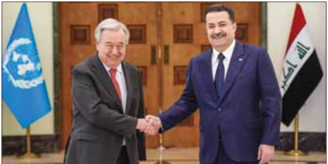
This handout picture released by the office of Iraq’s Prime Minister Mohammed S al-Sudani yesterday shows him (right) shaking hands with United Nations Secretary-General Antonio Guterres during a meeting in Baghdad.

UN Secretary-General Antonio Guterres yesterday marked in Baghdad the end of the United Nations’ political mission in Iraq, which supported the country’s transition following the US-led invasion. At Baghdad’s request, the United Nations Assistance Mission for Iraq (UNAMI) will shut down its operations after 22 years of assisting the country in its transition following the 2003 invasion and occupation that toppled longtime ruler Saddam Hussein. “UNAMI was honoured and humbled to walk side-by-side with the Iraqi people,” Guterres said at the mission’s closing ceremony. But “while a mission may conclude, the United Nations will always walk alongside the people of Iraq on the path towards peace, sustainable development and human rights,” he added. UN agencies and programmes will continue to operate in Iraq. During a press conference earlier with Iraq’s Prime Minister Mohammed S al-Sudani, Guterres said: “There is one thing the world must understand, Iraq is now a normal country. “Relations between the UN and Iraq will become normal relations with the end of UNAMI”