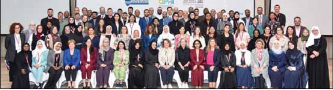
Participants in the workshop.

Qatar Precision Health Institute (QPHI), in collaboration with the Principles and Practice of Clinical Research (PPCR) Programme from Harvard T H Chan School of Public Health and the College of Health Sciences at Qatar University, concluded a joint workshop on Clinical Research in Precision Medicine, Rare Diseases, and Pharmacogenomics recently. The workshop brought together a distinguished group of specialists and experts from Qatar and abroad, as well as participants, researchers and graduate students from the healthcare sector from over 15 countries. The workshop, titled 'Clinical Research in Precision Medicine, Rare Diseases, and Pharmacogenomics', was organised under