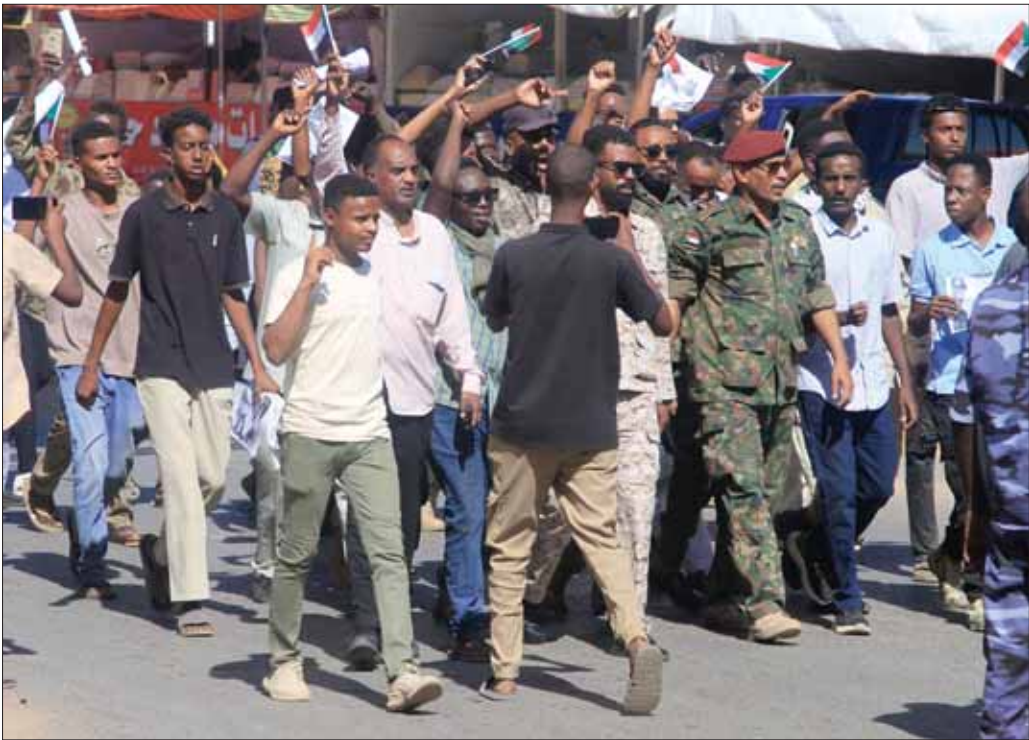
Sudanese take to the street during a rally in support of the Sudanese armed forces in their battle against the paramilitary Rapid Support Forces in Omdurman, part of greater Khartoum, yesterday.