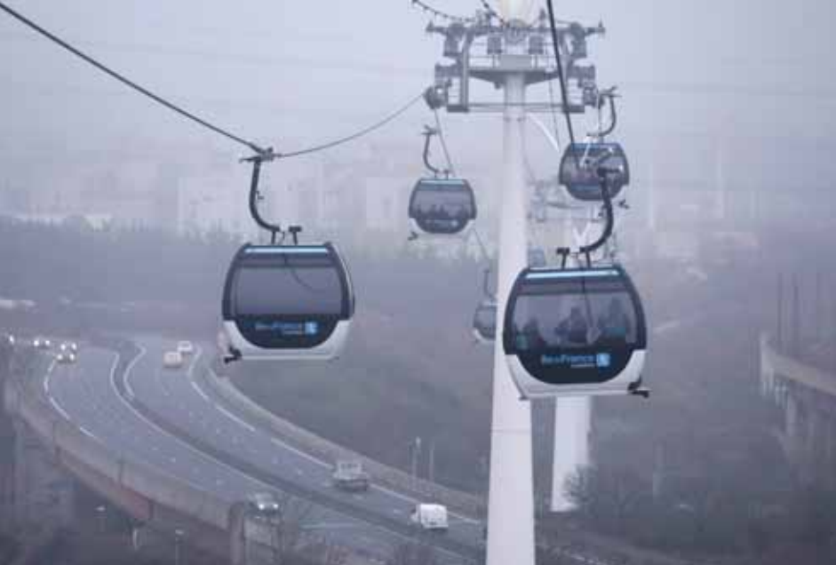
This photograph shows the first urban cable car in Ile-de-France region on the day of its official launch, between Créteil Pointe du Lac et Limeil-Brévannes, on the outskirts of Paris.

Gondolas floated above a cityscape in the southeastern suburbs of Paris yesterday as the first urban cable car in the French capital's region was unveiled. Officials inaugurated the C1 line in the suburb of Limeil-Brevannes in the presence of Valerie Pecresse, the head of the Ile-de-France region, and the mayors of the towns served by the cable car. The 4.5km route connects Creteil to Ville-neuve-Saint-Georges and passes through Limeil-Brevannes and Valenton. The cable car will carry some 11,000 passengers per day in its 105 gondolas, each able to accommodate ten seated passengers. The total journey will take 18 minutes, including stops along the way, compared to around 40 minutes by bus or car, connecting the isolated neighbourhoods to the Paris metro's line 8. The €138mn project was cheaper to build than a subway, officials said. "An underground metro would never have seen the light of day because the budget of more than €1bn could never have been financed," said Gregoire de Lasteyrie, vice-president of the Ile-de-France regional council in charge of transport. It is France's seventh urban cable car, with aerial tramways already operating in cities including Brest, Saint-Denis de La Reunion and Toulouse. Historically used to cross rugged mountain