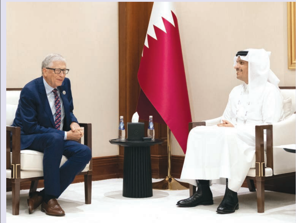
HE the Prime Minister and Minister of Foreign Affairs Sheikh Mohammed bin Abdulrahman bin Jassim al-Thani met yesterday with co-founder of Microsoft Bill Gates, on the sidelines of the Doha Forum 2025. The meeting discussed co-operation relations and exchanged views on the items on the forum's agenda, in addition to touching on a number of topics of mutual interest. (QNA)