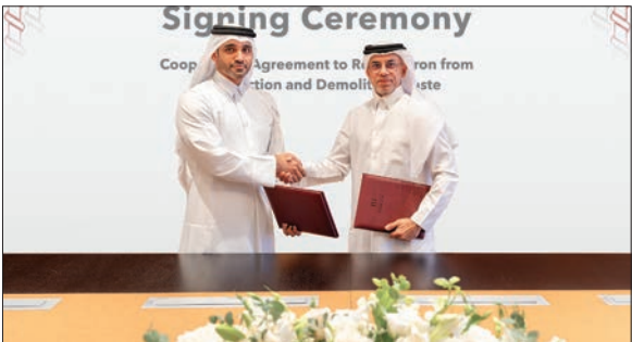
Signing ceremony between QPMC and Qatar Steel.

Leveraging its more than 50 years of experience in the iron and steel industry, the company will convert the recycled steel into finished products for use in future national projects. This process will reduce the need for importing raw materials and