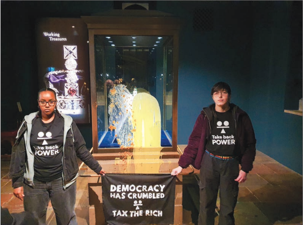
Members of an organisation called Take Back Power hold a sign as they stand after they threw food at a display case containing the Imperial State Crown, at Tower of London, leading to a temporary closure of part of the historic building housing the Crown Jewels, in London, yesterday.

“We stayed for about a week there,” Dimas said, urging the government to come to the area to see the calamity themselves. Local government officials on Sumatra have called on the national government in Jakarta to declare a national emergency to free up additional funds for rescue and relief efforts.