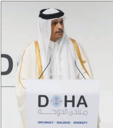
HE Sheikh Mohammed bin Abdulrahman bin Jassim al-Thani speaking at the opening session of Doha Forum yesterday.

He added that, in line with this approach, Qatar continues to play an active mediating role-one of the cornerstones of its foreign policy-by initiating channels of dialogue, providing credible negotiation plat-