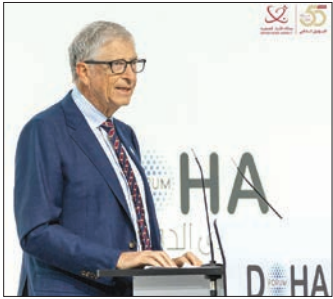
Bill Gates speaking at Doha Forum.

Microsoft Co-Founder and Co-Chair of the Bill and Melinda Gates Foundation (Gates Foundation) Bill Gates emphasised that the strategic partnership between his foundation and Qatar has greatly contributed to supporting programmes in health, social development, and global poverty reduction. In his speech at the opening of the Doha Forum yesterday, he stated that Qatar is one of the world's foremost supporters of social development programmes, including health and poverty alleviation. He revealed the launch of a new partnership between the Gates Foundation and the Qatar Development Fund aimed at enhancing economic empowerment, particularly supporting farmers, alongside initiatives in education and health. He highlighted Qatar's pivotal role in supporting international efforts to provide vaccines, including its support for the Global Alliance for Vaccines and Immunisation (Gavi) and the Global Fund to Fight Aids, Tuberculosis, and Malaria, describing this role as an investment reflecting a gen-