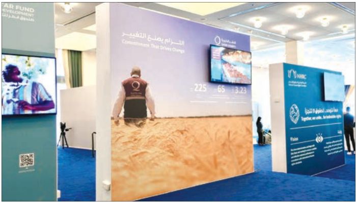
QC exhibition booth at Doha Forum 2025. Right: QC holds a series of bilateral meetings with prominent international actors.

Concluding her remarks, the EU official described the current moment as pivotal, emphasising that upholding international law and ensuring aggressors are not rewarded are key to securing a more stable future. (QNA)