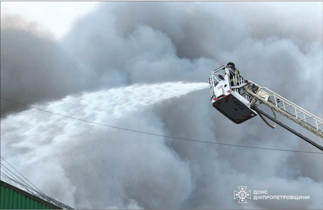
A firefighter on a crane extinguishing a fire following an air attack in Dnipropetrovsk Region yesterday.

Also on Friday, US and Ukrainian officials “also agreed on the framework of security arrangements and discussed necessary deterrence capabilities to sustain a lasting peace.”