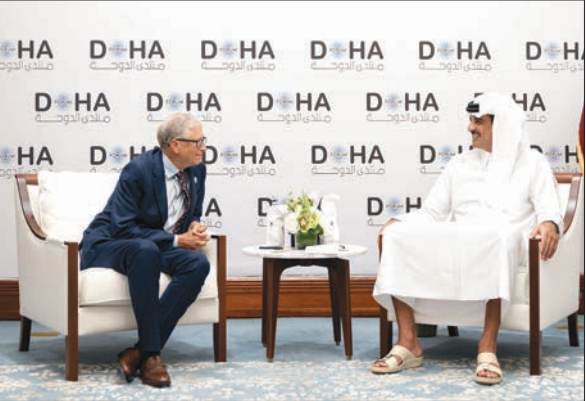
His Highness the Amir Sheikh Tamim bin Hamad al-Thani, received yesterday Bill Gates, co-founder of Microsoft, on the occasion of his visit to the country to participate in the Doha Forum 2025, currently underway at the Sheraton Doha Hotel. During the meeting, they reviewed prospects for developing co-operation and discussed a host of topics of mutual interest, particularly those on the forum's agenda.