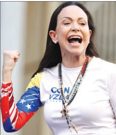
Venezuelan opposition leader Maria Corina Machado gestures as she addresses her supporters during a protest called by the opposition on the eve of the presidential inauguration in Caracas in January this year.

Machado, in hiding since August 2024, is a supporter of US President Donald Trump who himself has long coveted the prestigious Nobel peace award.