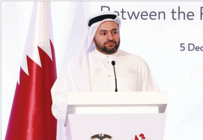
HE the Minister of State at the Ministry of Foreign Affairs Dr Mohammed bin Abdulaziz bin Saleh al-Khulaifi.

He also noted that the developments witnessed today are an extension of these efforts and a responsible step towards peace and development, adding that this agreement is expected to open a political path for establishing sustainable peace within an agreed framework in Colombia. He pointed out that the agreement will create an opportunity to end the armed conflict between the two sides and will significantly reduce illegal human trafficking and drug