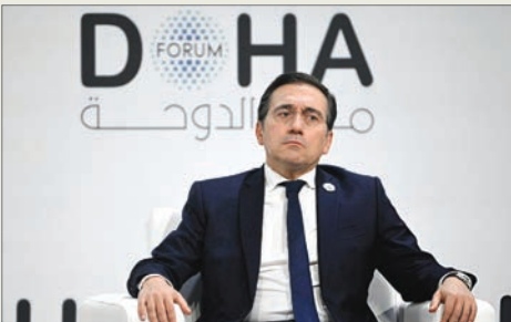
Spanish Foreign Minister Jose Manuel Albares at the Doha Forum.

He pointed out that the international com-