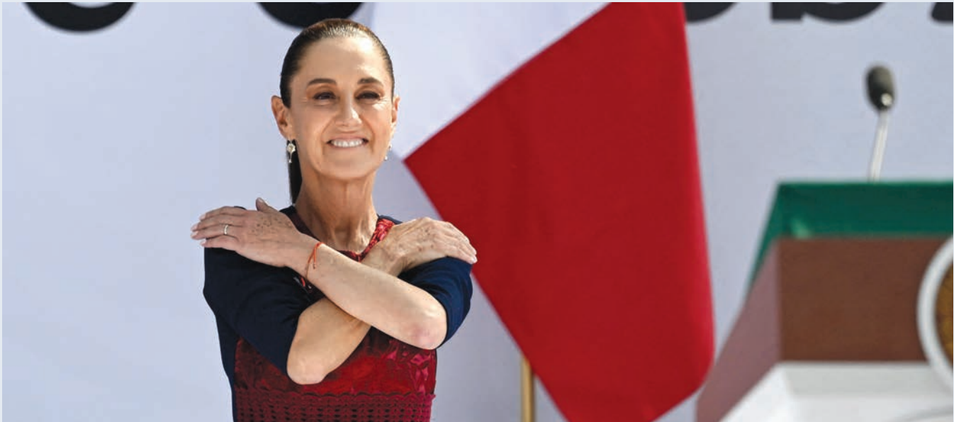
Mexican President Claudia Sheinbaum gestures on arrival for the rally marking the seventh anniversary of the Morena party in government in Mexico City yesterday. Sheinbaum called for a massive rally to reaffirm her leftist government after a turbulent month marked by political violence and the abrupt resignation of the attorney-general.

An EU decision on the proposal will likely come early next year. EU regulators on Thursday started an investigation into Meta and could order it to pause its rollout of AI features in its WhatsApp messenger that would block rivals.