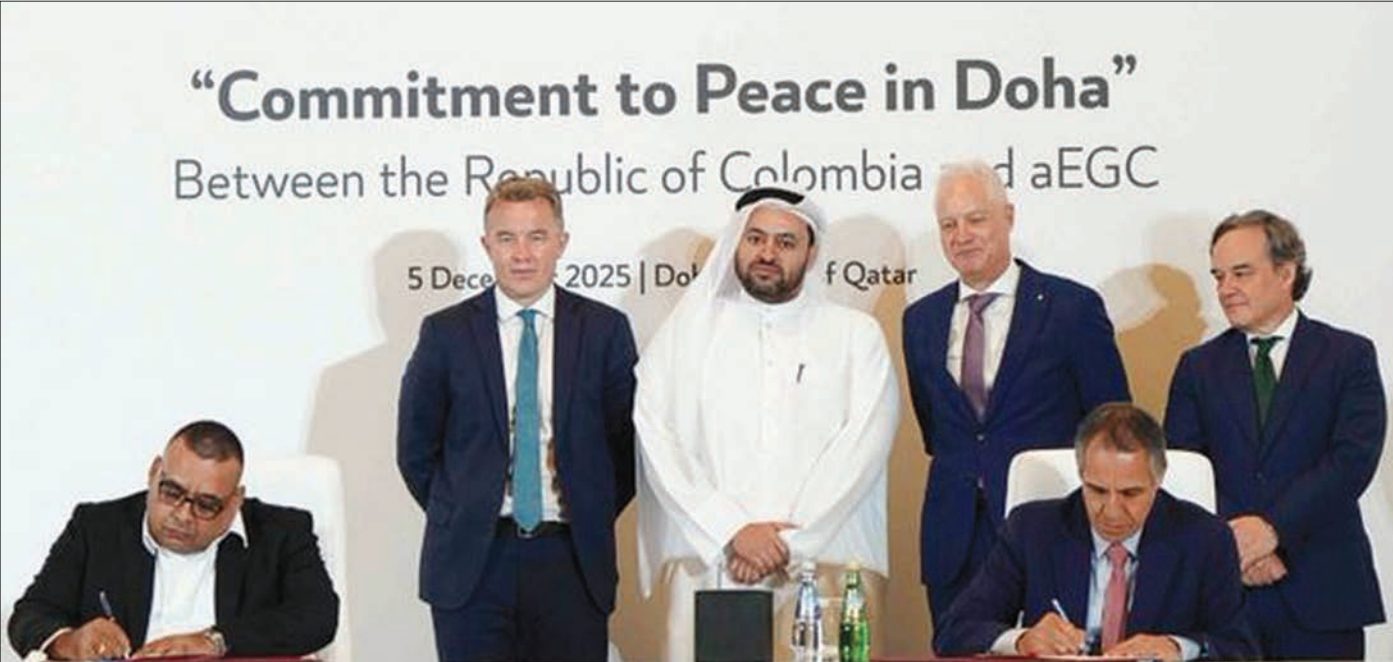
The 'Commitment to Peace' agreement was signed in Doha on Friday.