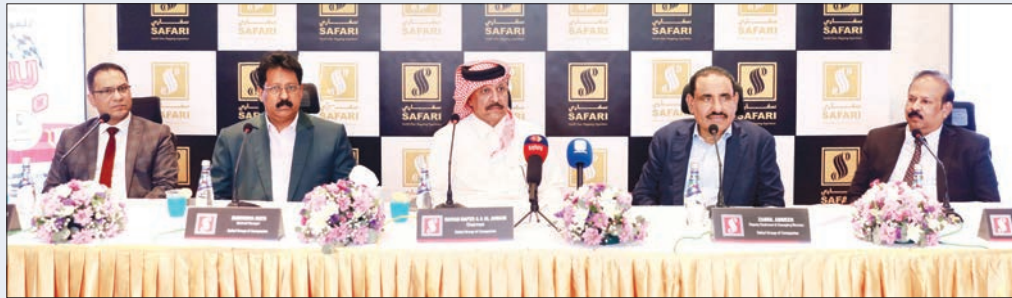
Safari Group officials at the press conference.

Aspetar continues to lead globally by delivering evidence-based medical services, upholding the highest standards in a safe and world-class environment. Patient safety and confidentiality remain top priorities, reflecting the hospital's philosophy of combining medical excellence with responsibility towards the sporting community.