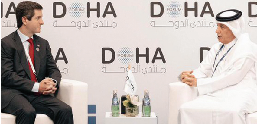
HE the Minister of State for Foreign Affairs Sultan bin Saad al-Muraikhi met yesterday with Uruguay's Minister of Foreign Affairs Mario Lubetkin, on the margin of the Doha Forum 2025. HE al-Muraikhi also met yesterday with Panama's Deputy Foreign Minister Carlos Hoyos on the sidelines of the Doha Forum. Discussion during the meetings dealt with co-operation and relations between the countries and ways to bolster them, in addition to a host of topics of mutual interest. -QNA