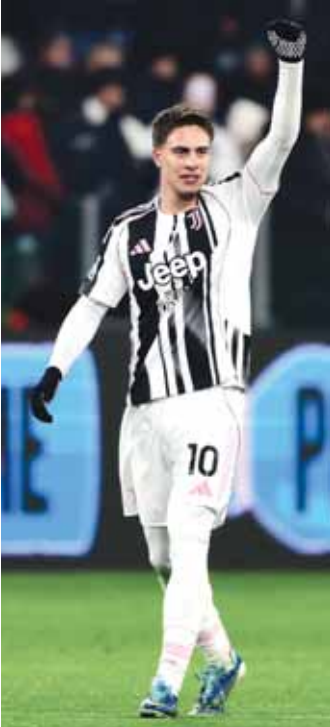
Juventus’ Kenan Yildiz celebrates after scoring his team’s second goal during the Serie A match against Cagliari in Turin.

AC Milan, second and level on 25 points with Napoli, can take the provisional lead of Italy’s top flight later with a win over Lazio at the San Siro.