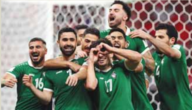
Syria's Omar Maher Khribin celebrates scoring their first goal with teammates during their FIFA Arab Cup match against Tunisia at Ahmad Bin Ali Stadium yesterday.

DOHA: Omar Khribin's second half free-kick earned Syria a hard fought 1-0 over Tunisia in their FIFA Arab Cup 2025 Group A tie at the Ahmad Bin Ali Stadium yesterday. Syria meet Qatar next on Thursday, while Tunisia take on Palestine.