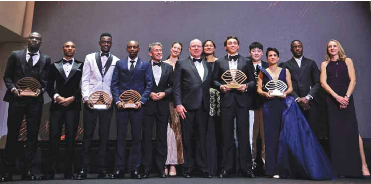
President of World Athletics and former British track and field athlete Sebastian Coe, Prince's Albert II of Monaco pose with winners of the World Athletics Awards 2025 in Monte Carlo, Monaco.

joined Duplantis in being named field athlete of the year after winning high jump titles indoors and