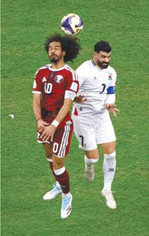
Qatar's Akram Afif in action with Palestine's Musab Battat at Al Bayt Stadium.

Palestine will next play Tunisia while Qatar will take on Syria, with both matches to be played on Thursday.