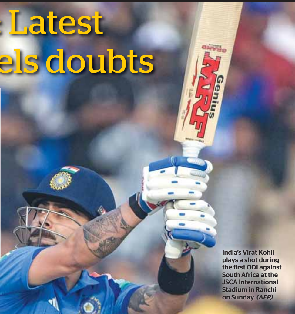
India's Virat Kohli plays a shot during the first ODI against South Africa at the JSCA International Stadium in Ranchi on Sunday.