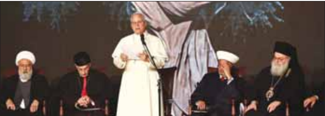
Pope Leo XIV speaks as he attends an interreligious meeting in Martyrs' Square, in Beirut, Lebanon, yesterday.

At Beirut's central Martyrs' Square near its large, blue-domed mosque, the Pope told religious leaders they must be "builders of