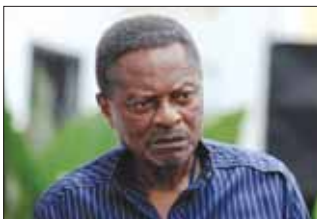
File photo of Cameroonian politician Anicet Ekane.

"We repeatedly alerted the authorities, including the military court administration, requesting that Anicet Ekane be transferred to a hospital with the appropriate facilities for better care, but our