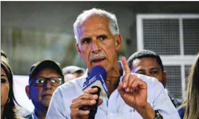
Presidential candidate Nasry Asfura of the National Party of Honduras speaks at a press conference on the day of the general election in Tegucigalpa, Honduras.