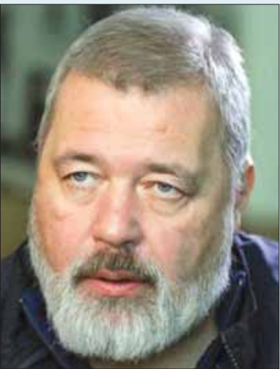
WORRIED: Dmitry Muratov.