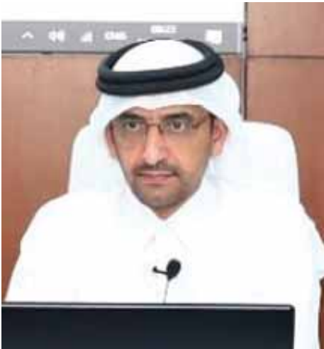
HE the Minister of Justice and Minister of State for Cabinet Affairs Ibrahim bin Ali al-Mohannadi.

legislative development, emphasising the challenges posed by technological advancements and their legal implications, as well as the state’s efforts to keep pace with these developments. At the conclusion of the visit, a discussion was held between the minister and participants of the National Defence course, organised by the academy for senior officials from various ministries, institutions, and security agencies in the country. – QNA