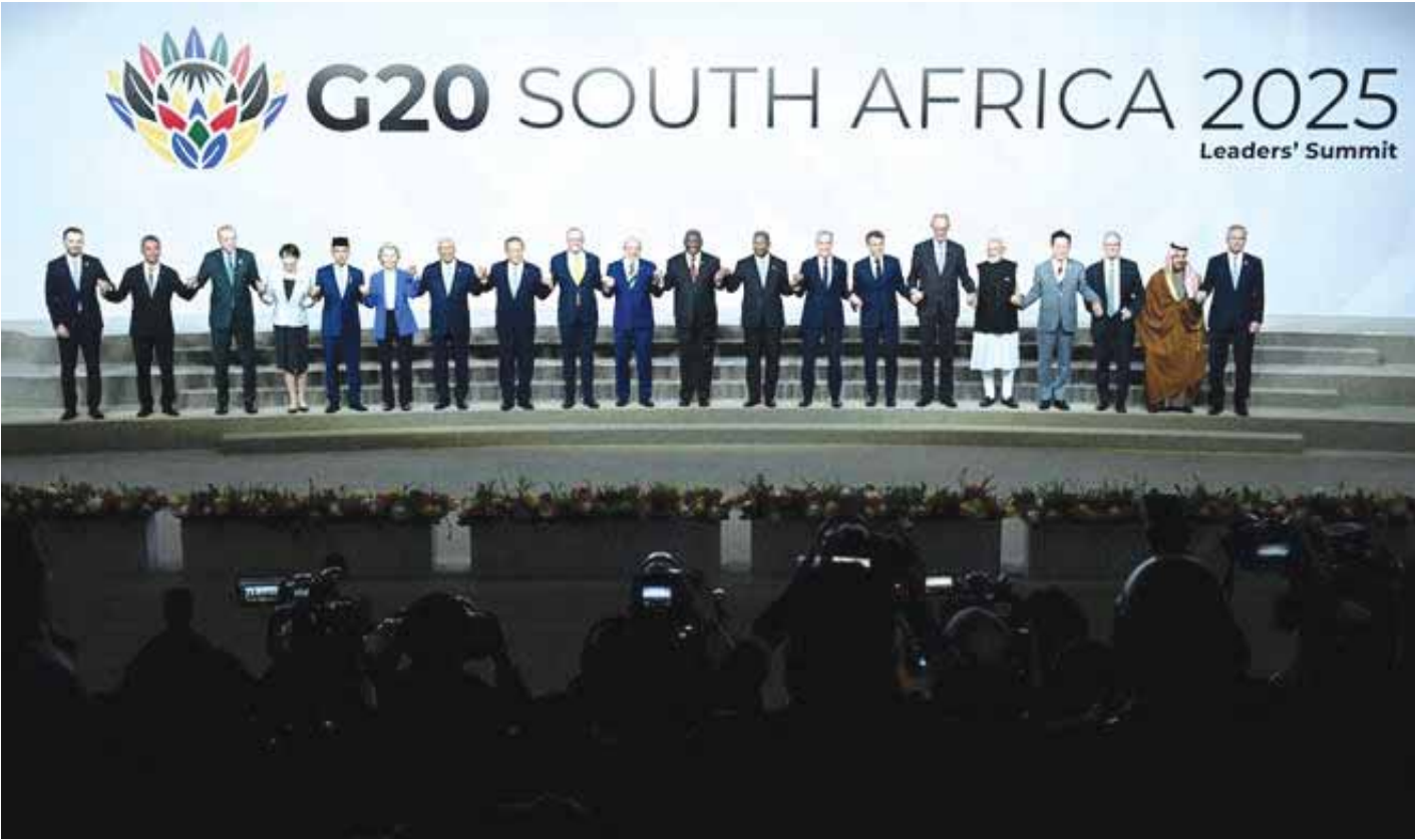
World leaders pose for a family photo at the G-20 Summit in Johannesburg in South Africa last month.

• Jayati Ghosh, Professor of Economics at the University of Massachusetts Amherst, is a member of the Club of Rome’s Transformational Economics Commission and Co-Chair of the Independent Commission for the Reform of International Corporate Taxation.