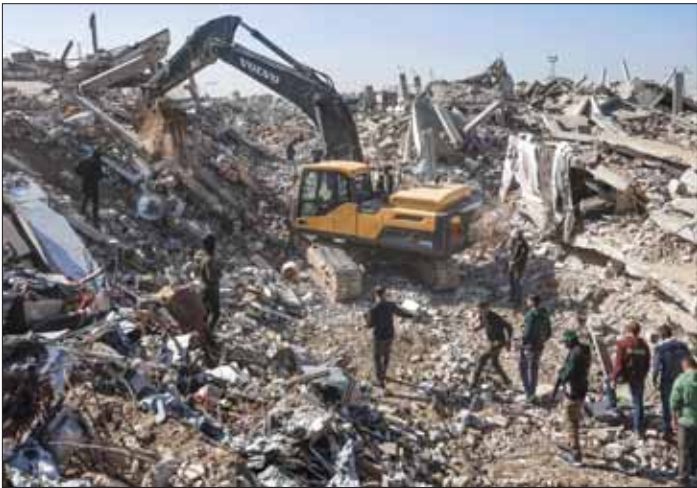
Palestinian Hamas fighters and Egyptian workers accompanied by members of the International Committee of the Red Cross use a digger as they search for the last two remaining bodies of hostages in Jabalia refugee camp, in the northern of Gaza Strip, yesterday.

He called for lifting all restrictions on fuel delivery and ensuring immediate and full operational supply, with a transparent and consistent mechanism that aligns with the scale of the emergency in Gaza.