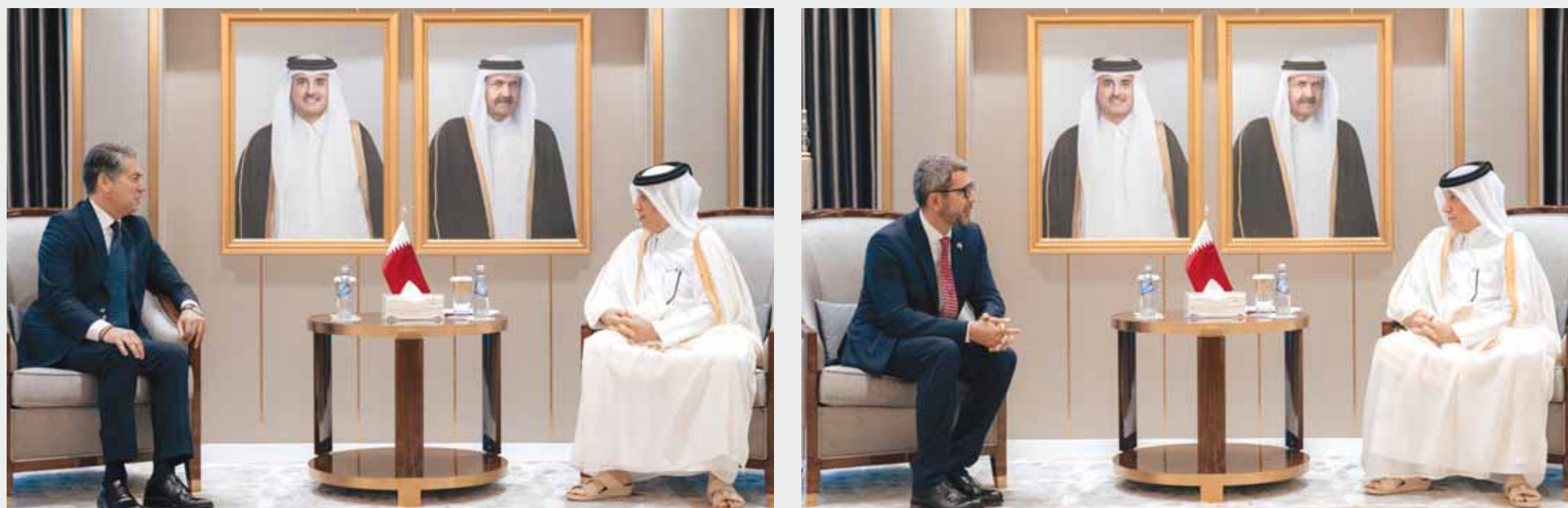
HE the Minister of State for Foreign Affairs Sultan bin Saad al-Muraikhi received yesterday copies of the credentials of two newly appointed ambassadors to Qatar. He received the documents from Christos Kapodistrias of Greece and Varlam Avaliani of Georgia. HE al-Muraikhi wished both diplomats success in their duties and affirmed Qatar's readiness to provide all necessary support to help strengthen bilateral relations with their respective countries across various fields. - QNA