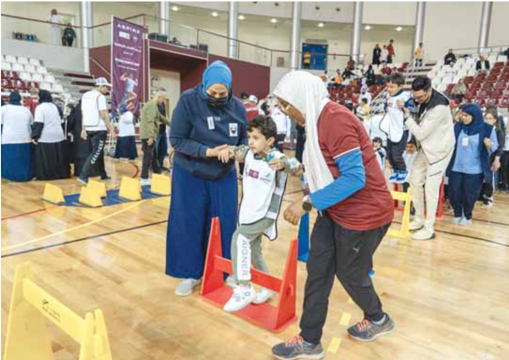
A moment from a previous edition of Paralympic Day at AZF.

The activities include goalball for the visually impaired, table tennis for people with disabilities, obstacle course, javelin throw, tug-of-war, and parachute game. The event will also feature specialised sports activities for individuals with hearing and visual impairments, the deaf community, and those with physical disabilities. Through this initiative, the AZF reaffirms its commitment to supporting the Qatar National Vision 2030 by promoting the values of inclusivity and equality in sports, and by empowering all members of the community to engage in sports activities within a safe and motivating environment that encourages positive participation and social integration, a statement added.