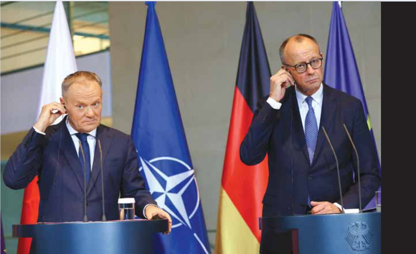
German Chancellor Friedrich Merz and Polish Prime Minister Donald Tusk hold a press conference on the day of the German-Polish government consultations at the Chancellery in Berlin yesterday.

New York has an existing city program to lure supermarkets to underserved areas called FRESH. It uses tax and planning incentives to entice developers and private store operators.