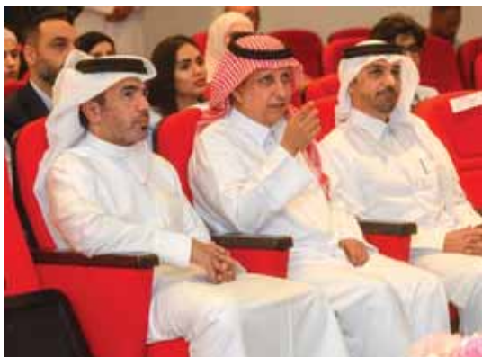
The Qatar Cancer Society held a specialised workshop on 'Media and Advocacy for Cancer Issues'.