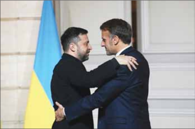
French President Emmanuel Macron (right) and Ukrainian President Volodymyr Zelensky greet each other following a joint press conference at the Elysee Presidential Palace in Paris yesterday.

difficult but productive," EU foreign policy chief Kaja Kallas added at a meeting of EU defence ministers. Washington put forward an initial 28-point proposal to halt the war, drafted without input from Ukraine's European allies and regarded as too close a reflection of Moscow's maximalist demands on Ukrainian territory. It would have seen Kyiv withdraw from its eastern Donetsk region and the United States de facto recognise the Donetsk, Crimea and Lugansk regions as Russian. After talks in Geneva just over a week ago, the United States updated the original blueprint following criticism from Kyiv and Europe, but the current contents remain unclear. In an article for Britain's Telegraph newspaper published at the weekend, Ukraine's former armed forces chief Valery Zaluzhny offered a downbeat assessment of Ukraine's predicament, saying that "we are in an extremely difficult situation, where a rushed peace will only lead to a devastating defeat and loss of independence". Zaluzhny, now ambassador to London and seen by some as a domestic rival of Zelensky, said that without security guarantees including Ukrainian membership of Nato, the "war will probably continue" with Russia's goal