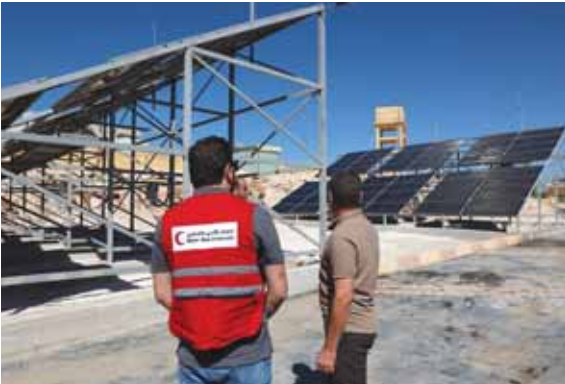
QRCS project for two residential villages in Idlib Governorate, northern Syria.

T he Qatar Red Crescent Society (QRCS) completed a furnishing and infrastructure development project for two residential villages in Idlib Governorate, northern Syria, providing decent and stable housing for internally displaced people (IDPs). The project’s final phase involved constructing a deep borehole equipped with a solar-powered pumping and operation system, water tower, and water supply network to secure sustainable potable water for residents, and meeting their everyday water needs in a safe and environmentally friendly manner. Other activities of the project had been carried out, including the provision of 600 apartments with essential household furniture, supplying classroom furniture for two schools, furnishing of two mosques (with dedicated spaces for women), constructing playing areas for children, installing solar streetlights, and distributing waste containers to maintain public hygiene. All of these activities helped upgrade the overall conditions, improve the quality of life, enhance socioeconomic stability, and create jobs for the beneficiaries.