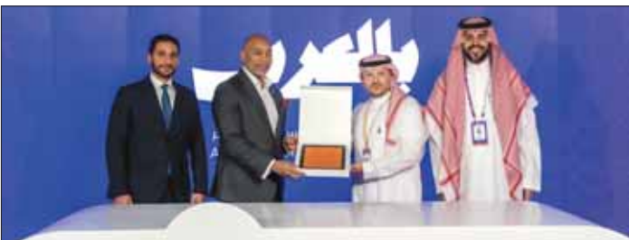
BilAraby takes part in Misk Global Forum.

"Our participation in the Misk Global Forum marks the first stop