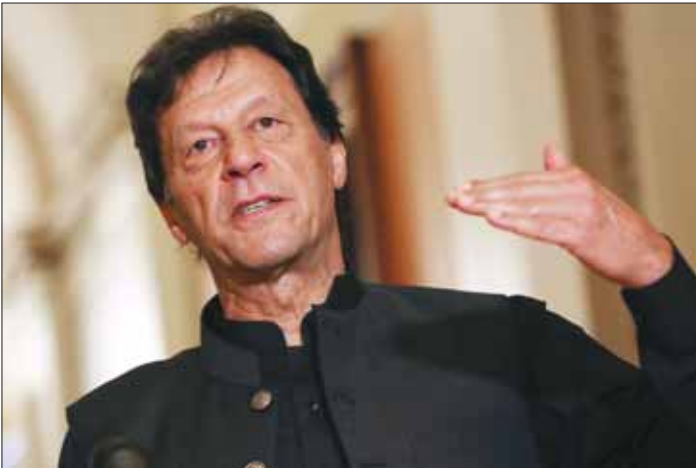
CONCERN: Pakistan's Interior Ministry refused to comment on former prime minister Imran Khan's whereabouts.

"Today we have no verifiable information at all about his condition," the son added. "Our greatest fear is that something irreversible is being hidden from us." The family has repeatedly sought access for Khan's personal physician, who has not been allowed to examine him for more than a year, he added. Pakistan's interior ministry did not respond to a request for comment. Speaking on condition of anonymity, a jail official told Reuters that Khan was in good health, adding that he was not aware of any plan for a move to a higher-security facility. Khan, 73, has been in jail since August 2023, convicted in a string of controversial cases that he says were politically driven following his ouster in a 2022 parliamentary vote. His first conviction centred on accusations that he unlawfully sold gifts received in office, in a