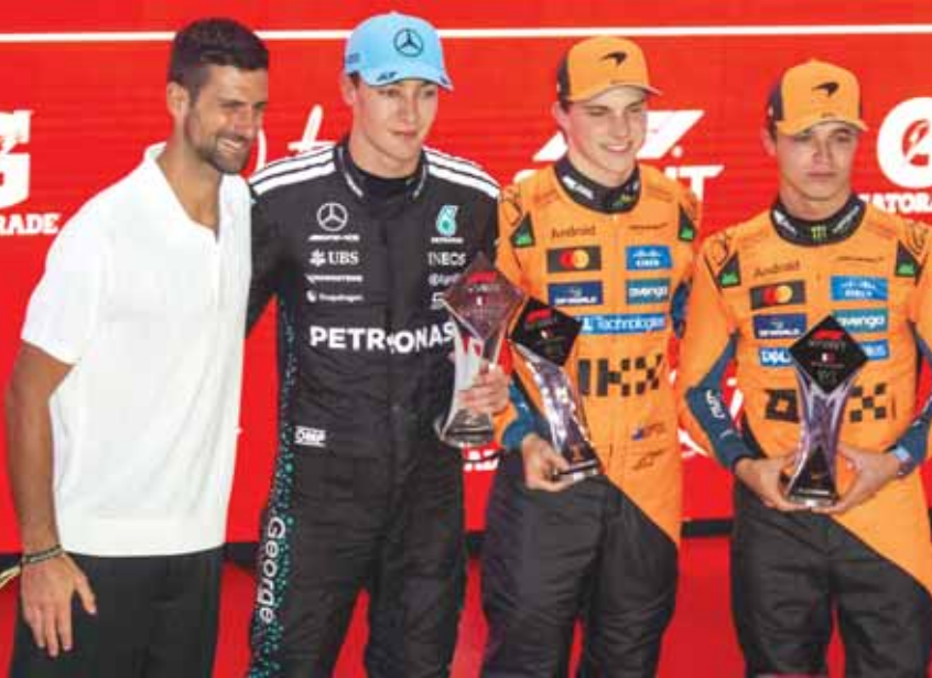
Qatar sprint race winner Oscar Piastri of McLaren, runner-up George Russell of Mercedes and third-placed Lando Norris of McLaren pose with Serbian tennis legend Novak Djokovic at the Lusail International Circuit.

"The first couple of laps are opportunities for everyone, but after that it should probably be straightforward," he added. Verstappen ended the session just over a tenth further back. The Dutchman must finish ahead of Norris today to keep his title hopes alive and take the fight to Abu Dhabi. "This qualifying was a little bit better. We are still quite far off, but at least I felt a little bit happier," Verstappen said. "Some limitations prevent us from pushing harder around the lap, but we are P3 and starting on the second row, and that creates better opportunities because it's hard to pass around here. We will see what we can do tomorrow." Behind the top three, Russell and Kimi Antonelli locked out the third row for Mercedes, with Sainz seventh. Fernando Alon-