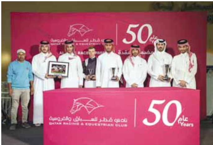
Connections of Medan celebrate after the grey mare won the Lekhraib Cup at the Uqda Racecourse yesterday.