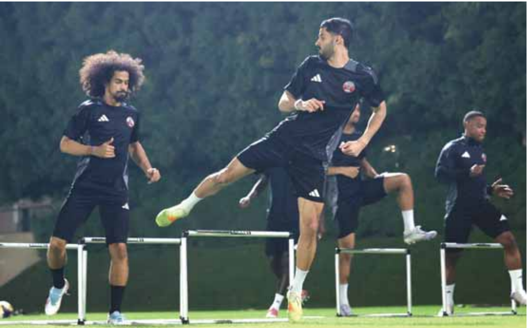
Qatar players train yesterday, ahead of their tomorrow's opening match of FIFA Arab Cup match against Palestine.

A total of 15 regional and international broadcasters will make use of the host country's studios in