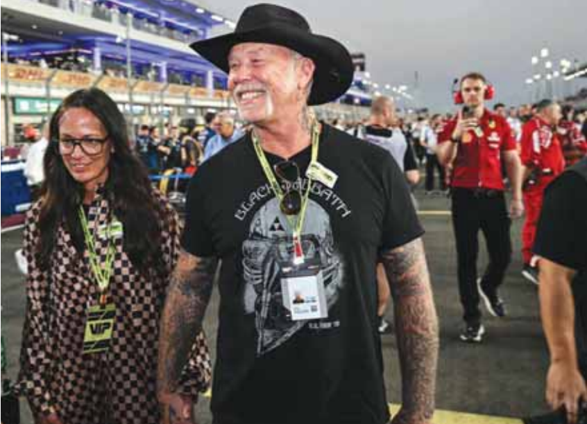
Metallica's lead vocalist James Hatfield, who will perform today after the Qatar Grand Prix, walks on the grid before the sprint race at the Lusail International Circuit.

so (Aston Martin), Pierre Gasly (Alpine) and Charles Leclerc (Ferrari) completed the top ten. Earlier in the evening, Piastri had returned to winning ways with a dominant lights-to-flag victory in the sprint. He controlled the 19-lap dash to claim his first win since the Dutch Grand Prix in August, collecting eight points to further erode Norris's lead. Norris finished where he started in third behind Russell. Verstappen gained two places with a brilliant launch to take fourth. Yuki Tsunoda and Antonelli were fifth and sixth, despite both serving five-second penalties for repeated track-limits infringements. Alonso secured seventh, with Sainz taking the final point. Ferrari endured a miserable evening, with