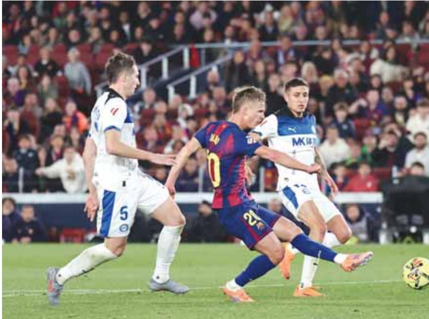
Barcelona's Spanish Daniel Olmo scores against Alaves during the La Liga match.