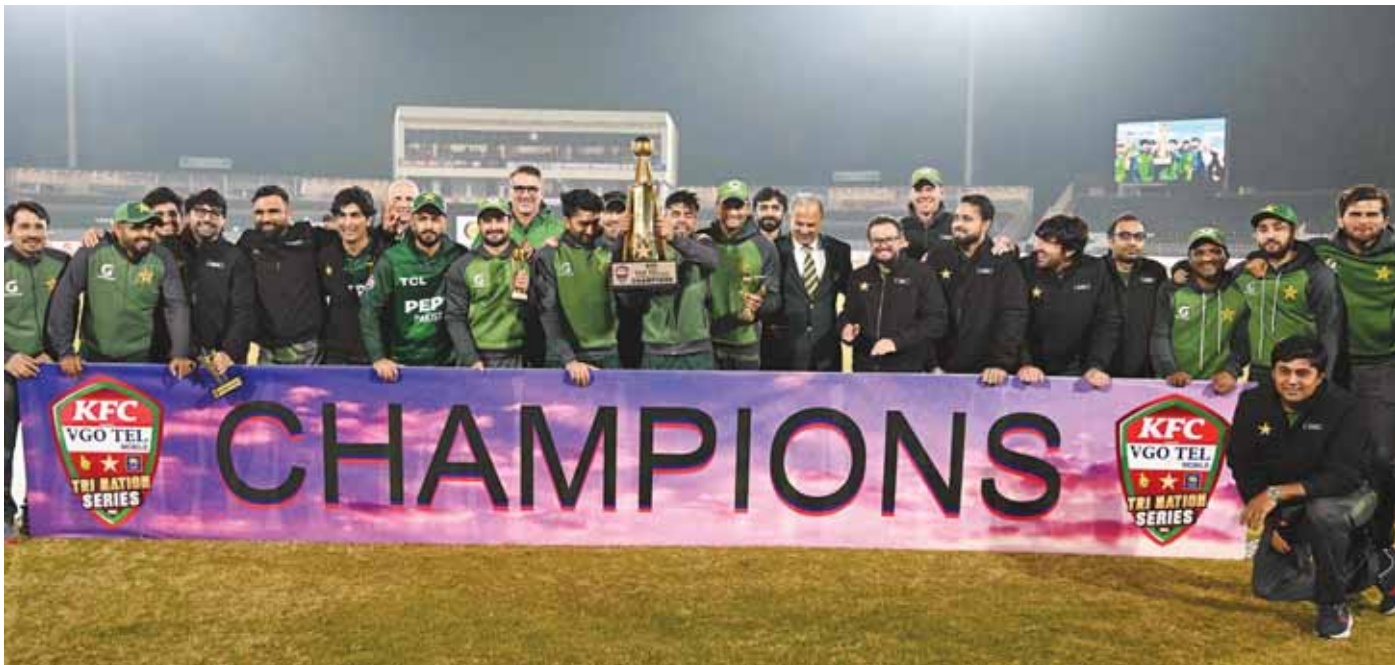
Pakistan's players and team officials pose with trophy at the end of the Twenty20 tri-series final against Sri Lanka at Rawalpindi Cricket Stadium yesterday.

SPINNER NAWAZ, PACER SHAHEEN SPARKLE IN THE FINAL