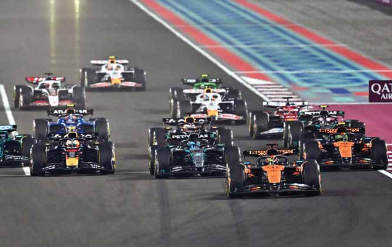
Oscar Piastri leads the field at the start of the sprint race at Lusail International Circuit.

If Norris finishes ahead of Piastri and Verstappen, the Briton will seal his maiden Formula 1 title