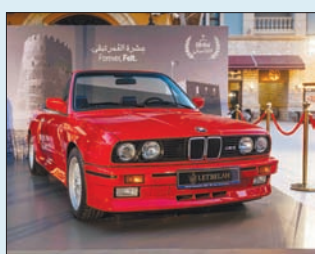
BMW at Qatar Classic Luxury Car Competition and Exhibition 2025.

Automobiles as the Middle East's first Certified BMW Classic Partner. Through exclusive drives, curated exhibitions and educational sessions, the club aims to keep these iconic models on the road, preserve their heritage for future generations and reinforce Qatar's position as a key destination for classic car culture.