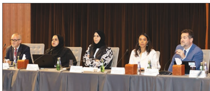
HE Lolwah bint Rashid AlKhater, Minister of Education and Higher Education at the event along with other dignitaries.

It hailed the efforts undertaken by Kuwait in celebrating Kuwait as Arab Media Capital for 2025, calling on the General Secretariat to be provided with a report on the efforts and activities conducted throughout 2025 so that it can be circulated to member states for reference in future experiences. (QNA)