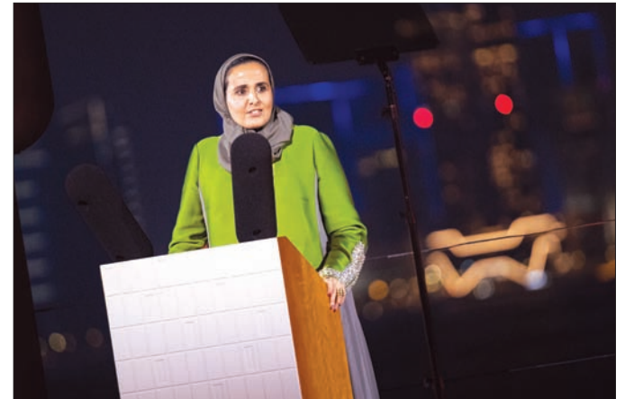
HE Sheikha Al Mayassa bint Hamad bin Khalifa al-Thani at the Franca Fund Gala.

"Tonight's gala underscores our commitment to reimagine healthcare through cutting-edge science, combined with the highest ethical standards, global advocacy, and compassionate