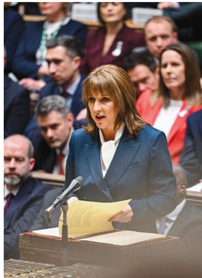
Britain's Chancellor of the Exchequer Rachel Reeves speaking in the House of Commons in London as the government delivered its annual budget.

The government has vowed to use the revenue from oil and gas to raise funds for renewable energy projects. While oil prices have fallen below a government-set