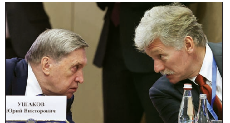
Kremlin aide Yuri Ushakov and Kremlin spokesman Dmitry Peskov talk to each other during a meeting of Russia's President Vladimir Putin and Kyrgyz President Sadyr Japarov at the Yntymak Ordo (Palace of Unity) presidential residence in Bishkek yesterday.

The original plan – drafted without input from Ukraine's European allies – would have seen Kyiv withdraw from its eastern Donetsk region and the United