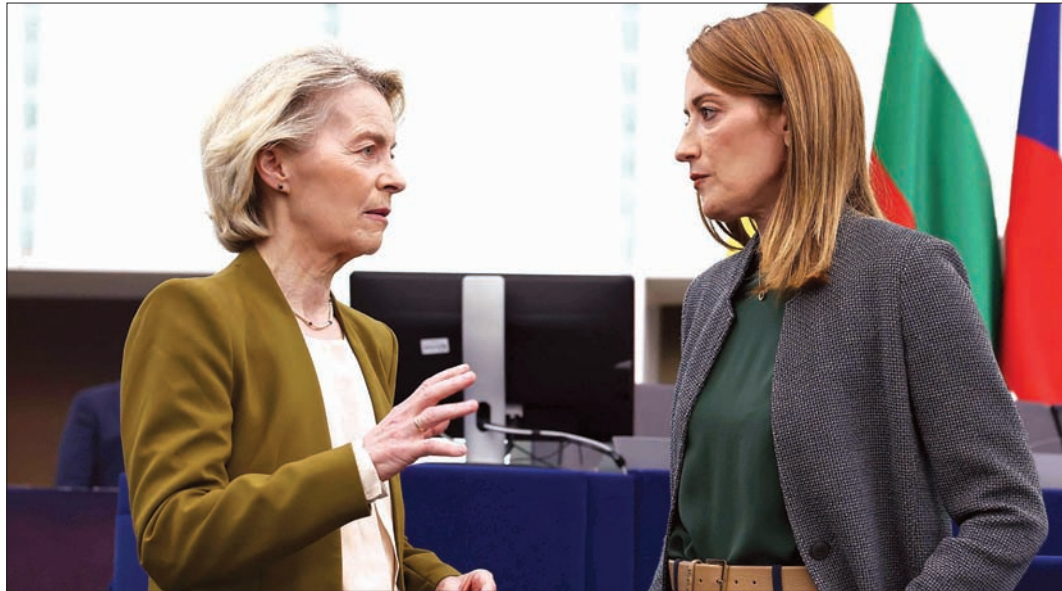
European Commission President Ursula von der Leyen (left) speaks with European Parliament President Roberta Metsola upon her arrival to attend a debate on the EU engagement towards a just and lasting peace for Ukraine during a plenary session at the European Parliament, in Strasbourg, yesterday.

Just in October, the Russians captured about 150sq km there, an area comparable to the size of Paris, according to ISW data.