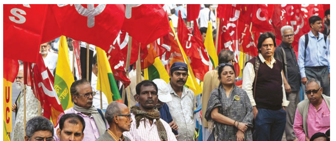
Trade Union members of the Communist Party of India stand beside party flags during a protest against the government's new labour laws in Kolkata yesterday.

While the new regulations boost safety standards and mandate guaranteed social security benefits for gig workers, they also allow for longer factory shifts, make it tougher for workers to conduct strikes and easier for medium-sized firms to fire employees.