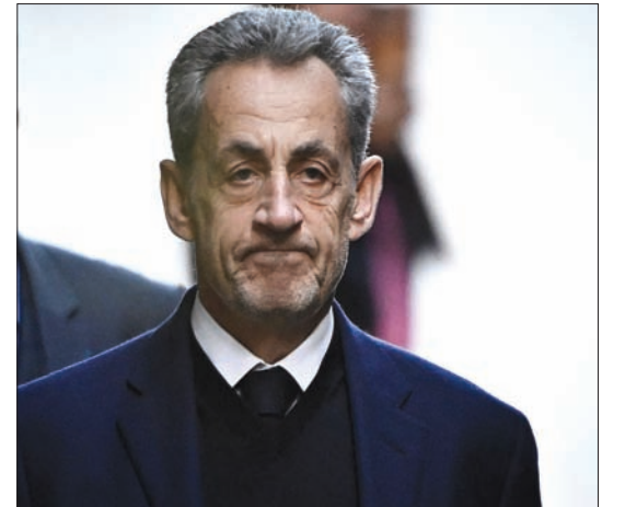
BAD NEWS: Nicolas Sarkozy.

A fortnight after his release, the ex-leader announced he would publish a book next month about his experience of serving three weeks in jail.