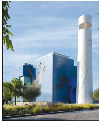
Lawh Wa Qalam: M F Husain Museum.

"The museum reinforces Qatar's role as a regional and global hub for culture and creativity,