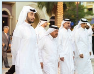
VIPs at the event.