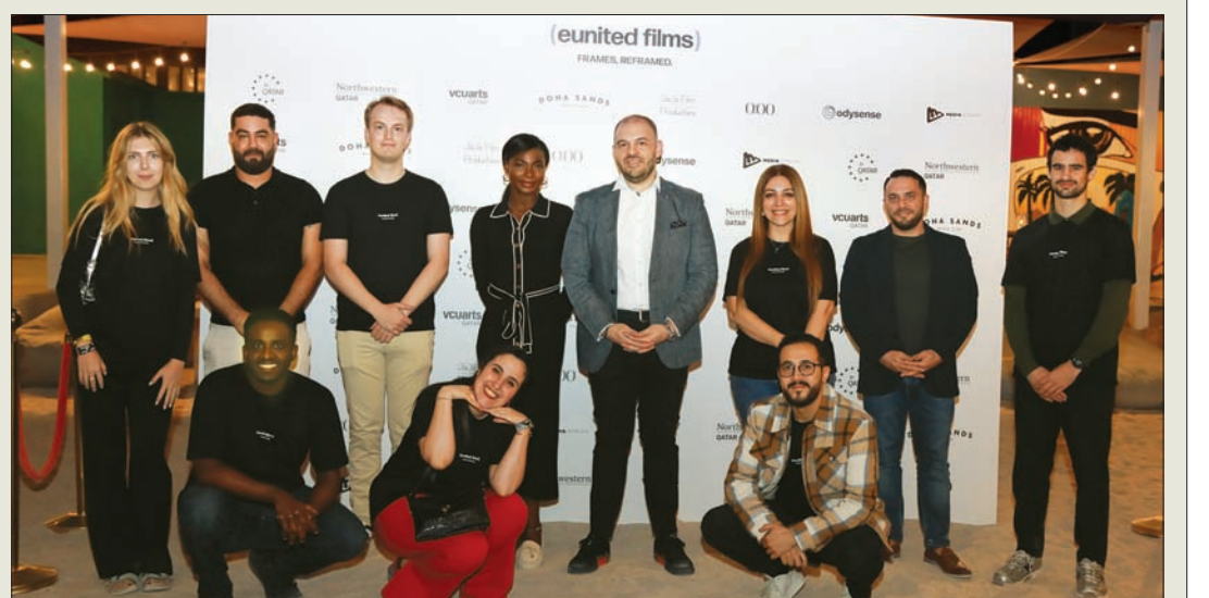
The delegation of the European Union to Qatar concluded the second edition of the EU Youth Short Film Festival on Tuesday, celebrating the power of youth storytelling, cultural dialogue, and creative exchange between Europe and Qatar.