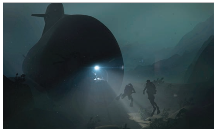
An undated artist's rendition depicts divers and an unmanned vehicle exiting the A26 submarine.