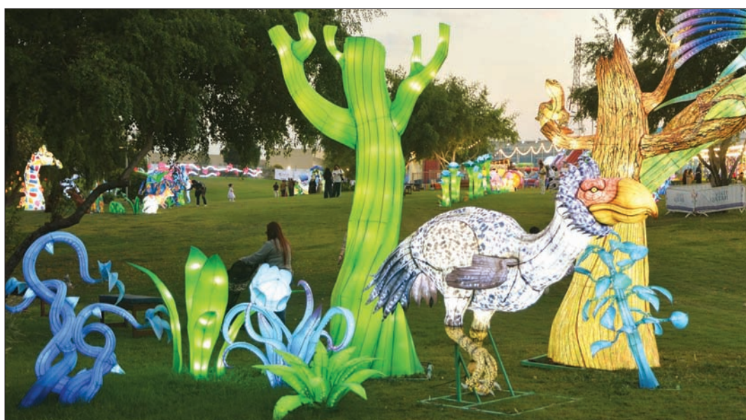
The first Lantern Festival in Qatar is showcasing hundreds of glowing installations and sculptures at Al Bidda Park.

Organisers noted that this large-scale event, running until March 28, is intended to be a warm, family-friendly celebration that