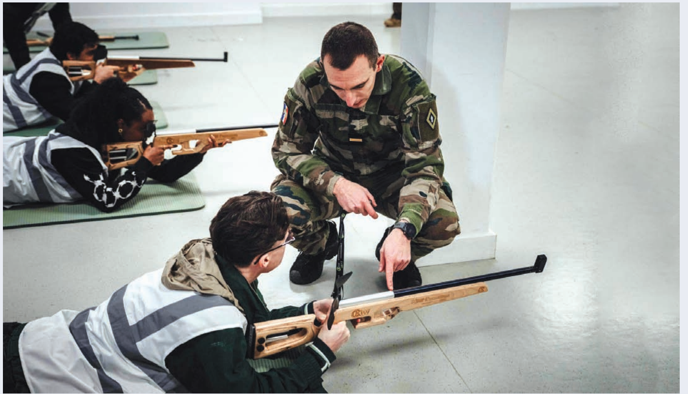
A military instructor provides guidance to participants during a laser shooting training session as part of the Defence and Citizenship Day (JDC) at Fort de Montrouge in Arcueil, south of Paris, yesterday. President Emmanuel Macron is set to announce that France is restoring military service on a voluntary basis in the face of the growing threat posed by Russia, just under three decades after compulsory national service was abolished in the country and replaced by the JDC.