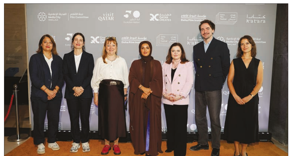
Doha Film Institute empowers creativity through collaboration and continuous learning.

The La Fémis Cinematography Certificate Programme is an intensive four-month training session dedicated to young talent who wish to deepen their artistic and technical understanding of cinematography. Designed with La Fémis and delivered through a clear progression of theory, practical exercises and online and in-person sessions, the programme guides participants towards a strong foundation in the craft of cinematography.