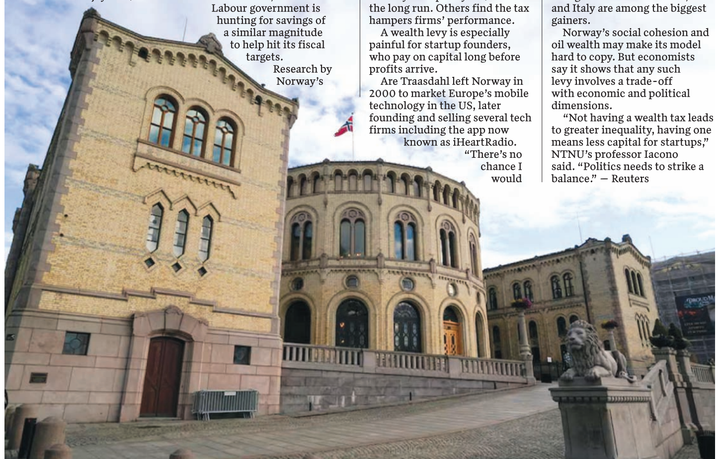
A general view shows Norway's parliament in Oslo. (Reuters)

"Not having a wealth tax leads to greater inequality, having one means less capital for startups," NTNU's professor Iacono said. "Politics needs to strike a balance." — Reuters