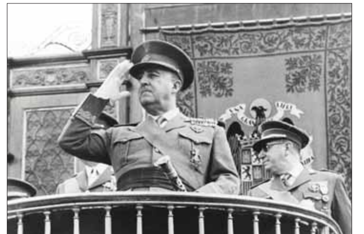
Spanish General Francisco Franco in the 60s.

"Then eventually we want to replace them with Polish products."