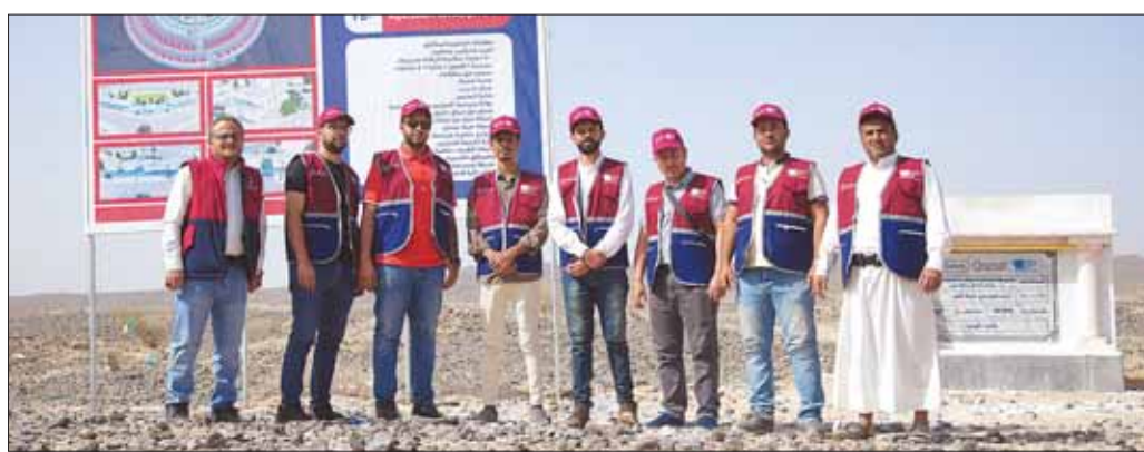
QC builds safe and sustainable housing for internally displaced persons in Yemen's Marib Governorate.

Qatar Charity (QC), in partnership with the Humanitarian Development Programme, is implementing the "Al-Khair Aat City" project in Yemen's Marib Governorate to provide safe, sustainable housing for internally displaced persons (IDPs). According to QC, the project, funded by Qatari donors, aims to replace tents with durable homes and integrated services. About 40% of the work is complete, with full delivery expected by year-end. The city will feature 250 climate-resilient housing units