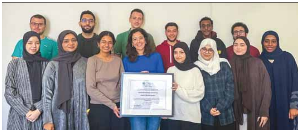
The accreditation brings significant benefits to HBKU and its student support initiatives.

Hamad Bin Khalifa University's (HBKU) Student Success Services unit has been awarded Level 1 and Level 2 certified tutor training programmes by the College Reading and Learning Association (CRLA). With almost 1,300 members and over 2,000 certified training programmes worldwide, CRLA's International Tutor Training Programme Certification licenses projects that have demonstrated excellence in developing, designing, and implementing effective training procedures. The accreditation brings significant benefits to HBKU and its student support initiatives. For student tutors and learning assistants, it provides valuable career development opportunities. The programme teaches skills commensurate with best practices, increases confidence in content areas and public speaking, and strengthens resumes with an internationally recognised certificate. In doing so, the programme sets a benchmark for academic