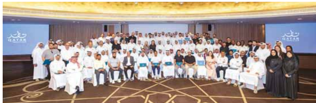
QT honours 180 guides at a recently held ceremony following the completion of the inaugural edition of the Desert Safari Guide Training Programme.

Qatar Tourism (QT) announced the successful completion of the inaugural edition of the Desert Safari Guide Training Programme, honouring 180 guides at a ceremony held on November 13. An additional 50 participants are expected to finalise training in upcoming editions, according to QT. Developed in line with Qatar's commitment to service excellence, the training programme is designed to ensure that every Desert Safari Guide is fully equipped to deliver safe, seamless, and high-quality desert