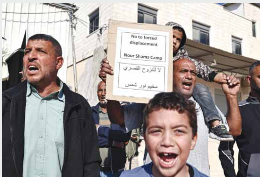
Residents of the Nur Shams refugee camp, near Tulkarem in the occupied West Bank, protest at the entrance of the camp demanding the right to return to their homes, yesterday.