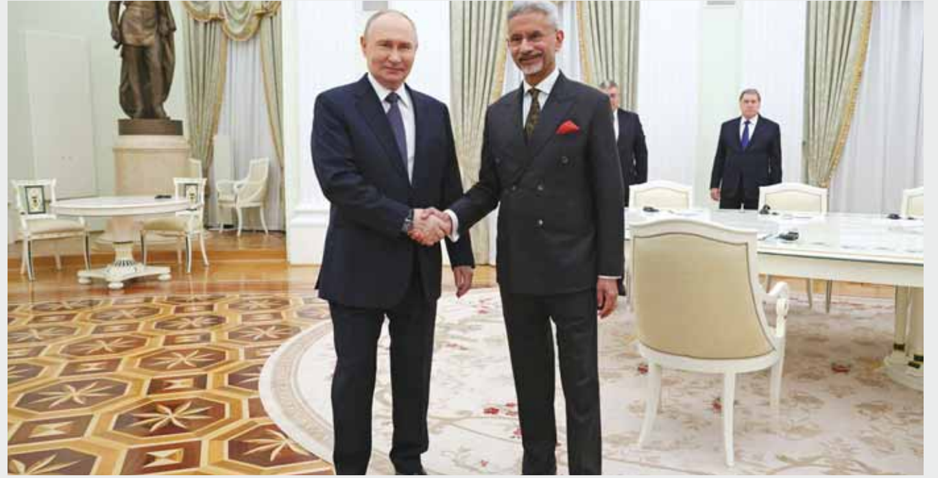
Russian President Vladimir Putin shakes hands with Indian Foreign Minister Subrahmanya Jaishankar during a meeting at the Kremlin in Moscow, Russia, yesterday.