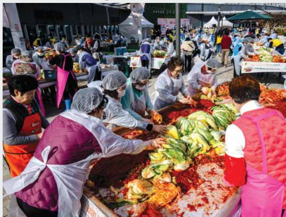
People take part in a kimchi making festival at Garak Market in Seoul, South Korea.