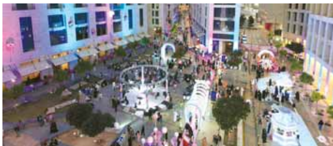
MDD's winter season will offer a citywide programme of entertainment, culture, and family experiences.

Sweet Sikka at Sahat Al Nakheel returns with the much-loved Candy Zone now in its second year. Barahat Msheireb will once again host Baraha Cinema in the latter part of December, offering outdoor screenings, themed dining experiences, and a relaxed winter setting