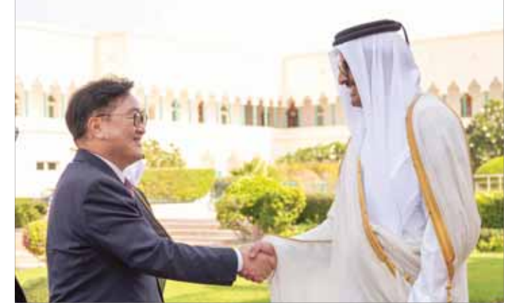
His Highness the Amir Sheikh Tamim bin Hamad al-Thani received yesterday at the Majlis of Sheikh Abdullah bin Jassim in the Amiri Diwan, Speaker of the National Assembly of the Republic of Korea Woo Won-shik and his accompanying delegation on the occasion of his visit to the country. The meeting dealt with discussing bilateral co-operation between the two countries and the means to enhance them, in addition to discussing several regional and international issues of joint interest. The meeting was attended by Speaker of the Shura Council Hassan bin Abdullah al-Ghanem.