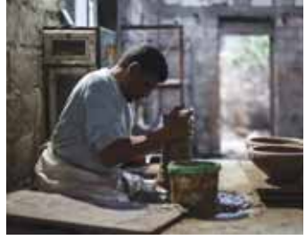
A Palestinian potter at work in Gaza City

T he UN Security Council on Monday voted to adopt a US-drafted resolution endorsing President Donald Trump's plan to end the war in Gaza and authorising an international stabilisation force for the Palestinian enclave. Israel and the Palestinian resistance group Hamas agreed last month to the first phase of Trump's 20-point plan for Gaza - a ceasefire in their two-year war and a hostage-release deal - but the UN resolution is seen as vital to legitimising a transitional governance body and reassuring countries that are considering sending troops to Gaza. The text of the resolution says member states can take part in the Trump-chaired Board of Peace envisioned as a transitional authority that would oversee reconstruction and economic recovery of Gaza. It also authorises the international stabilisation force, which would ensure a process of demilitarising Gaza, including by decommissioning weapons and destroying military infrastructure.