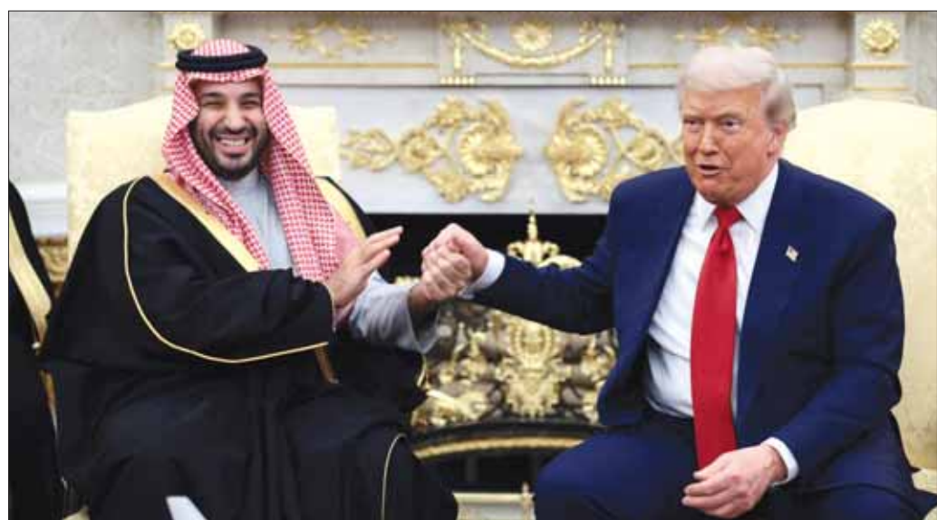
US President Donald Trump and Saudi Crown Prince and Prime Minister Mohammed bin Salman hold hands during a meeting in the Oval Office at the White House in Washington, DC, US, yesterday.