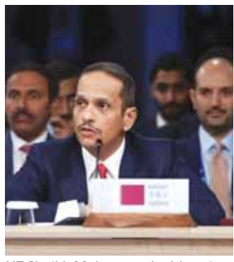
HE Sheikh Mohammed addressing the SCO session.

H E Prime Minister and Minister of Foreign Affairs Sheikh Mohammed bin Abdulrahman bin Jassim al-Thani participated yesterday in the 24th session of the Council of Heads of Government of the Shanghai Co-operation Organisation (SCO), held in the Russian capital, Moscow. In Qatar's address to the meeting, HE Sheikh Mohammed said that Qatar's presence at this constructive international forum reaffirmed its firm commitment to the principles of solidarity and co-operation on which the SCO was founded, and embodied the collective will of member states to enhance consultation and joint action in confronting growing challenges. He noted that over the years, the organisation has proven to be an effective platform for constructive dialogue and fruitful co-operation in the fields of security, economy, and cultural exchange. His Excellency affirmed that Qatar's vision aligns with the principles and objectives of the Shanghai Charter, which call for strengthening mutual trust and mutual benefit, upholding equality and respect for cultural diversity, and working towards shared development. He emphasised that Qatar proceeds from a firm conviction that sustainable development and comprehensive security form the foundation for the prosperity and stability of nations. In this context, HE the Prime