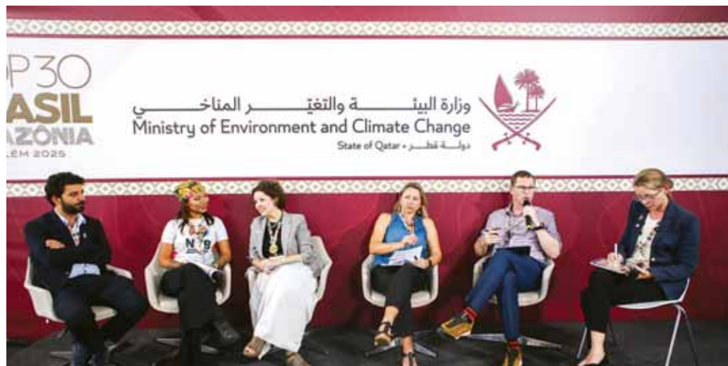
EAA Foundation organised a high-level panel discussion titled "Empowering Youth: Bridging Skills, Employment, and Sustainable Pathways" at COP30.

not only the residents of The Pearl Island but all residents of Qatar, thus contributing to the national development strategy and the country's healthcare system.