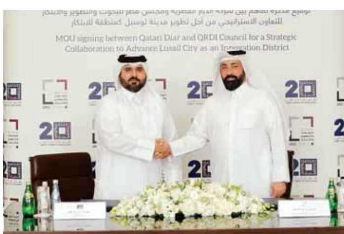
Officials at the MoU signing.

Q atar Research, Development and Innovation (QRDI) Council and Qatari Diar Real Estate Investment Company have signed a memorandum of understanding (MoU) to further enhance Lusail City's position as a leading smart city. Through this collaboration, Lusail will serve as a living innovation testbed, building on its existing smart infrastructure and sustainable urban solutions, to integrate emerging technologies and encourage a thriving ecosystem for research, development, and innovation. The collaboration marks a strategic step in advancing Lusail's position beyond a real estate de-