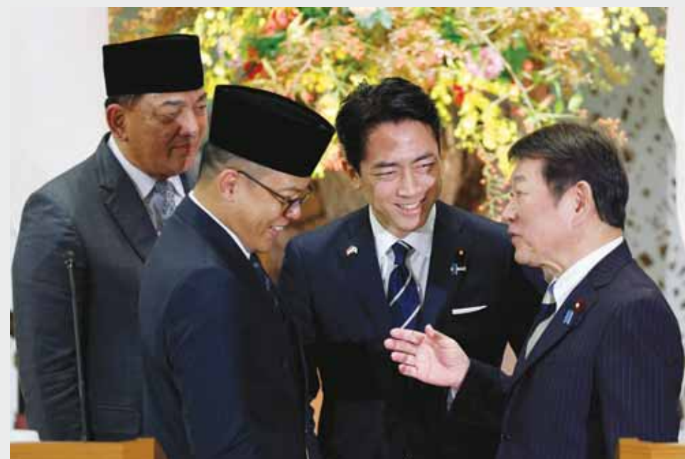
Indonesian Defence Minister Sjafriz Sjamsoeddin and Foreign Minister Sugiono, Japanese Defence Minister Shinjiro Koizumi and Foreign Minister Toshimitsu Motegi get together after their joint press announcement at Iikura Guest House in Tokyo, Japan, yesterday. Japan and Indonesia held a two-plus-two meeting to reaffirm maritime security co-operation.