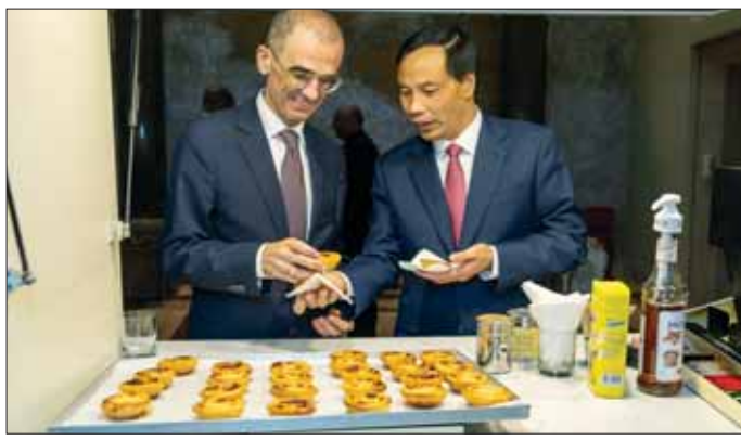
Famous Portuguese dessert 'Pastel de Nata' showcased at the event.

The envoy added that cultural co-operation with Katara helps present a vivid image of Portuguese heritage to the public in Qatar through refined experiences that appeal to discerning tastes and introduce participants to the historical richness of Portuguese cuisine. This event is part of a series of joint initiatives undertaken by Katara in collaboration with embassies accredited to Qatar.