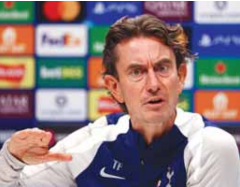
Tottenham Hotspur manager Thomas Frank speaks during a press conference in London.

Lucas Bergvall is set for a spell on the sidelines after suffering concussion in the early stages of the Chelsea game, but Spence and Mohammed Kudus should be fit to feature against Danish champions Copenhagen despite picking up knocks.