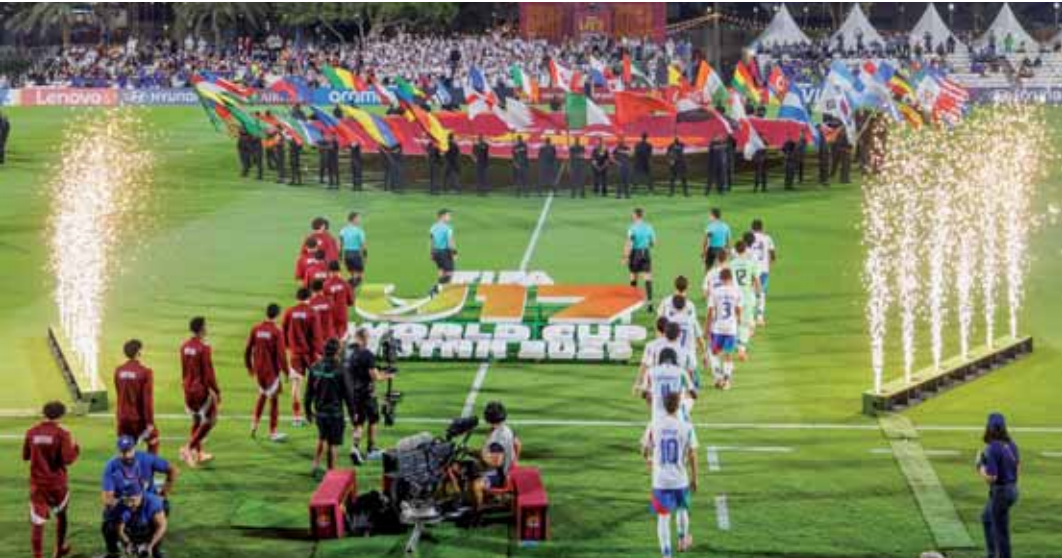
Eight matches were played on the opening day of the FIFA U-17 World Cup at the Aspire Zone pitches.