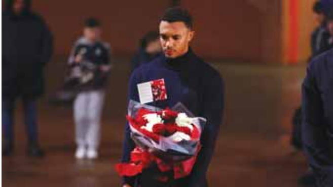
Real Madrid's Trent Alexander-Arnold lays a wreath for Diogo Jota at his memorial outside Anfield yesterday.

Slot confirmed Alisson Becker, Alexander Isak and Jeremie Frimpong are out injured, with only Isak in contention to return to face Manchester City in the Premier League on Sunday.