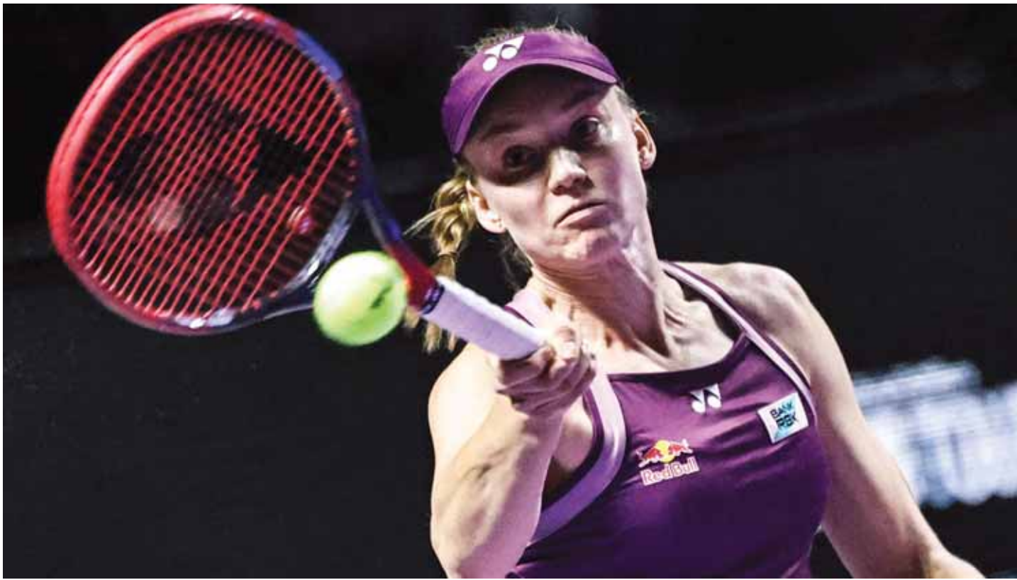
Kazakhstan's Elena Rybakina returns the ball to Poland's Iga Natalia Swiatek during their WTA Finals match in Riyadh yesterday.

Kazakhstani moves top of group after victory over the second seed