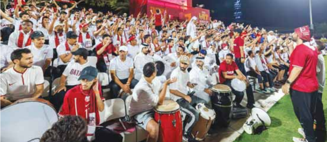
Qatar fans were in full force to support their team against Italy.

Lusail Sports Arena Complex, Al Wusail, Zone No. 70, Zafaran Street No. 1704, Building No. 67 P.O. Box 8708, Doha, Qatar Tel : +974 4437 9885 | Fax : +974 4437 9732 | Email : info@qmmf.com.qa | www.qmmf.com