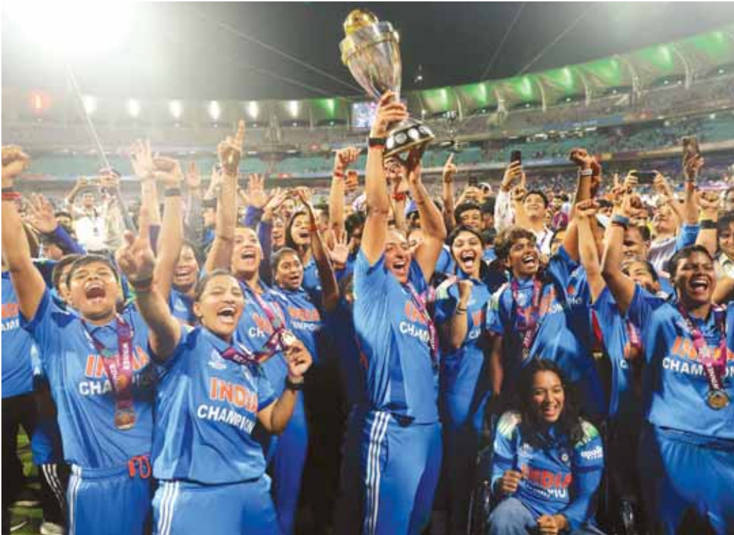
India's Harmanpreet Kaur and teammates celebrate with the trophy after winning the ICC Women's World Cup final against South Africa in D Y Patil Stadium in Navi Mumbai, India.