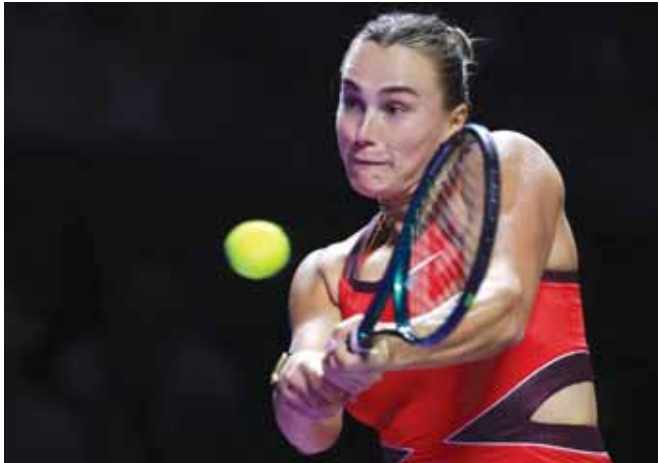
Aryna Sabalenka in action during her round of 16 WTA Finals match against Jasmine Paolini in Riyadh yesterday.

a tough battle, doesn't matter what the score is, I always have to stay focused," said Sabalenka of the eighth-seeded Italian. "I think I'm mostly happy with my focus today. I was calm and it felt like everything was in control." Meanwhile, Mirra Andreeva, who lost her doubles opener alongside Diana Shnaider, said her mysterious absence from the Tokyo was a misjudgement. If she had played she could have secured the eighth and final singles spot in Riyadh this week. Andreeva was leapfrogged by Elena Rybakina at the last hurdle in the Race to Riyadh. She missed out despite winning a pair of 1000-level tournaments and reaching two Grand Slam quarter-finals this campaign. Rybakina came from behind in the standings late in the season, winning Ningbo and reaching the Tokyo semi-finals to punch her ticket to Riyadh. "We just had a talk with our team and we decided to skip the tournament," the 18-year-old Andreeva told AFP yesterday. "In the end, it turned out to be a wrong decision." "I guess with experience we're just learning. This is just my, not even a second full year on the WTA Tour, so I think we're just going to learn from this, we're going to get more experience from this and next time I think we're not going to make that mistake again." Stefanie Graf Group action continues at King Saud University Indoor Arena with defending champion Coco Gauff taking on fellow American Jessica Pegula in the second singles match of the day.