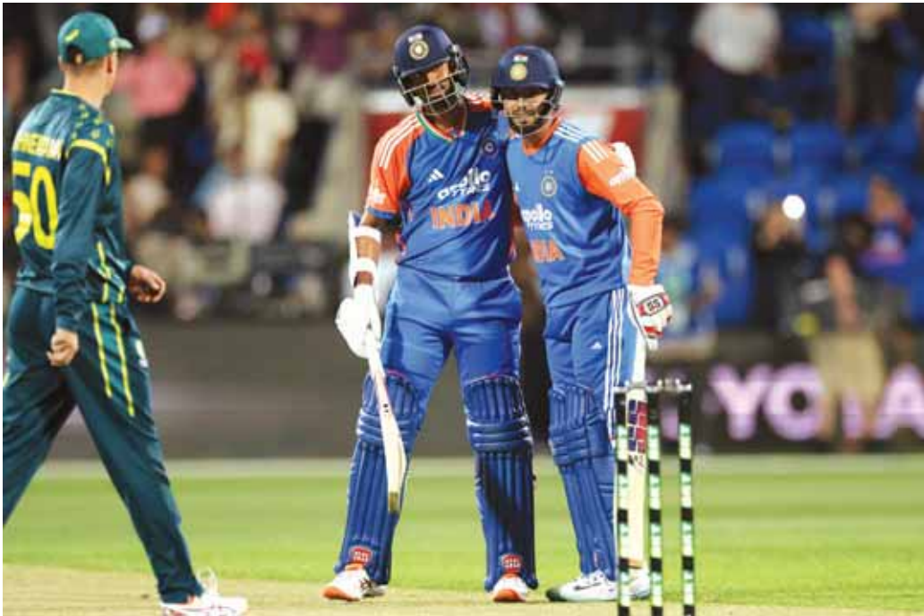
India's Washington Sundar (centre) and Jitesh Sharma celebrate victory in the third Twenty20 international against Australia at Bellerive Oval in Hobart yesterday.

Washington Sundar smashed an unbeaten 49 from 23 balls to drive India to a five-wicket victory over Australia in the third Twenty20 in Hobart yesterday, tying up the five-match series at 1-1 with two games to play. Tim David earlier bludgeoned a spectacular 38-ball 74 and Marcus Stoinis chipped in with a 64 as Australia posted 186-6 in their 20 overs and it was always going to require a disciplined bowling effort to deny India's batsmen. Nathan Ellis bowled well for his three for 36 but Josh Hazlewood was sorely missed after he left the squad to prepare for the Ashes in the wake of his Man of the Match performance in the Melbourne victory on Friday. Hometown seamer Ellis removed Abhishek Sharma (25) and Axar Patel (17) with bouncers and also trapped the other opener, Shubman Gill, in front for 15 but India never really looked under any pressure in the chase. Sundar hit the first of his four sixes from the second ball he faced and enjoyed a stand of 35 with Tilak Varma (29) for the fifth wicket before Jitesh Sharma (22 not out) helped him to get India across the line in a partnership of 34. India, who had the rare experience of winning the toss and chose to bowl first, made three changes to their team from their loss in Melbourne on Friday with returns for Sundar, Jitesh and Arshdeep Singh. "I think it was really important to win the toss, I think it was