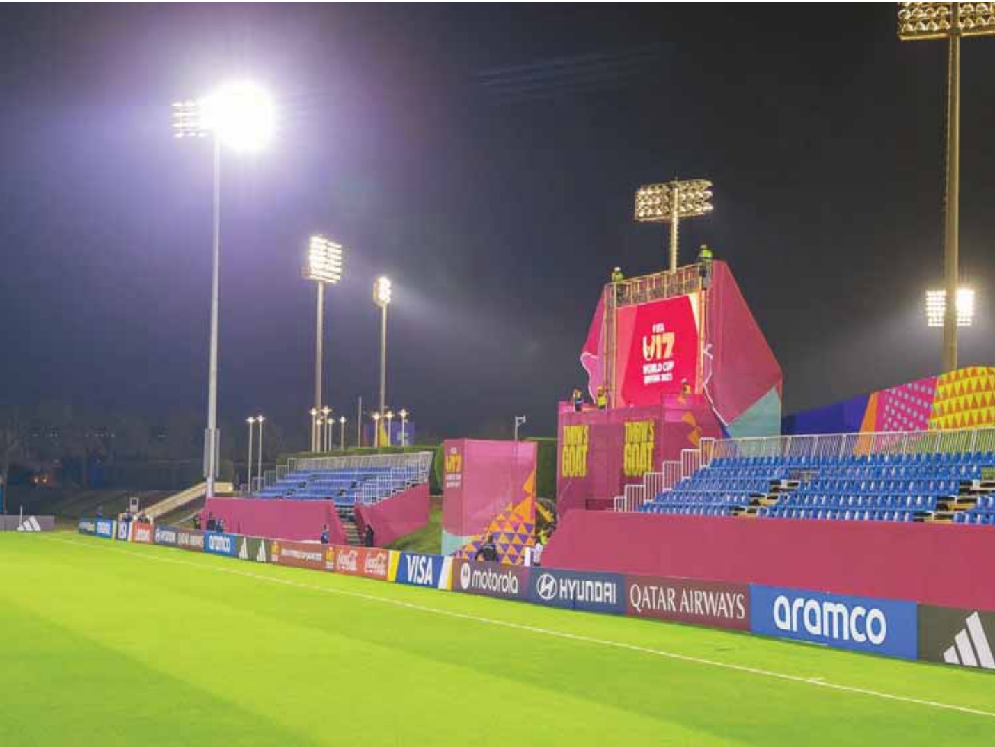
One of the nine football pitches spruced up for the FIFA U17 World Cup Qatar 2025. The 48-team tournament starts today.

"It's lovely to feel excited about doing the right thing and giving players this kind of experience. These types of matches at such