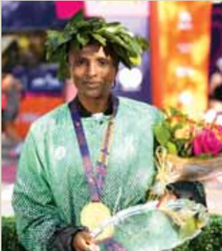
Kenya's Benson Kipruto and Hellen Obiri celebrate after winning the men's and women's elite races at the New York City Marathon yesterday.