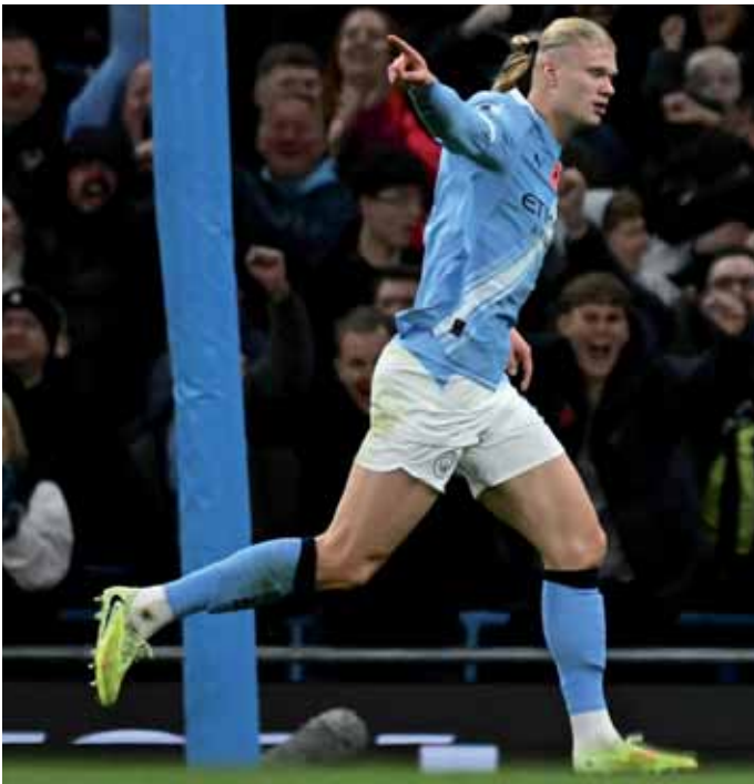
Manchester City's Erling Haaland celebrates after scoring the goal against Bournemouth in Manchester yesterday.

However, their brave high line was exposed on 17 minutes when Cherki's header allowed Haaland to gallop clear from inside his own half to slam past Djordje Petrovic. The visitors levelled eight minutes later when Gianluigi Donnarumma claimed he was impeded as the Italian tried