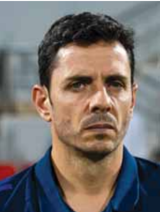
Qatar coach Alvaro Mejia.

The coach added: "The players realise the importance of a strong start in our opening match in the World Cup, and we will play the match with confidence and determination to achieve a positive result that will give us a great morale boost for the rest of the tournament."