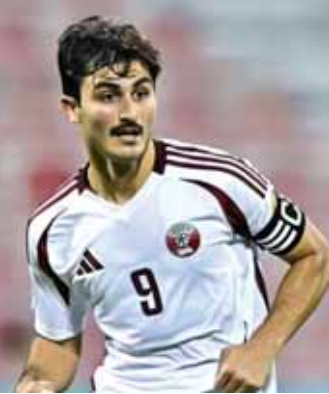
Qatar striker Zaid Faisal.