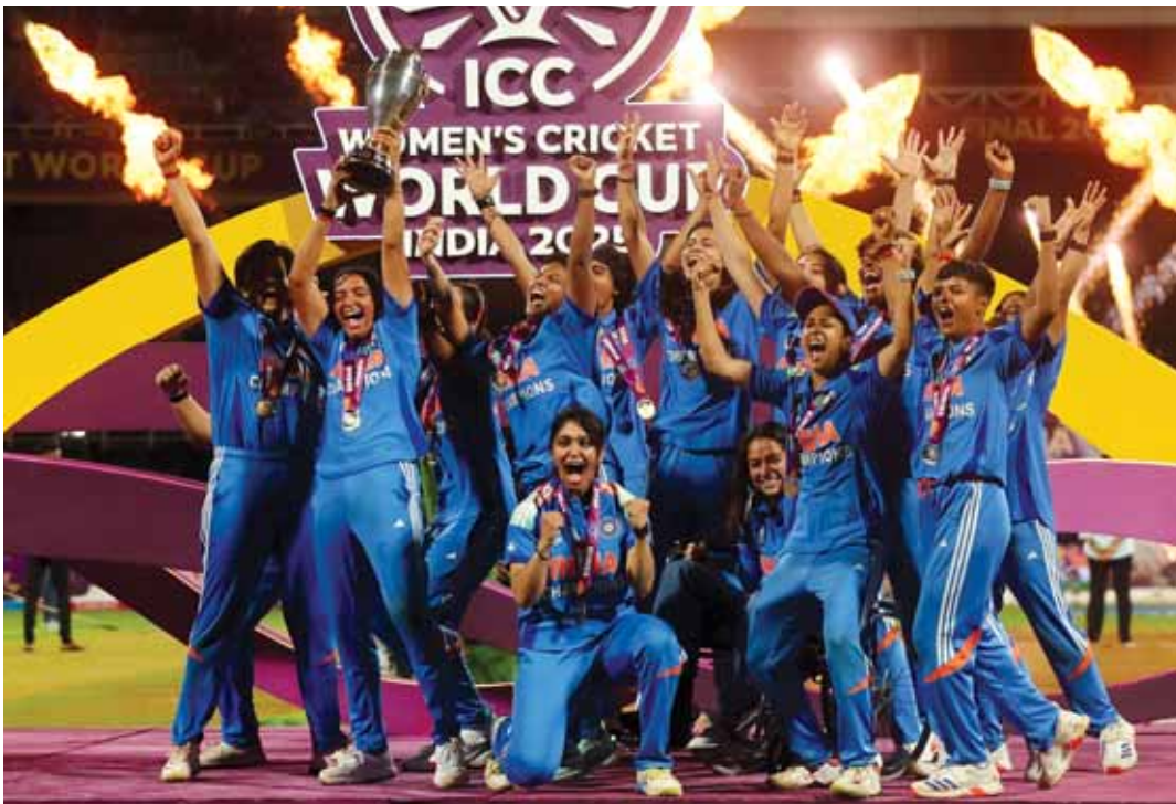
India players celebrate with the trophy after winning the ICC Women's World Cup following their win over South Africa in Navi Mumbai, India, yesterday.

drag themselves back into the contest. Sharma could not be denied her fifty though and Richa Ghosh (34) chipped in with a cameo but India still fell short of the 300-mark. Wolvaardt decided to lead by example when South Africa began their chase. Wolvaardt featured in half-century partnerships with Tazmin Brits and Sune Luus but part-timer Verma produced a two-wicket burst to rock South Africa's tough chase. Wolvaardt took 96 balls to bring up her second hundred in a row but her exit in the 42nd over effectively sealed the match in India's favour. The batter holed out against Sharma and Amanjot Kaur took the catch in her third attempt before being mobbed by her ecstatic teammates. BRIEF SCORES India 298 for 7 (Shafali 87, Deepti 58, Mandhana 45, Ghosh 34, Khaka 3-58) beat South Africa 246 (Wolvaardt 101, Dercksen 35, Deepti 5-39, Shafali 2-36) by 52 runs