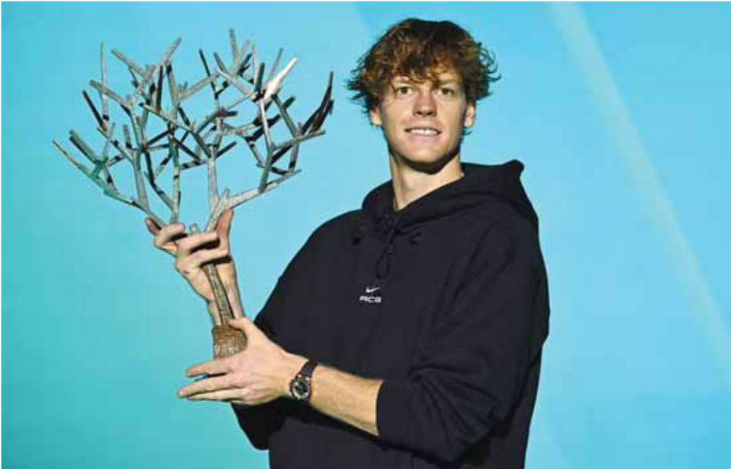
Italy's Jannik Sinner poses with the trophy after winning the Paris Masters yesterday.

final berth for the season-ending tournament as his run to the title-match leapfrogged him ahead of Italy's Lorenzo Musetti in the race to Turin. "It's never easy to lose a final but there's an opponent that I have to congratulate... You push me and all other players to improve," Auger-Aliassime told Sinner. Despite being unable to add a fourth title to his list of achievements so far this season, the 25-year-old has enjoyed a renaissance in 2025 and cemented his place back amongst the world's top 10. "It's been a beautiful year and I'm sure our (his and his team) moment will come," he added. In menacing form after dropping only one game in his semi-final win against third seed Alexander Zverev on Saturday, Sinner