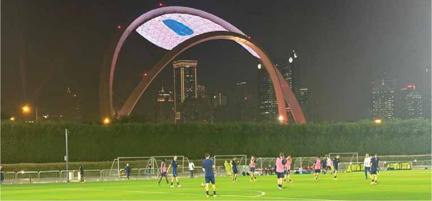
Italy players during a training session in Doha on the eve of their opening match of the FIFA U-17 World Cup against hosts Qatar. (www.figc.it)