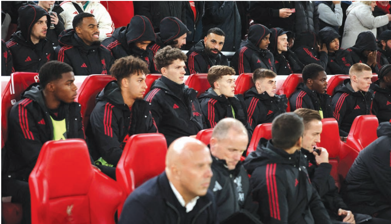
Liverpool have lost their last four league games ahead of Aston Villa's trip to Anfield today and also crashed out of the League Cup to Crystal Palace in midweek.

Arsenal enjoy a four-point lead at the top of the table, but only three points separate second-placed Bournemouth from Villa in eighth. "Apart from Arsenal, I think many teams are in and around the same points, so