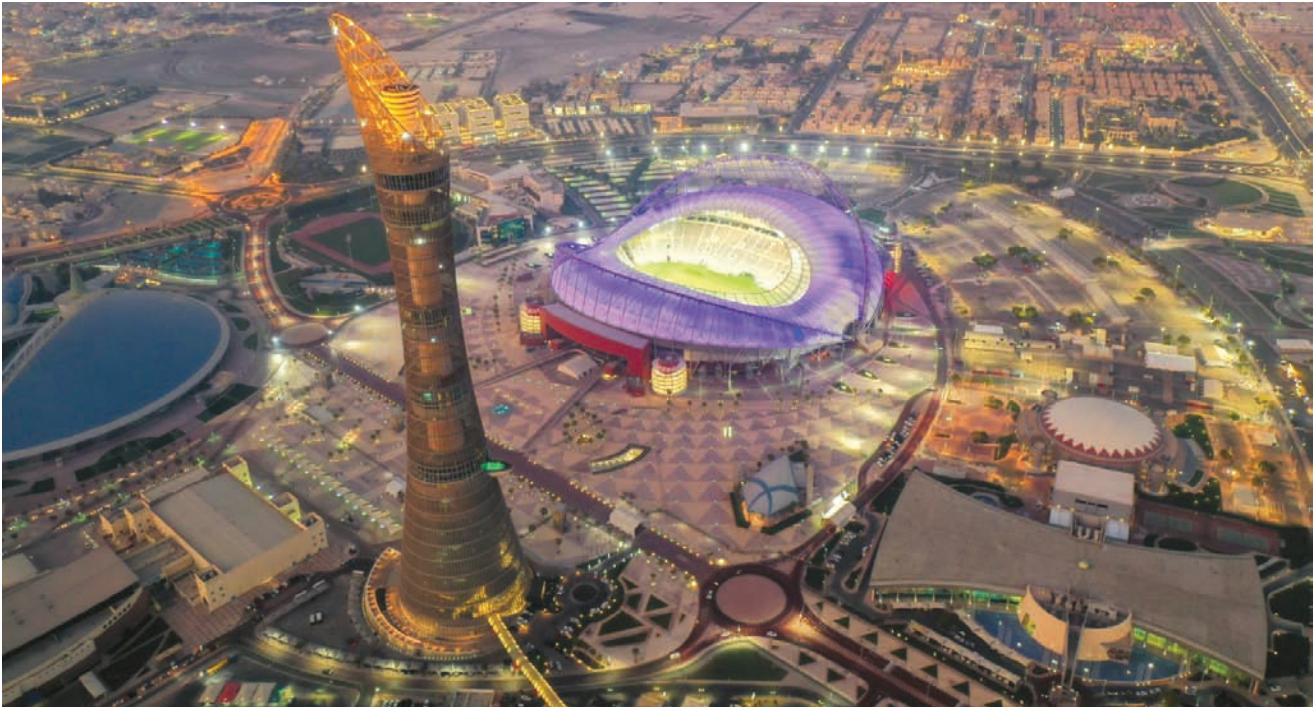
The U-17 World Cup final will take place at Khalifa International Stadium, also located in the Aspire Zone.

1:30pm until the final whistle, the fan zone will offer a family-friendly celebration of football and culture. Young fans can indulge in a variety of gaming activities, including e-sports challenges and a mini football arena. Families will also be regaled by various folkloric and cultural performances, while enjoying food and beverage stations from around the world. A dedicated sensory room will provide an inclusive space for fans with neurodivergent needs. Regarded as the world's most unique sports city, Aspire Zone also features Aspetar, a leading orthopaedic and sports med-