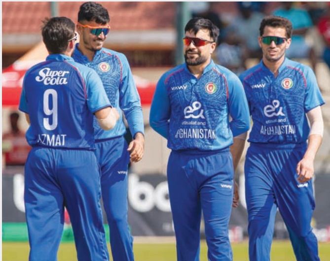
Afghanistan's Rashid Khan (second right) celebrates with teammates after taking a wicket against Zimbabwe during their second T20I in Harare yesterday. Rashid took 3 for 9 as Afghanistan won the match by 7 wickets.