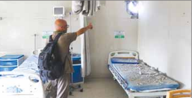
A man gestures as he inspects the damage at The Helou International Specialty Hospital, following an Israeli raid, amid an Israeli military operation, in Gaza City, yesterday.