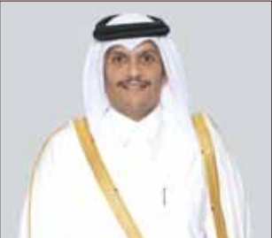
HE Sheikh Mohammed bin Abdulrahman bin Jassim al-Thani

Eight Arab and Muslim nations welcomed Trump's 'sincere efforts' to end the Gaza war in a joint statement yesterday. "The foreign ministers of Qatar, Jordan, the UAE, Indonesia, Pakistan, Türkiye, Saudi Arabia and Egypt welcome President Trump's leadership and his sincere efforts to end the war in Gaza, and assert their confidence in his ability to find a path to peace. They emphasise the importance of the partnership with the US in securing peace in the region. Along these lines, the ministers welcome the announcement by President Trump regarding his proposal to end the war, rebuild Gaza, prevent the displacement of the Palestinian people and advance a comprehensive peace, as well as his announcement that he will not allow the annexation of the West Bank. The ministers affirm their readiness to engage positively and constructively with the US and the parties toward finalising the agreement and ensuring its implementation, in a manner that ensures peace, security, and stability for the peoples of the region. They reaffirm their joint commitment to work with the US to end the war in Gaza through a comprehensive deal that ensures unrestricted delivery of sufficient humanitarian aid to Gaza, no displacement of the Palestinians, the release of hostages, a security mechanism that guarantees the security of all sides, full Israeli withdrawal, rebuilds Gaza and creates a path for a just peace on the basis of the two state solution." (QNA)