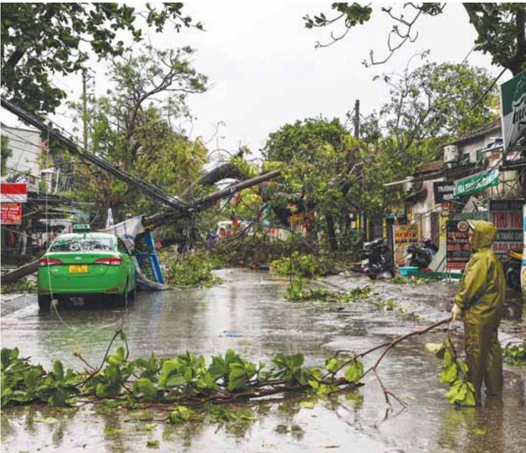
Workers remove fallen trees and electric poles from a road after Typhoon Bualoi makes landfall in Nghe An province, Vietnam, yesterday.

"It aims to create a safe cyber space for the citizens of India by facilitating the removal or disabling of access to any unlawful online information," it says. But X said the portal "enables officers to order content removal based solely on allegations of 'illegality', without judicial review or due process for the speakers, and threatens platforms with criminal liability for non-compliance".