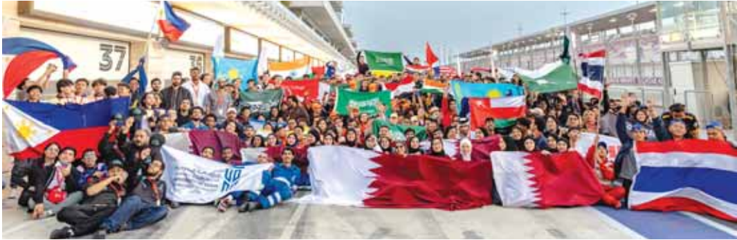
A file picture from Shell Eco-marathon, Asia-Pacific and Middle East, 2025.