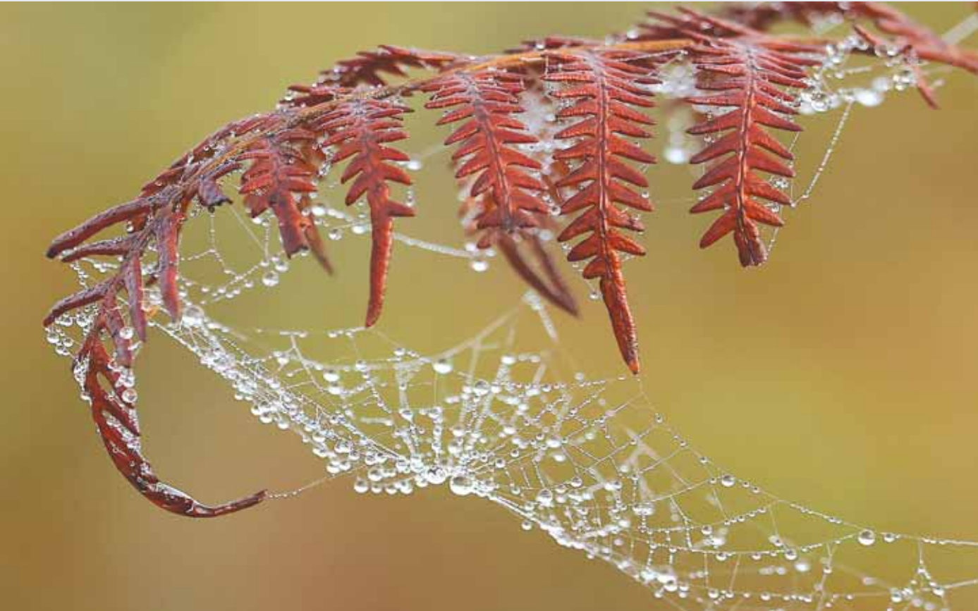
Dewdrops are seen on a spider web during an autumn morning in Richmond Park, London, yesterday.

This year's Nobel Peace Prize will be announced on October 10