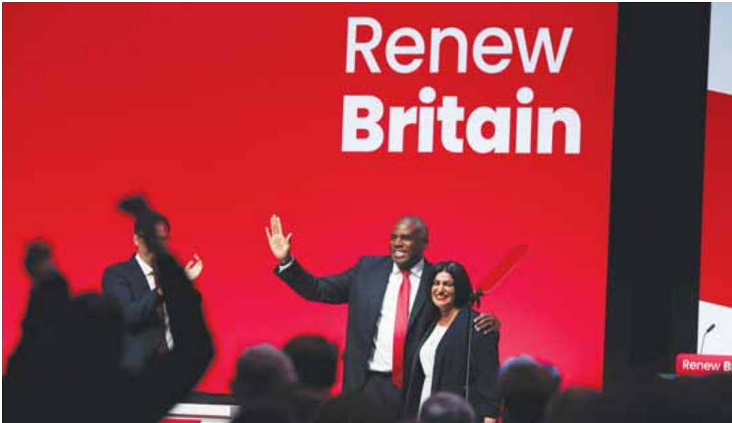
British Deputy Prime Minister David Lammy waves next to Home Secretary Shabana Mahmood at Britain's Labour Party's annual conference in Liverpool, Britain, yesterday.

The finance minister also stressed earlier that she wanted the OBR to shift to providing only one set of budget forecasts a year, rather than a mid-year update as well - which earlier this year required government action to keep government budget goals on track.