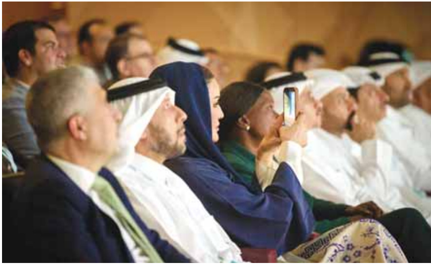
Her Highness Sheikhha Moza is seen at Sidra Medicine's DMT conference.