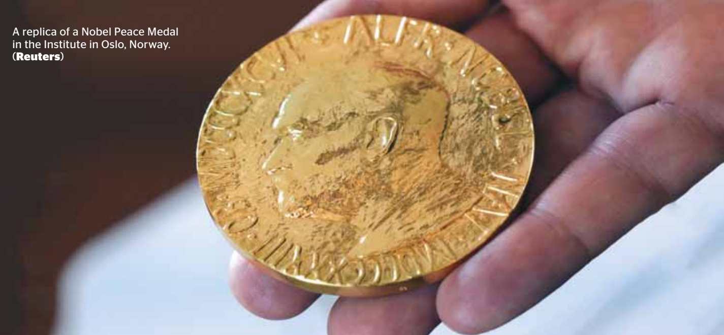
A replica of a Nobel Peace Medal in the Institute in Oslo, Norway.