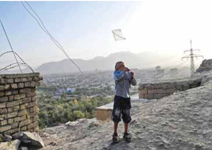
A boy flies a kite in Kabul following a nationwide telecom outage. A huge communications blackout hit Afghanistan yesterday, weeks after Taliban authorities began severing fibre optic connections in multiple provinces.

At the time, AFP correspondents reported the same restrictions in the northern provinces of