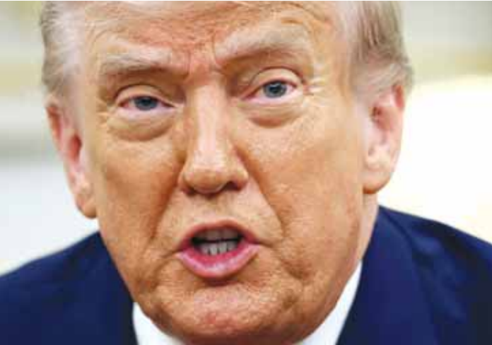
SPOTLIGHT: US President Donald Trump speaks at a meeting in the Oval Office at the White House in Washington, DC, on Thursday.