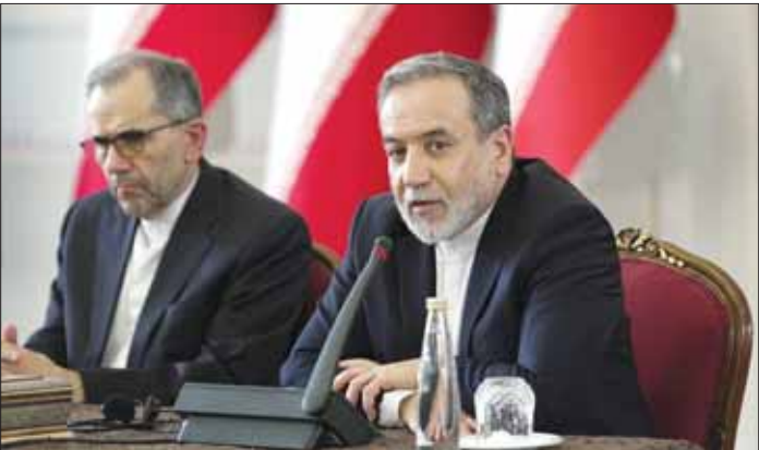
Iranian Foreign Minister Abbas Araghchi speaks during a meeting with foreign ambassadors in Tehran, yesterday.

organisation’s headquarters in Vienna after Tehran suspended co-operation. The talks were aimed at regulating Iran’s nuclear activities in exchange for the lifting of economic sanctions. Before agreeing to any new meeting, “we are examining its timing, its location, its form, its ingredients, the assurances it requires”, said Araghchi, who also serves as Iran’s lead negotiator. He said that any talks would focus only on Iran’s nuclear activities, not its military capabilities. “If negotiations are held... the subject of the negotiations will be only nuclear and creating confidence in Iran’s nuclear programme in return for the lifting of sanctions,” he told diplomats in Tehran. “No other issues will be subject to negotiation,” Araghchi also warned that reimposing UN