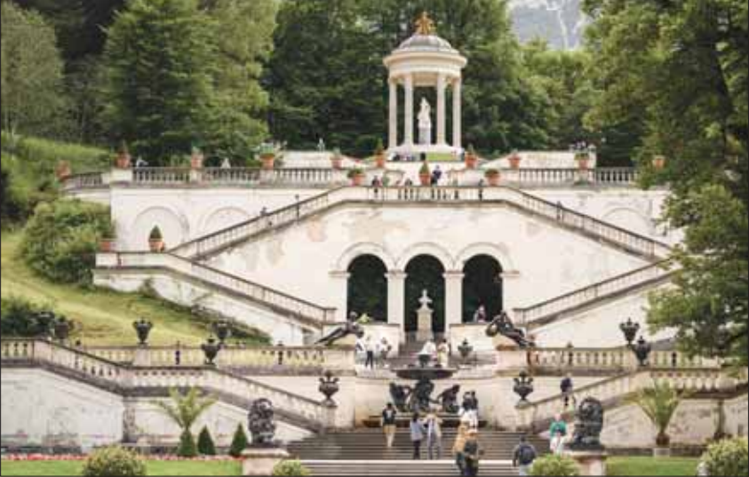
People visiting Linderhof Castle near Oberammergau, southern Germany.