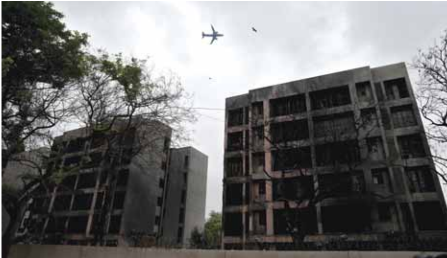
A passenger aircraft flies over a damaged building, at the site in Ahmedabad, India, where an Air India Boeing 787-8 Dreamliner plane crashed soon after takeoff from a nearby airport.