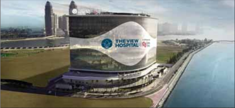
The View Hospital.

The View Hospital, in affiliation with Cedars-Sinai, has become the first hospital in Qatar to offer the 3D CT Gastric Volume Study, an advanced diagnostic imaging service that gives physicians a clearer view of post-surgical anatomy in bariatric patients. The launch of this service marks a milestone not only for the hospital but for the country’s evolving landscape of precision medicine. Designed specifically for individuals who have undergone bariatric procedures, the 3D CT Gastric Volume Study delivers highly detailed, three-dimensional images that accurately assess the size and shape of the remaining stomach. The technology helps clinicians detect structural abnormalities, track patient progress, and anticipate potential complications, all with exceptional accuracy and speed. “For many patients, bariatric surgery is a turning point in their health journey,” said Dr Jassim Fakhro, senior consultant, Metabolic and Bariatric Surgery and medical director of Qatari Physicians at The View Hospital. “But it doesn’t end in the operating room. Ongoing monitoring is key, and with this technology, we can now offer unmatched insight and support as patients work toward a healthier future.” This imaging advancement couldn’t come at a more crucial time. As rates of obesity and metabolic disease rise across the region, bariatric surgery has