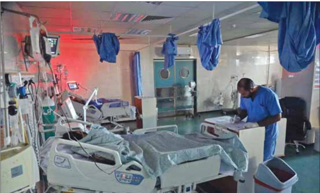
A Palestinian medic works at the intensive care unit of the Nasser hospital in Khan Yunis. Israel’s drastic restrictions on the entry of goods and aid into Gaza has caused shortages of everything, including medicine, medical supplies, and fuel, which hospitals rely on to power their generators.