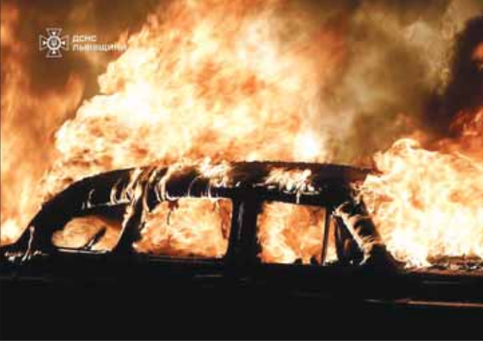
A car burning following mass Russian strikes in the western Ukrainian city of Lviv.

wounded 20 in the southwestern Chernivtsi region, far from the front lines of the east and south. Twelve people were wounded in Lviv, also in the west. In the east, two people died in Dnipropetrovsk and three were wounded in Kharkiv, local authorities said. Russia also “dropped two guided aerial bombs on the homes of civilians” in the northeastern Sumy region killing two, local prosecutor’s office said. “As a result of the enemy attack, a 65-year-old man and his wife were killed. Fourteen residential buildings were destroyed and damaged,” it added. The Russian defence ministry said it had targeted companies in Ukraine’s military-industrial complex in Lviv, Kharkiv and Lutsk and a military aerodrome. US special envoy Keith Kellogg is due tomorrow to begin his latest visit to Ukraine as a Washington-led peace effort flounders. US President Donald Trump