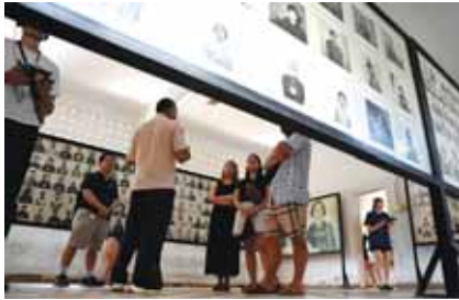
Tourists at the Tuol Sleng Genocide Museum in Phnom Penh.

Three notorious Cambodian torture and execution sites used by the Khmer Rouge regime to perpetrate genocide 50 years ago were inscribed on Unesco’s World Heritage List on Friday. The hardline Maoist group led by Pol Pot reset the calendar to “Year Zero” on April 17, 1975 and emptied cities in a bid to create a pure agrarian society free of class, politics or capital. Around 2mn people died of starvation, forced labour or torture or were slaughtered in mass killings between 1975 and 1979. The Cambodian locations entered into the Unesco register include two prison sites and a “killing field” where thousands were executed. “May this inscription serve as a lasting reminder that peace must always be defended,” Prime Minister Hun Manet said in a video message aired by state-run television TVK. “From the darkest chapters of history, we can draw strength to build a better future for humanity.” Two sites added to the list are in the capital Phnom Penh – the Tuol Sleng Genocide Museum and the Choeung Ek Genocide Centre.