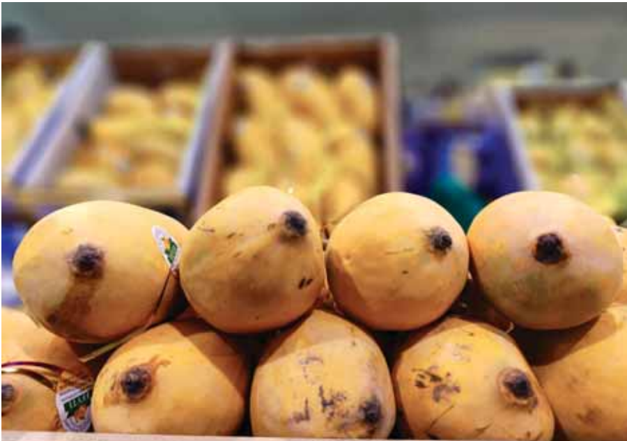
The festival runs until July 19 at Souq Waqif.