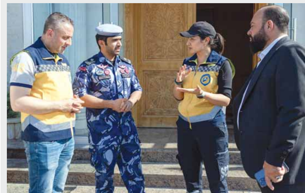
In implementation of the directives of His Highness the Amir Sheikh Tamim bin Hamad al-Thani, a team from the Qatar International Search and Rescue Group of the Internal Security Force (Lekhwiya) arrived at Aleppo International Airport, representing the Standing Committee for Rescue, Relief and Humanitarian Assistance in sisterly and friendly countries. The step comes in the framework of the team's participation in firefighting operations in areas of the Latakia countryside on the Syrian coast, in addition to providing urgent humanitarian aid to help mitigate the effects and repercussions of these fires.