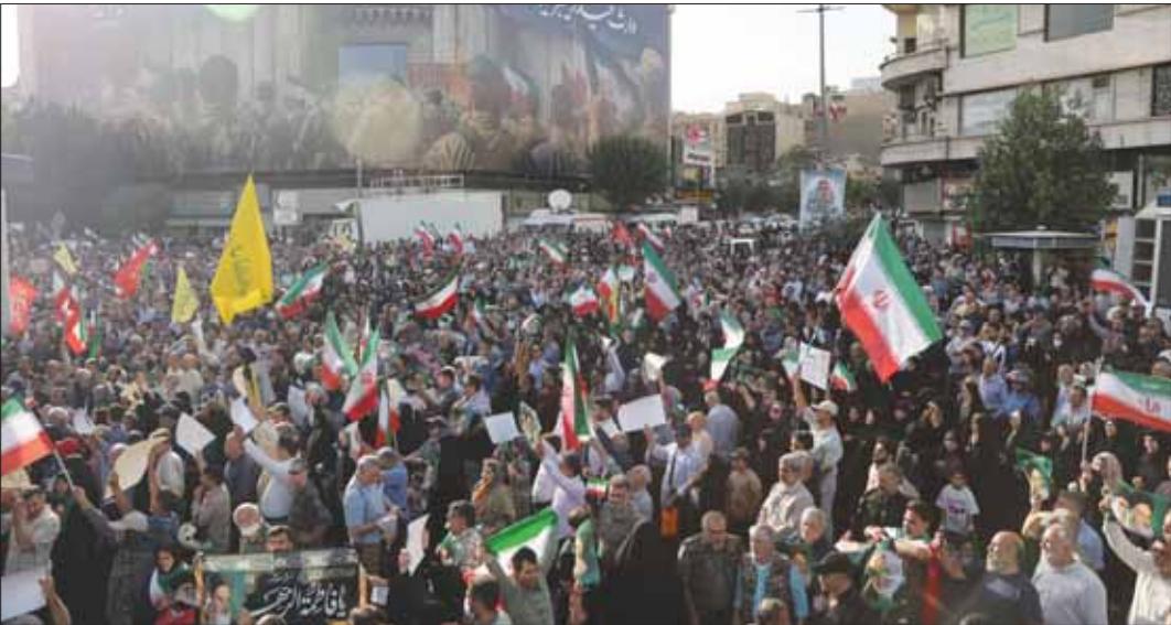
People attend a protest against the US attack on nuclear sites, amid the Iran-Israel conflict, in Tehran, yesterday.

major red line”. Trump would hit back at the American barrage “by all means necessary”, he added. Founded in 1969, the 57-member OIC sees its role as protecting the interests of the Muslim world and increasing Muslim solidarity. Arab countries yesterday strongly condemned the US air strikes on nuclear facilities in Iran, warning of serious repercussions and calling for a return to diplomacy. Saudi Arabia expressed