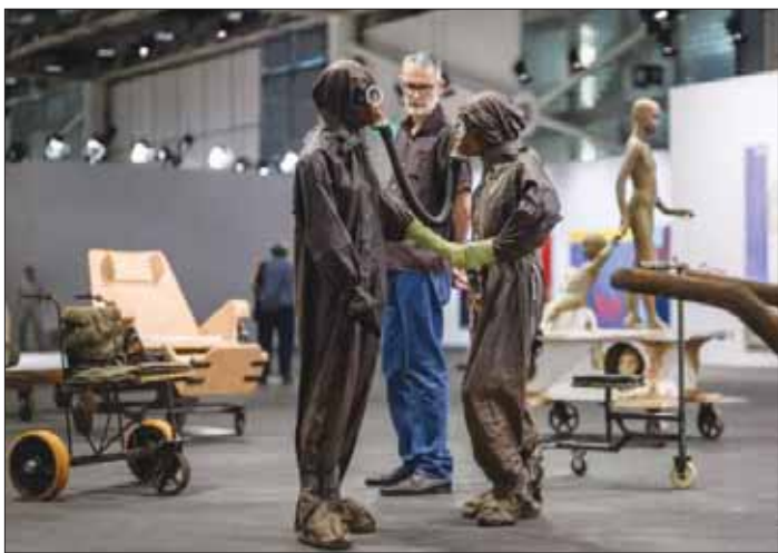
An Art Basel visitor has a close look at part of 'The Voyage — A March To Utopia', by Atelier Van Lieshout.