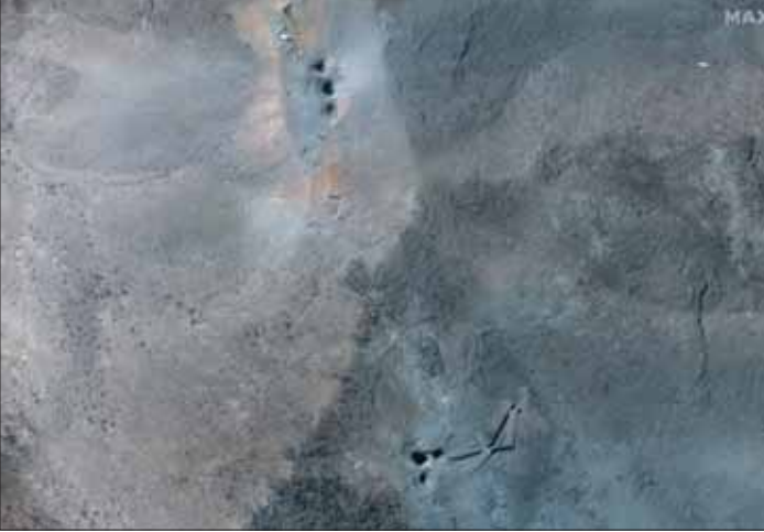
A closer satellite view shows holes and craters on a ridge at Fordow underground complex, after the US struck the underground nuclear facility, near Qom, Iran yesterday.

Speaking in Istanbul, Iranian Foreign Minister Abbas Araqchi said his country would consider all