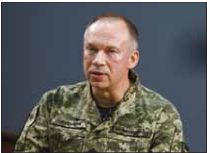
Ukraine's top military commander Oleksandr Syrsky.

advantages in drone warfare, particularly in making fibre-optic drones that are tethered and difficult to jam. "Here, unfortunately, they have an advantage in both the number and range of their use," he said. He also claimed that Ukraine still held 90sq km of territory in Russia's Kursk region, where Kyiv launched an audacious cross-border incursion last August.