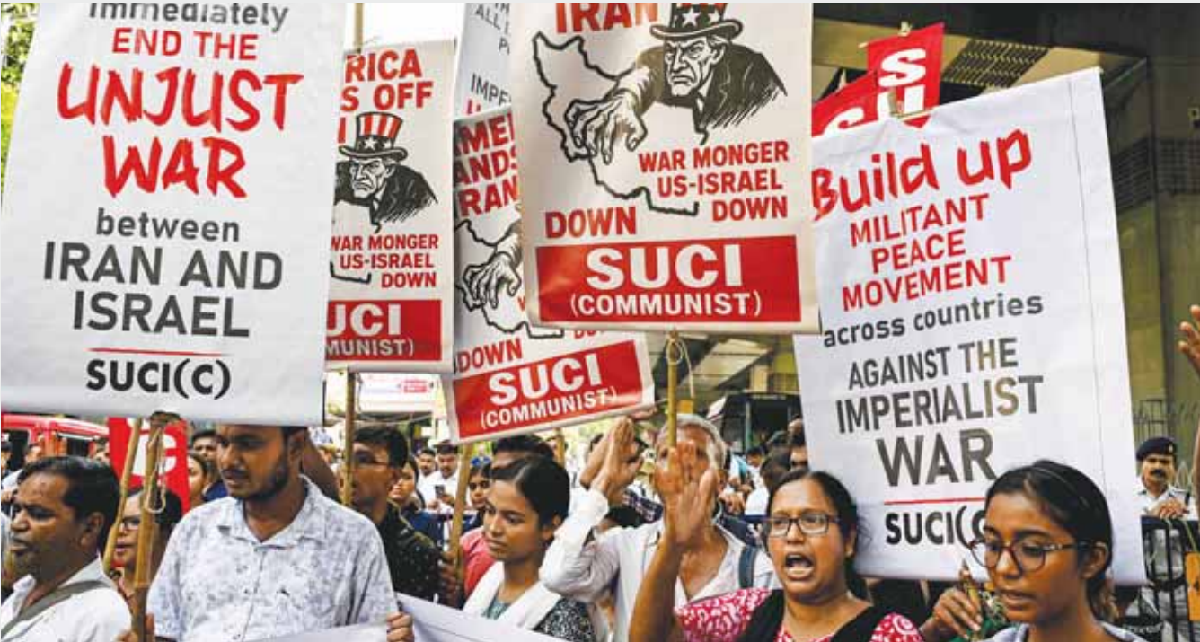
Social Unity Center of India (SUCI) activists carry placards to condemn US strikes on Iran, during a protest in Kolkata, India. The US struck three nuclear sites in Iran on June 22, joining Israel's bombing campaign after days of speculation over US involvement in the Iran-Israel conflict.