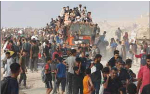
People rush towards a truck carrying aid as it drives along al-Rashid street in western Jabalia yesterday.

Five Palestinians were martyred and several others injured, including a young boy and girl, as Israeli occupation warplanes carried out multiple air strikes yesterday targeting different areas in the central and northern parts of Gaza Strip. In another strike, Israeli warplanes targeted a public kitchen ("Takiya") where hundreds of civilians had gathered in Al-Mawasi area west of Khan Younis, in southern Gaza, resulting in multiple civilian injuries.