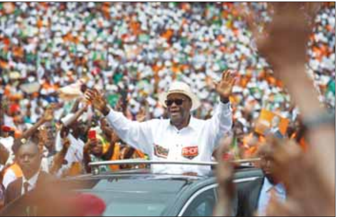
Ivory Coast President Alassane Ouattara gestures as he arrives to attend the congress of the ruling party RHDP, ahead of the October presidential election at Alassane Ouattara Olympic Stadium of Ebimpe, in Anyama, yesterday.

and the pitch. “I feel the strength and sincerity of your call, I cannot ignore these appeals, I have heard them well, and I say with emotion, yes I have heard you,” he added. Ouattara, 83, who has led Ivory Coast since 2011, was officially nominated on Saturday by the ruling Rally of Houphouetists for Democracy and Peace (RHDP), but he has yet to confirm whether he will seek a fourth term. His nomination comes after weeks of rising political tensions triggered by the courts’ barring of several opposition politicians from the October 25 election. Critics of Ouattara accuse him of tightening his grip on power and strongly oppose the prospect of him running again. The opposition has accused the authorities of choosing their opponents by legal means, but the government insists the judiciary acts independently.