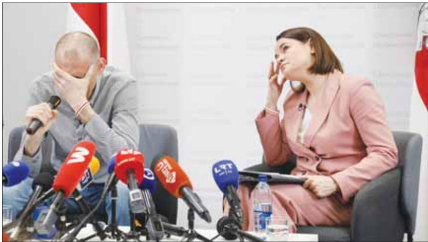
Teary eyed exiled Belarusian opposition leader Svetlana Tikhanovskaya (right) and her husband Sergei Tikhanovsky, Belarusian opposition activist, released from a Belarusian prison, during a press conference in Vilnius, Lithuania, yesterday.

The popular YouTuber had planned to run against Lukashenko in the August 2020 presidential election, but was arrested and detained weeks before the vote. A charismatic activist, Tikhanovsky drew the ire of authorities for his campaign slogan, "Stop the cockroach", a reference to Lukashenko.