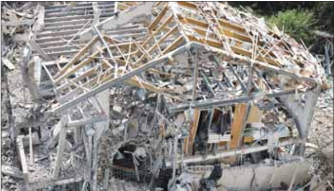
This picture shows a destroyed house at the site of an Iranian strike that hit a residential neighbourhood in the Ramat Aviv area in Tel Aviv, Israel, yesterday.

A senior Russian official said yesterday that US President Donald Trump had started a new war by attacking Iran that would only strengthen Tehran’s leaders by consolidating society around Supreme Leader Ali Khamenei. The Kremlin, which has a strategic partnership with Iran and also maintains close links to Israel, had repeatedly cautioned Washington that US strikes on Iran would plunge the entire region into the “abyss”. “Trump, who came in as a peacemaker president, has started a new war for the US”, said Dmitry Medvedev, the deputy chairman of Russia’s Security Council, adding that “with this kind of success, Trump won’t win the Nobel Peace Prize”. “Iran’s political regime has been preserved, and it is highly