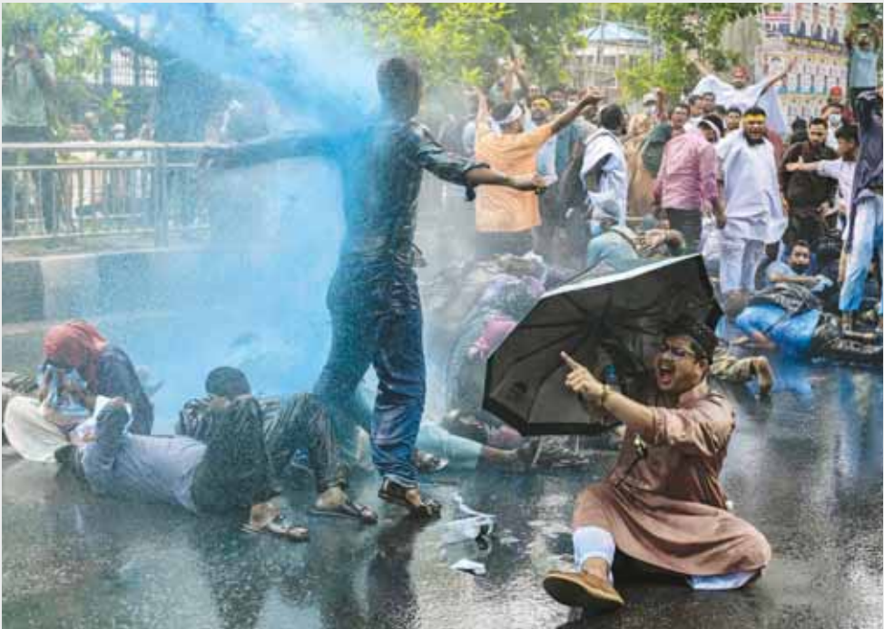
Bangladesh's police personnel use a water cannon to disperse demonstrators in Dhaka yesterday, during a protest by candidates of the 18th Non-Government Teachers' Registration Examination demanding a review of their viva results.