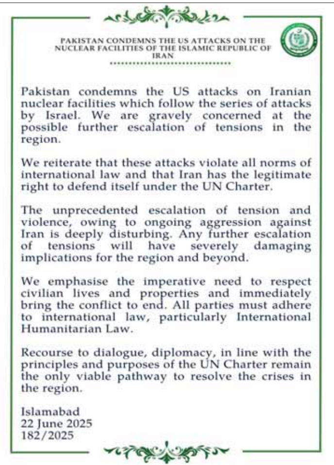
A screenshot of the official note.

Pakistan's information minister and the foreign ministry did not respond to requests for comment on the apparent contradiction in the country's positions over the week-end. In Pakistan's biggest city, Karachi, thousands marched in protest against the US and Israeli strikes on Iran. A large American flag with a picture of Trump on it was placed