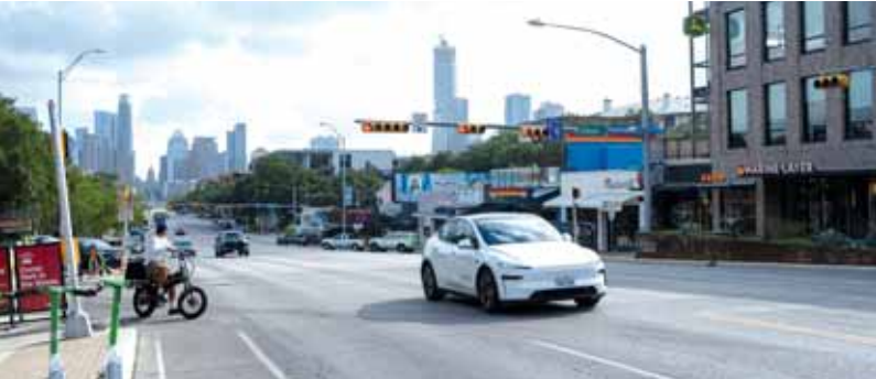
A Tesla robotaxi is seen on South Congress Avenue in Austin, Texas.

comment. The governor’s office declined to comment.