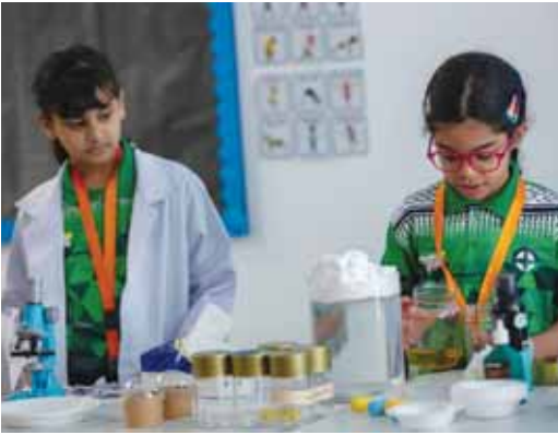
This year’s programmes include: Leadership Camp (Boys): July 5-10, Leadership Camp (Girls): July 20-24, Sports Camp (Girls and Boys): July 6-17, Quantum Computing

Camp: July 6-10, Cybersecurity Camp: July 13-17, Business Camp: July 20-24, Skills Camp (Boys, 7-13 years): July 27-Aug 11, Skills Camp (Girls, 7-13 years): July 27-Aug 11, Skills Camp (Boys and Girls, 5-6 years): July 27-Aug 11, Kafo Summer Program (Boys): July 5-21 and Kafo Summer Programme (Girls): July 6-22. Mukhayamna’s sports camp offers activities such as padel, swimming, and spinning, giving students the opportunity to build their physical fitness while also learning about the importance of teamwork through friendly competition; while its quantum computing and cybersecurity programmes teach basic principles as well as providing participants with hands-on exposure to technology