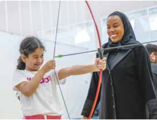
Mukhayamna’s 2025 edition will also see the introduction of a new programme called ‘Kafo’, which will take place at QF’s Qatar Academy Al Wakra and combine learning opportunities in life skills, sports, and leadership development, all rooted in nurturing Islamic values and positive behaviours.

Qatar Foundation (QF) announced the launch of the new edition of Mukhayamna summer camp, which is organised by QF’s Pre-University Education from July 5 to Aug 11. In a press release, QF said: Students from schools across Qatar are being given the opportunity to learn, explore, create, and have fun across the summer — as the return of Qatar Foundation’s Mukhayamna summer camp takes education beyond the classroom. The annual camp at Education City will offer young learners the chance to develop their skills in areas ranging from sports and computing to business and leadership, as its wide range of activities and experiences unfold from July 5 to Aug 11.