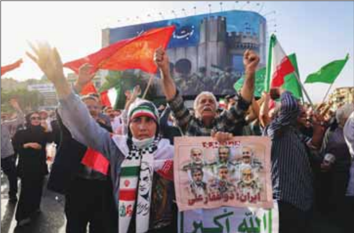
Iranians lift flags and placards during a rally protesting the US attack on Iran in Enghelab Square in Tehran, yesterday.

Foreign ministers from countries of the Organisation of Islamic Co-operation (OIC) yesterday urged Israel to end its “aggression” towards Iran, without mentioning the US strikes on the Islamic republic’s nuclear sites. Israel and Iran have been at war since June 13 when Israel, claiming Tehran was on the verge of acquiring a nuclear bomb, launched a wave of devastating air strikes, killing top army commanders and scientists. Iran immediately retaliated, and the two sides have been trading barrages since. The ministers “condemn firmly the aggression of Israel against the Islamic Republic of Iran, stress the urgent need to stop Israeli attacks and their great concern regarding this dangerous escalation”, said an OIC statement. It was published at the end of a OIC meeting in Istanbul this weekend. It made no direct reference to the US bombardment of Iran’s key nuclear facilities early yesterday, after President Donald Trump