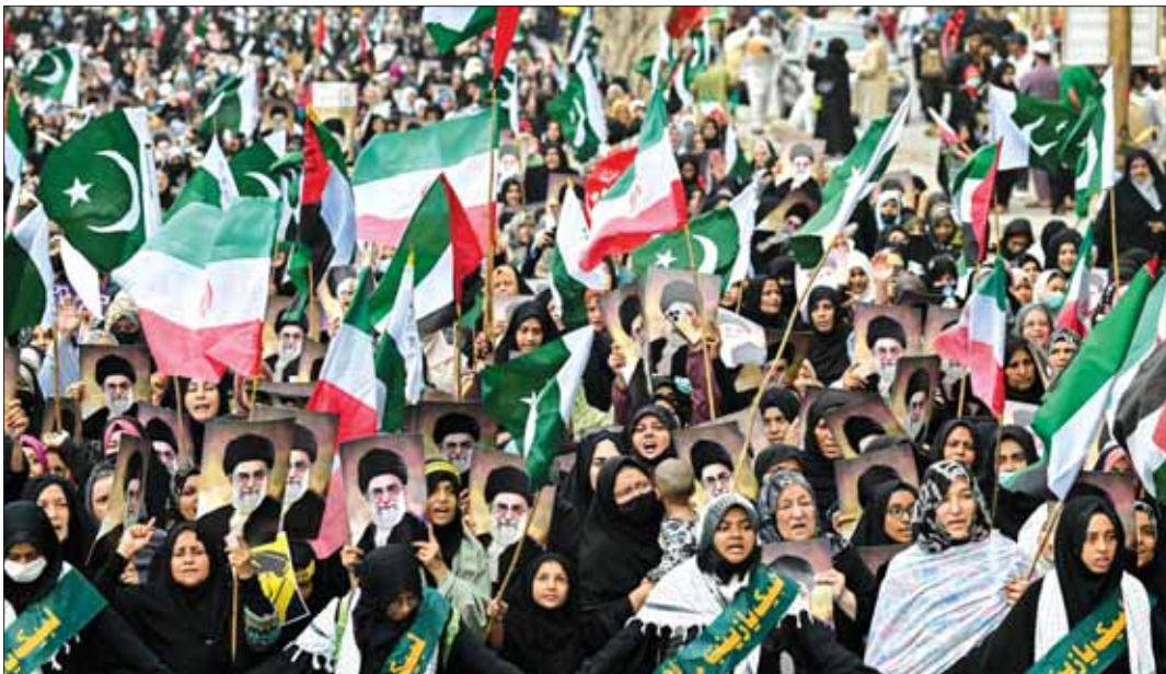
Protesters holding portraits of Iran's Supreme leader Ayatollah Ali Khamenei to condemn US and Israel's attacks on Iran in Karachi yesterday.

on the road for demonstrators to walk over.