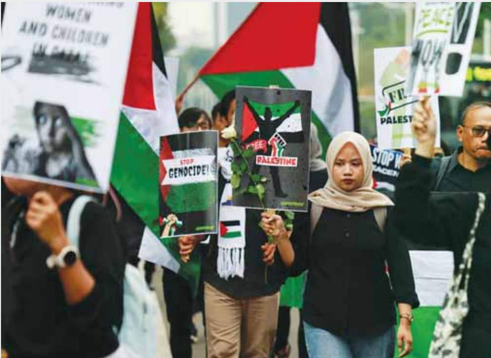
Activists carry placards and Palestinian flags during a protest against Israel and in support of Palestinians in Gaza, outside the US embassy in Jakarta, Indonesia, yesterday.