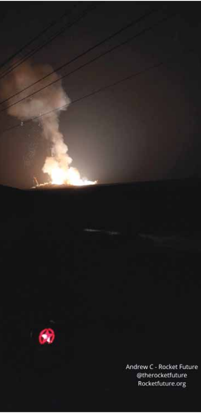
Flames rise as a SpaceX rocket explodes in Brownsville, Texas in this screengrab obtained from a social media video.

The Federal Aviation Administration (FAA) approved an increase in annual Starship rocket launches from five to 25 in early May, stating that the increased frequency would not adversely