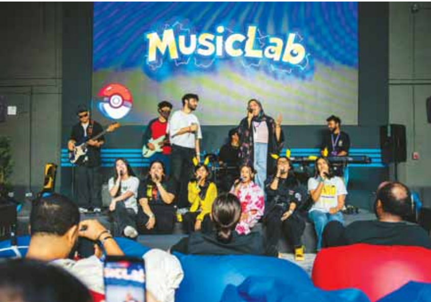
Geekend cemented its ongoing support for local artists and vendors in attendance.