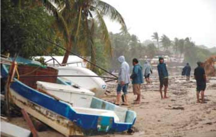
People assess damage on the beach after hurricane Erick made landfall on the Pacific coast, in Mexico's Puerto Escondido, Mexico.