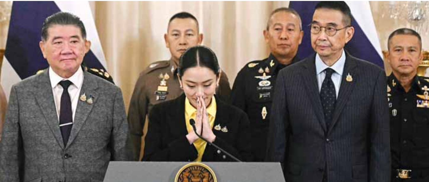
Thailand's Prime Minister Paetongtarn Shinawatra (centre) gestures at a press conference next to Deputy Prime Minister and Defence Minister Phumtham Wechayachai (left), Foreign Minister Maris Sangiampongsa (second right), Armed Forces Commander Pana Klaewplodthuk (third right), chief of the defence forces Songwit Noonpackdee (right), and commissioner-general of the Royal Thai Police Kitrat Phanphet (centre left) at Government House in Bangkok yesterday.

Singapore in March charged three men with fraud in cases reportedly linked to the transfer of AI-powered Nvidia chips to China. The Singaporean government said servers potentially containing AI-powering Nvidia chips shipped from the US to Singapore had ended up in Malaysia, but that their final destination was unknown. Local media linked their cases to the alleged movement of Nvidia chips from Singapore for use by Chinese AI firm DeepSeek. In January, DeepSeek released its R1 chatbot, shaking the global tech market and claiming its tool can match the capacity of top US AI products for a fraction of their costs.