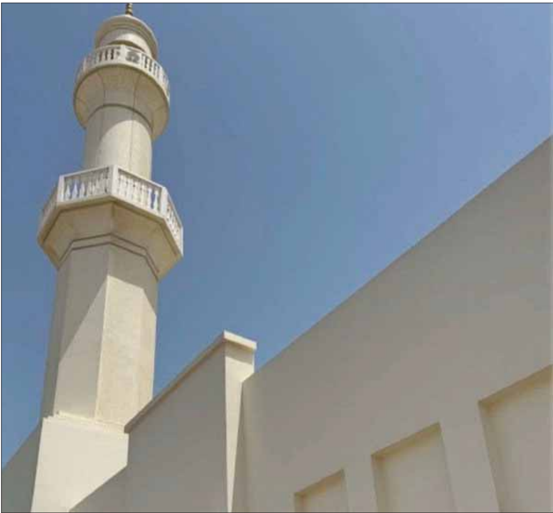
The Ministry of Endowments (Awqaf) and Islamic Affairs opens a new mosque in Al Khor.

It goes without saying that bad environment only destroys and does not build...If not, what is the benefit of teaching a child Islamic values in the morning and in the evening he goes to bad companies who destroy what his parents has put in order? Or what is the benefit of teaching a child manners for years and