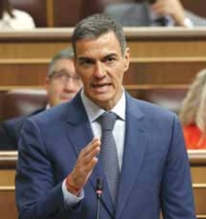
Sanchez: For Spain, committing to a 5% target would not only be unreasonable, but also counterproductive.