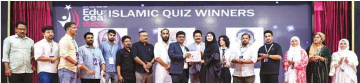
Islamic quiz winners being honoured.

KMCC Qatar, in collaboration with its student wing Green Teens, hosted the Educea 2K25 – Educational Excellence Awards Ceremony at Birla Public School (BPS), recognising and celebrating outstanding academic achievements by students in the Indian community.