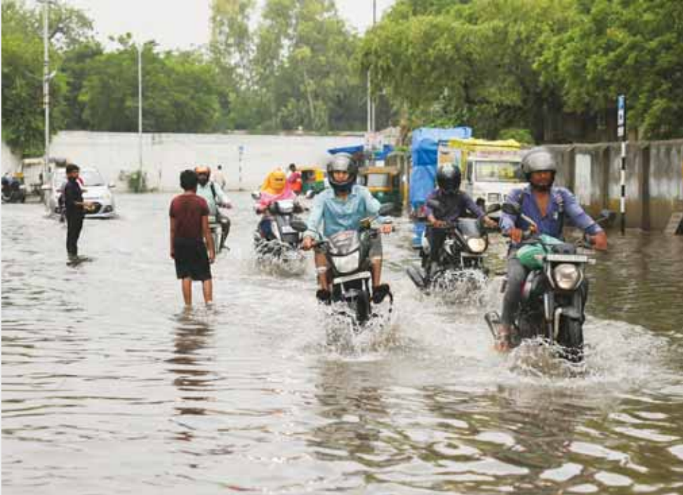
Commuters ride motorbikes through flooded streets following torrential rains, in Ahmedabad, India, yesterday.