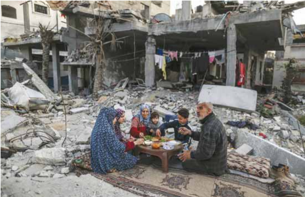
Obliteration - Surviving the Inferno: Gaza's Battle for Existence, on display at Katara Cultural Village.

a photographic series by Ali al-Shehabi, the show navigates the fluidity of selfhood in a shifting geopolitical and cultural landscape. Artists like Manal AlDowayan and Farah al-Qasimi blur boundaries between memory and resistance, the personal and political. At Mathaf: Arab Museum of Modern Art, 'Territories of the Instant' exhibition invites visitors into the world of Moroccan photographer Daoud Aoulad-Syad. Known for his cinematic eye and unfiltered gaze, he captures the soulful in-between spaces of Moroccan life - street performers in Marrakech, quiet rural landscapes, and ageing entertainers. Al-Mihrab at Fire Station's Gallery 3 is an exhibition by Khalid al-Musallamany, head of Photography and Media Archiving at the Qatar Olympic Committee,