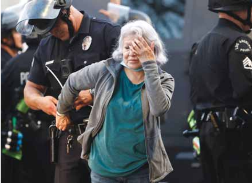
Officers detain a protester near City Hall as demonstrations in Los Angeles continue after a series of immigration raids began last Friday.

agree with the use of raids to detain people working honestly in the United States". The raids will "not only hurt people but also the US economy", she said. Trump indicated that he was under pressure, conceding he had heard complaints about labourers being rounded up. "We're going to have an order on that pretty soon, I think. We can't do that to our farmers - and leisure too, hotels," he said. In Spokane, in the northwest state of Washington, a nighttime curfew was declared after police arrested more than 30 protesters and fired pepper balls to disperse crowds, officials said. In Seattle, the state's biggest city, police arrested eight people after a dumpster was set on fire and projectiles were thrown. Three people were arrested in Tucson, Arizona, following clashes with police, the Arizona Republic reported. Protests also took place in Las Vegas, Dallas, Austin, San Antonio, Milwaukee, Chicago, Atlanta, and Boston, according to CNN. A nationwide "No Kings" movement was expected tomorrow, when Trump will attend a highly unusual military parade in the US capital. The Washington, DC parade, featuring warplanes and tanks, has been organised to celebrate the 250th anniversary of the founding of the US Army but also happens to be the day of Trump's 79th birthday. Tomorrow Americans likely will see