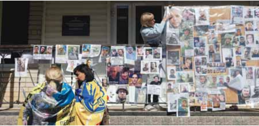
Family and friends hang photographs of their relatives on a wall during a prisoner of war exchange at an undisclosed location in Ukraine.

“Everyone in Norway must feel safe. The police must be able to deal with constantly evolving crime,” Justice Minister Astrid Aas-Hansen said last month when the proposed law change was unveiled.