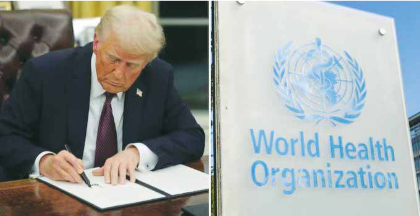
In a hyperconnected world, abandoning the WHO won't insulate the US from future pandemics — it will only leave America isolated and unprepared as the next global health crisis unfolds.