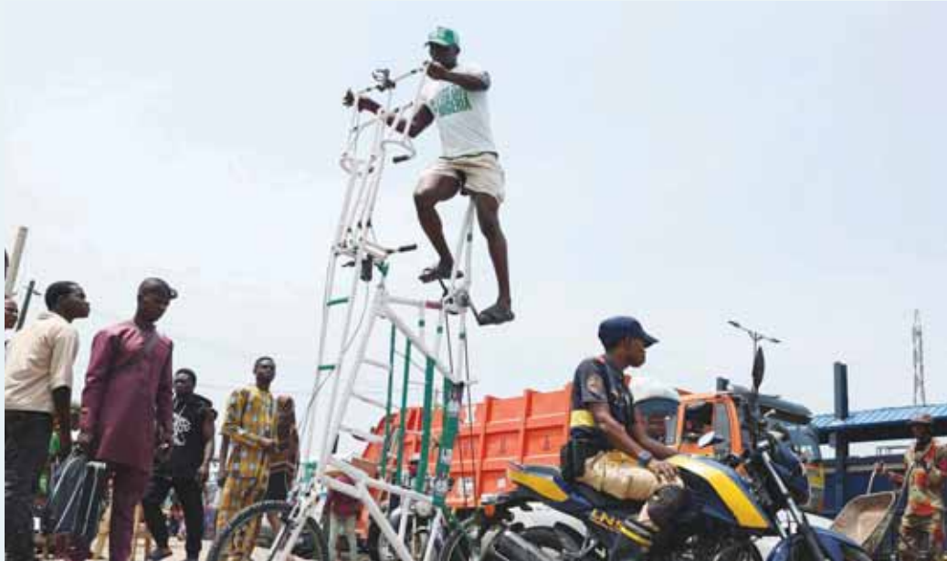
A person rides a tall bicycle during a demonstration on the street of Lagos to commemorate Nigeria's Democracy Day in Ojota, Lagos.