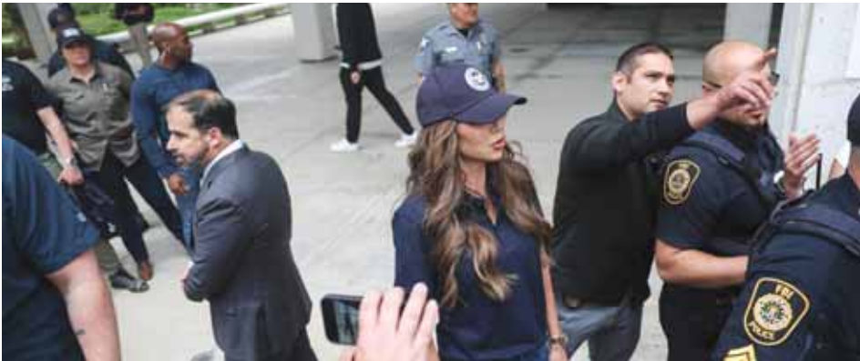
US Department of Homeland Security Secretary Kristi Noem departs after holding a news conference at the Wilshire Federal Building in Los Angeles.

criticise the move against Padilla. "Senator Padilla is a big, tall guy, and to see how he was handled out of that room is wrong and sick," Republican Senator Lisa Murkowski told reporters at the Capitol. Senate Minority Leader Chuck Schumer blasted the incident in a speech on the Senate floor. "I just saw something that sickened my stomach - the manhandling of a United States senator," Schumer said. "We need immediate answers to what the hell went on." California Governor Gavin Newsom said Padilla "is one of the most decent people I know". "This is outrageous, dictatorial and shameful. Trump and his shock troops are out of control. This must end now," he wrote on social media. Los Angeles Mayor Karen Bass called the episode "absolutely abhorrent and outrageous". "He is a sitting United States Senator. This administration's violent attacks on our city must end."