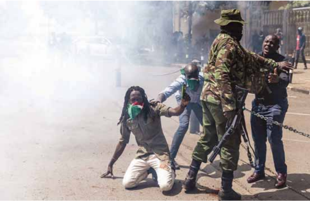
A Kenyan police officer pushes some protesters during violent demonstration in Nairobi.