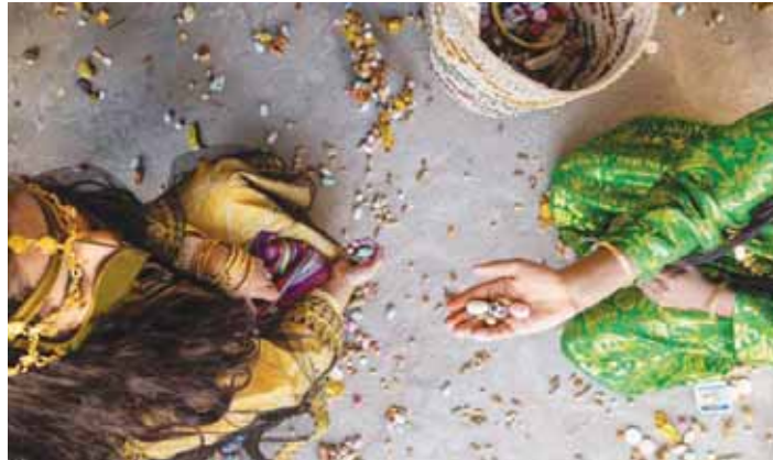
Garangao exhibition.

tute. Capturing moments from stadiums to street celebrations, this show reflects on the emotions and cultural significance of the tournament from a local perspective. Garangao 2025, part of the Tasweer Photo Festival, brings together personal narratives on memory, tradition, and resilience through an open call. This outdoor exhibition, held at the Fire Station's Barahat courtyard, celebrates intergenerational connections and local storytelling. At Katara's Buildings 45 and 46, Refractions: Tasweer Project