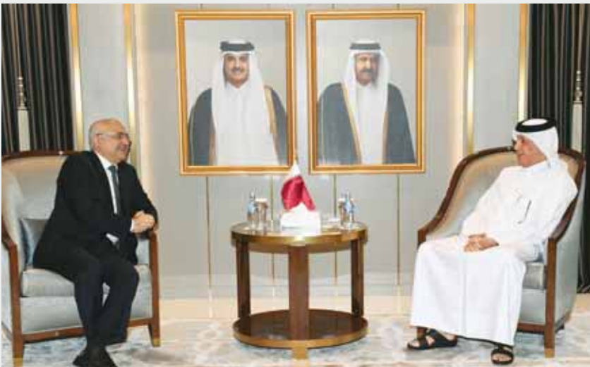
His Highness the Amir Sheikh Tamim bin Hamad al-Thani received a written message from President of Azerbaijan Ilham Aliyev pertaining to bilateral relations and ways to support and develop them. HE the Minister of State for Foreign Affairs Sultan bin Saad al-Muraikhi received the message during his meeting yesterday with ambassador of Azerbaijan to Qatar Adish Mammadov.