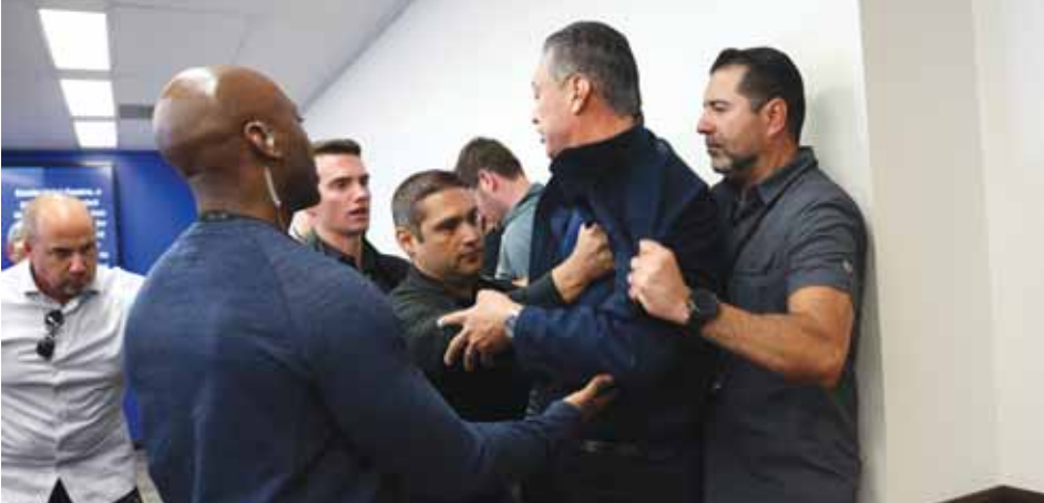
Padilla is detained and removed from the venue after interrupting the press conference held by US Secretary of Homeland Security Kristi Noem and others in Los Angeles.

Democratic US Senator Alex Padilla was shoved out of a room, forced to the ground and handcuffed by security after attempting to ask a question at a press conference yesterday by Homeland Security Secretary Kristi Noem. "I am Senator Alex Padilla, I have questions for the secretary," he said during the press conference where Noem was discussing protests in Los Angeles over President Donald Trump's immigration crackdown. "Hands off," Padilla said before he was ushered out of the room. He is one of two Democratic senators representing California in the upper chamber of Congress. Padilla said in a statement that he was forced to the ground and handcuffed by security. A video posted online showed three agents pushing Padilla to the ground and handcuffing his hands behind his back.