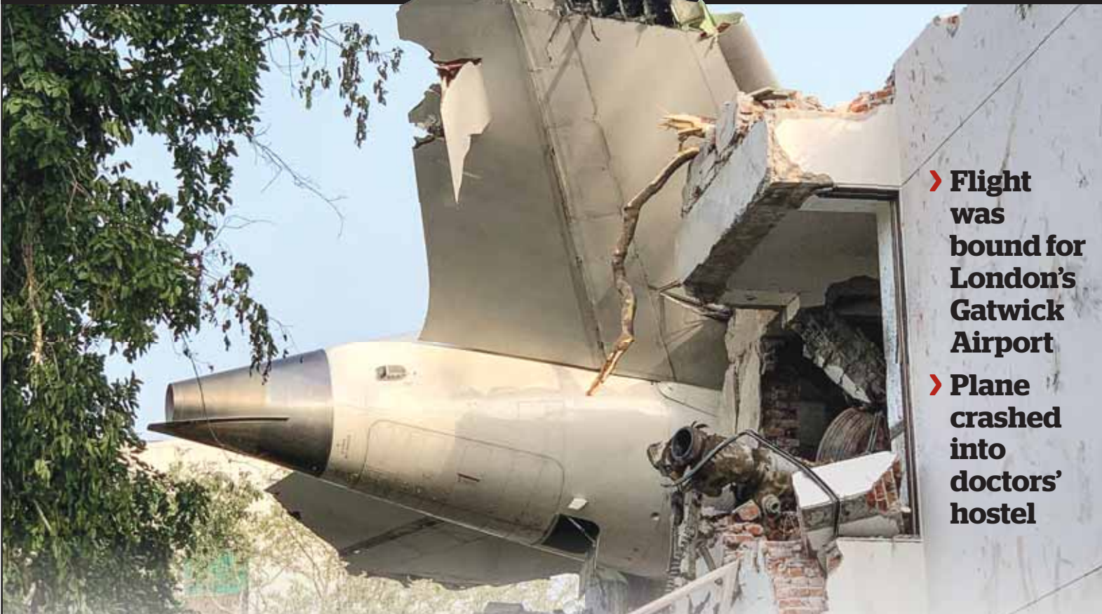
Reuters Ahmedabad, India

Bodies of 265 people were counted when an Air India plane bound for London crashed minutes after taking off from the western city of Ahmedabad yesterday, authorities said, in the world's worst aviation disaster in a decade.