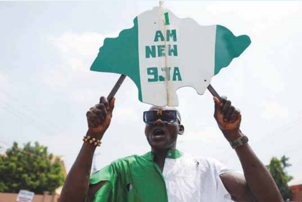
A person holds a sign representing the territory of Nigeria during a demonstration on the street of Lagos to commemorate Nigeria's Democracy Day.