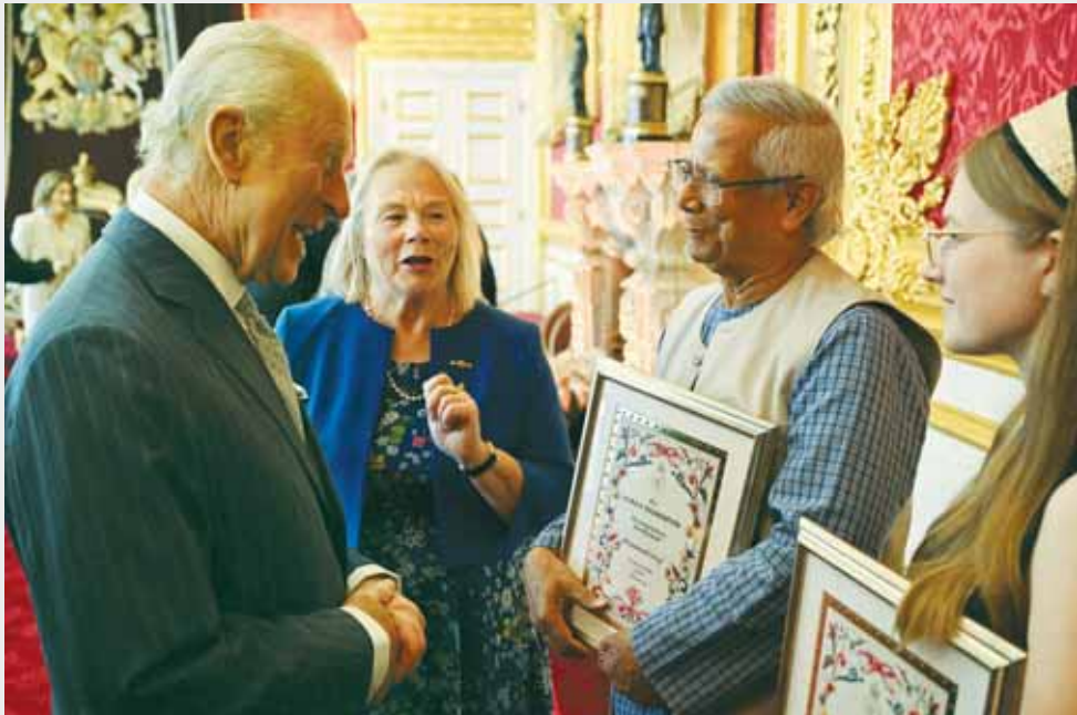
Britain’s King Charles III talks to chief adviser of Bangladesh’s interim government Muhammad Yunus during the King’s Foundation Awards ceremony, on the 35th anniversary of The King’s Foundation, at St James’s Palace, in London, yesterday. King Charles III yesterday conferred the ‘Harmony Award 2025’ on Yunus, recognising his lifelong efforts to promote peace, sustainability, and harmony between people and the environment.