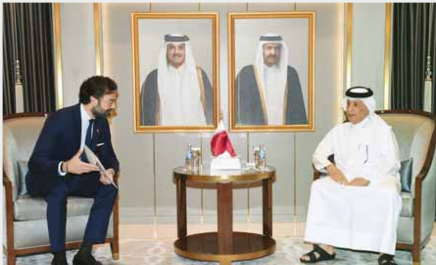
His Highness the Amir Sheikh Tamim bin Hamad al-Thani received a written message from Prime Minister of Spain Dr Pedro Sanchez pertaining to bilateral relations and ways to support and develop them. HE the Minister of State for Foreign Affairs Sultan bin Saad al-Muraikhi received the message during his meeting with ambassador of Spain to Qatar Alvaro Renedo Zalba.