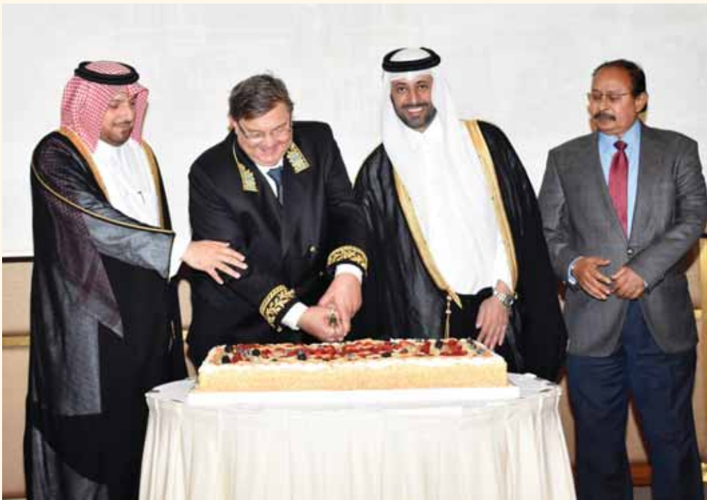
Russian ambassador Dmitry Dogadkin is joined by Qatar's Minister of Municipality HE Abdullah bin Hamad bin Abdullah al-Attiyah in cutting a ceremonial cake at the Russian National Day celebrations in Doha yesterday as other dignitaries look on.