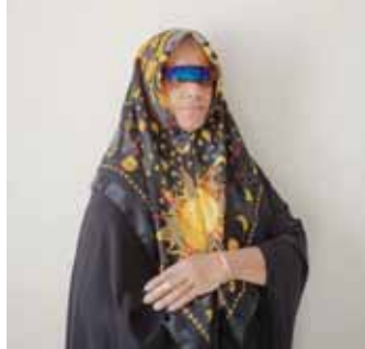
As I Lay Between Two Seas exhibition features 25 artists from the Arab world and its diasporas.