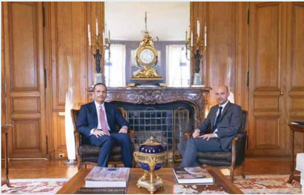
HE the Prime Minister and Minister of Foreign Affairs Sheikh Mohammed bin Abdulrahman bin Jassim al-Thani met with French Minister for Europe and Foreign Affairs Jean-Noel Barrot on the sidelines of the third Qatar-France Strategic Dialogue held in Paris. The meeting discussed bilateral co-operation between the two countries and discussed ways to enhance and deepen it across various fields. The two sides also exchanged views on the latest developments in Gaza and occupied Palestinian territories, along with other issues of common interest.