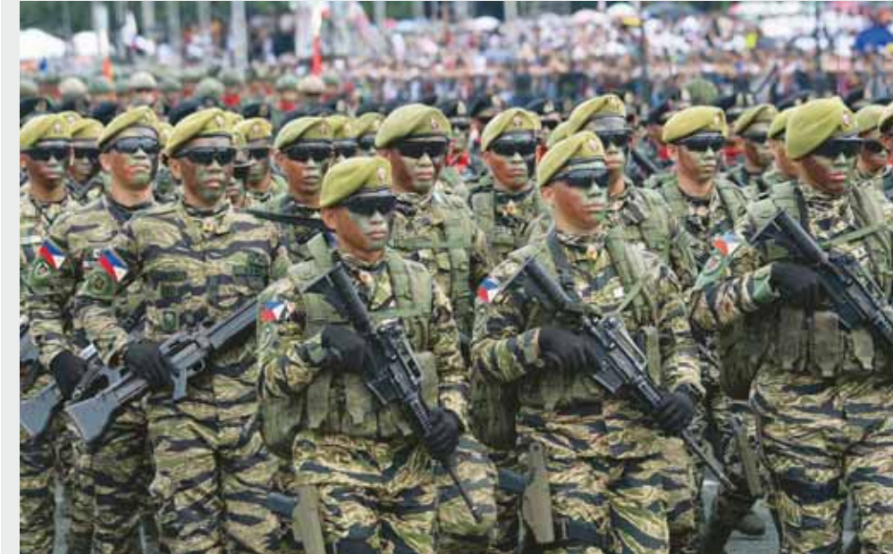
Military personnel march during a parade to mark the 127th Independence Day celebration at Quirino Grandstand in Manila, Philippines, yesterday.