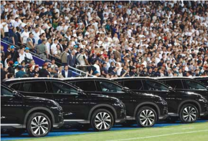
Before the match in Tashkent, Uzbekistan President Shavkat Mirziyoyev awarded the team members and support staff with electric cars in honour of securing their first-ever FIFA World Cup berth.

dov, who outran three defenders only to be dispossessed. The game burst into life in the 28th minute when Azizbek Turgunboev evaded two tackles down the right and sent a screamer that rocked the underside of the bar and gave keeper Salah Zakaria no chance at all. Zakaria and the Qatari defence were kept on their toes in the following minutes by the twin strikeforce of Shomurodov and Jaloliddin Masharipov, who combined to make three attempts at goal. The custodian later kept his side in the