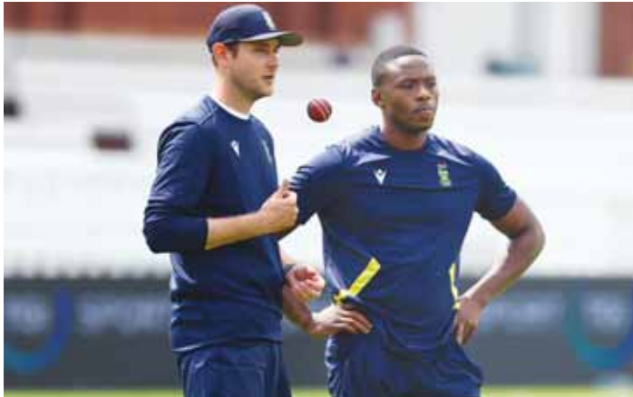
South Africa's Kagiso Rabada and team consultant Stuart Broad during practice at Lord's Cricket Ground, London, Britain.