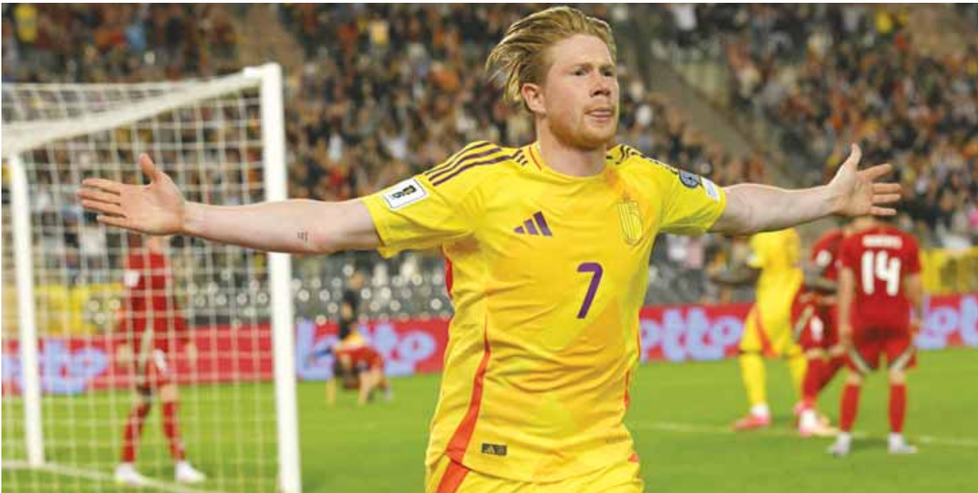
Belgium's Kevin De Bruyne celebrates scoring the winner against World Cup qualifying match against Wales in Brussels. (AFP)

Italy struggle but give Spalletti winning send-off against Moldova