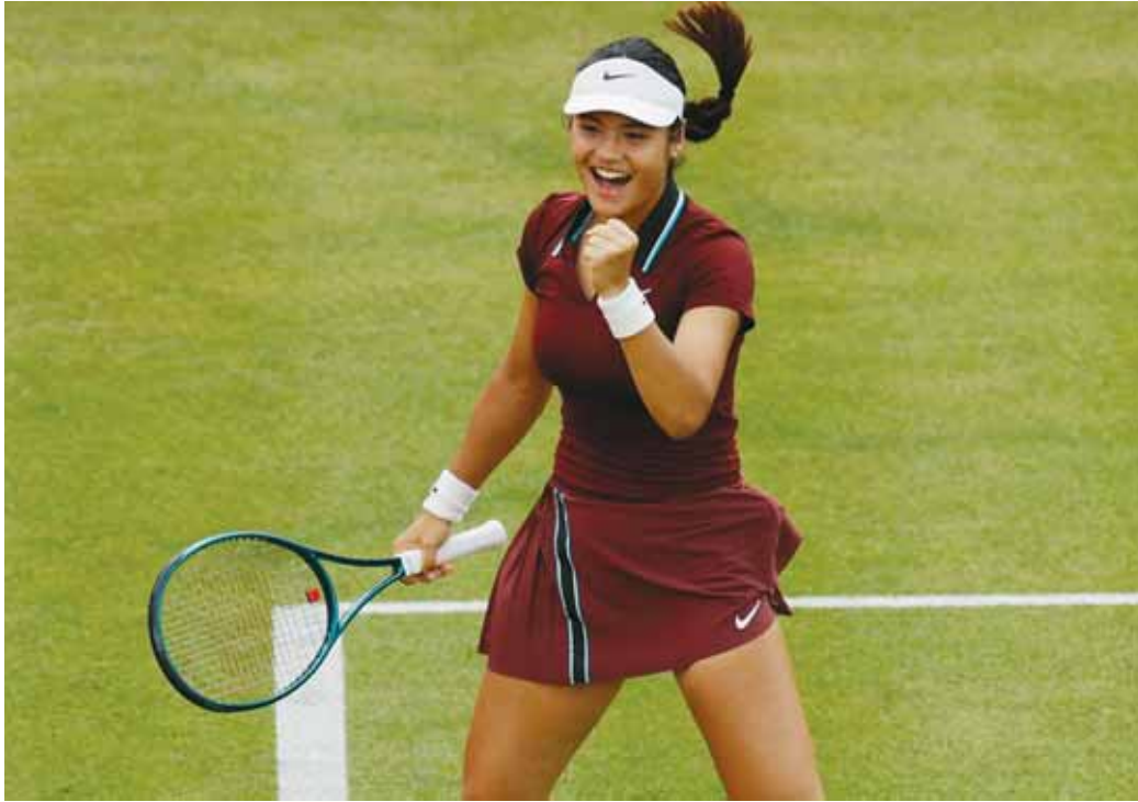
Britain's Emma Raducanu celebrates winning her round of 32 match against Spain's Cristina Bucsa at Queen's Club Championships in London, Britain, yesterday.

Top tier women's tennis has returned to Queen's Club for the first time since 1973 and the home crowd had plenty to cheer on day two with Katie Boulter and Heather Watson also winning their first-round matches.