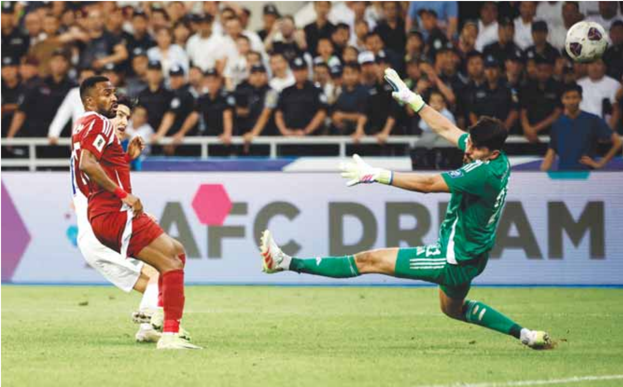
Uzbekistan's Dor Shomurodov scores against Qatar during the World Cup qualifying match in Tashkent.

Reigning Asian champions will have to navigate the playoffs, where two additional places are on offer