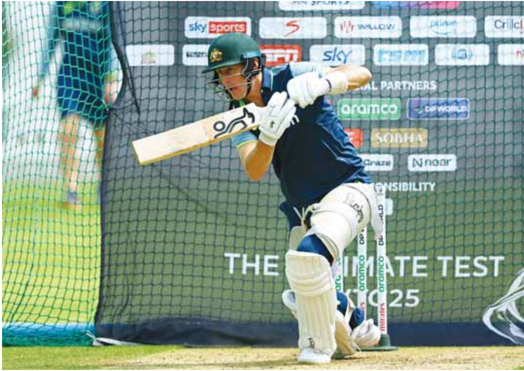
Australia's Marnus Labuschagne during practice ahead of the 2025 ICC World Test Championship Final against South Africa at Lord's Cricket Ground, London, yesterday.

suits him best. And then with Marnus moving, we thought it's one spot up, it's not too different to batting at three. He's done well here in England in the past."