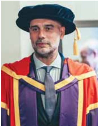
Pep Guardiola was awarded the honorary degree by the University of Manchester for his unprecedented success at City.