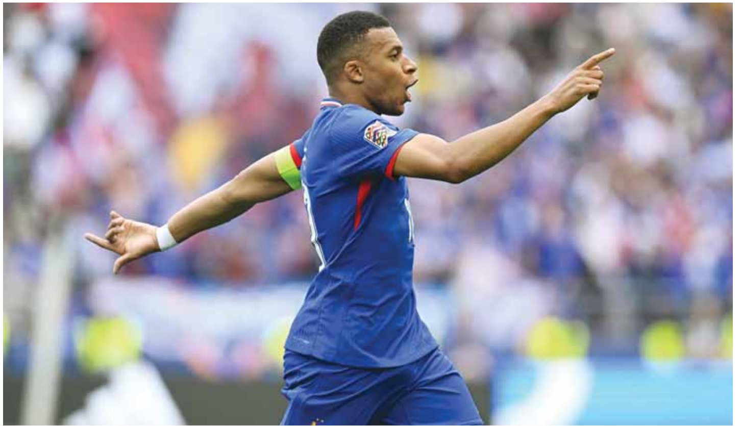
France's forward Kylian Mbappe celebrates scoring the opening goal during the UEFA Nations League third place play-off match against Germany in Stuttgart yesterday.

Nagelsmann replaced rookie striker Nick Woltemade with