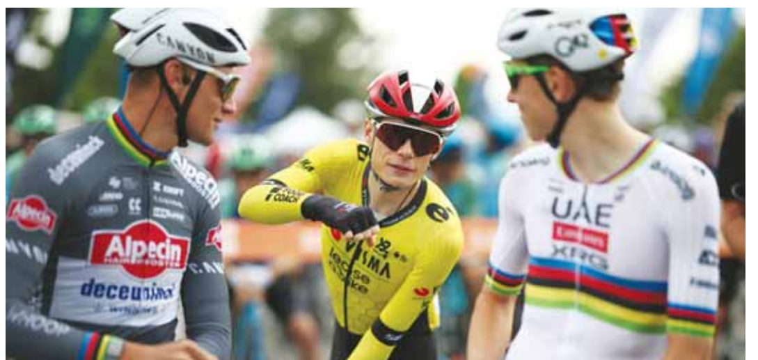
Alpecin-Deceuninck's Dutch rider Mathieu Van Der Poel (left), Team Visma-Lease a Bike's Danish rider Jonas Vingegaard and UAE Team Emirates' Slovenian rider Tadej Pogacar greet each other prior to the start of the 1st stage of the 77th Criterium du Dauphine cycling race, 195.8km between Domerat and Montluçon, yesterday.

Today's second stage takes in six more big hills over 204.6km from Premilhat to Issoire.