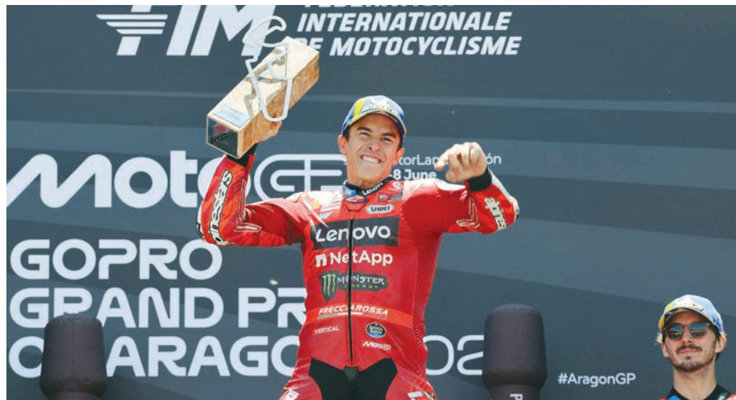
Winner Ducati Lenovo Team's Marc Marquez celebrates on the podium after the MotoGP Aragon Grand Prix race at the Motorland circuit in Alcañiz, northeastern Spain, yesterday.

"To be brothers and Spanish in front of a home crowd is extra special for me," said Alex Marquez, who at 29 is three years his