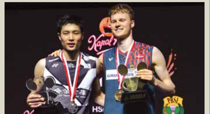
Winner Denmark's Anders Antonsen (right) poses on the podium with runner-up Taiwan's Chou Tien-chen following their singles final at the Indonesia Open at Istora Senayan in Jakarta yesterday.

Jakarta, Indonesia: Danish third seed Anders Antonsen beat Taiwanese Chou Tien-chen 22-20 21-14 to clinch his first Indonesia Open men's singles title yesterday, while South Korea's An Se-young fought back from a game down to claim her second women's singles crown.