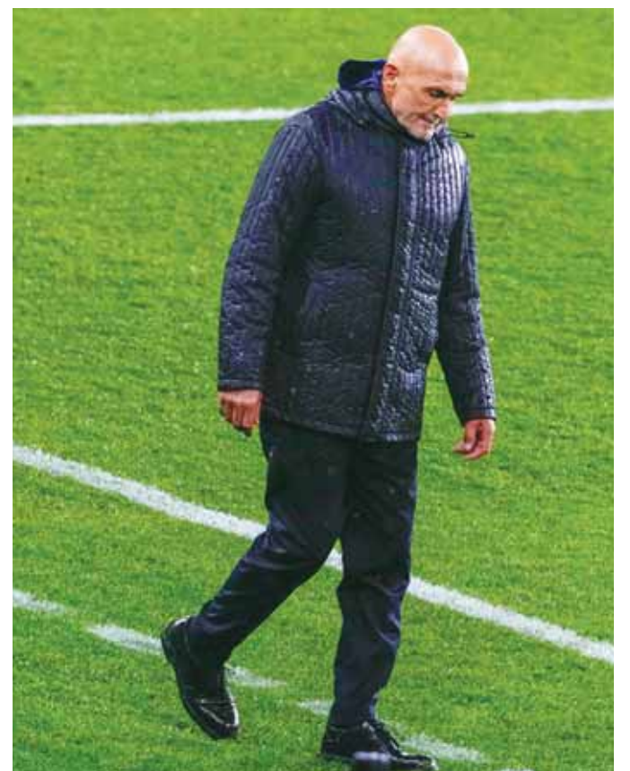
Italy's coach Luciano Spalletti reacts from the sidelines during the 2026 FIFA World Cup qualifying Group I match against Norway at the Ullevaal Stadium in Oslo on Friday. (AFP)

tacks on him are not merited," said Gravina.