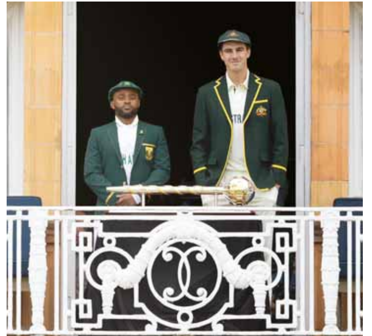
Australia's Test captain Pat Cummins (right) is seen with South African skipper Temba Bavuma on the Lord's balcony in London yesterday.

"In the IPL games, I was probably hitting around that seven-to nine-meters in the powerplay, and not really threatening the stumps as much as you want to in Test cricket, in particular here in England," he said. "So, it'll just be about pushing that length and touch fuller and still getting that zip through the keeper."