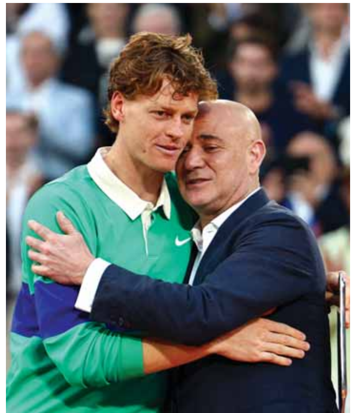
Italy's Jannik Sinner is comforted by former US tennis player Andre Agassi after losing his French Open final in Paris yesterday.

A despairing Sinner lost his serve right away and his gloom deepened as Alcaraz saved two