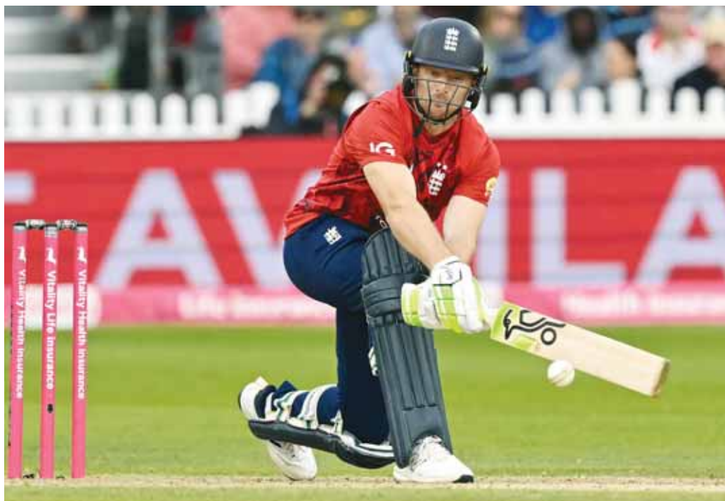
England's Jos Buttler in action against the West Indies during the second T20I at Seat Unique Stadium in Bristol, southwest England, yesterday.

Shai Hope took the fight to England with 49 off 38 balls, while Johnson Charles started patiently before he also fell just short of his half century, with 47 from 39 deliveries.