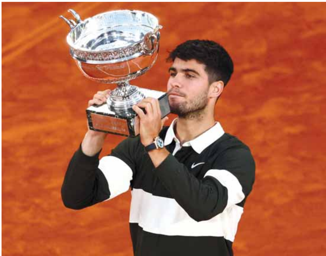
Spain's Carlos Alcaraz celebrates with the trophy after winning the French Open final against Italy's Jannik Sinner in Paris yesterday.

Alcaraz leads 8-5 overall having also beaten Sinner to win in Rome, where the Italian returned to