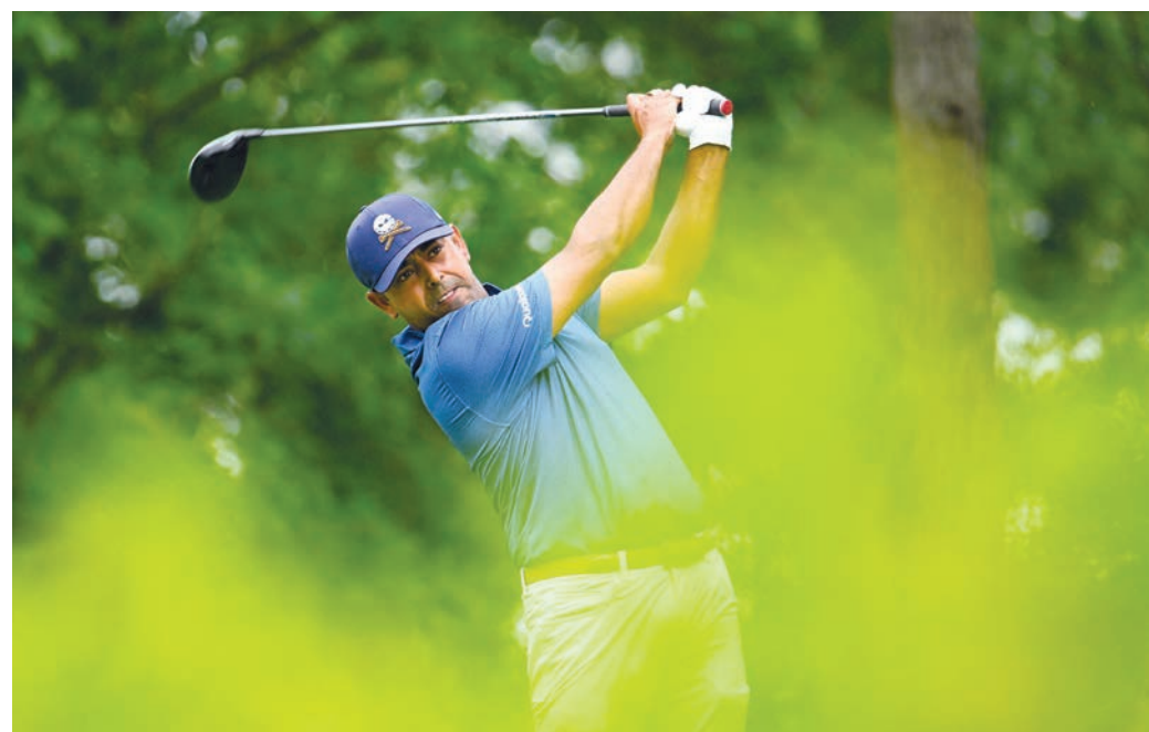
Anirban Lahiri of Crushers GC tees off at the fifth hole on day three of LIV Golf Virginia at Robert Trent Jones Golf Club in Gainesville, Virginia.

"It's always good to be close to the lead, have a chance on the last