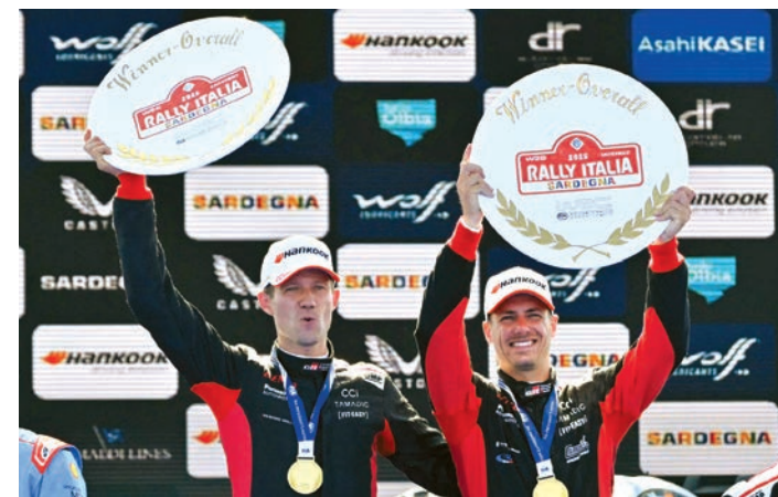
French off-road driver Sebastien Ogier (left) and co-driver Vincent Landais celebrate after winning the 22nd edition of the Rally Italia Sardegna, 6th round of the FIA World Rally Championship, in Olbia, Sardinia, yesterday.