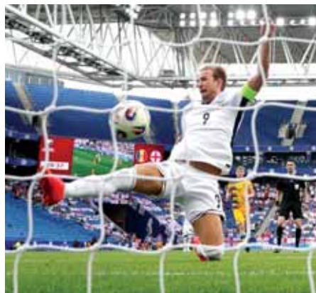
England's Harry Kane scores during the World Cup qualification match against Andorra in Cornella de Llobregat, Spain.

England are expected to be one of the fa-