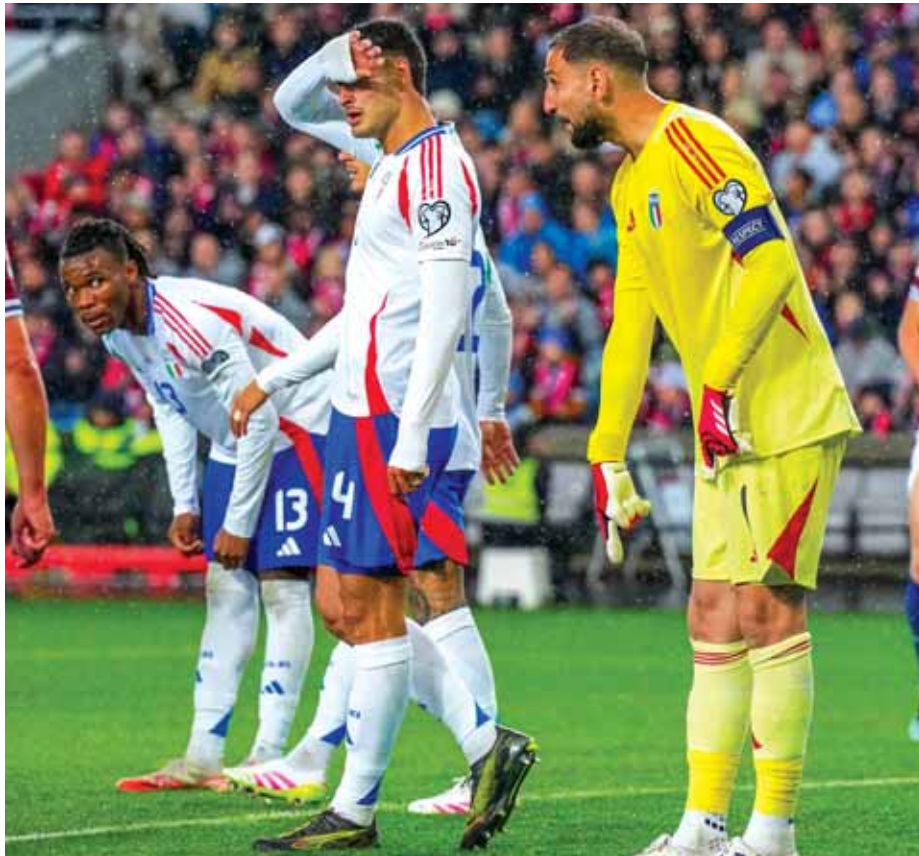
Four-times winners Italy have not qualified for World Cup since 2014.

Italy manager Luciano Spalletti was spared following last year's dismal Euros but is now