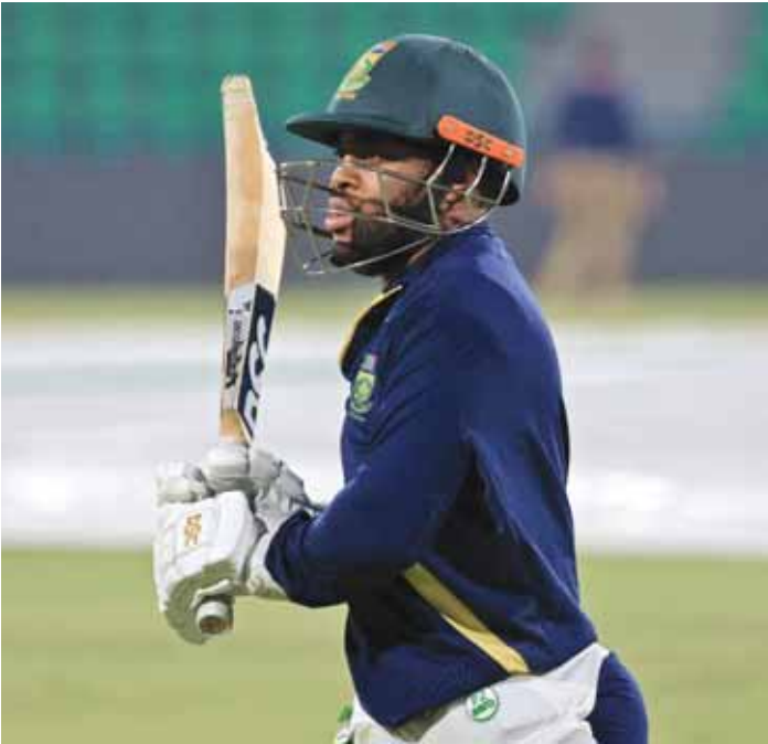
A farcical run-out with the scores tied in a 1999 semi-final against Australia meant they were eliminated on net run-rate. On home soil in 2003, rain and a miscalculation of the run-rate formula against Sri Lanka led to an embarrassing group-stage exit.

They know what they need to do." But the 35-year-old batsman is adamant South Africa will not be overawed when facing Pat Cummins' team. "For us it is about being confident in our ability," said Bavuma. "We haven't been handed this opportunity to play in the final, we have performed accordingly. We respect them (Australia) but it is still a 50-50 chance in our eyes." Heartache has been the recurring theme of South Africa's history at global events going back to the 1992 World Cup, when they returned to the international fold after two decades of exclusion as a result of the country's apartheid regime. South Africa reached the semi-finals only for a cruel rain rule, that left them needing 21 off one ball, to wreck their chances against England in Sydney. That set a pattern for the next three ODI World Cups. South Africa dominated their group stage in Pakistan in 1996 before falling to a Brian Lara-inspired West Indies in the quarter-finals.