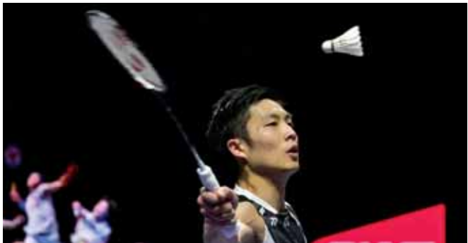
Taiwan's Chou Tien-chen hits a return against Thailand's Kunlavut Vitidsarn during the Indonesia Open semi-final yesterday.

An will come up against Wang Zhiyi in Sunday's final after the Chinese world number two beat compatriot Han Yue 21-12 21-13 in 39 minutes.