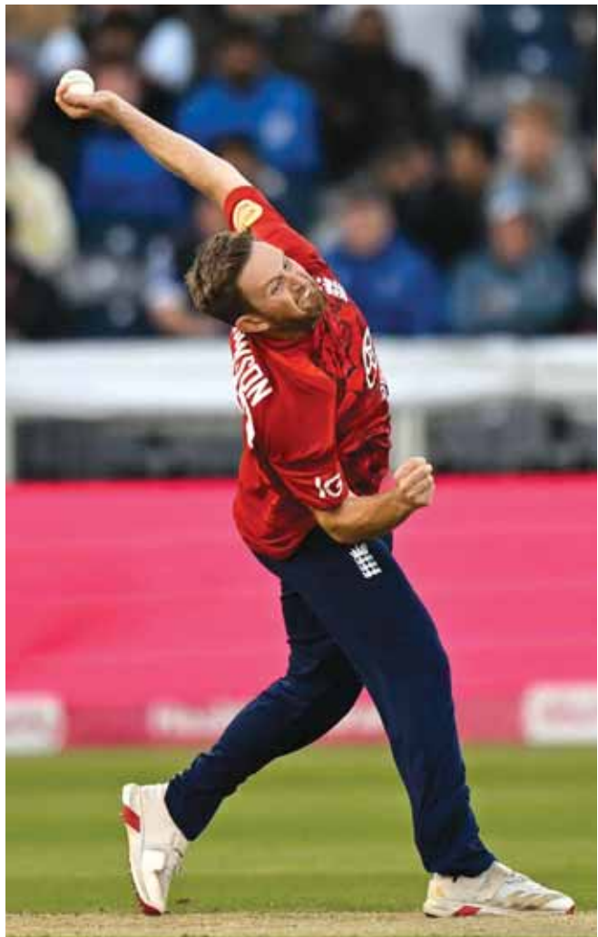
England's Liam Dawson bowls during the first T20 match against West Indies at Chester-le-Street, in northeast England, yesterday.

"I think that can hamper you sometimes so I've not really worried about that. I'm at an age now where I know that I'm close to finishing." Brook gave Dawson the new ball in Durham, a sign of his confidence in the bowler, and perhaps a marker for next year's T20 World Cup on turning pitches in India and Sri Lanka. "Personally, I think he's been knocking on the door for years to try and solidify that spot and the performance we saw from him was awesome," said Brook of Dawson. "Him and Adil Rashid working in tandem at both ends is going to be good to watch in the coming years. He can also help the younger lads along the way, to have him in the inner circle when they are bowling is going to help us a lot." The three-match series continues in Bristol today before finishing at Dawson's home ground in Southampton on Tuesday. Well though he bowled in Durham, Dawson is taking nothing for granted. "I know how cricket works, you've got to be consistent and it's only one game," he said. "So I'll park this and go again. It would be nice to play at my home ground, if selected."