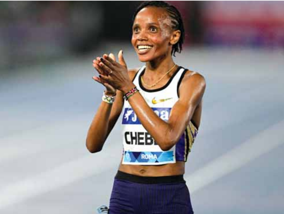
Kenya's Beatrice Chebet celebrates after winning the women's 5,000m event of the Diamond League meeting at the Olympic stadium in Rome.