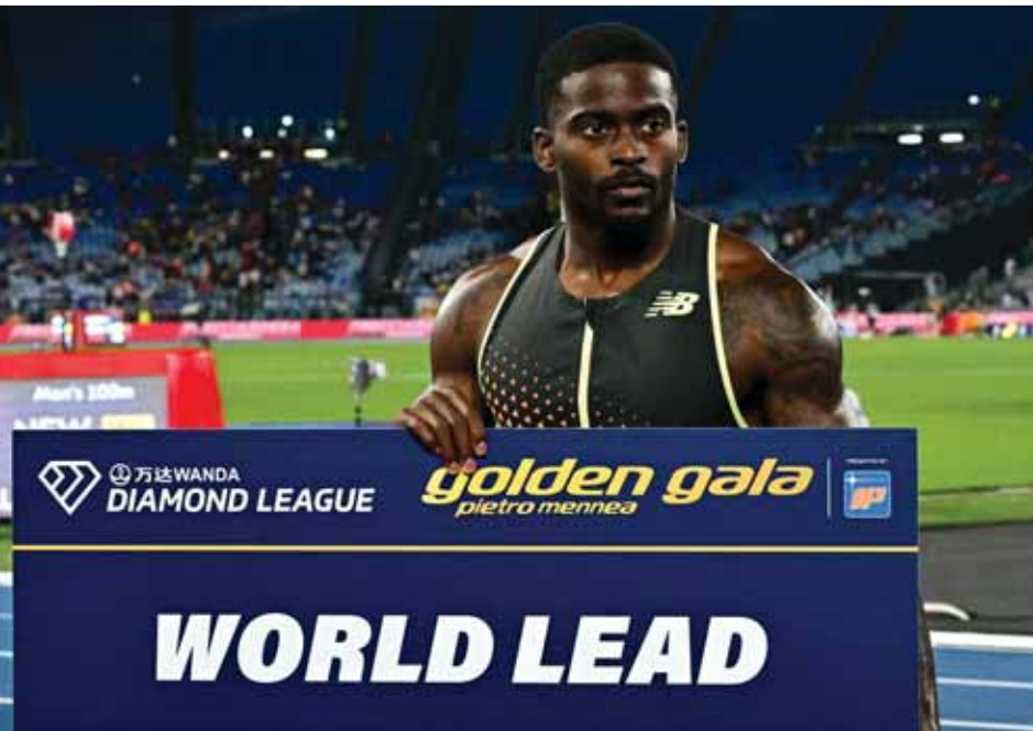
Trayvon Bromell poses with a world lead board after winning the men's 100m event in Rome.

Kenya's Ferdinand Omanyala (10.01) rounded out the podium in the blue riband event.