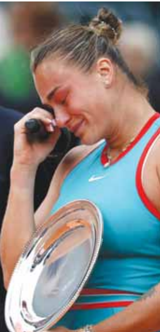
Belarus' Aryna Sabalenka reacts as she holds her runner-up trophy in Paris yesterday.

straight Australian Open crown ended by Madison Keys in January, Sabalenka slid to another painful loss on the clay.