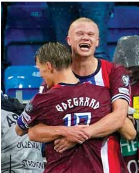
Norway's Erling Haaland celebrates with Martin Odegaard after scoring against Italy in the World Cup qualifiers.