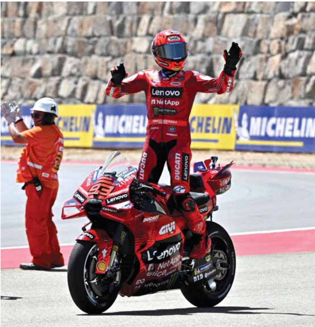
Team Ducati Lenovo Team's Marc Marquez celebrates winning the sprint race of the MotoGP Aragon Grand Prix at the Motorland circuit in Alcaniz, northeastern Spain, yesterday.

Bagnaia is still third in the championship but he now sits 84 points behind Marc. ARAGON MOTOGP SPRINT RESULTS 1. Marc Marquez (ESP/Ducati) 19min 43.026sec, 2. Alex Marquez ((ESP/Ducati-Gresini) at 2.080sec, 3. Fermin Aldeguer (ESP/Ducati-Gresini) 4.630, 4. Franco Morbidelli (ITA/Ducati-VR46) 5.944, 5. Pedro Acosta (ESP/KTM) 6.095, 6. Fabio Di Giannantonio (ITA/Ducati-VR46) 6.379, 7. Maverick Vinales (ESP/KTM-Tech3) 7.213, 8. Marco Bezzecchi (ITA/Aprilia) 8.343, 9. Brad Binder (RSA/KTM) 9.982, 10. Raul Fernandez (ESP/Aprilia-Trackhouse) 11.427, 11. Fabio Quartararo (FRA/Yamaha) 13.331, 12. Francesco Bagnaia (ITA/Ducati) 14.017, 13. Jack Miller (AUS/