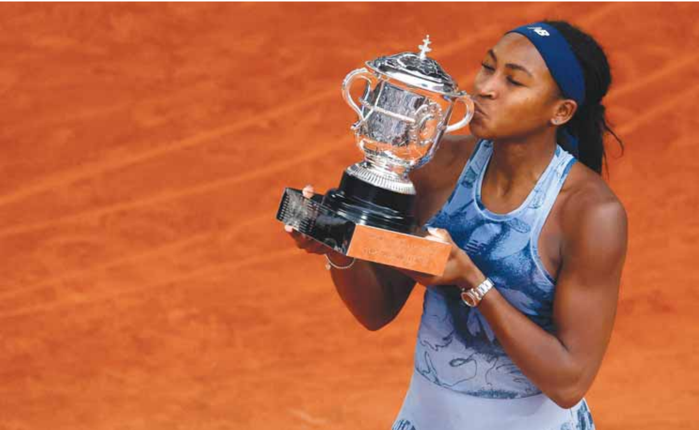
Coco Gauff of the US celebrates with the trophy after winning the French Open final against Belarus' Aryna Sabalenka in Paris yesterday. (Reuters)

UNFORCED ERRORS Paris was guaranteed a new champion but the first clash between the top two women in the world rankings in a major final since the 2018 Australian Open failed to live up to its billing on Court Philippe Chatrier with 100 unforced errors