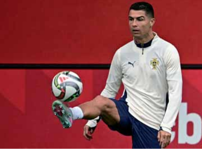
Portugal's Cristiano Ronaldo takes part in a training session of the team in Munich yesterday, on the eve of the UEFA Nations League final against Spain.

"It's always been like that, whenever I've played football, whenever I've played a big game it's always been Cristiano against