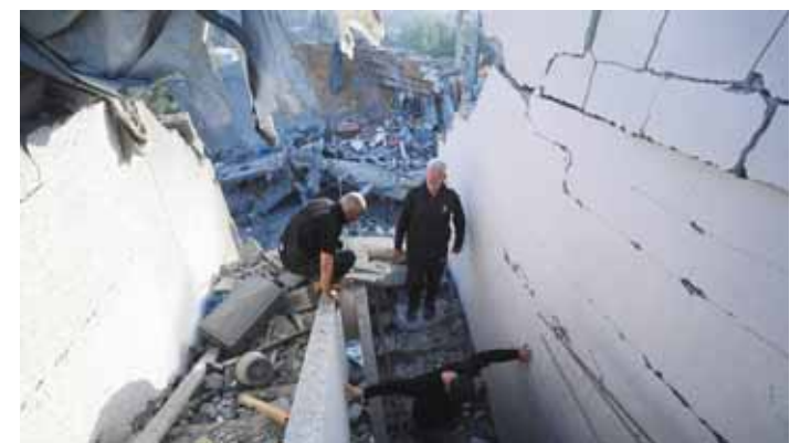
Palestinians inspect the site of an Israeli strike on a house, in Jabalia, in the northern Gaza Strip, yesterday.

The resulting shortages of food and medicine have aggravated an already dire situation in the Palestinian territory, although Israel has dismissed UN warnings that a potential famine looms. UN Secretary-General Antonio Guterres yesterday called for "the immediate and unconditional release of all hostages, unimpeded humanitarian access and an immediate