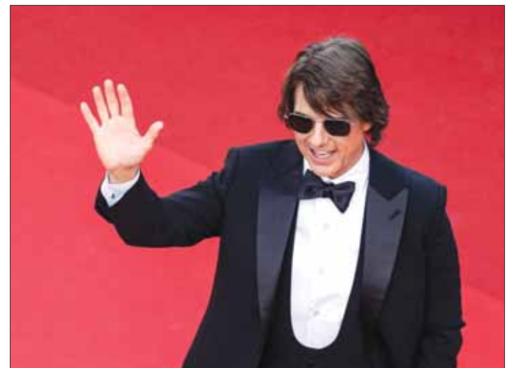
US actor and producer Tom Cruise arrives for the screening of the film Mission: Impossible - The Final Reckoning at the 78th edition of the Cannes Film Festival in Cannes yesterday.

Fellow cast members Hayley Atwell, Pom Klementieff, Greg Tarzan Davis, Angela Bassett, Esai Morales and Hannah Waddingham posed with Cruise, even snapping a few selfies themselves, before heading into the red-bedecked Grand Lumiere Theatre. US actors Zoe Saldana and Eva Longoria, as well as Andie MacDowell, sporting a suit, and Cannes jury member Halle Berry were also spotted on their way to