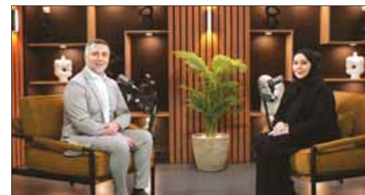
Screen shot of the interview.

During the interview, al-Mannai expressed concern about the growing presence of unqualified individuals discussing mental health on social media and urged the public to remain grounded in values and authentic