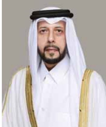
HE the Minister of Public Health Mansoor bin Ebrahim bin Saad al-Mahmoud

alongside the World Health Assembly titled "Accelerating the Impact of the United Nations Decade of Healthy Ageing 2021-2030 - Investing in a Continuum of Care and Age-Friendly Environments", on May 19 at the United Nations Palace in Geneva, with broad participation from countries and relevant international organisations.