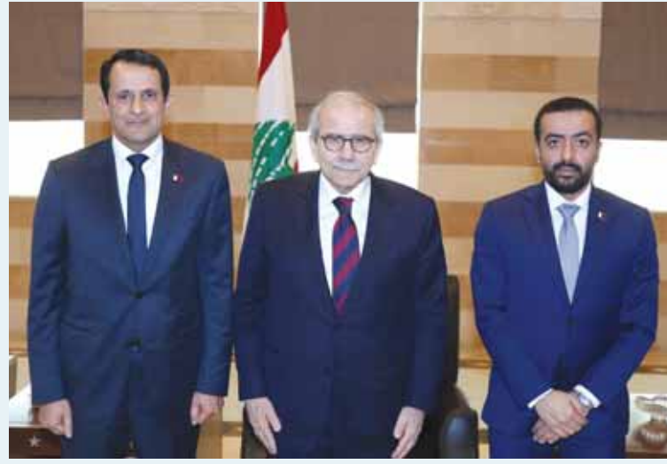
Lebanese Prime Minister Dr Nawaf Salam met in Beirut yesterday with Qatar's ambassador, Sheikh Saud bin Abdulrahman al-Thani. Both sides discussed bilateral relations, along with a range of topics of shared interest. The prime minister expressed his gratitude for Qatar's supportive role towards Lebanon under all circumstances. For his part, the ambassador reiterated Qatar's enduring position on standing side by side with Lebanon and its commitment to the country's stability. (QNA)