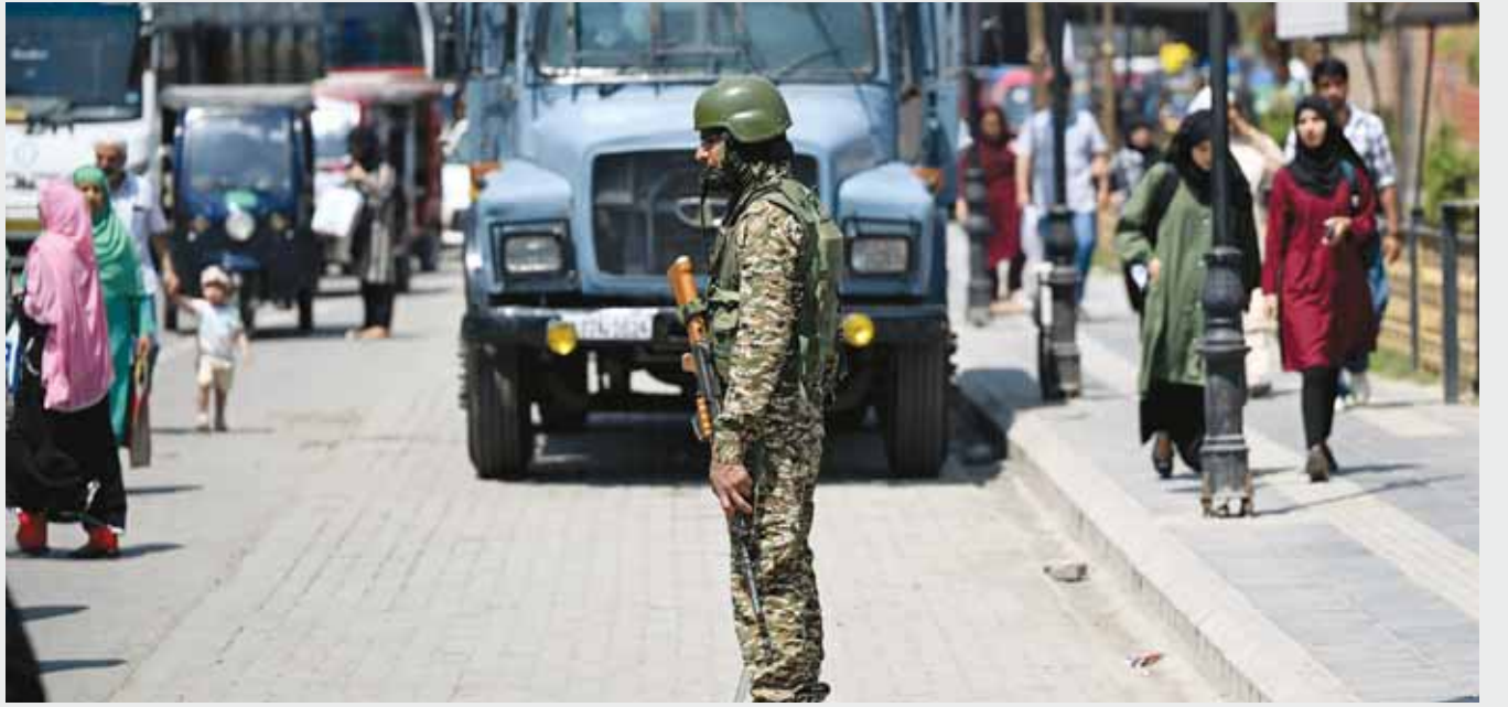
An Indian paramilitary soldier stands guard along a street in Srinagar, India, yesterday.