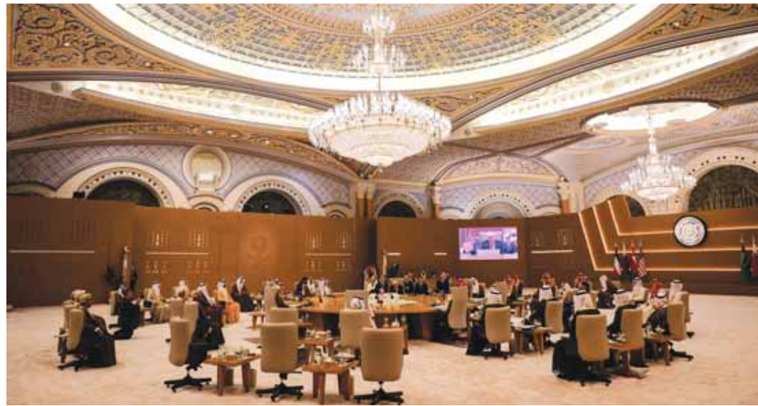
US President Donald Trump speaks at the Gulf Co-operation Council (GCC) in Riyadh, Saudi Arabia.

He commended Trump's decision to lift economic sanctions on Syria, expressing his aspiration for further co-operation to achieve a safe, stable, and prosperous region. This policy represents a unique opportunity to move together toward achieving a just