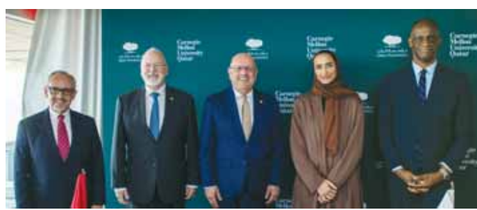
Dignitaries at the signing ceremony.

"Carnegie Mellon University was one such partner, bringing to Qatar its world-class academic programs, its future-focused ethos of curiosity, and its commitment to providing oppor-