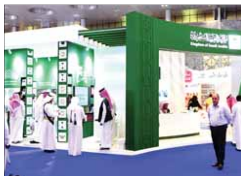
The Saudi pavilion.

unified knowledge fabric forged over the centuries through poetry, storytelling, and inspiring narratives."