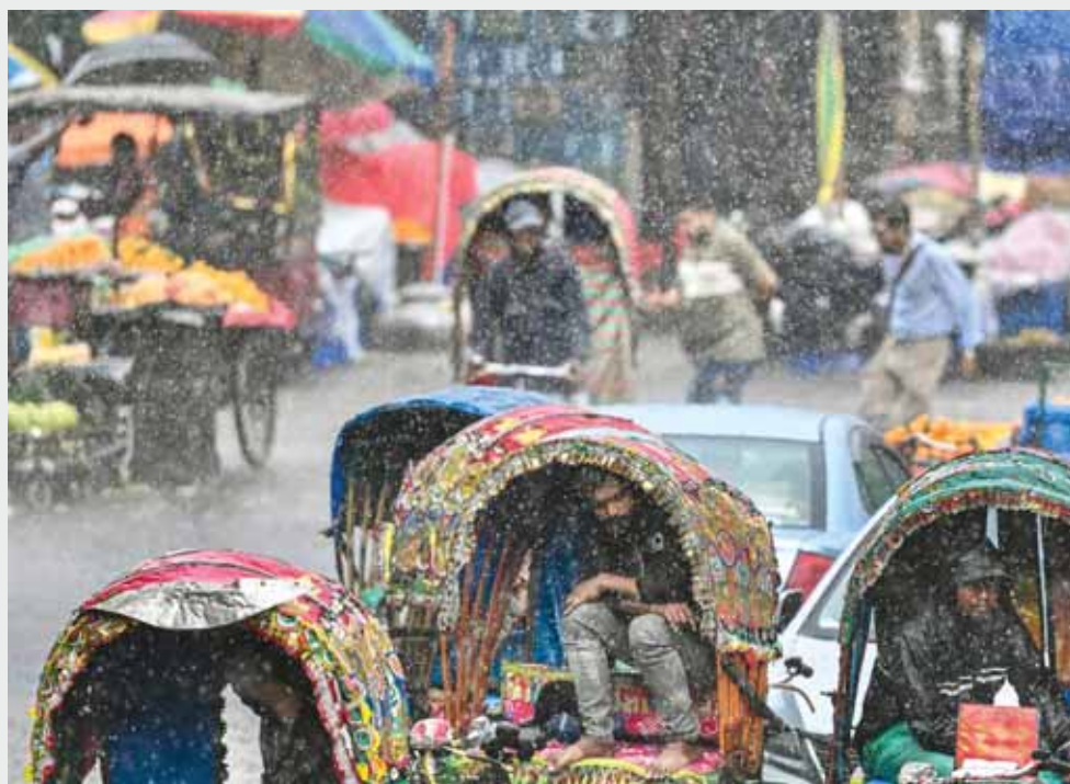
A cyclist rickshaw puller takes shelter under the canopy of his vehicle during rainfall in Dhaka, Bangladesh, yesterday.