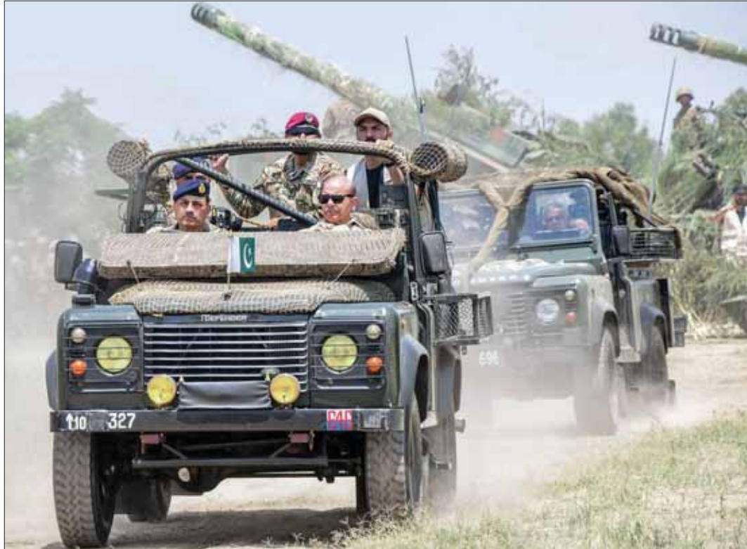
Pakistani Prime Minister Shehbaz Sharif (front, right) along with the country's Army Chief General Syed Asim Munir (front, left) on their visit to Pasrur Cantonment in Sialkot, Punjab province.

The flare-up in violence was the worst since the rivals' last open