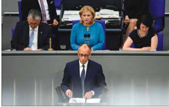
German Chancellor Friedrich Merz delivers his first government statement during a session at the Bundestag, the German lower house of parliament, in Berlin yesterday.

"Strengthening the Bundeswehr (armed forces) is our top pri-