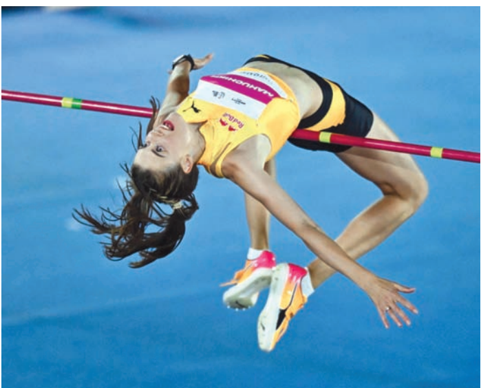
In the women's competition, Olympic champion Yaroslava Mahuchikh of Ukraine soared to victory with a season-leading jump of 2.02m.