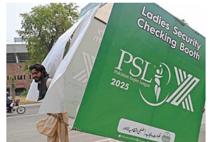
A worker removes a hoarding outside the Gaddafi Cricket Stadium, one of the venues for the Pakistan Super League in Lahore yesterday.

The exchange of drones and firing continued yesterday, with Pakistan vowing not to escalate tension.