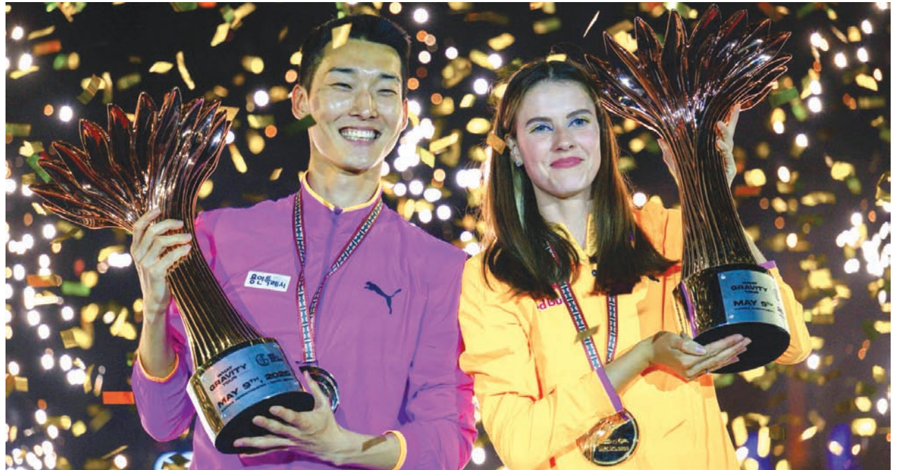
South Korea's Woo Sang-hyeok (left) and Ukraine's Yaroslava Mahuchikh celebrate with the trophies after winning the second edition of the 'What Gravity Challenge', held at Katara's Roman Amphitheater yesterday.

success of the second edition of his brain-child event. "This success fills me with indescribable happiness," Barshim said. "The idea, the public turnout, and the high level of competition exceeded expectations. The second edition truly reached a distinguished level."