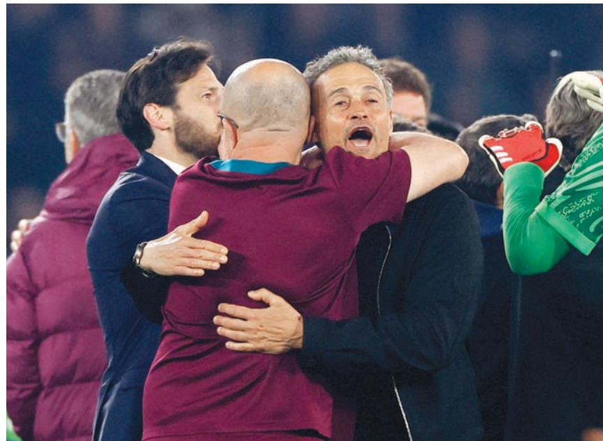
Luis Enrique's sealed the league title with six games to spare last month and will now target the Coupe de France final on May 24 against Stade de Reims before they chase a first Champions League crown versus Inter Milan a week later.

PSG will be playing in their second Champions League final after losing to Bayern Munich in 2020 and Enrique said the French club deserve to win the title after such a long wait. "If a team deserves to win, after waiting so long, it's PSG. I know the club was founded the year I was born (in 1970). Let's hope this connection proves true and we can secure the Champions League," he said.