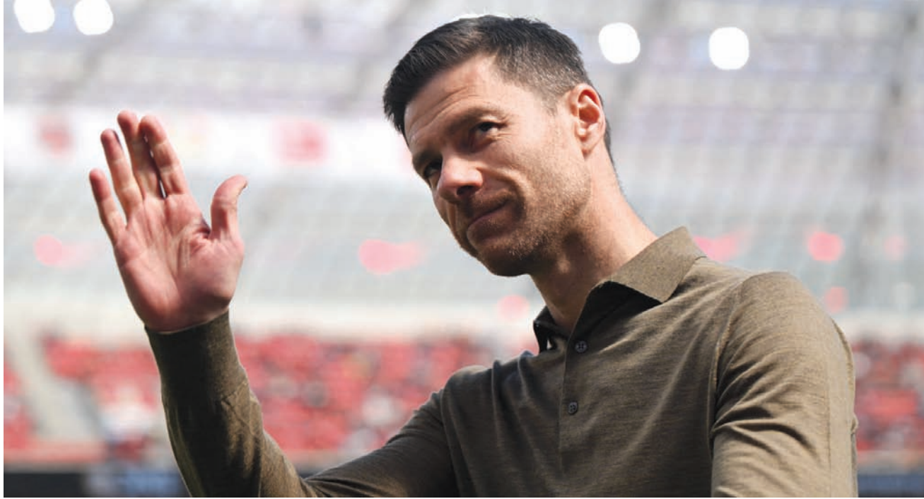
Xabi Alonso guided Leverkusen to an unbeaten league and cup double in 2023-24, the first Bundesliga title in the club's history.

Leverkusen's title defence ended with their 2-2 draw at Freiburg on Sunday,