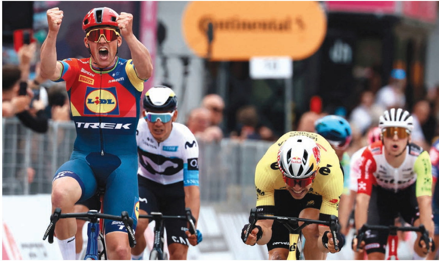
Lidl-Trek's Danish rider Mads Pedersen, next to Team Visma-Lease a Bike's Belgian rider Wout Van Aert (right), celebrates as he crosses the finish to win the first stage of the 108th Giro d'Italia cycling race, 160km from Durres to Tirana in Albania, yesterday.

'The team set it up. We rode hard and then got ahead for the finale'