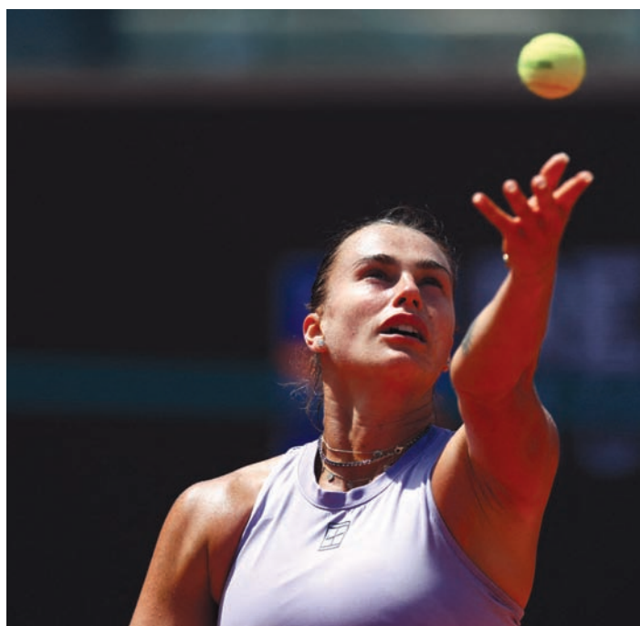
Belarus' Aryna Sabalenka in action during her match against Russia's Anastasia Potapova yesterday.

gentina's Camilo Ugo Carabelli, in the last match of the day on centre court. Home hope Lorenzo Musetti opened his week, his first in the top 10 of the men's world rankings, with a 6-3, 6-2 win over qualifier Otto Virtanen.