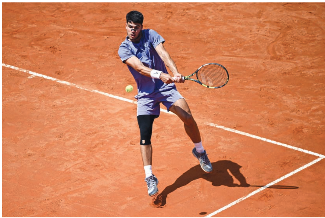
Spain's Carlos Alcaraz plays a backhand return to Serbia's Dusan Lajovic during the ATP Rome Open at Foro Italico in Rome yesterday.

Last year's winner Alexander Zverev is in action, against Ar-