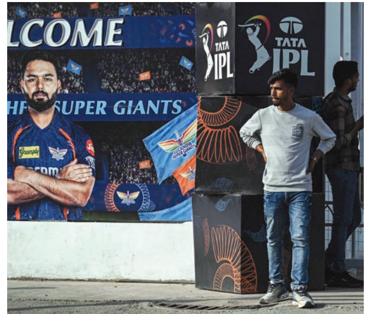
Cricket fans stand outside the Ekana Cricket Stadium in Lucknow yesterday, after the Indian Premier League was suspended for a week.

More than 50 people have been killed on both sides of the border since Wednesday, in the worst violence in decades between the South Asian neighbours.