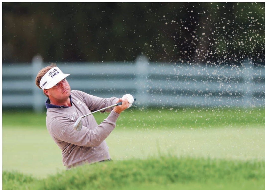
Keith Mitchell hits out of a greenside bunker on the second hole during the second round of the Truist Championship 2025 at The Wissahickon at Philadelphia Cricket Club in Flourtown, Pennsylvania.

McIlroy made six birdies and three bogeys, twice answering bogeys with birdies on the next hole, to share fourth with South Korean Kim Si-woo and Americans Justin Thomas, Akshay Bhatia, Collin