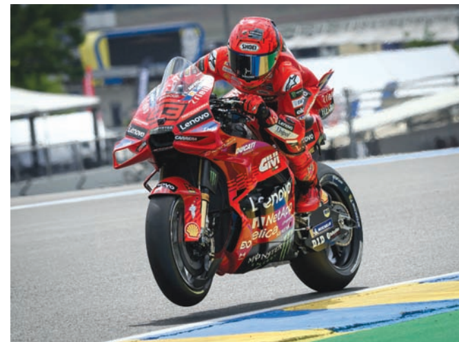
Ducati Lenovo Team's Spanish MotoGP rider Marc Marquez rides during a France Moto GP Grand Prix free practice session at the Le Mans Circuit yesterday.

He then suffered another crash which necessitated another operation on his left hand at the end of February, just before the opening round of the season in Thailand.