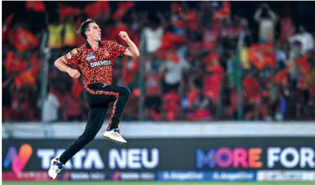
Sunrisers Hyderabad's captain Pat Cummins celebrates after taking the wicket of Delhi Capitals' Karun Nair during the IPL match in Hyderabad yesterday.

Australia's Cummins struck on the first ball of the match and had the opposition reeling at 62-6, before Ashutosh Sharma and Tristan Stubbs put on 66 runs