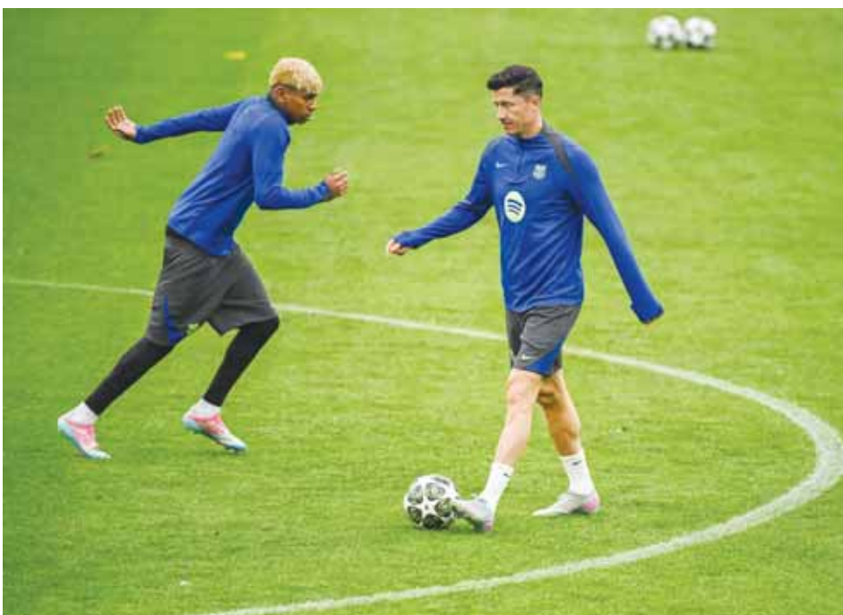
Barcelona's Lamine Yamal (left) and Robert Lewandowski train yesterday, on the eve of the Champions League semi-final second leg against Inter Milan.

Kounde and Balde absences will pose a massive challenge for Flick with Barca struggling to stop Inter's counter-attacks in the first leg, mainly with Denzel Dumfries who was a constant menace from the right, scoring two goals and handing one assist. "As a coaching staff, we analyse