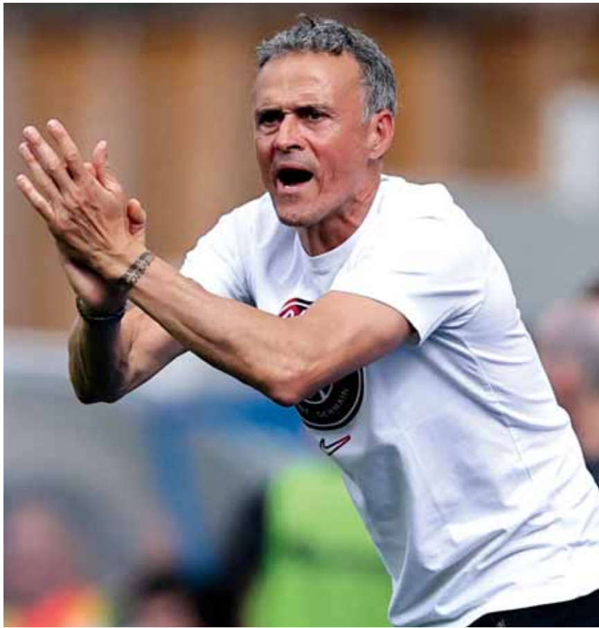
Luis Enrique has introduced a distinct philosophy in the French capital, one where no individual rises above the collective.

Yet, months later, his approach appears vindicated. PSG have evolved into one of the most cohesive and tactically disciplined sides in Europe this season. Central to their resurgence has been an emphasis on pressing as a unit and maintaining balance be-