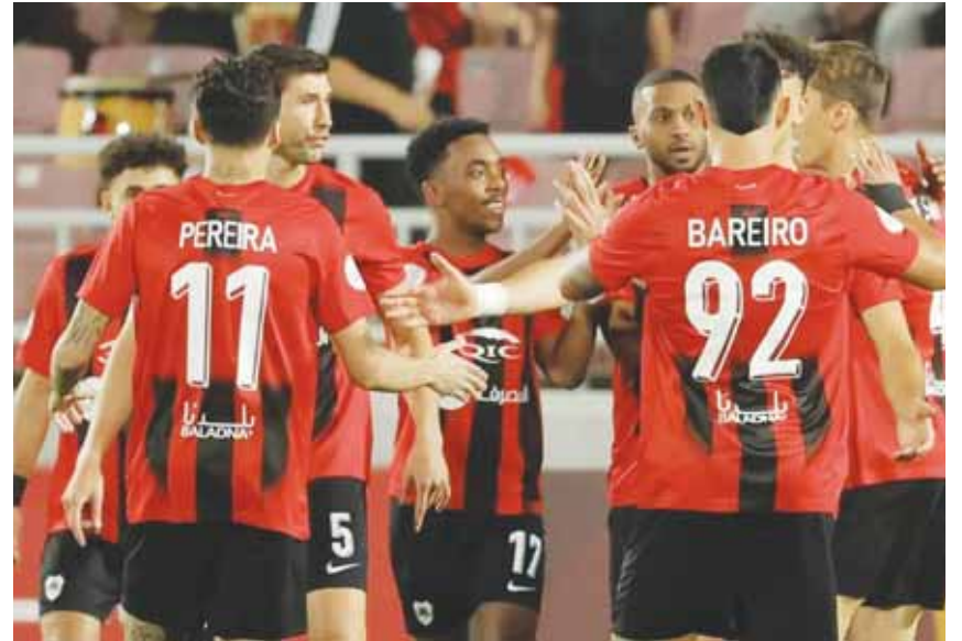
Al Rayyan players celebrate after their hard-fought win over Lusail at Abdullah bin Khalifa Stadium yesterday.