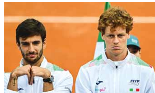
Italy's Jannik Sinner (right) and Matteo Berrettini attend a celebration ceremony for Italy's Davis Cup and Billie Jean King Cup victories at Foro Italico sports complex, ahead of the Italian Open, in Rome yesterday.

"With this win, I put myself back in a good position when it comes to ranking and seeding," said Ruud, who jumped eight spots in the rankings and returned to the top 10 ahead of the year's second Grand Slam starting on May 25. "If you want to win a tournament it doesn't really matter what your ranking is because you have to beat every player you play anyways."