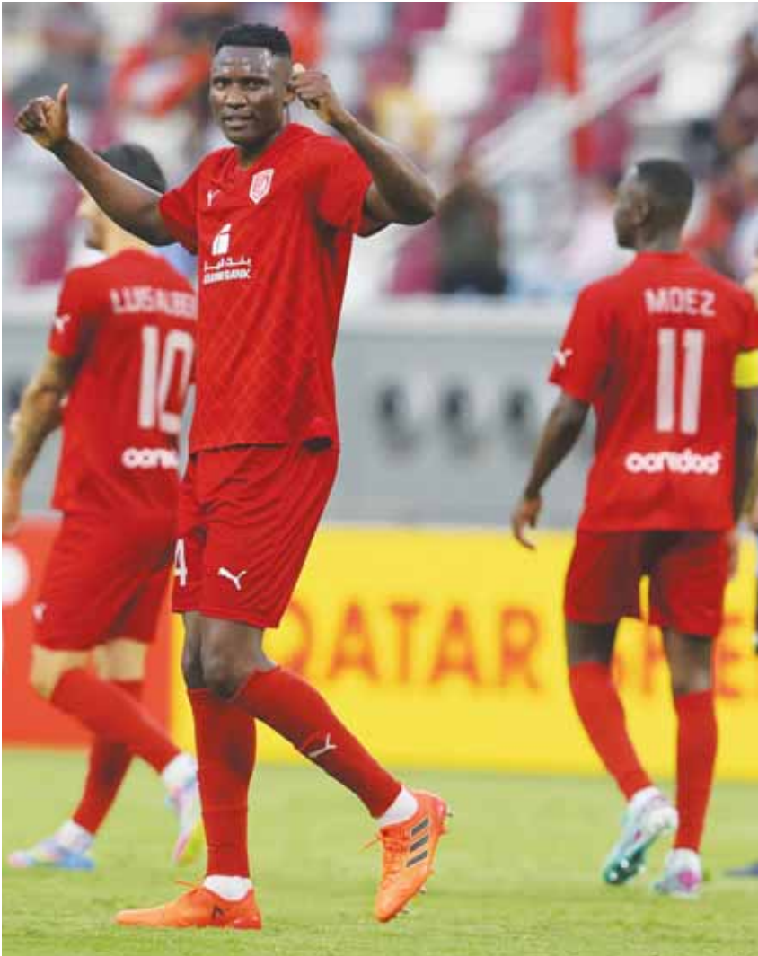
Michael Olunga struck twice in Al Duhail's win over Al Sailiyya yesterday.