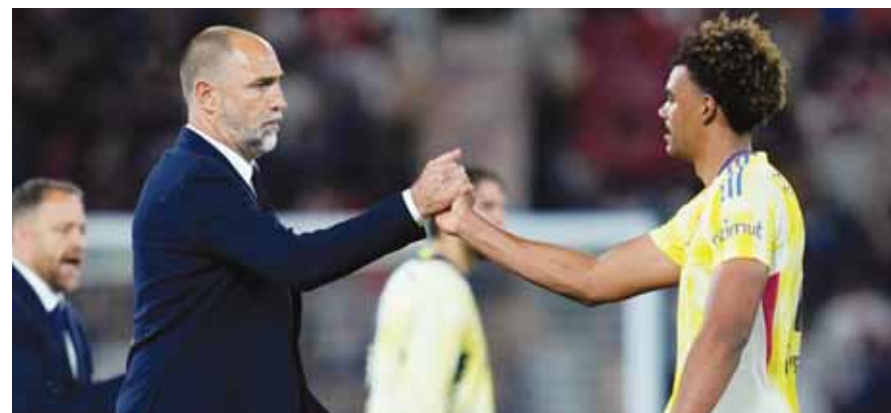
Juventus' Renato Veiga shakes hands with coach Igor Tudor after their Serie A match against Bologna yesterday.