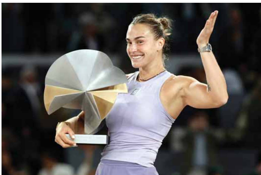
Aryna Sabalenka of Belarus poses with her trophy after beating Coco Gauff of the US in the 2025 Madrid Open final match at the Caja Magica in Madrid yesterday.

up the first set in 35 minutes with her second set point as Gauff sliced wide.