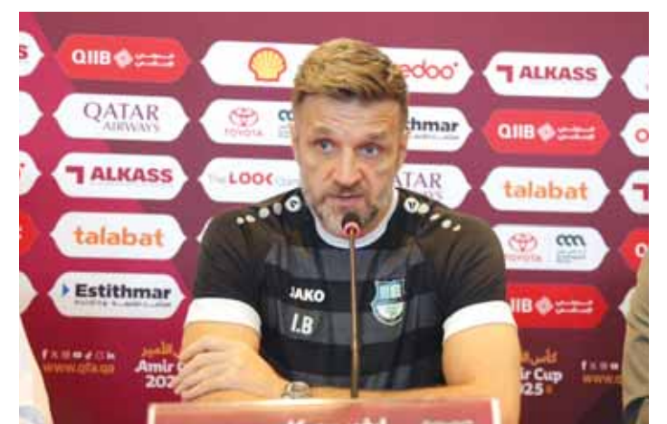
Al Ahli's coach Igor Biscan speaks at a press conference yesterday.

Qatar SC, who were runners-up in last season's Amir Cup after narrowly losing the final to Al Sadd, hope to go far this year despite finishing 10th in the league with 23 points. Moroccan coach Youssef Safri will turn to standout talents like Percy Tau and Ahmed Abdel Kader.