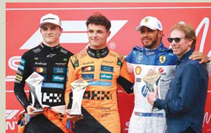
Sprint winner Lando Norris (centre) of McLaren is seen with teammate Oscar Piastri (left) and Lewis Hamilton (second right) of Scuderia Ferrari in Miami, Florida.

"I really, really did struggle on the inters - everyone was struggling on them. I made that call at that end and I said I'm coming in because I was going nowhere. Take the risk, take the gamble and it paid off. I wish we had another couple of laps to give these guys a bit of a fight, but big congrats to McLaren," Hamilton added.