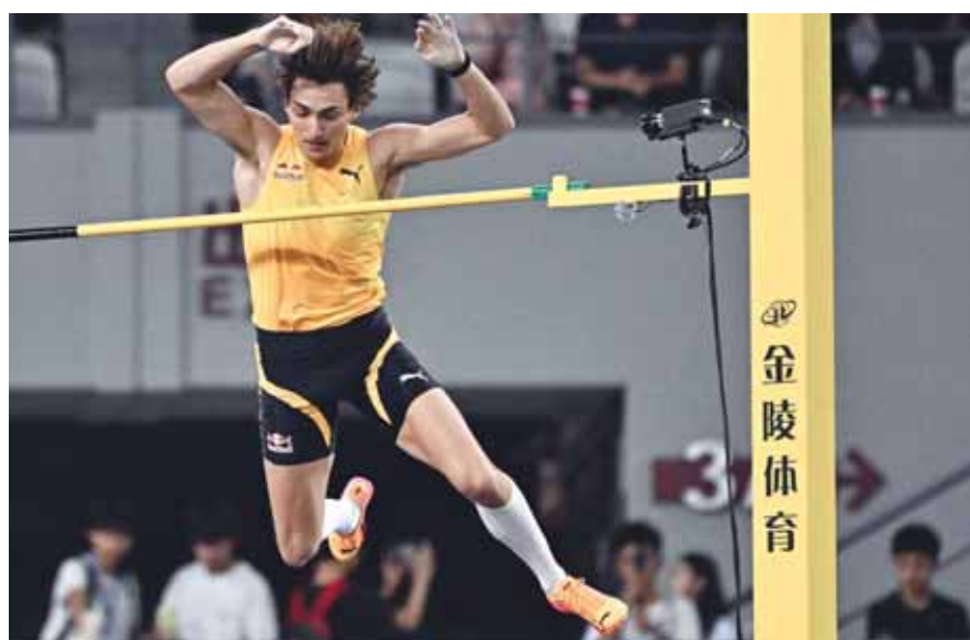
Sweden's Armand Duplantis competes in the pole vault event during the Shanghai/Keqiao Diamond League athletics meeting in Keqiao, Shaoxing in China's eastern Zhejiang province yesterday. Right: USA's Cordell Tinch celebrates after the 110m hurdles event.