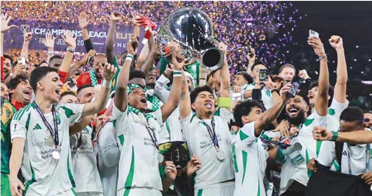
Al Ahli's Roberto Firmino lifts the trophy as he celebrates with teammates after winning the Asian Champions League in Jeddah.

"We are so proud," Al Ahli goalkeeper Mendy said. "Once we knew that the final eight would be in Jeddah, it was our goal to be champions in front of our fans. Since I came here 18 months ago, they supported us so much. As I said when I signed here, it's to make history, to continue to win trophies and make this club as big as it was before. The secret is the team effort. If someone makes the effort it will make it easier for the one next to him. We just played like this; you saw the fire, you saw