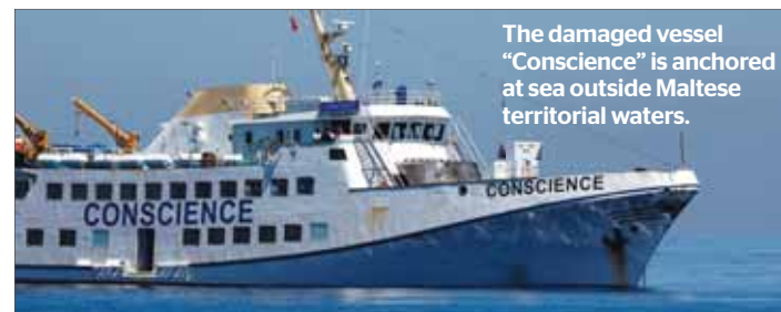
The damaged vessel "Conscience" is anchored at sea outside Maltese territorial waters.

for those responsible to be held accountable. The Ministry emphasised that the obstruction of humanitarian aid deliveries to Gaza and the targeting of fishermen's boats further aggravate the humanitarian crisis in the besieged enclave, which suffers from severe food shortages due to the ongoing Israeli blockade of border crossings for two months. The Ministry renewed Qatar's call on the international community to pressure Israel to ensure the safe, sustainable, and unrestricted entry of humanitarian aid to all areas of Gaza. (QNA)