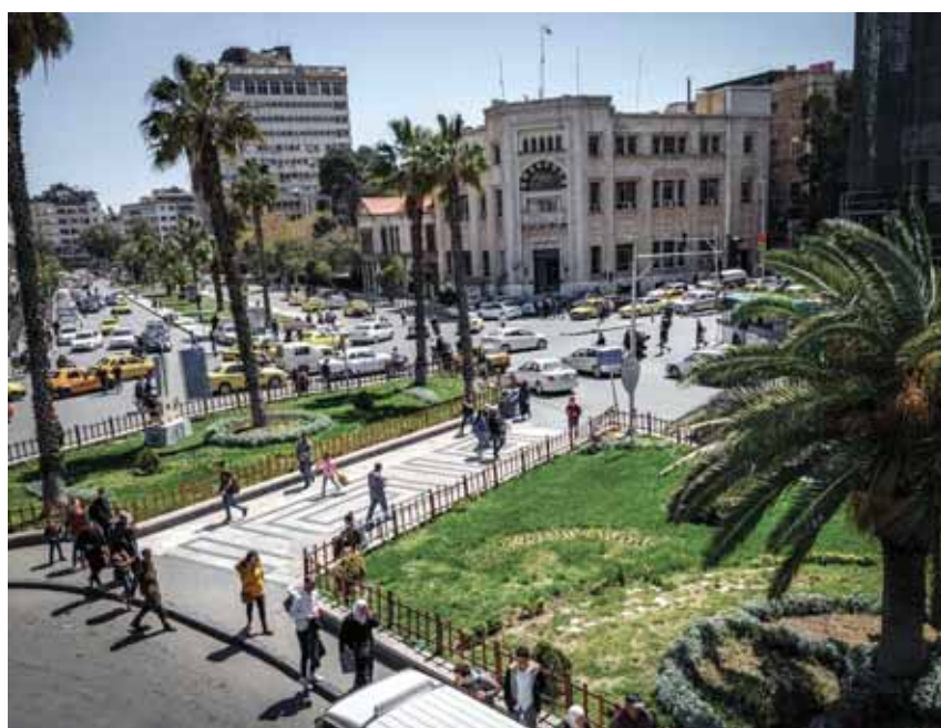
A view of downtown Damascus. (File photo)

Qatar has been leveraging international forums such as the UN General Assembly