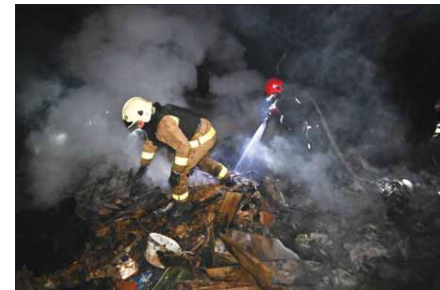
Ukrainian rescuers extinguish a fire at a house after a drone strike on Kharkiv early yesterday.

Pictures posted online showed firefight-