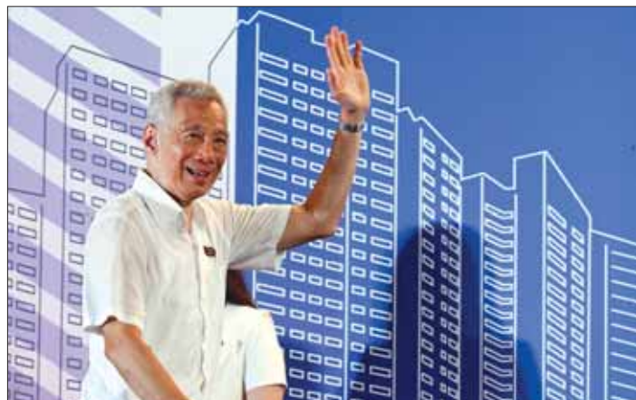
Singapore Senior Minister Lee Hsien Loong of People's Action Party waves to his supporters at the party's gathering during the general election results in Singapore.

The long-running family row centres on allegations made by Lee Hsien Yang that his brother is seeking to block the demolition of a family bungalow to capitalise on Lee Kuan Yew's legacy - something he has denied. Last year former transport minister S Iswaran was thrown in jail for graft and in 2023,