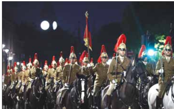
Members of the Household Cavalry take part in an overnight rehearsal for the VE Day 80 procession in central London.

"In the midst of the first full-scale war in Europe since the Second World War, it is fitting that the Ukrainian Armed Forces currently fighting on the frontline of free-