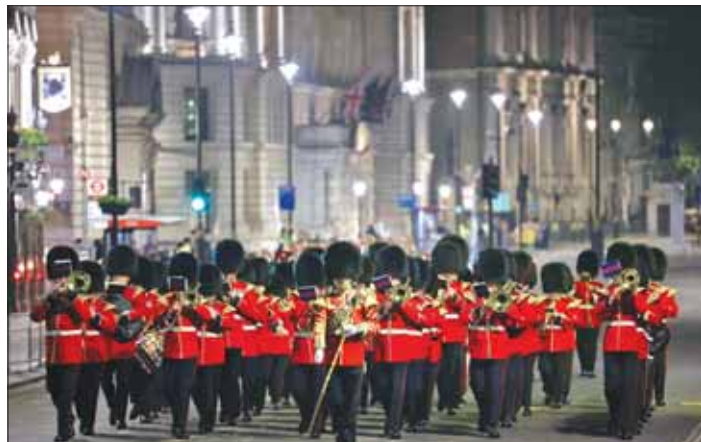
A military band takes part in an overnight rehearsal for the VE Day 80 procession on Whitehall in central London.

The Ukraine representatives on the VE Day march on Monday will comprise those deployed on Operation Interflex, the UK's training programme for Ukrainian recruits, delivered with 12 partner nations. "Eighty years after VE Day, we