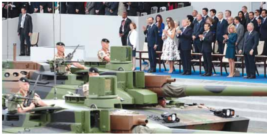
This picture taken on July 14, 2017 shows (bottom row, from right) French Senate President Gerard Larcher, French First Lady Brigitte Macron, French President Emmanuel Macron, US President Donald Trump, US First Lady Melania Trump, French Prime Minister Edouard Philippe and French Defence Minister Florence Parly watching members of the 5e Regiment de Cuirassiers ride by in tanks as they attend the annual Bastille Day military parade on the Champs-Elysees avenue in Paris.

Trump "will honour American Veterans, active-duty service-