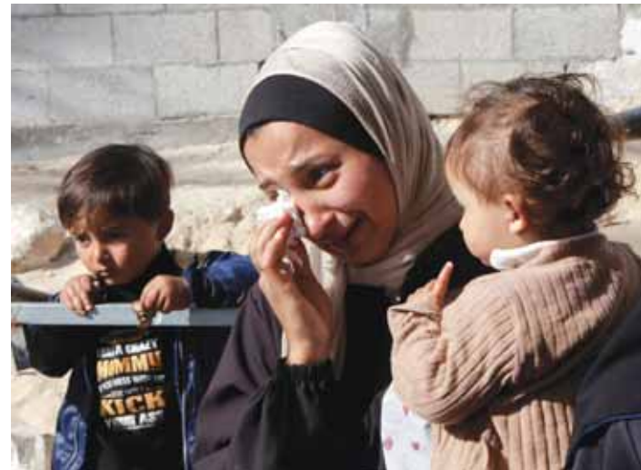
A woman reacts as she attends the funeral of Palestinians killed in Israeli strikes, in Khan Younis, southern Gaza Strip, yesterday.

The international community commemorates World Press Freedom Day annually on May 3, following its designation by the UN General Assembly in December