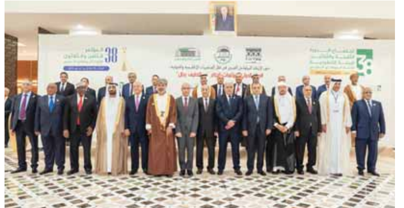
Participants of the 38th Conference of the Arab Inter-Parliamentary Union.

of this mechanism by instituting the principle of 'one country, one vote' akin to the model employed by the UN General Assembly, thereby ensuring equitable representation and procedural justice among all member states.