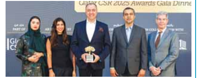
Alfardan Group's recognition highlights its leadership in sustainable innovation and community empowerment.

the leading German company for tyres and automotive technology, the project at AlGassar Resorts addresses urgent waste challenges through creative and sustainable solutions.