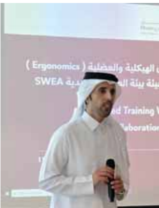
workshop was intended to train occupational safety and health administration inspectors and