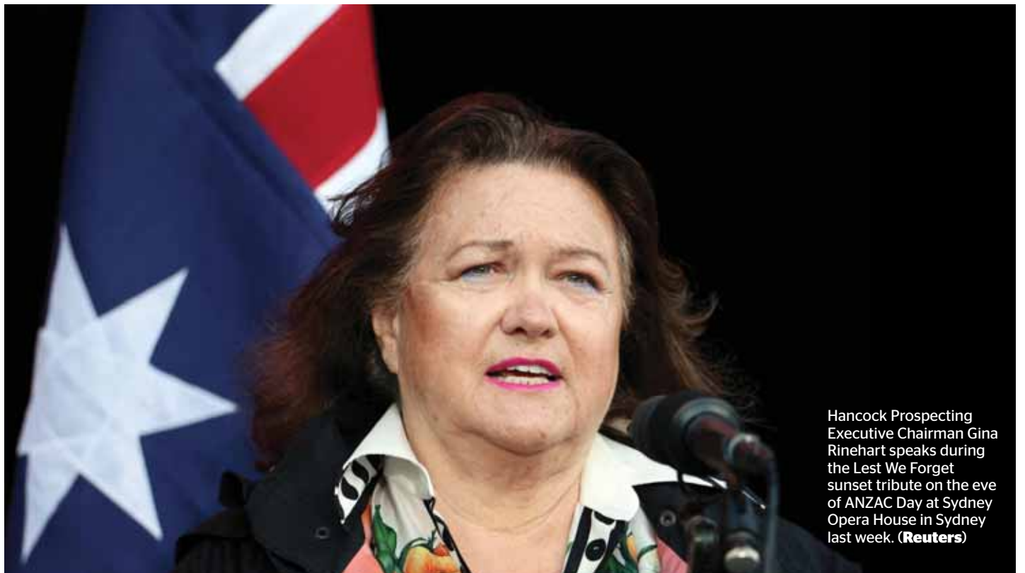
Hancock Prospecting Executive Chairman Gina Rinehart speaks during the Lest We Forget sunset tribute on the eve of ANZAC Day at Sydney Opera House in Sydney last week.