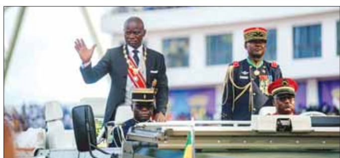
President of Gabon Brice Oligui Nguema (left) waves to the crowd from a vehicle as he parades around the arena during his swearing-in ceremony at a stadium in Libreville, yesterday.