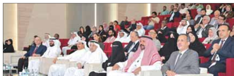
The event gathered scholars, healthcare practitioners, and policymakers to explore the integration of traditional healing practices with modern healthcare and represents an important platform for highlighting the contributions of Muslim scholars in medical fields.

search assistant professor at QU and assistant chairman of the Research Network Group of Traditional Complementary and Integrative Medicine, stressed that the event marks a significant milestone in the ongoing focus on complementary and integrative medicine, reaffirming its growing role in healthcare and academic education.