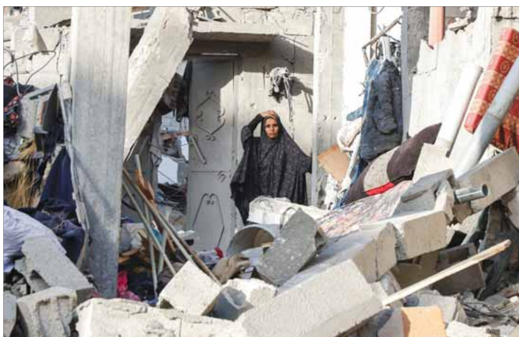
A Palestinian inspects the site of an Israeli strike on a house, in Khan Younis in the southern Gaza Strip, yesterday.

The Euro-Mediterranean Human Rights Monitor has documented a severe upsurge in natural deaths among adult residents of Gaza, along with alarming levels of child mortality, during the longest uninterrupted all-out siege imposed by the Israeli occupation forces since the onset of the genocide. It warned that famine in the Gaza Strip is aggravating to catastrophic levels, amid the continued imposition of an unlawful, all-encompassing blockade by the Israeli occupation forces for 62 consecutive days, and the persistent obstruction of humanitarian aid, life-saving medicines, and essential supplies. Euro-Med Monitor recorded dozens of mortalities, either due to malnutrition or the dearth of essential healthcare and medicines.