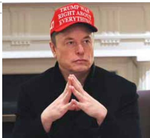
Tesla CEO Elon Musk wears a “Trump Was Right About Everything!” cap while attending a cabinet meeting at the White House, in Washington, DC, last March.

“Is Musk bigger than Tesla? The answer is yes,” he said.