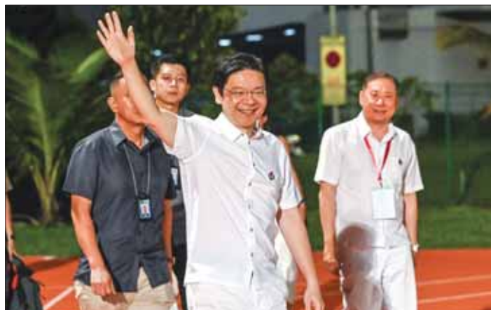
Singapore's Prime Minister Lawrence Wong (centre) of the People's Action Party gestures as he arrives at the party's gathering awaiting the vote count for the general election in Singapore yesterday.

Popular after leading Singapore's Covid task force, Wong took over last year from his predecessor Lee Hsien Loong, the son of founding premier Lee Kuan Yew who ruled the island state after its bitter break-up with Malaysia in 1965. Wong had warned Singa-