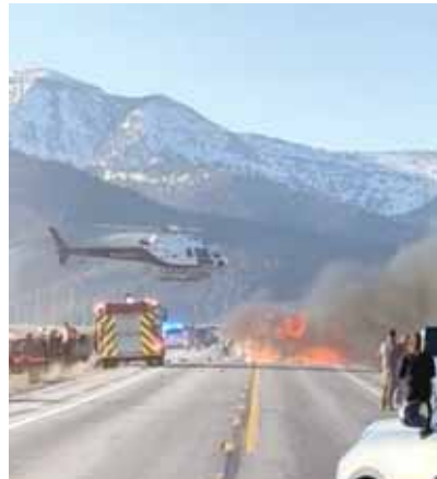
Rescue services are seen, in this image taken from social media, at the scene following a two-vehicle crash with multiple fatalities, according to Idaho State Police, in Island Park, Idaho.