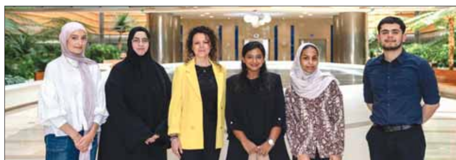
MENA ART will bring together leading scientists, clinicians, and industry experts from around the world to explore how flow cytometry and optical microscopy are shaping the future of precision medicine.

The launch event concluded with the honouring of QC, which was awarded a certificate of appreciation for its outstanding efforts in overcoming challenges, alleviating the suffering of people, and providing the best humanitarian services.