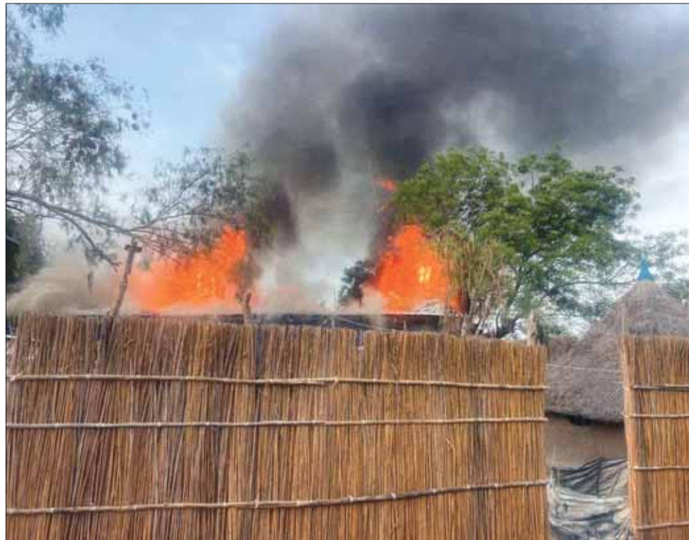
Fire burns following an aerial bombardment that resulted in casualties at the medical charity Medecins Sans Frontieres run facility destroying the last remaining hospital and pharmacy in the northern town of Old Fangak in Fangak county, South Sudan, yesterday.

South Sudan has formally been at peace since a 2018 peace deal ended a five-year