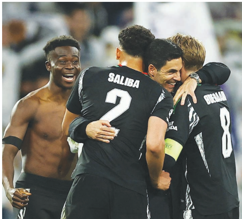
Arsenal manager Mikel Arteta (second right) celebrates with Bukayo Saka, William Saliba and Martin Odegaard after their win over Real Madrid.

But even then Arsenal were unflustered and quickly snuffed out any Madrid momentum. Full-backs Myles Lewis-Skelly and Jurrien