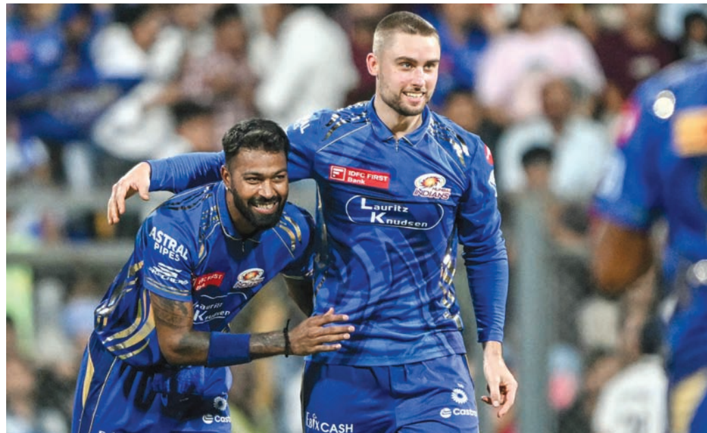
Mumbai Indians' Will Jacks (right) celebrates with Hardik Pandya after taking the wicket of Sunrisers Hyderabad's Ishan Kishan during the IPL match at the Wankhede Stadium in Mumbai yesterday.

Hyderabad openers Abhishek Sharma and Travis Head kicked off the first innings with a 59-run