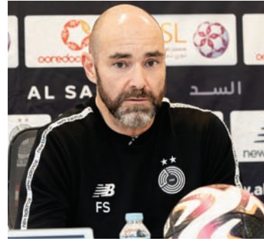
Sadd coach Felix Sanchez and his Duhail counterpart Christophe Galtier (below) address the media yesterday.