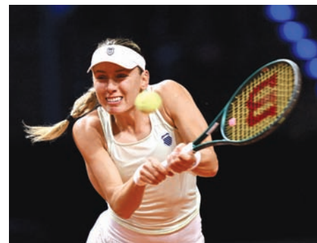
Russia's Ekaterina Alexandrova in action during her Stuttgart Open match against compatriot Mirra Andreeva yesterday.

Italian fifth seed Jasmine Paolini beat German Jule Niemeier 6-1, 7-5 to reach the Stuttgart quarters for the second straight year on Thursday. Alexandrova will face third-ranked