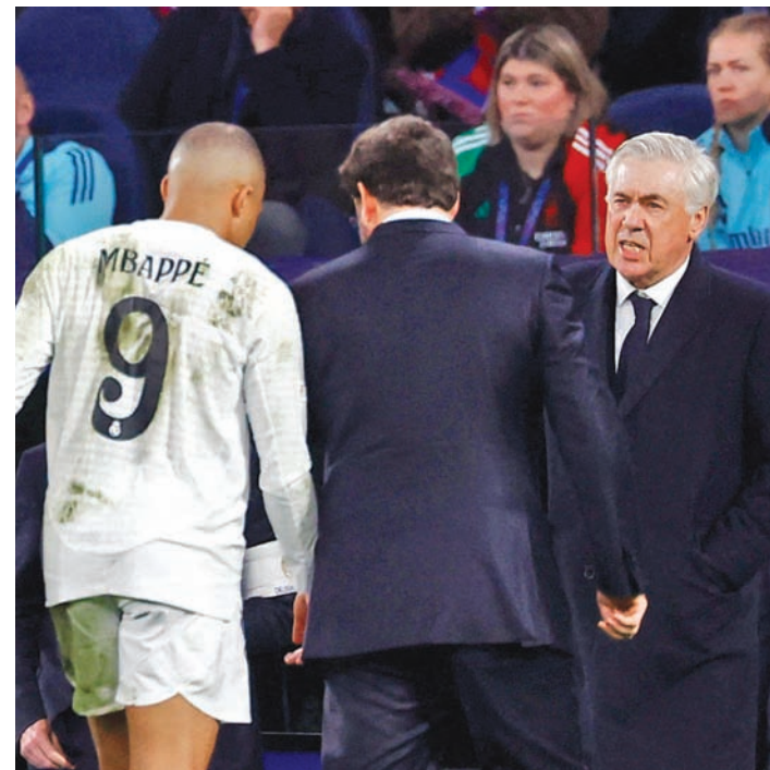
Real Madrid's Kylian Mbappe walks off the pitch after sustaining an injury as coach Carlo Ancelotti looks on during the Champions League quarter-final against Arsenal in Madrid.