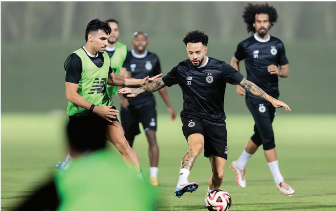
Al Sadd players train on the eve of their Qatar Stars League match against Al Ahli.

A victory against Al Ahli today will ensure Al Sadd defend their title