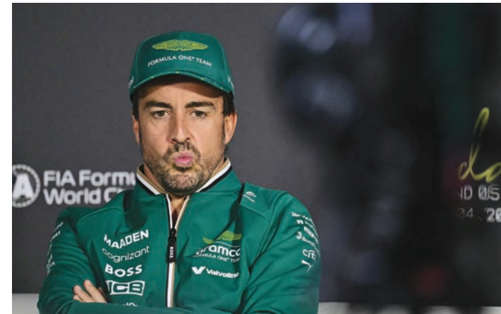
Aston Martin's Spanish driver Fernando Alonso looks on during a press conference ahead of the 2023 Saudi Arabian Grand Prix at the Jeddah Corniche Circuit yesterday.