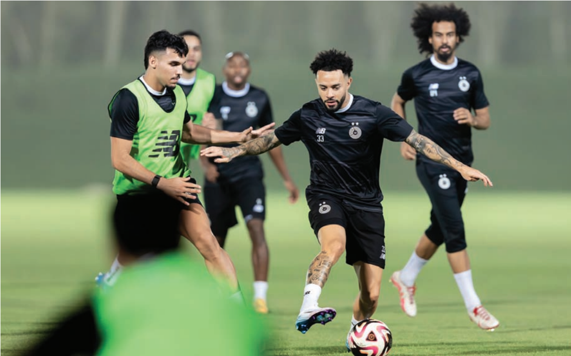
Al Sadd players train on the eve of their Qatar Stars League match against Al Ahli.

A victory against Al Ahli today will ensure Al Sadd defend their title