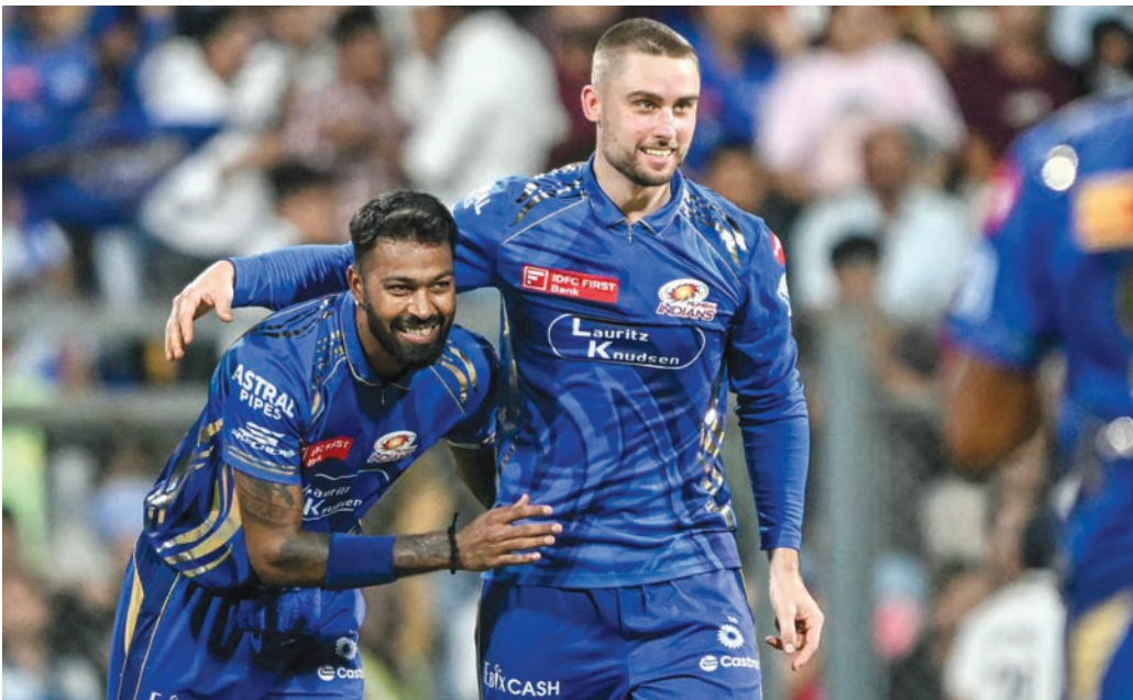
Mumbai Indians' Will Jacks (right) celebrates with Hardik Pandya after taking the wicket of Sunrisers Hyderabad's Ishan Kishan during the IPL match at the Wankhede Stadium in Mumbai yesterday.

Hyderabad openers Abhishek Sharma and Travis Head kicked off the first innings with a 59-run