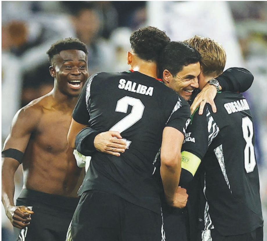
Arsenal manager Mikel Arteta (second right) celebrates with Bukayo Saka, William Saliba and Martin Odegaard after their win over Real Madrid.

But even then Arsenal were unflustered and quickly snuffed out any Madrid momentum. Full-backs Myles Lewis-Skelly and Jurrien