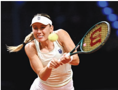
Russia’s Ekaterina Alexandrova in action during her Stuttgart Open match against compatriot Mirra Andreeva yesterday.

Italian fifth seed Jasmine Paolini beat German Jule Niemeier 6-1, 7-5 to reach the Stuttgart quarters for the second straight year on Thursday. Alexandrova will face third-ranked