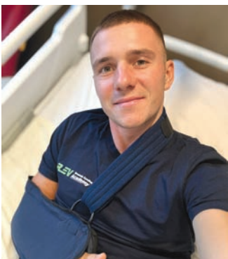
A photo Remco Evenepoel tweeted in December 2024.

He also admitted he had been drained by the crash, even imagining premature retirement. He