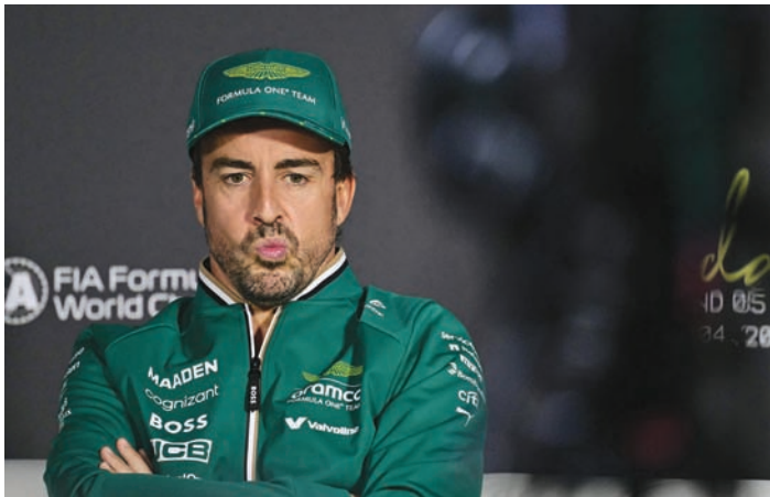
Aston Martin’s Spanish driver Fernando Alonso looks on during a press conference ahead of the 2023 Saudi Arabian Grand Prix at the Jeddah Corniche Circuit yesterday.