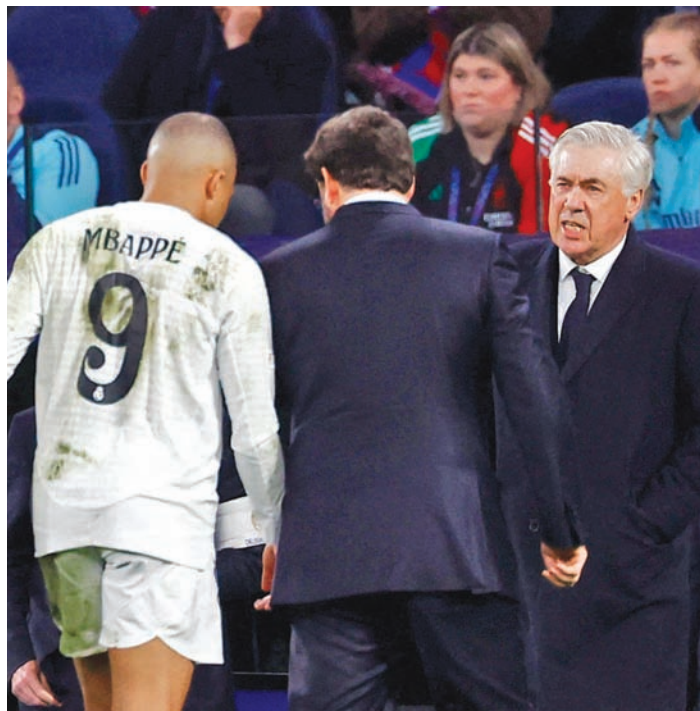
Real Madrid's Kylian Mbappe walks off the pitch after sustaining an injury as coach Carlo Ancelotti looks on during the Champions League quarter-final against Arsenal in Madrid.