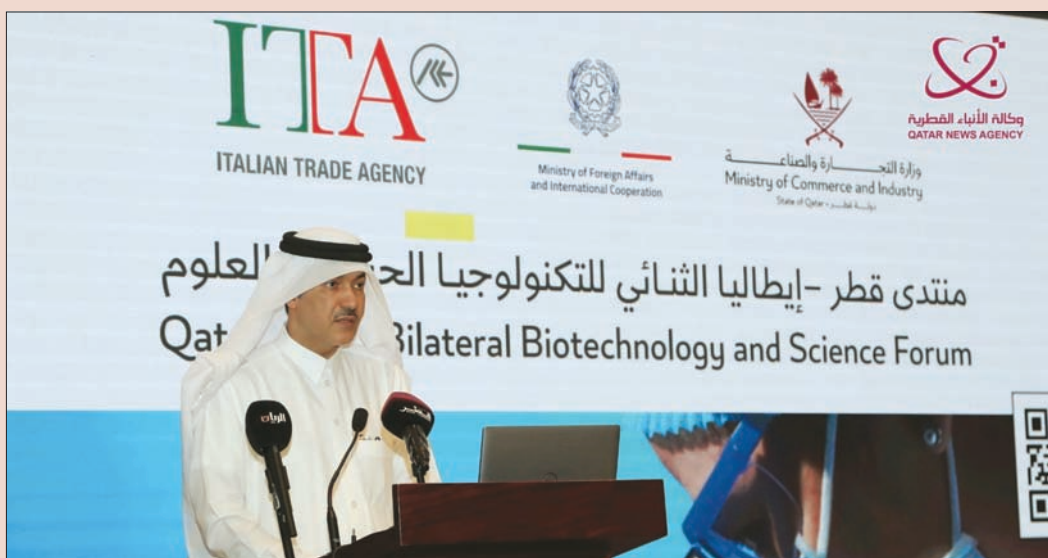
In his opening remarks at the forum, HE the Minister of State for Foreign Trade Affairs at the Ministry of Commerce and Industry, Dr Ahmed bin Mohammed al-Sayed emphasised the depth of bilateral relations between Qatar and Italy, noting the growing partnerships between the two countries.