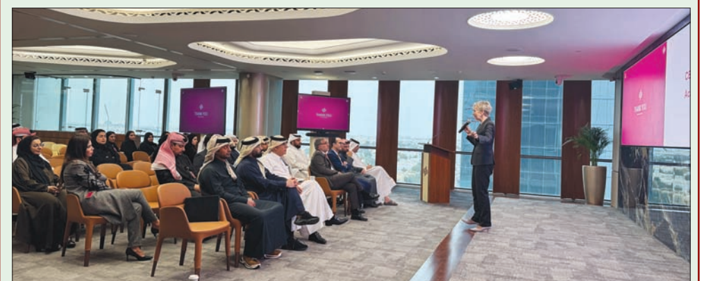
The specialised programme has been designed for nationals seeking to enhance their banking expertise and develop key competencies for roles in Relationship Management and Credit Risk Analysis