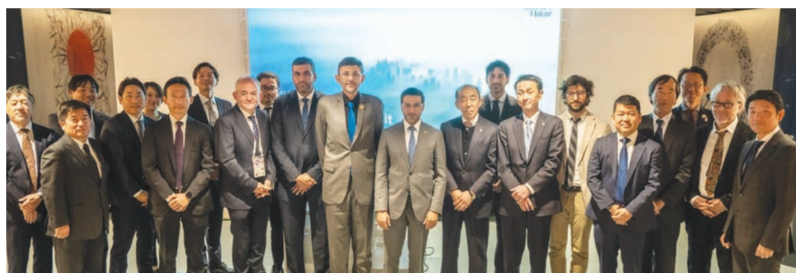
The roundtable reflects the continued collaboration between Invest Qatar and JETRO that was formalised in July 2023 through a Memorandum of Understanding

tioning Qatar as a preferred investment destination and fostering fruitful partnerships that drive sustainable economic development. In 2024, the bilateral trade volume between Japan and Qatar reached $7.7bn, highlighting the strong economic partnership between the two nations. By focusing on areas of mutual interest and expertise such as healthcare, agricul-