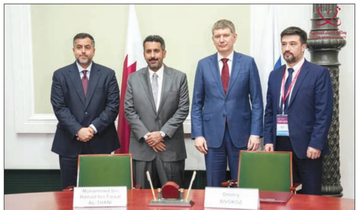
On the sidelines of the visit of His Highness the Amir Sheikh Tamim bin Hamad al-Thani to the Russian Federation, HE the Minister of Commerce and Industry Sheikh Faisal bin Thani bin Faisal al-Thani, and Minister of Economic Development of the Russian Federation Maxim Reshetnikov inaugurated the Qatar-Russia Business Forum yesterday.