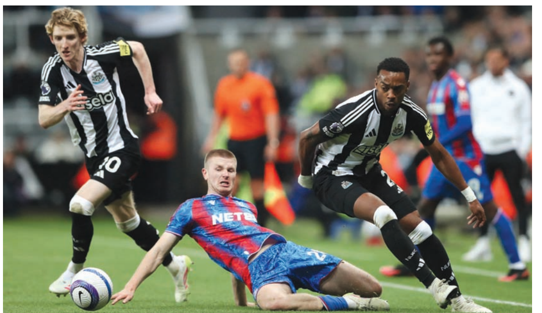
Crystal Palace's Adam Wharton in action with Newcastle United's Anthony Gordon and Joe Willock during their Premier League match against at St James' Park, Newcastle, Britain, yesterday.

However, the Swedish striker finally got his 25th goal of the season with a fine finish from outside the area just before the hour mark.