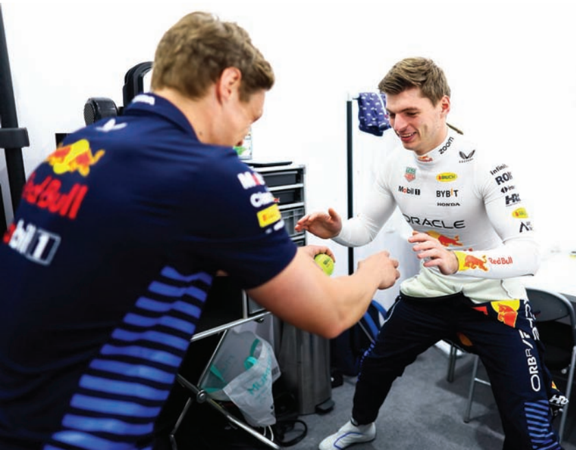
Max Verstappen slipped to third in the drivers' standings, eight points behind McLaren's leader Lando Norris, after trailing in sixth, over half a minute behind Norris's teammate Oscar Piastri, in Bahrain.

Horner, in a post-race media encounter in Red Bull's hospitality tent, had offered