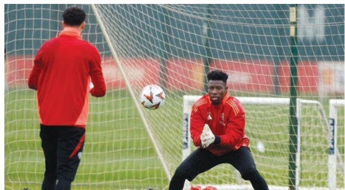
Manchester United's Andre Onana during training.