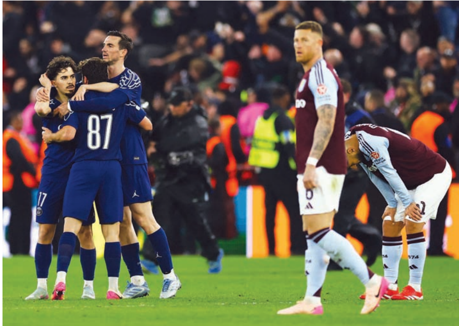
Paris St Germain's Vitorinha, Joao Neves and Fabian Ruiz celebrate after their win as Aston Villa players look dejected after Champions League quarter-final in Birmingham.

The Paris coach that night was Unai Emery, with Luis Enrique on the Barcelona bench. Fast forward eight years and the two men were