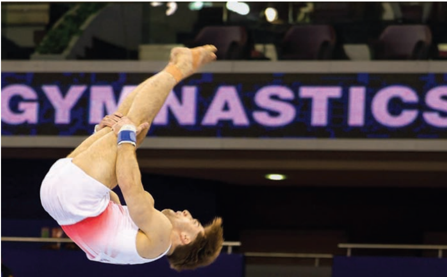
Gymnasts during qualifying on day one of the 17th edition of the Artistic Gymnastics World Cup which got underway in Doha yesterday.

Today, the qualifications will continue with the remaining five apparatus: the men will compete on vault, parallel bars, and horizontal bar, while the women will