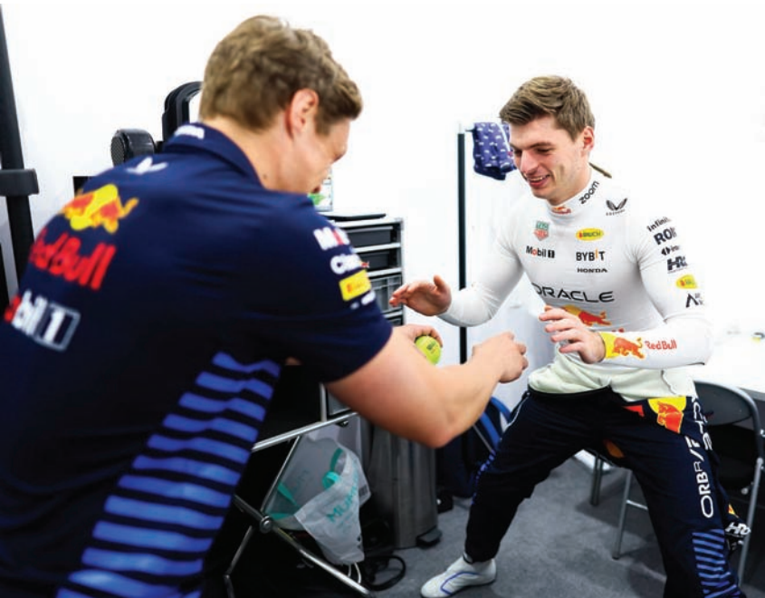
Max Verstappen slipped to third in the drivers' standings, eight points behind McLaren's leader Lando Norris, after trailing in sixth, over half a minute behind Norris's teammate Oscar Piastri, in Bahrain.