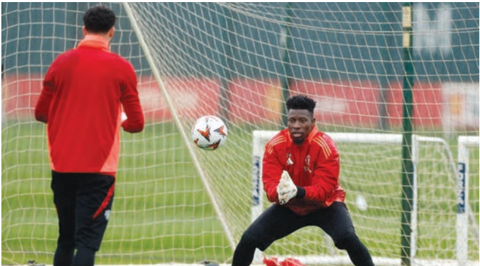
Manchester United's Andre Onana during training.