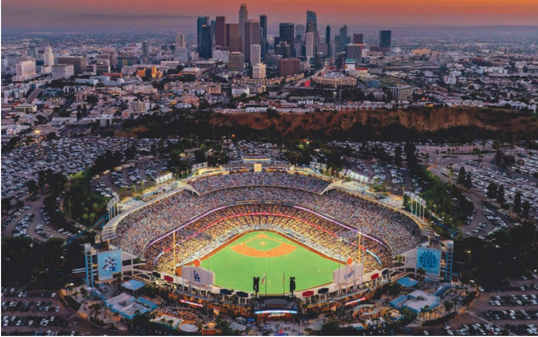
Baseball will take place at Dodger Stadium, the home of the Los Angeles Dodgers, which also hosted the sport at the 1984 Los Angeles Olympics.