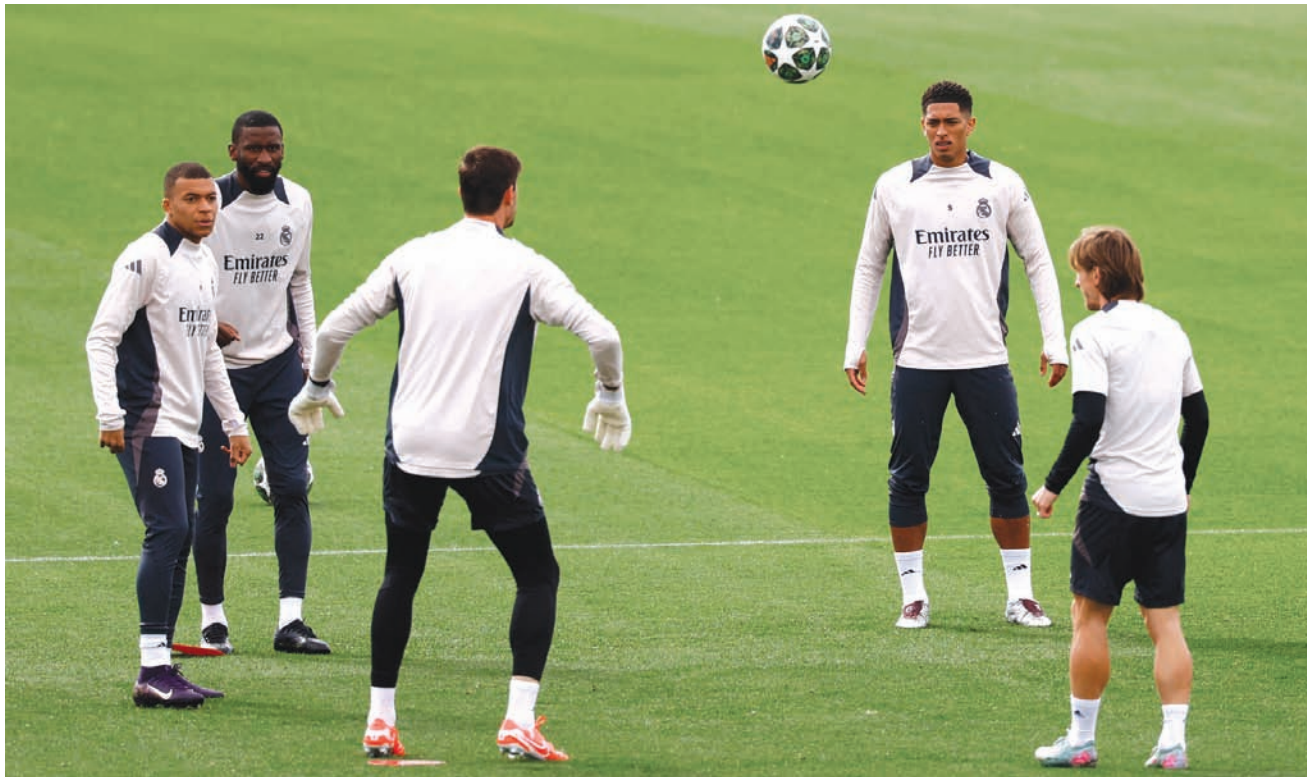
Real Madrid's Jude Bellingham, Antonio Rudiger, Kylian Mbappe, Luka Modric and Thibaut Courtois during a training session in Madrid yesterday, on the eve of the Champions League second leg quarter-final against Arsenal.

Bellingham said Madrid players had to use the fans' energy at the Bernabeu to help fuel them as they bid to add another spectacular European night to an ever-growing