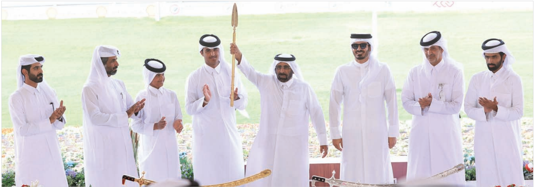
HE the Minister of Interior and Commander of the Internal Security Force (Lekhwiya), Sheikh Khalifa bin Hamad bin Khalifa al-Thani crowned the winners at the grand finale of the annual Purebred Arabian Camel Racing Festival for the sword of His Highness the Amir Sheikh Tamim bin Hamad al-Thani at the Al Shahaniya Camel Racetrack yesterday

Muba'dah, owned by Al Shahaniya Camels, won the title of the main round for Omani camels and the Golden Shalfa prize and QR1mn after coming in first place with a time of 12:32:91 minutes. Al Qahidiyah, owned by Al Shahaniya Camels, came in second place and won a prize of QR500,000 riyals after recording a time of 12:34:74 minutes, while Al Gham, owned