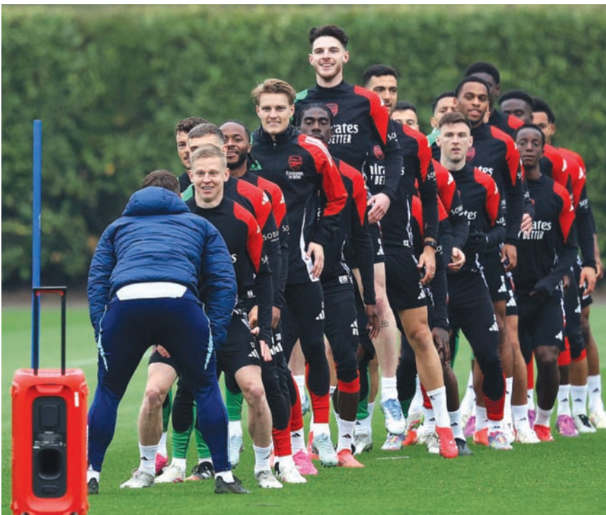
Arsenal's players take part in a training session at the club's training centre.