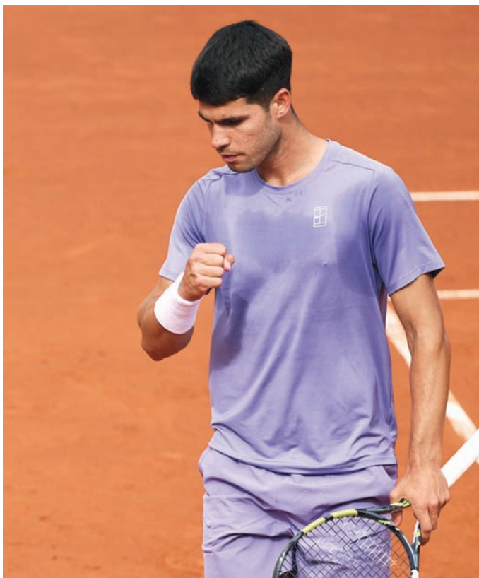
World number two Carlos Alcaraz celebrates a point against Ethan Quinn during their Barcelona Open match yesterday. Alcaraz won 6-2, 7-6 (8/6) to reach last 16.

"I'm happy to be back in Barcelona and get a straight-sets win," said Ruud. "One year ago, I had one of the best weeks of my life, so the memories come back."