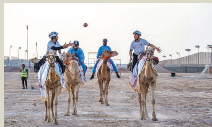
Action from one of the matches in the 4th International Camel Handball Championship.