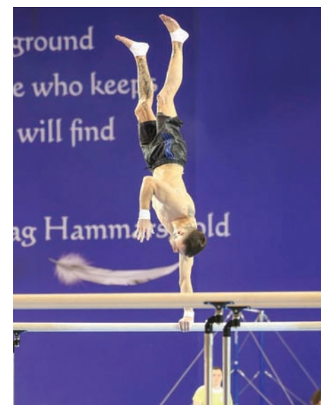
Gymnasts train at the Aspire Dome yesterday, ahead of the Artistic Gymnastics World Cup Doha.