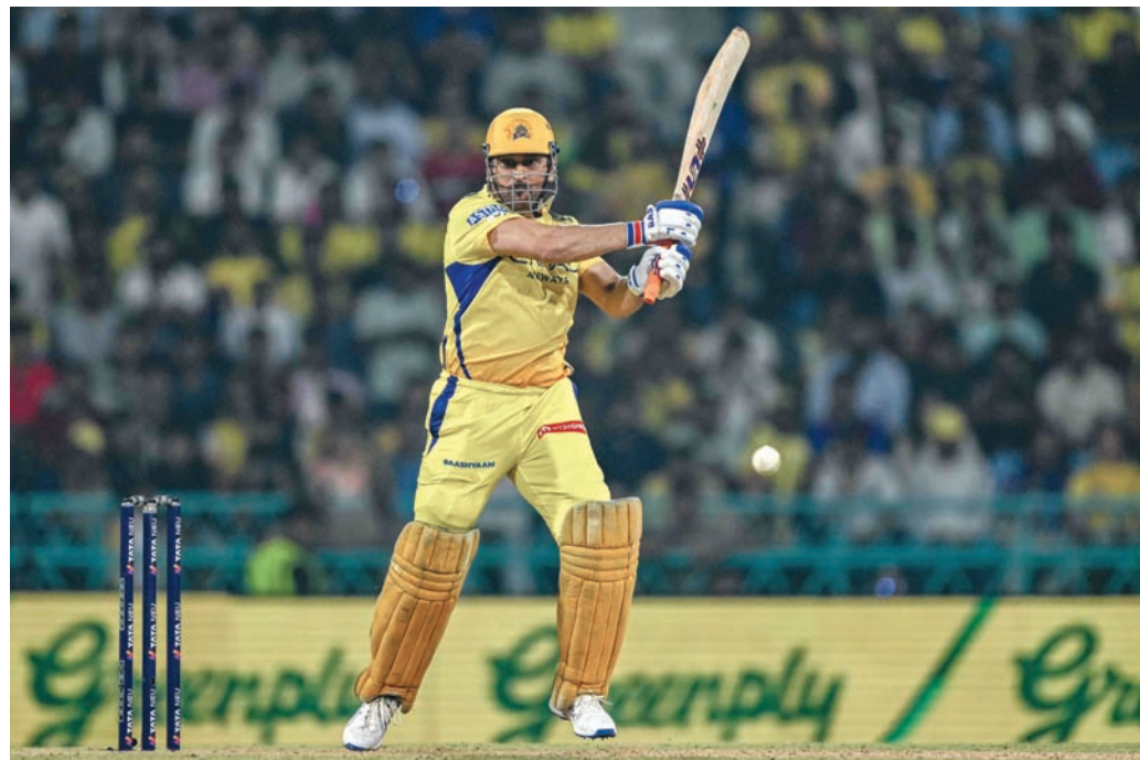
Chennai Super Kings' captain M S Dhoni plays a shot during the IPL match against Lucknow Super Giants at the Ekana Cricket Stadium in Lucknow yesterday.

Pace bowler Avesh Khan struck first to cut short Rasheed's knock on 27 and Lucknow's ploy to bring in part-time spinner Aiden Markram worked when the South African dismissed the left-handed Ravindra.