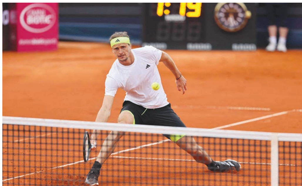
Germany's Alexander Zverev returns the ball to France's Alexandre Muller (not in picture) during their singles match of the Munich Open in Munich, southern Germany, yesterday.

Zverev has played six tournaments since losing the Australian Open final in three sets to Sinner in January, but has not made it