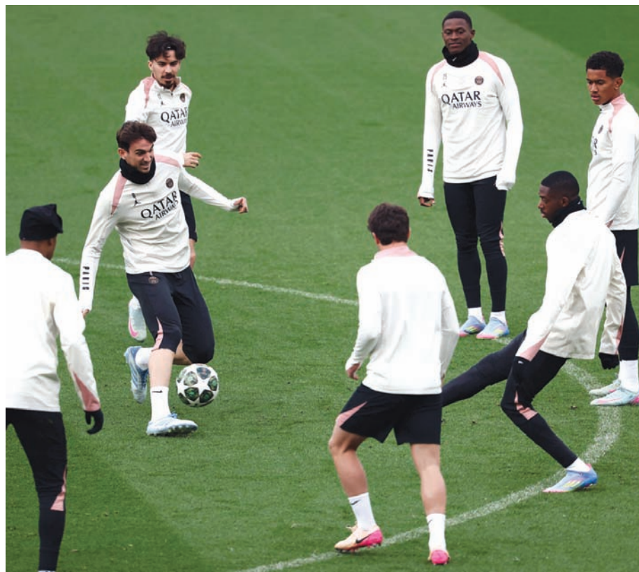
Paris Saint-Germain players take part in a team training session at Villa Park in Birmingham, central England, on the eve of their UEFA Champions League match against Aston Villa.

Enrique added that he expected the home supporters to create a daunting atmosphere at Villa Park, but called on his side to embrace the challenge. "We want to try to solve the problems that Aston Villa are going to present us with," he added. "Our objective is to win. For us, it's always about being competitive in a stadium like Villa Park. We like to play at home and away. It's not a problem but a motivation."