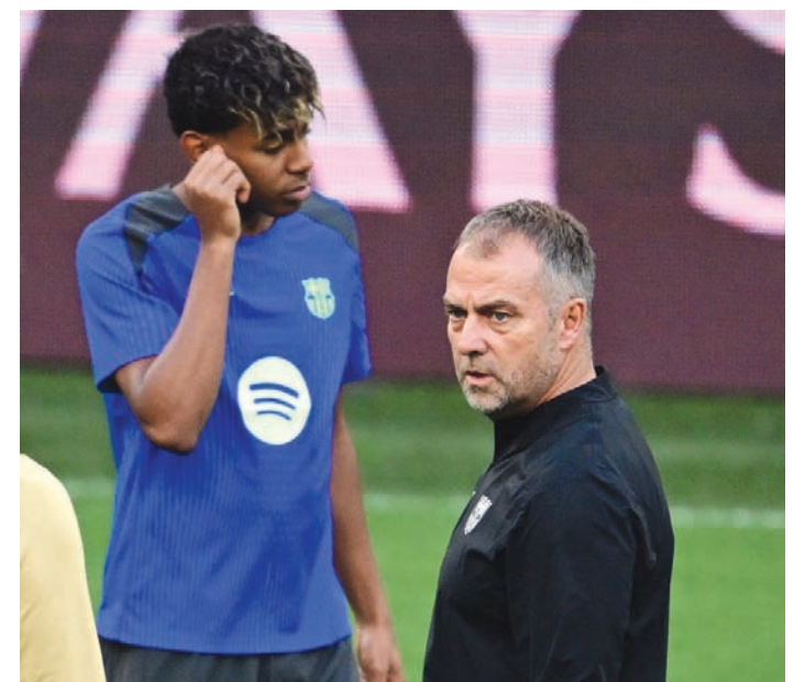
Barcelona's forward Lamine Yamal (left) and head coach Hansi-Dieter Flick attend a training session in Dortmund, western Germany.

The 34-year-old will play at Dortmund's Westfalenstadion, where the Poland goalie thought his career ended when he hung up his gloves after a 1-1 draw with France at Euro 2024. "I was on the beach a few months ago but now I get to play with what I believe is the best team in Europe," he added. "Winning is a nice feeling. I missed that, so winning is the thing I enjoy the most."