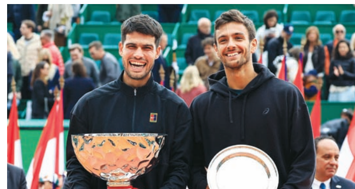
Spain's Carlos Alcaraz (left) with the trophy after winning against Italy's Lorenzo Musetti at the Monte Carlo Masters final on Sunday.