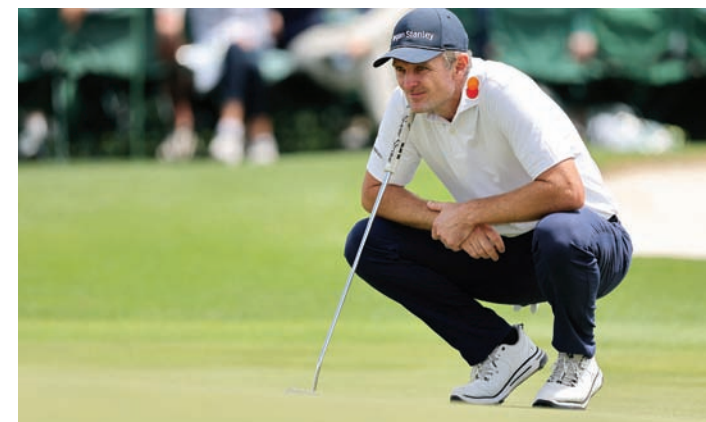
Justin Rose of England lines up a putt on the 18th hole during the second round of the 2025 Masters Tournament at Augusta National Golf Club in Augusta, Georgia.