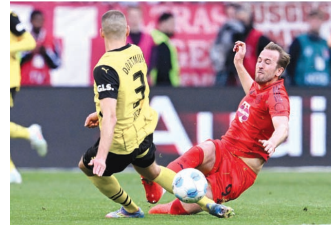
Borussia Dortmund's Waldemar Anton (left) vies for the ball with Bayern Munich's Harry Kane.

Bayern remain six points ahead of Leverkusen and closing in on regaining the title. Nursing an ongoing Achilles injury, Bayern centre-back Kim Minjae was substituted in the second half, leaving the Bavarians with just one fit central defender.