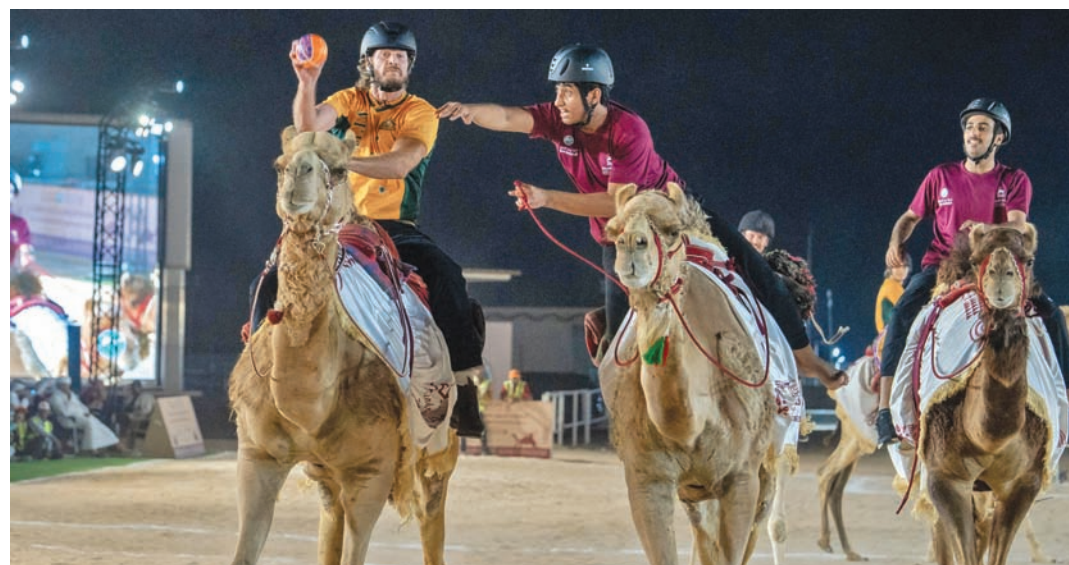
Action from Qatar's match against Australia on day two of the 4th International Camel Handball Championship currently being played at Libsear Heritage Village in Al Shahaniya. Qatar won 11-7.

The tournament has been a whirlwind of excitement, with teams displaying remarkable skill and determination. Morocco's