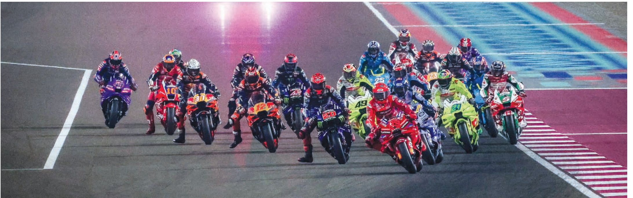
Ducati's Marc Marquez reclaimed the lead of the MotoGP world championship after leading every lap from pole position to win the Qatar GP sprint race at Lusail International Circuit.

Marc's younger brother Alex of Gresini Racing once again had to settle for second place