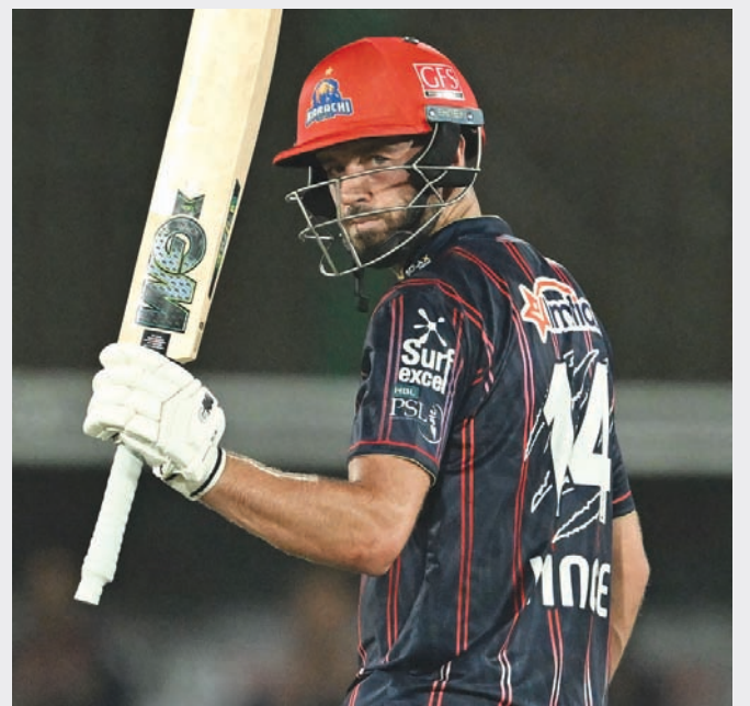
Karachi Kings's English batsman James Vince celebrates after scoring a half-century during the PSL match against Multan Sultans in Karachi yesterday. Batting first, Multan Sultans scored 234 for 3 in 20 overs. Karachi Kings, in reply, reached 236 for 6 in 19.2 overs thanks to Vince's brilliant 101 off 43 deliveries.