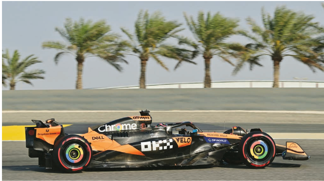
McLaren's Oscar Piastri drives during the qualifying session at the Bahrain International Circuit in Sakhir yesterday.

For Piastri, placed third in the championship 13 points behind his teammate, this was only his second ever pole, the first coming in China last month when he went on to win. As for Verstappen, the writing was on the wall as his evening had begun badly. "There's something really wrong