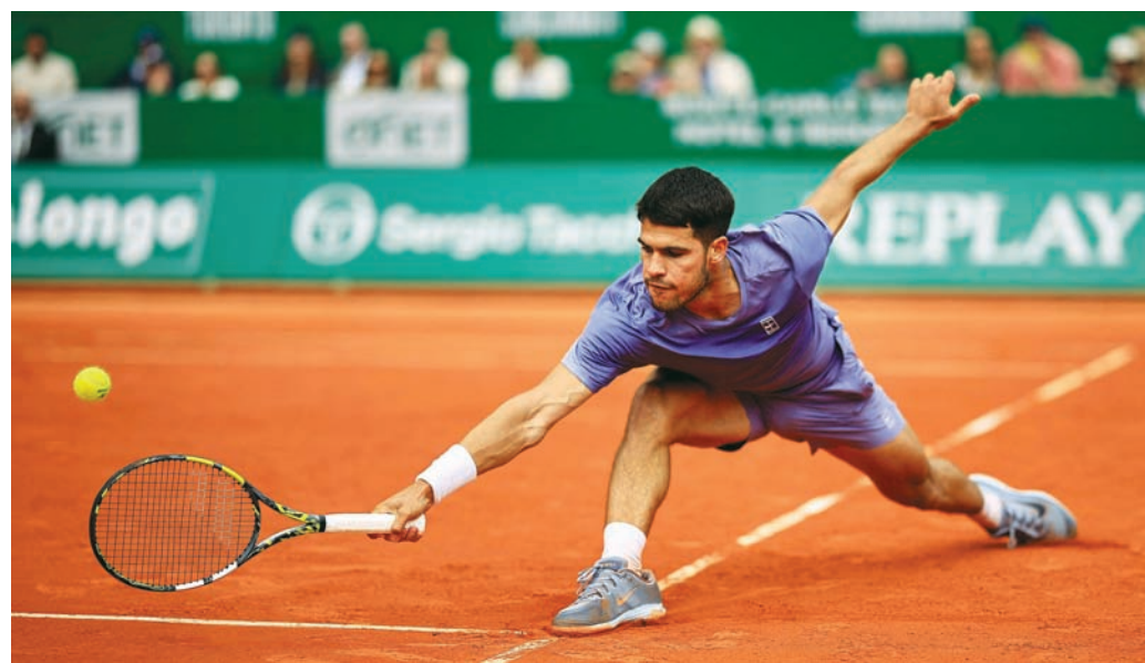
Spain's Carlos Alcaraz plays a backhand return to Spain's Alejandro Davidovich Fokina during the Monte Carlo Masters match at the Monte Carlo Country Club in Roquebrune-Cap-Martin yesterday.

Alcaraz quickly became the tournament favourite following early exits for top seed Alexander Zverev and Novak Djokovic, while world number one Jannik Sinner is still serving a doping ban.