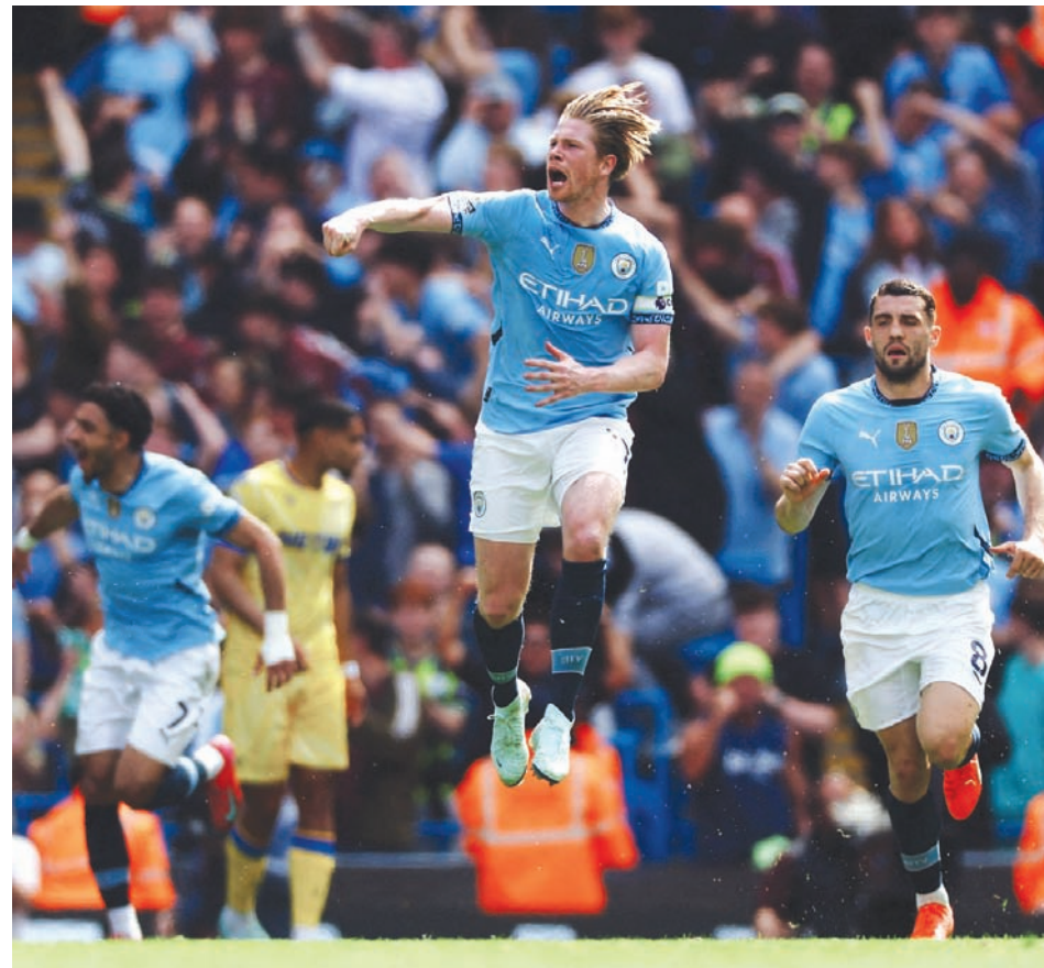
Manchester City's Kevin De Bruyne celebrates after scoring against Crystal Palace during the Premier League match at the Etihad Stadium in Manchester.

It appeared the Spaniard would get away with that risk as Saka and Odegaard were introduced seconds after Declan Rice teed up Thomas Partey to open the scoring on the break from a Brentford corner. But the Bees hit back with a well-worked set-piece of their own when Nathan Collins headed Michael Kayode's cross down and Yoane Wissa flicked in his 16th goal