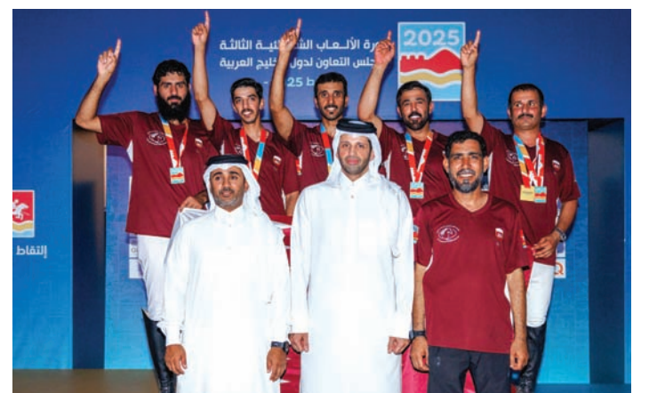
and Ibrahim al-Hammadi, while Ali al-Athba added another bronze in the individual category of the same event. Qatar's delegation featured 18 athletes competing across five disciplines: beach volleyball, athletics, sailing, open water swimming, and equestrian (tent pegging).