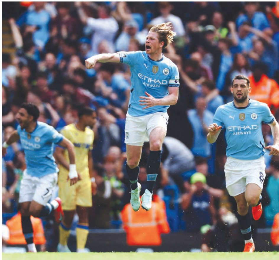
Manchester City's Kevin De Bruyne celebrates after scoring against Crystal Palace during the Premier League match at the Etihad Stadium in Manchester.

It appeared the Spaniard would get away with that risk as Saka and Odegaard were introduced seconds after Declan Rice teed up Thomas Partey to open the scoring on the break from a Brentford corner. But the Bees hit back with a well-worked set-piece of their own when Nathan Collins headed Michael Kayode's cross down and Yoane Wissa flicked in his 16th goal