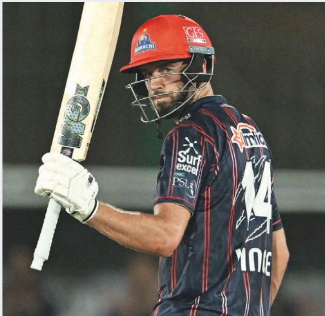
Karachi Kings's English batsman James Vince celebrates after scoring a half-century during the PSL match against Multan Sultans in Karachi yesterday. Batting first, Multan Sultans scored 234 for 3 in 20 overs. Karachi Kings, in reply, reached 236 for 6 in 19.2 overs thanks to Vince's brilliant 101 off 43 deliveries.