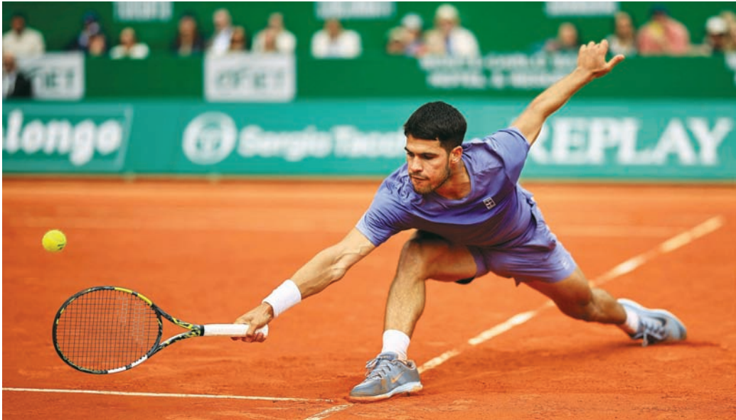
Spain's Carlos Alcaraz plays a backhand return to Spain's Alejandro Davidovich Fokina during the Monte Carlo Masters match at the Monte Carlo Country Club in Roquebrune-Cap-Martin yesterday.

Alcaraz quickly became the tournament favourite following early exits for top seed Alexander Zverev and Novak Djokovic, while world number one Jannik Sinner is still serving a doping ban.