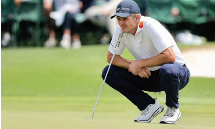
Justin Rose of England lines up a putt on the 18th hole during the second round of the 2025 Masters Tournament at Augusta National Golf Club in Augusta, Georgia.