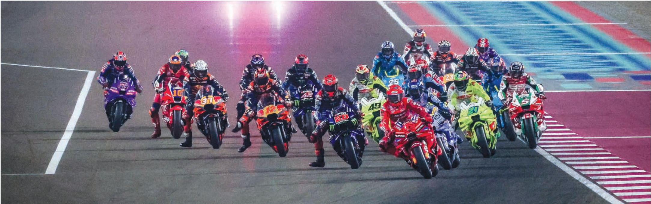
Ducati's Marc Marquez reclaimed the lead of the MotoGP world championship after leading every lap from pole position to win the Qatar GP sprint race at Lusail International Circuit.

Marc's younger brother Alex of Gresini Racing once again had to settle for second place