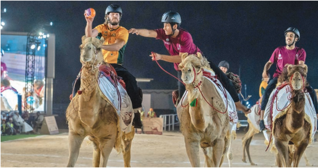
Action from Qatar's match against Australia on day two of the 4th International Camel Handball Championship currently being played at Libsear Heritage Village in Al Shahaniya. Qatar won 11-7.

The tournament has been a whirlwind of excitement, with teams displaying remarkable skill and determination. Morocco's