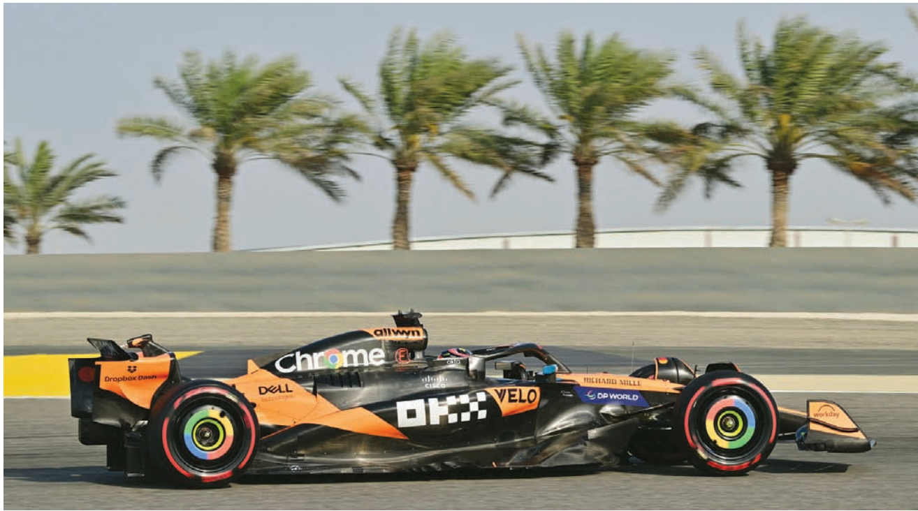
McLaren's Oscar Piastri drives during the qualifying session at the Bahrain International Circuit in Sakhir yesterday.

For Piastri, placed third in the championship 13 points behind his teammate, this was only his second ever pole, the first coming in China last month when he went on to win. As for Verstappen, the writing was on the wall as his evening had begun badly. "There's something really wrong