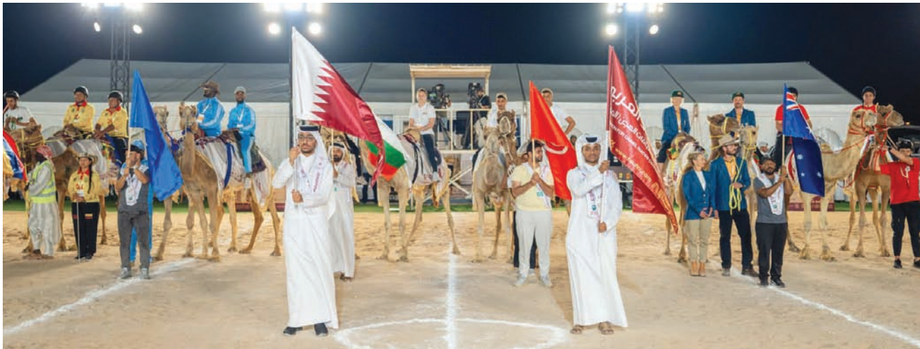
A glimpse of the opening ceremony of the 4th International Camel Handball Championship at Libsear racetracks in Al Shahaniya yesterday.

"The focus remains squarely on the podium, with each team vying to claim the championship title. The level of play is expected