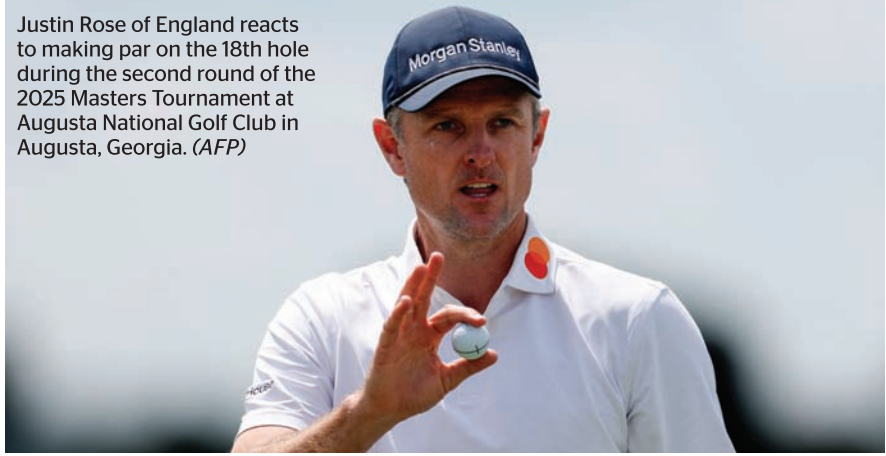
Justin Rose of England reacts to making par on the 18th hole during the second round of the 2025 Masters Tournament at Augusta National Golf Club in Augusta, Georgia.

“But, other than that, the golf course was in front of me most of the day, kept the ball in