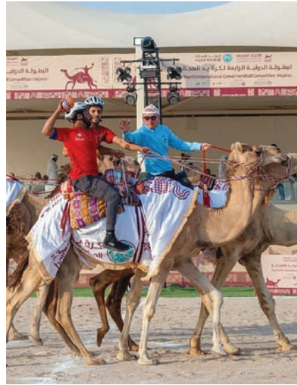
Action from the match between Oman and the United States.

platform for athletes to demonstrate their dedication and pursue victory at the highest professional level. The global representation underscores the sport's widespread appeal