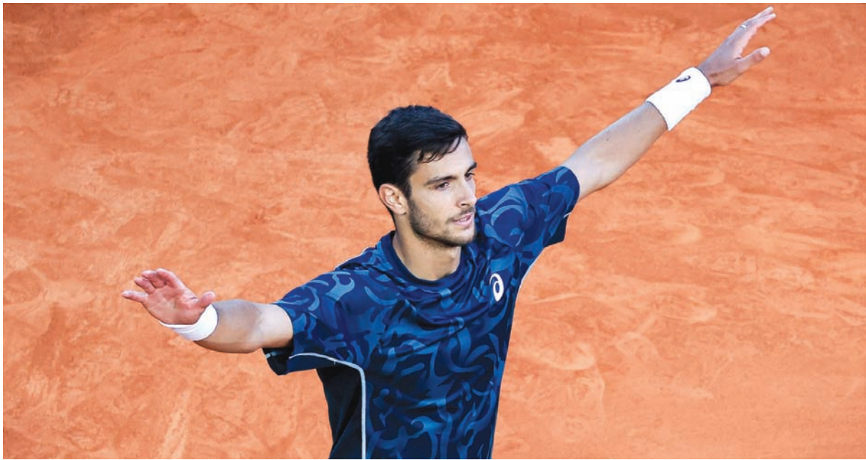
Italy’s Lorenzo Musetti celebrates after victory over Greece’s Stefanos Tsitsipas following the Monte Carlo Masters quarter-final at the Monte Carlo Country Club yesterday.