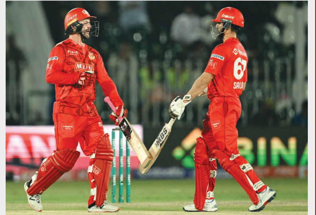
Islamabad United’s Colin Munro (left) celebrates his fifty score (50 runs) with teammate Salman Agha during the Pakistan Super League (PSL) match against Lahore Qalandars at the Rawalpindi Cricket Stadium yesterday. Islamabad began their PSL title defence with a winning start, posting a comprehensive 8-wicket thrashing of Lahore Qalandars. Jason Holder starred with the ball taking 4 wickets for 26 as Qalandars were bowled out for 139 in 19.2 overs. In reply, Munro made an unbeaten 42-ball 59 to guide United home with 14 balls to spare.