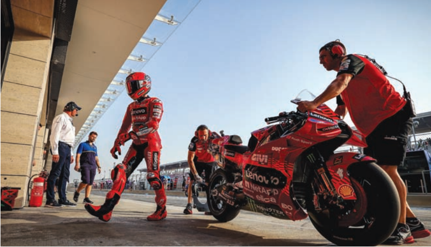
Ducati's Pecco Bagnaia was second yesterday, 0.145 secs behind Franco Morbidelli.