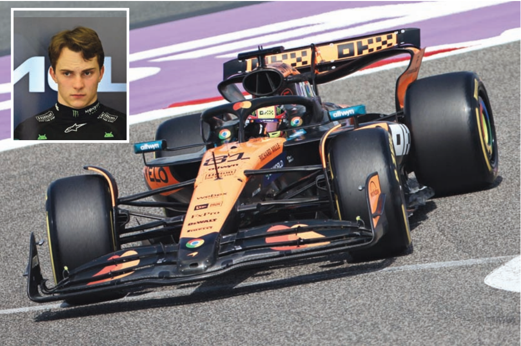
McLaren’s Australian driver Oscar Piastri (also inset) drives during the first practice session ahead of the Bahrain Grand Prix at the Bahrain International Circuit in Sakhir yesterday.

A human wall of Aston mechanics blocked any inquisitive com-