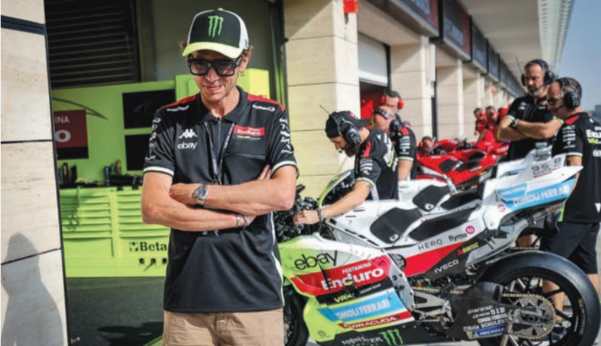
MotoGP legend and VR46 Racing team owner Valentino Rossi in attendance during the Qatar Grand Prix at the Lusail International Circuit yesterday.