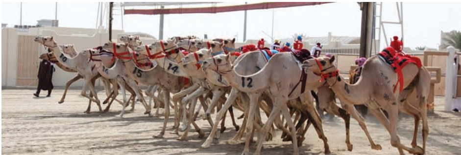
finale and hoping for more success."

Racing resumed at Al Shahaniya for the eleventh day of the festival with 14 rounds over 8km in the morning. The Presidential Camels and Al Shahaniya Camels shared top honours.