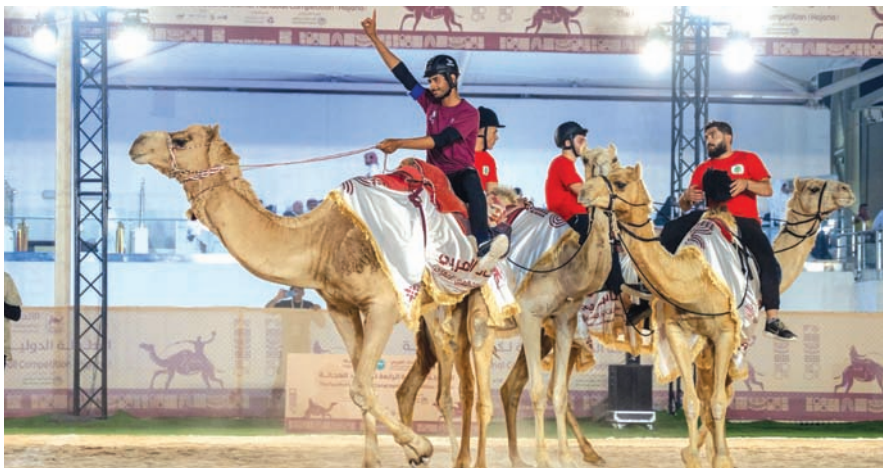
A Qatari player rejoices after scoring against Lebanon at Libsear racetracks at Al Shahaniya.