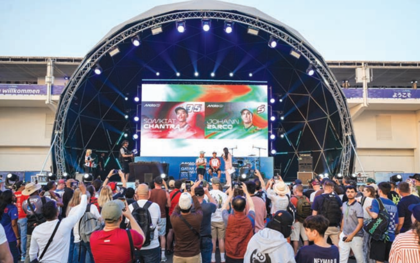
LCR Honda's riders Johann Zarco and Somkiat Chanttra at the Fan Zone, which was alive with crowds joining in various activities.