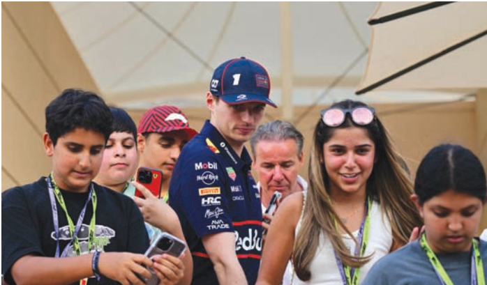
Red Bull Racing’s Dutch driver Max Verstappen stands among fans before the second practice session ahead of the Bahrain Grand Prix at the Bahrain International Circuit in Sakhir yesterday.

Norris was keeping his feet firmly on the ground, suggest-