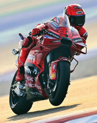
Factory Ducati's Spanish rider Marc Marquez rides during the practice session.

foot in a crash during pre-season testing in Malaysia in February and then broke his left hand as he prepared to return. He missed the first three races of the season.