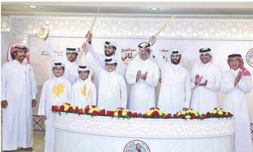
Connections of the winning camels pose with their trophies during the Purebred Arabian Camel Racing Festival at the Al Shahaniyah Racetrack yesterday.

38 races scheduled today, including prestigious Shalfa and Dagger challenges in afternoon session