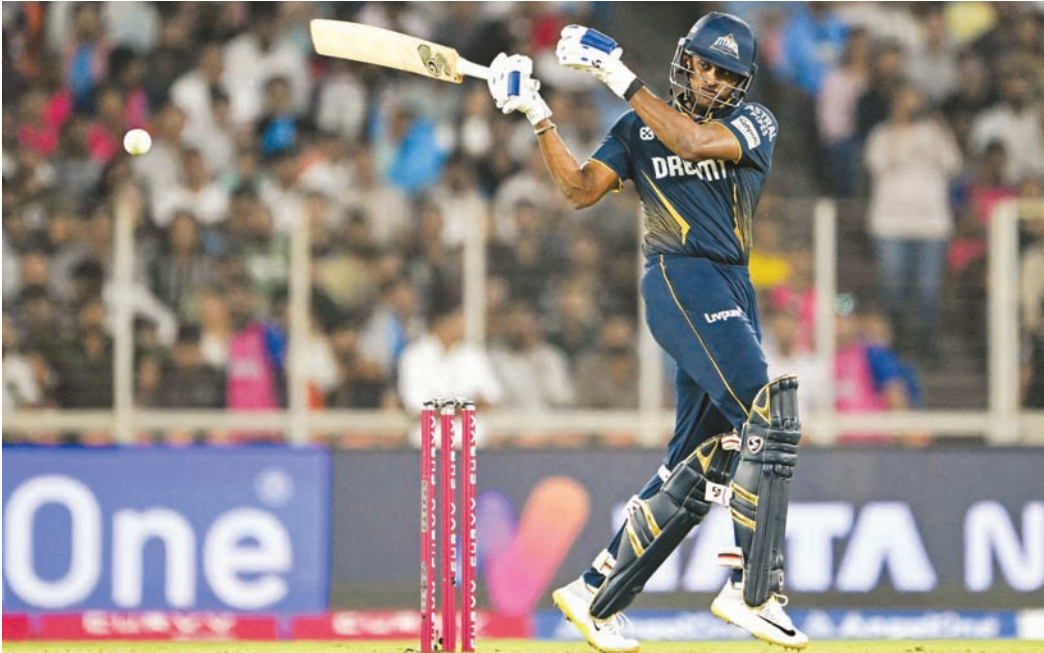
Gujarat Titans' Sai Sudharsan plays a shot during the IPL match against Rajasthan Royals in Ahmedabad yesterday. Sudharsan scored 82.

Theekshana broke through as he trapped Buttler lbw, a decision denied by the on-field umpire but Rajasthan skipper Sanju Samson successfully reviewed the call.