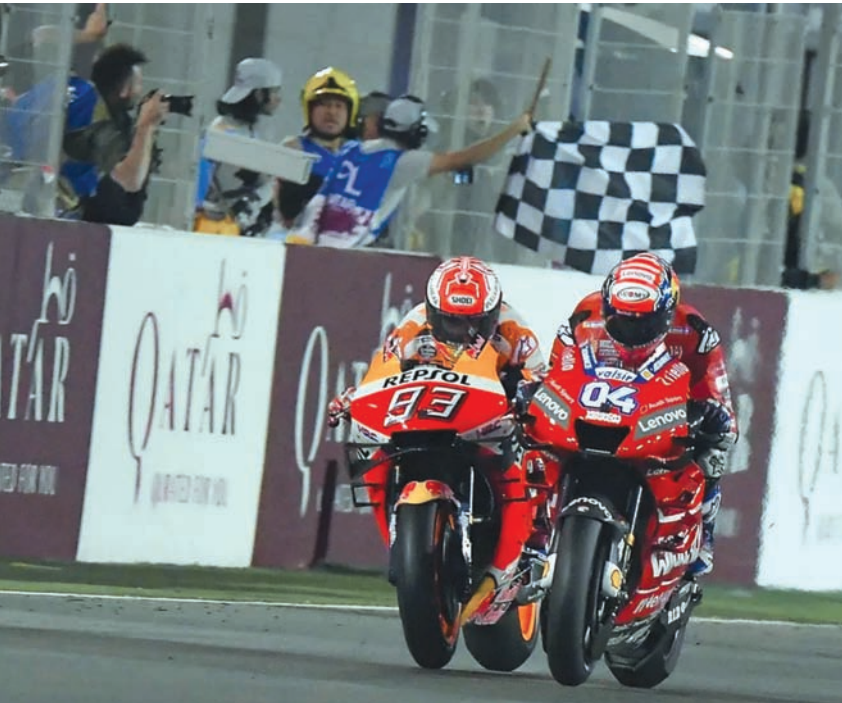
Marc Marquez (left) and Andrea Dovizioso battle for lead during the Qatar MotorGP Grand Prix in 2017 at the Lusail International Circuit.

A s MotoGP hurtles to Round 4 of the season in 2025, it's the floodlights of Qatar that are set to illuminate the championship battle once more. However, the Lusail International Circuit has gained a reputation for hosting classics over the years, so here is a pick of five of the best. 2005: ROSSI VS MELANDRI IN THE FIRST OF MANY LAST-LAP LUSAIL DUST-OFFS Just a year after the circuit welcomed MotoGP, it was back to once again showcase the most exciting sport on earth and it didn't disappoint. In a season that was being dominated by Valentino Rossi in his second season at Yamaha, Marco Melandri was emerging as a late contender for runner-up. In this desert thriller, the #33 battled hard with The Doctor and made a bold lunge on the last lap to hit the front into Turn 12. However, he ran wide and although he came through for P2, he was denied a first premier class win again by Rossi, who edged closer to his seventh title by becoming the first rider to win ten Grands Prix in a season. 2013: A STAR'S DEBUT, ANOTHER STAR'S COMEBACK A new era erupted for Round 1 in 2013 as Marc Marquez made his debut in MotoGP. Straight away competitive but not quite