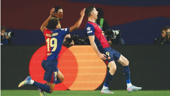
Barcelona's Robert Lewandowski celebrates with Lamine Yamal after scoring against Borussia Dortmund.