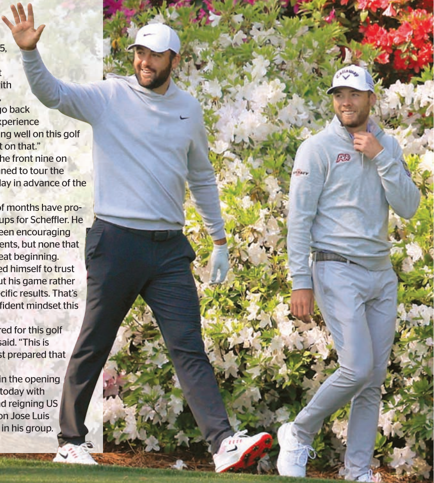
Scottie Scheffler of the US and compatriot Sam Burns on the 13th hole during a practice round at the Augusta National Golf Club, Augusta, Georgia, US, yesterday.