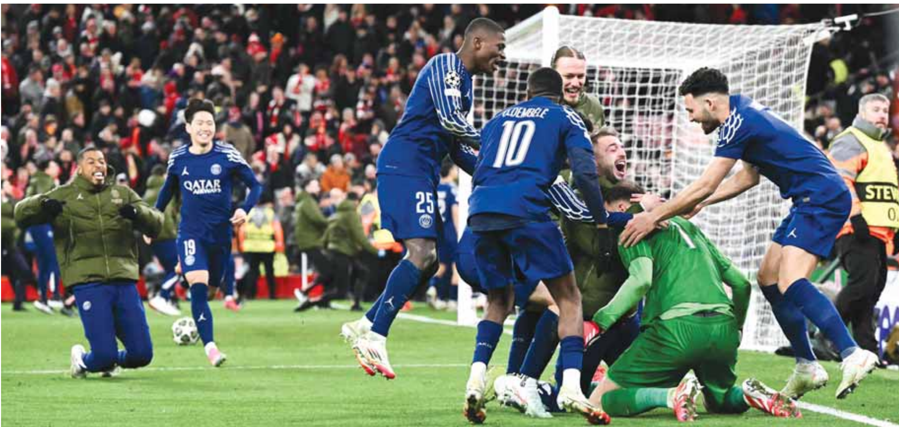
Paris Saint-Germain's players celebrate after winning the last 16 second leg Champions League match against Liverpool at Anfield in Liverpool, north west England.

After the tie had finished 1-1 on aggregate, PSG's Donnarumma saves two spot kicks