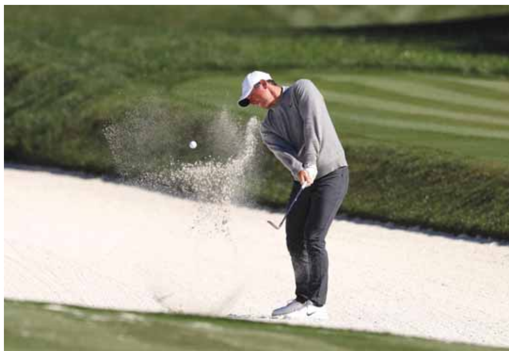
Rory McIlroy of Northern Ireland plays from a bunker on the 11th prior to The Players Championship on the Stadium Course at TPC Sawgrass in Ponte Vedra Beach, Florida.

McIlroy, though, believes the fiercely driven Woods will do all he can to be competitive when he does eventually return to fitness.