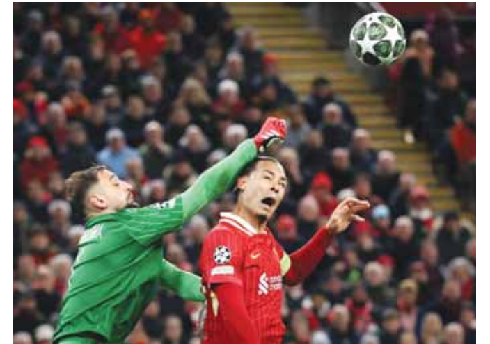
Paris Saint-Germain's goalkeeper Gianluigi Donnarumma (left) vies for the ball with Liverpool's defender Virgil van Dijk during the last 16 second leg Champions League match at Anfield in Liverpool.

"You always have to learn from difficult moments. That's life. That's life of any human being, but us footballers as well," he said. "There were things we could have done better, but overall I am proud of the performance we put in. We have to feel the disappointment, but if we bring this intensity in Wembley with our fans, then I am positive. There are not many games left and there are two big prizes we can still get. We are going to give it everything."