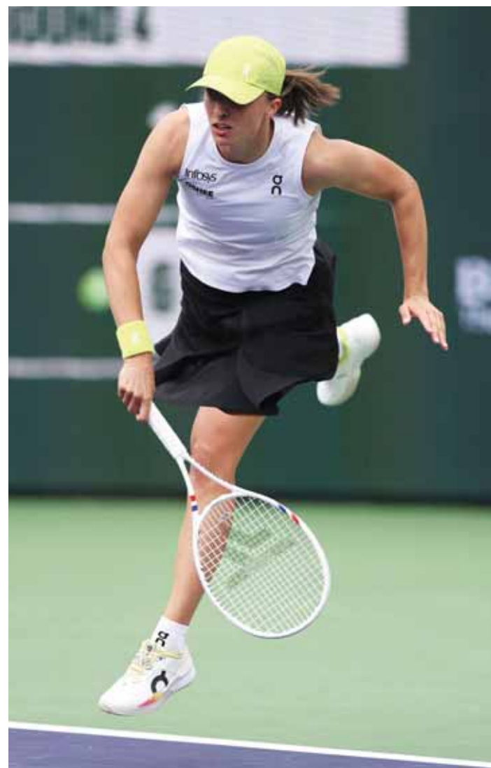
Iga Swiatek of Poland serves against Karolina Muchova of Czechia in their fourth round match.

Up 4-3 in the second set, Rune saved a break point with a dazzling between-the-legs shot, racing back to the baseline after a Tsitsipas lob and battling the twener that dropped perfectly to deny the