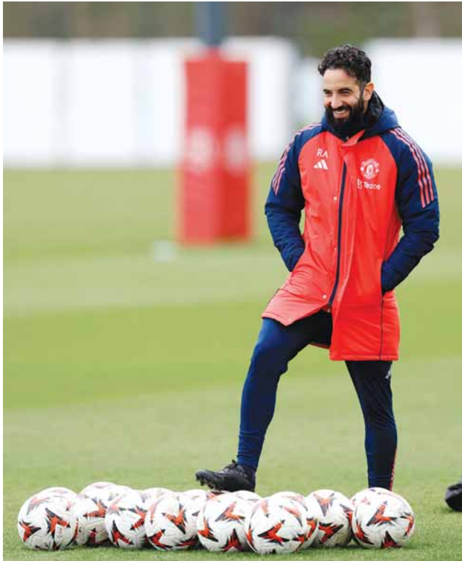
Manchester United manager Ruben Amorim during a training session in Carrington, Britain.

Amorim acknowledged the significance of the Sociedad clash as he urged his side to play with more energy. "In that context it's also important to give us more energy to continue the season," he said. "We know that it's not going to change a lot of the idea for the next season, but it gives us more energy to finish the season in a different way. Tomorrow, again, is going to be really important game for us."