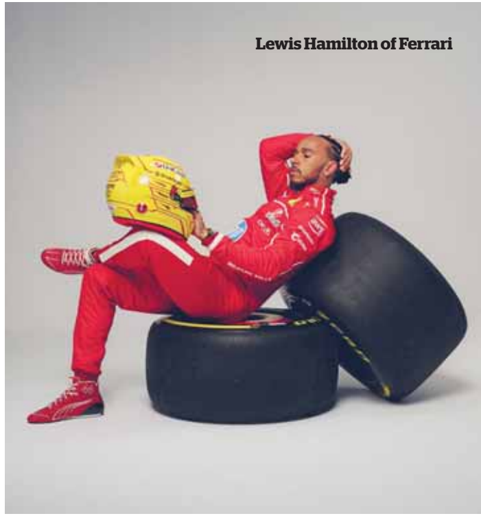
Lewis Hamilton of Ferrari

the ears of Australian fans cheering for McLaren's Oscar Piastri as he looks to become the first home driver to win the race since it was added to the F1 world championship calendar in 1985.