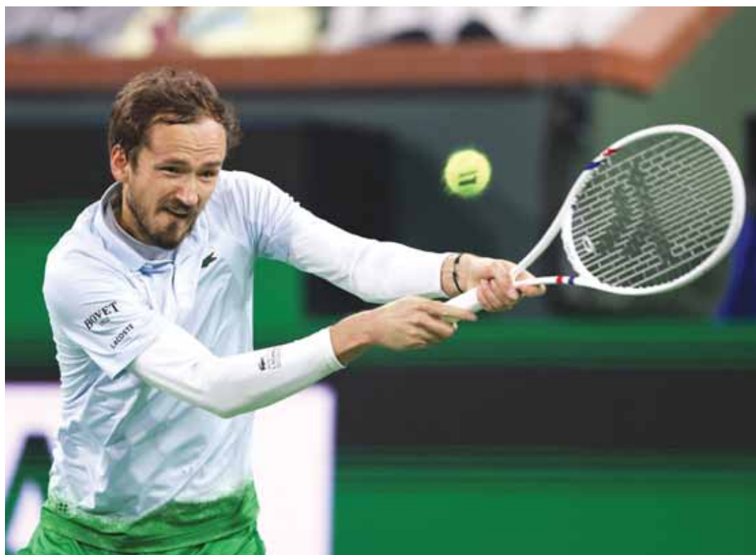
Daniil Medvedev plays a backhand against Tommy Paul of the United States in their fourth round match during the BNP Paribas Open in Indian Wells, California.

The world number two from Poland needed just 57 minutes to put away Muchova, who took her to three sets in the 2023 French Open final.