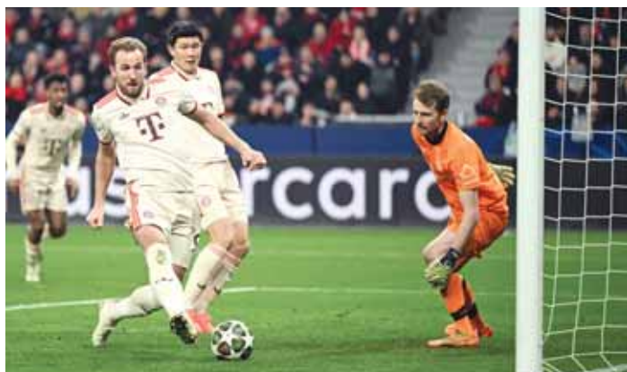
Bayern Munich's Harry Kane scores during the UEFA Champions League last 16 second leg match against Bayer Leverkusen.

Kane scored once and set up Alphonso Davies for the other goal as Bayern eased to a 2-0 win in the second leg in Leverkusen on Tuesday to reach the quarter-finals in convincing fashion. "I think we showed what type of team we are. We want to grow in the competition. We've had some results in this competition that haven't been great and I feel like we've learned from that," Kane said. "I feel like we're going to have to keep learning as we go further but, you know, we're in the quarter-final now where Bayern Munich should be and we want to keep pushing."