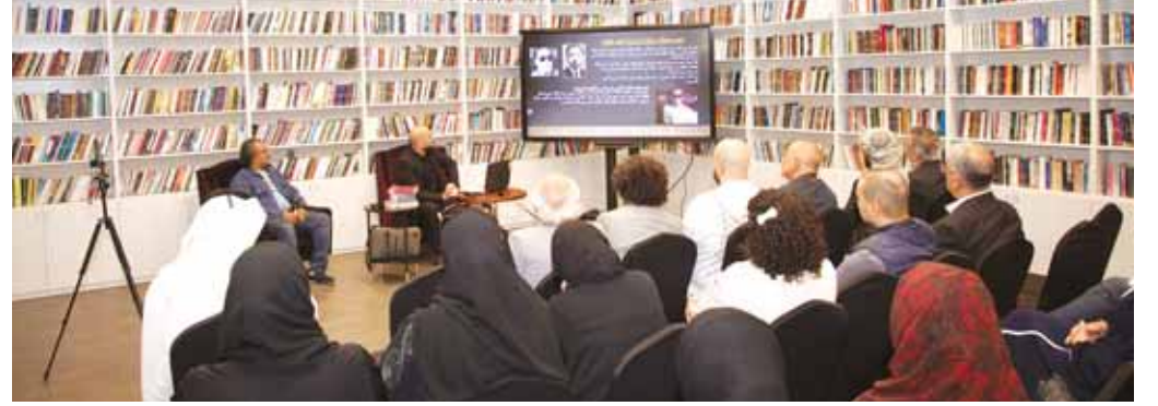
The Ramadan atmosphere at Katara attracts a large number of visitors daily.