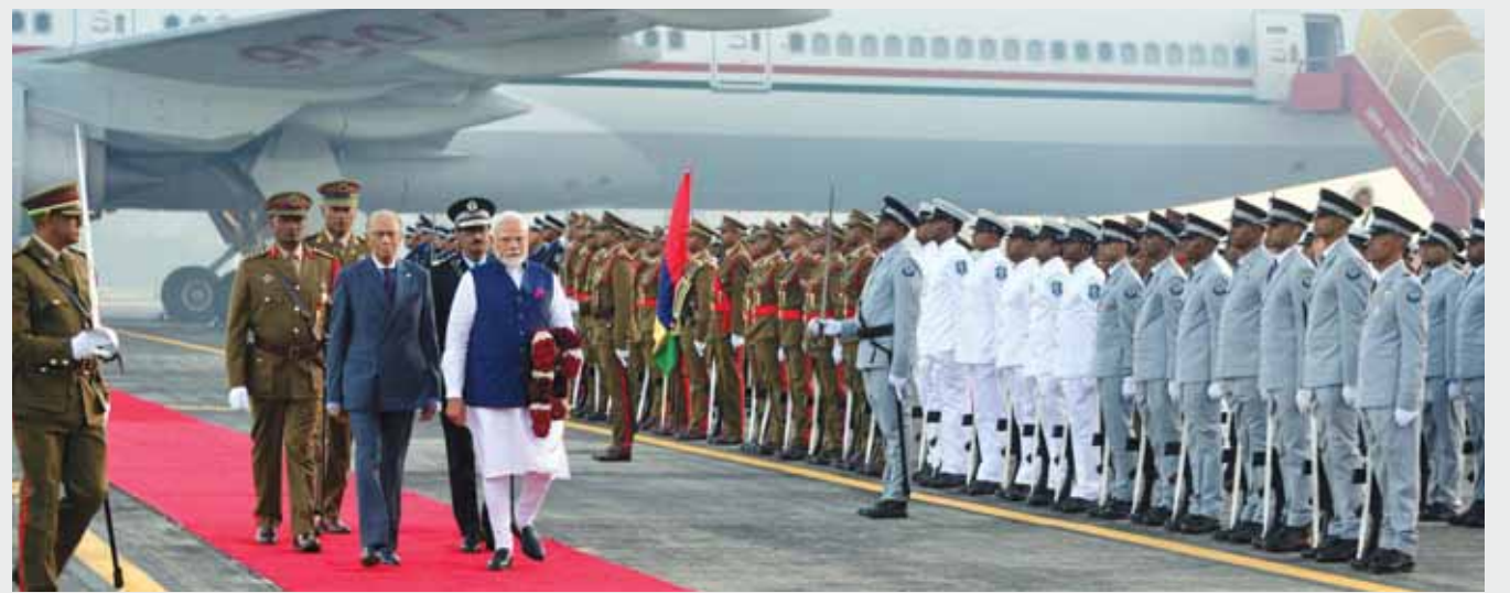
India's Prime Minister Narendra Modi is received by his Mauritius counterpart Navin Ramgoolam during his state visit, at the Sir Seewoosagar Ramgoolam International Airport in Plaine Magnien, Mauritius, yesterday.