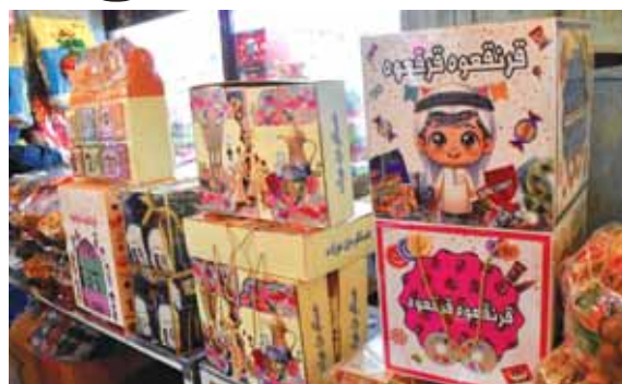
Shops at Souq Waqif have stocked a variety of Garangao kits.

Shops have special Garangao packages on sale.