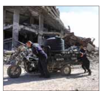
Palestinians push a vehicle carrying a water tank past destroyed buildings in Jabalia city in the northern Gaza Strip yesterday.