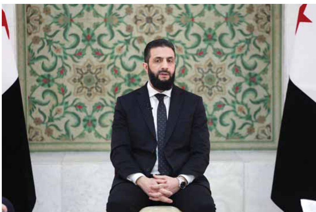
Syria's interim President Ahmed al-Sharaa attends an interview with Reuters at the presidential palace, in Damascus, Syria on Monday.

In the final analysis, the East Med region has within its grasp a truly historic treasure chest, one containing not only lucre and energy security, but also a veritable new era of peace and stability, one in which relations among states are conducted according to the rule of (international) law. This is the very purpose for which the United Nations was founded, and although that organisation has frequently been prevented from carrying out its mission in this and other parts of the world, what would be more appropriate than to have member states adhere to the very principles that the Security Council cannot or will not uphold?