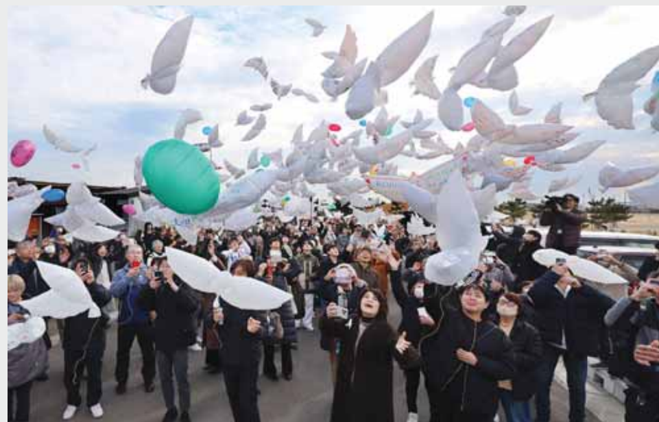
People release dove-shaped balloons in the air in remembrance in Natori, Miyagi Prefecture, yesterday to mark the 14th anniversary of the magnitude 9.0 earthquake which triggered a tsunami and nuclear disaster in Japan.