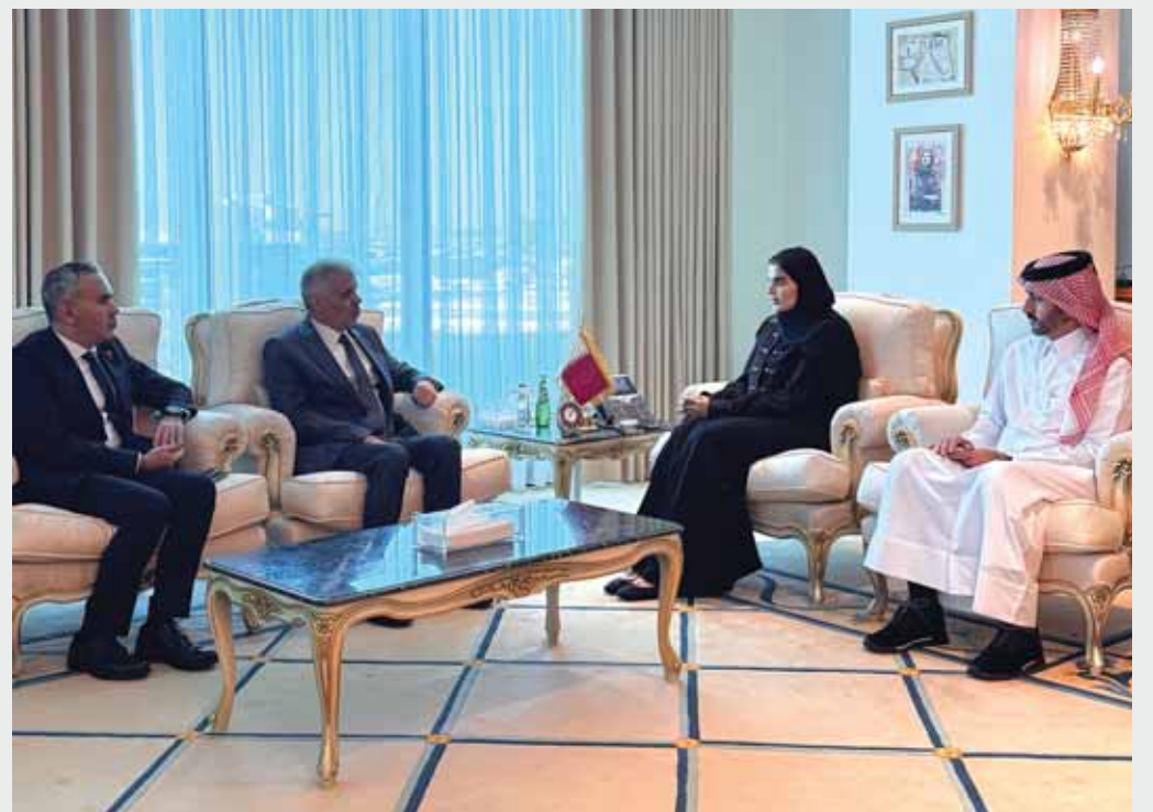
HE the Minister of State for International Co-operation Maryam bint Ali bin Nasser al-Misnad met yesterday with the visiting Minister of Education and Higher Education of State of Palestine Dr Amjad Barham. During the meeting, the two sides discussed bilateral relations and the developments in the Gaza Strip and the occupied Palestinian territories. They also discussed ways to address the challenges facing the education sector in Palestine. (QNA)