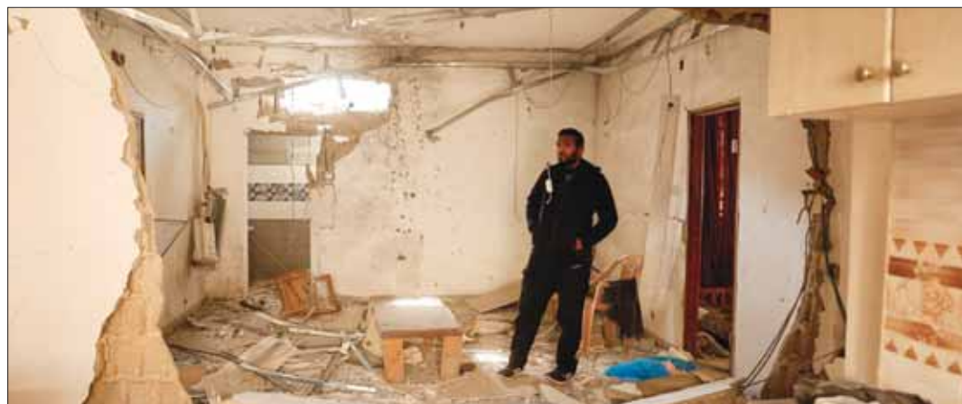
A man stands in a damaged building, near the site where a number of Palestinians were killed in an Israeli raid, in Jenin, in the occupied West Bank, yesterday.

Iran has accelerated its nuclear work since 2019, a year after then-President Trump ditched Tehran's 2015 nuclear pact with six world powers and reimposed sanctions that have crippled the country's economy.