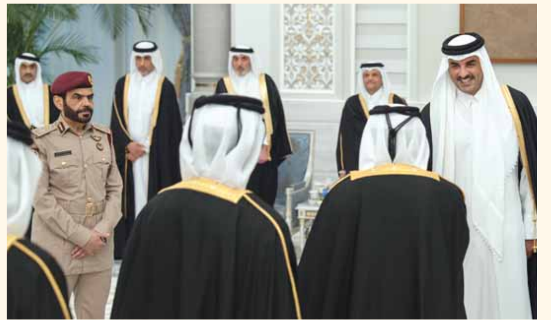
His Highness the Amir Sheikh Tamim bin Hamad al-Thani hosted yesterday at Lusail Palace an Iftar banquet in honour of commanders and ranking officers of the Armed Forces, the Ministry of Interior, and the various security apparatus of the state.