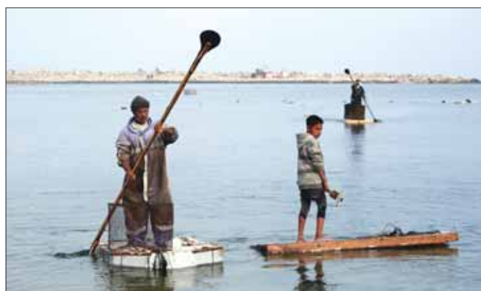
A Palestinian men use the doors of refrigerators as makeshift rowing boats to catch fish at the port of Gaza City.