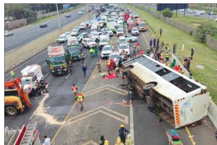
Emergency personnel work at the scene of a fatal bus crash near OR Tambo International Airport, in Ekurhuleni, East of Johannesburg, South Africa, yesterday.

More than 11,800 lives were lost on South African roads in 2023, most of them pedestrians, according to the latest data from RTMC.