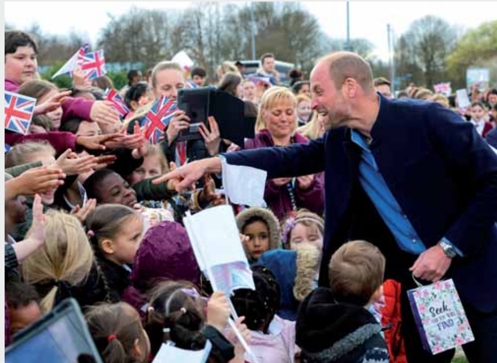
Britain's Prince William is welcomed by children upon his arrival for a visit at the FA Referee Training Course, at the Aspray Arena, in Willenhall, England, yesterday.