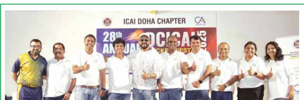
DCICAI officials with former Indian team player Sreesanth (fifth from left) at the fiesta.

The Musaharati adds a special touch to the Ramadan atmosphere, as children and families gather to enjoy this centuries-old heritage experience.