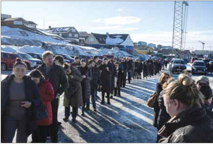
People queue to cast their votes outside the polling station during general election in Nuuk yesterday.

The lead-up to the election to choose the 31-seat parliament, the Inatsisartut, was mostly marked by debates on health-care, education and future ties with Den-