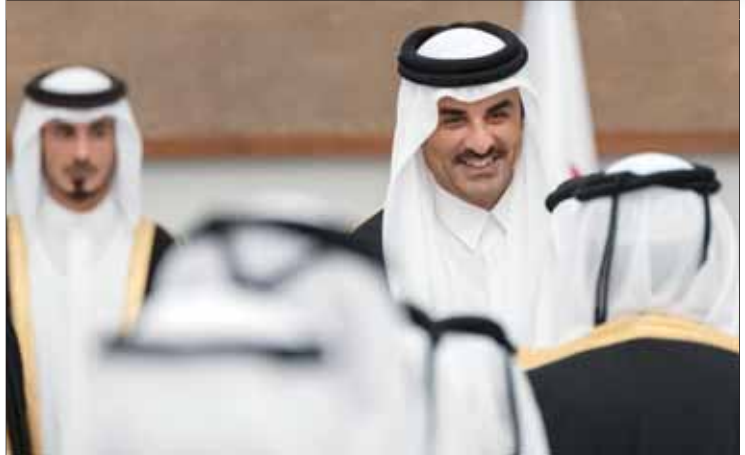
His Highness the Amir Sheikh Tamim bin Hamad al-Thani hosted yesterday at Lusail Palace an Iftar banquet in honour of commanders and ranking officers of the Armed Forces, the Ministry of Interior, and the various security apparatus of the state, on the occasion of the holy month of Ramadan. The banquet was attended by His Highness the Personal Representative of the Amir Sheikh Jassim bin Hamad al-Thani along with a number of Sheikhs, Ministers, and senior officials. Page 3