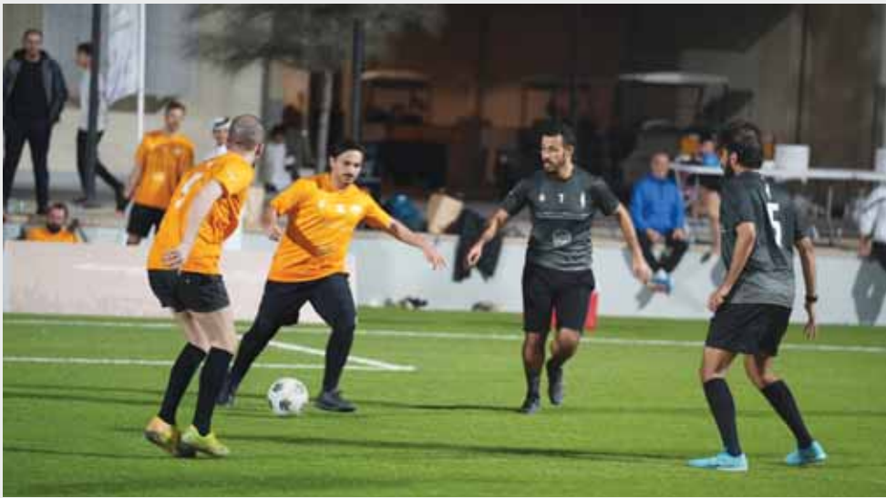
The second edition of Ramadan Football Championship, organised by the Ministry of Environment and Climate Change (MoECC), under the slogan 'For a Sustainable Sports Environment,' will run until March 21 at the University of Doha for Science and Technology, featuring 12 teams of employees and affiliates. The daily matches run from 10pm to 12.15am.