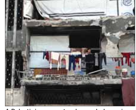
A Palestinian man stands on a balcony in a damaged building where he shelters in Beit Lahia in the northern Gaza Strip, yesterday.

Israel ordered an immediate halt to Gaza's electricity supply yesterday in an effort to pressure Hamas into releasing the remaining hostages, even as it prepared for fresh talks on the future of its truce with the Palestinian resistance movement. Israel's decision comes a week after it blocked all aid supplies to the war-battered territory, a move reminiscent of the initial days of the war when Israel announced a "siege" on Gaza. The truce's initial phase ended on March 1 and both sides have refrained from returning to all-out war, despite sporadic violence. Hamas has repeatedly called for an immediate start to negotiations on the ceasefire's second phase, which was negotiated by the US, Qatar and Egypt, aiming to end the war permanently. Israel says it prefers extending phase one until mid-April, and halted aid to Gaza over the impasse. Yesterday it ordered a cut in the electricity supply. "I have just signed the order to stop supplying electricity immediately to the Gaza Strip," Energy Minister Eli Cohen said in a video statement. The sole power line between Israel and Gaza supplies the main desalination plant, and Gazans mainly rely now on solar panels and fuel-powered generators to produce electricity. Public Broadcaster Kan reported Monday Israel has drafted plans to ramp up pressure under a scheme dubbed the "Hell Plan". This included following up the aid block