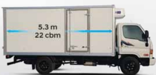
HD 72 (GVW: 7.2 tons - Extra Long Wheelbase) from QR 82,900* (Single Cabin Chassis Truck - 5.3 m)

*Price for Cargo/Chiller/Reefer, extra as applicable