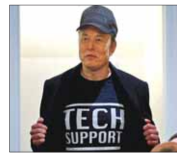
DICTATING POLICY? Elon Musk.

Billionaire industrialist and senior White House adviser Elon Musk vowed yesterday to maintain Ukraine's access to his Starlink satellite network, after a fierce online clash with Poland's outspoken foreign minister. The United States has suspended military aid and intelligence sharing with Ukraine after a disastrous February 28 meeting between presidents Donald Trump and Volodymyr Zelensky in the White House. This has led to fears that Musk, a close Trump ally, might cut off Ukrainian access to his private Starlink communications system, which is used extensively by Kyiv's frontline troops for battlefield communication. Yesterday, during exchanges on his own X social media platform, Musk promised that this would not be the case, after an online clash with the Polish foreign minister, Radoslaw Sikorski, that drew in US Secretary of State Marco Rubio. "To be extremely clear, no mat-