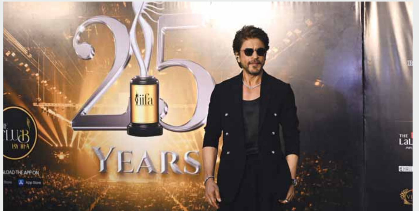
Bollywood actor Shahrukh Khan poses as he arrives on the green carpet to attend the Silver Jubilee edition of the International Indian Film Academy (IIFA) Awards, in Jaipur, India, yesterday.