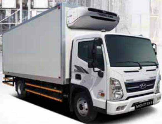
EX-8 (GVW: 9.8 tons - Extra Long Wheelbase)

Hyundai Truck & Bus Showroom NOW OPEN @ No. 37, Safwa Building Barwa Commercial Complex