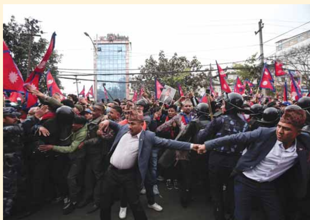
Security personnel try to control pro-monarchy supporters as they gather to welcome former King of Nepal Gyanendra Bir Bikram Shah Dev upon his arrival outside the Tribhuvan International Airport, in Kathmandu, Nepal, yesterday.