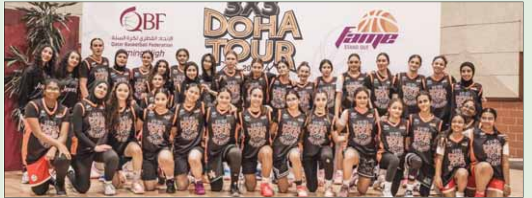
The girls' teams competing in the tournament.