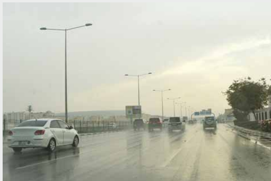
Intermittent showers, ranging from light to heavy and thundery, drenched Qatar yesterday, when the minimum and maximum temperatures were in the 18°-20° Celsius and 20-24C range, respectively. The forecast for today (Monday), according to the Met office, is expected thundery rain associated with strong wind, both inshore and offshore. The expected minimum and maximum temperatures are in the 17-20C and 20-24C range, respectively. The images depict rain scenes from Doha.