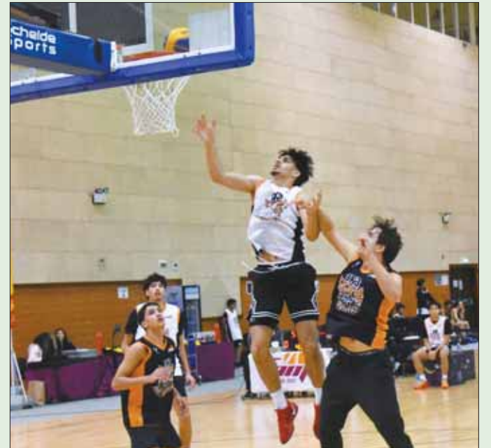
Players vie for the ball during the tournament.

general manager of Fame Sports Academy, has expressed his appreciation to the officials of the QBF for providing the opportunity to participate in organising the Doha Basketball Tour 3x3 for the U16 and U21 categories.