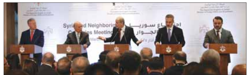
Lebanese Foreign Minister Youssef Rajji, Turkish Foreign Minister Hakan Fidan, Iraqi Foreign Minister Fuad Hussein, Syrian Foreign Minister Asaad Hassan al-Shaibani and Jordanian Foreign Minister Ayman Safadi attend a press conference after a meeting in Amman, yesterday.

Jordan's Minister of Foreign Affairs, Ayman al-Safadi, stated that the meeting for Syria's neighbouring countries, which was convened in Amman yesterday, deliberated on challenges faced by Syria. During a joint press conference with the foreign ministers of Iraq, Türkiye, Lebanon, and Syria, al-Safadi added that the meeting agreed to maintain Syria's security and denounce any attempts that destabilise security in Syria, highlighting that the conferees underscored that Syria's security and stability are the security and stability of all. The neighbouring countries stressed the importance of helping Syria in reconstruction and concurred in convening the second meeting for Syria's neighbouring