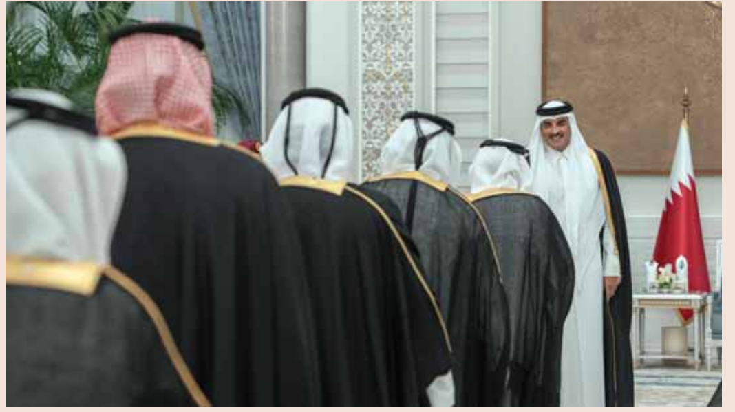
His Highness the Amir Sheikh Tamim bin Hamad al-Thani hosted an Iftar banquet for Their Excellencies members of the ruling family and dignitaries at Lusail Palace yesterday.