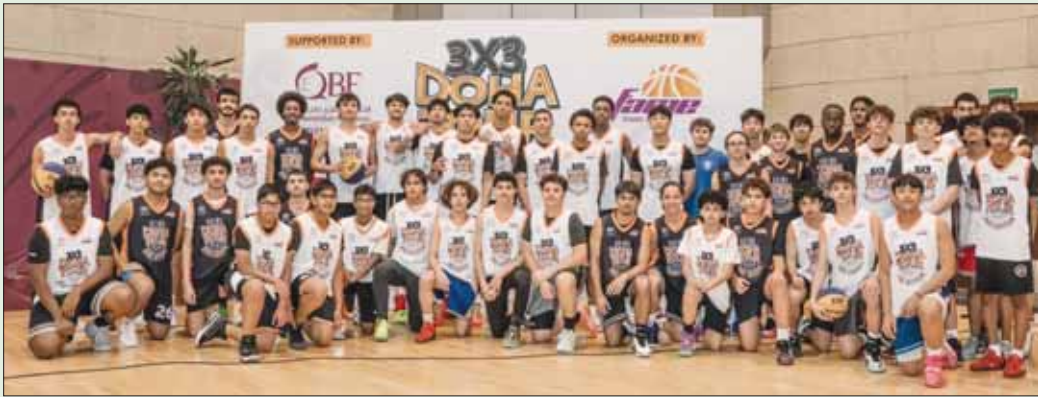
The boys' teams competing in the tournament.