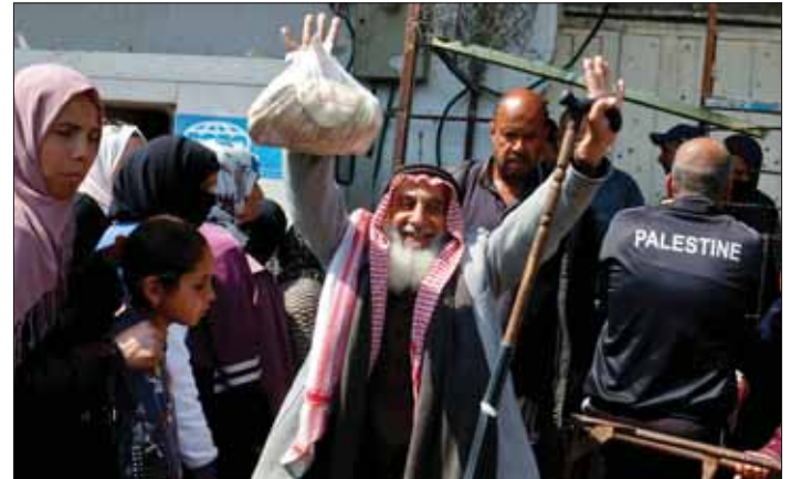
A Palestinian man reacts as he and others gather to receive bread from a bakery, in Khan Younis, in the southern Gaza Strip, yesterday.

She emphasised that any attempt to separate Gaza from the West Bank remains a mere illu-