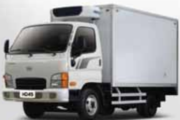
HD45 (GVW: 5 tons - Short Turning Radius) from QR 69,900* (Single Cabin Chassis Truck)