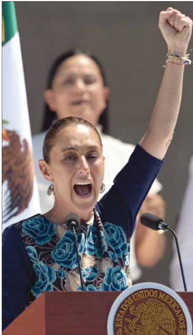
Mexican President Claudia Sheinbaum raises her fist during a rally at the Zocalo square in Mexico City yesterday.