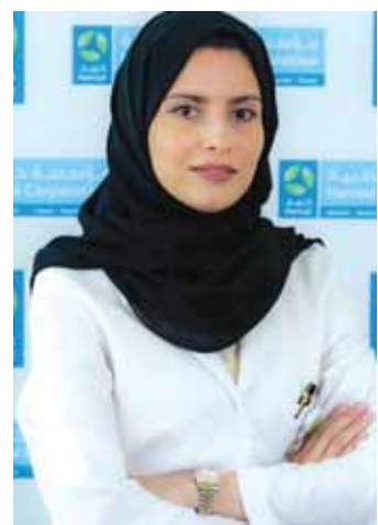
Dr Zakia al-Ansari

In cases where eye drops alone are insufficient, systemic medications such as carbonic anhydrase inhibitors may be prescribed.