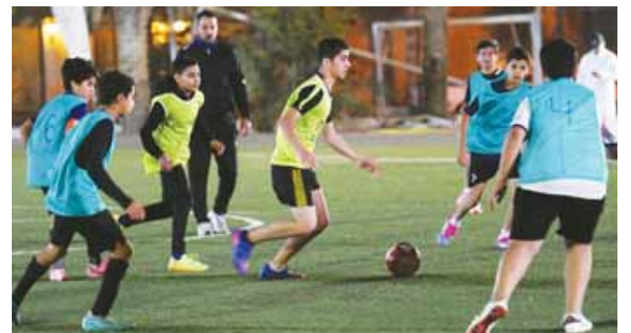
Action from the second edition of the Al Thumama Ramadan Championship.

This decision left fans disappointed, but it highlighted the importance of team management