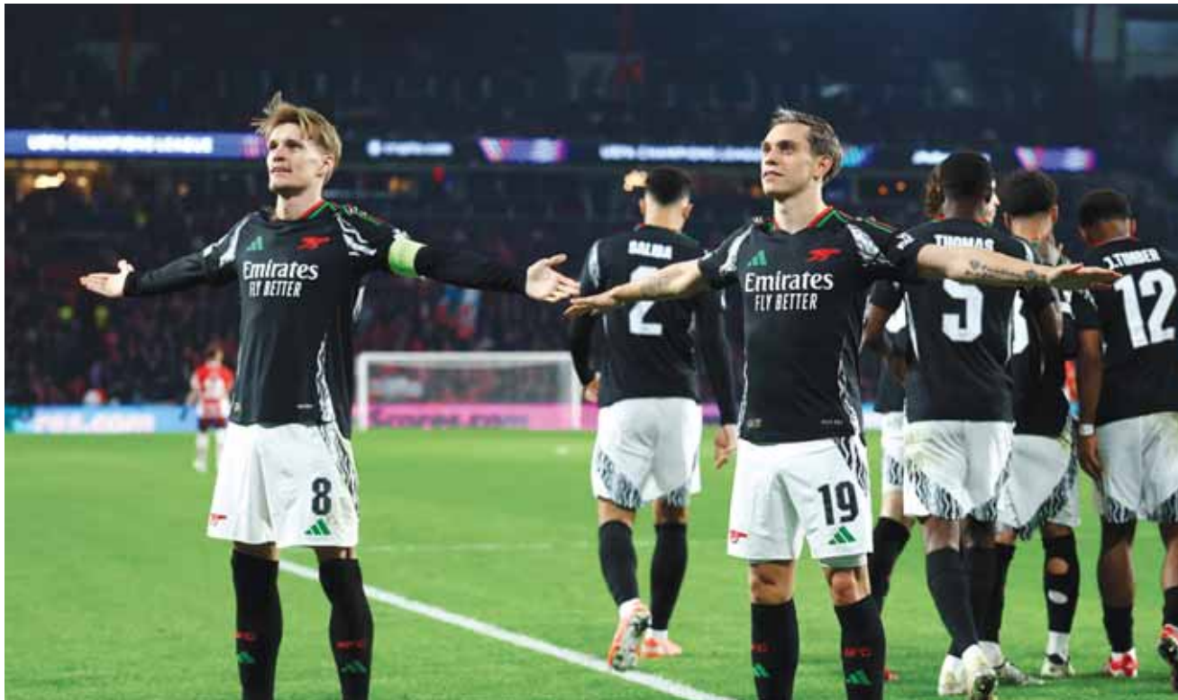
Arsenal captain Martin Odegaard (left) celebrates scoring their fourth goal with Leandro Trossard during the Champions League last 16 first leg match at the Philips Stadion in Eindhoven, Netherlands.

Arsenal next take a trip to 14th-placed Manchester United in the Premier League