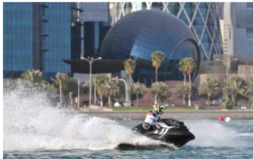
The former Qatar Marine Sports Federation (QMSF) hosted a round of the aquabike series on Doha Bay between March 2011 and its closure in March 2015.

The former Qatar Marine Sports Federation (QMSF) hosted a round of the aqua-