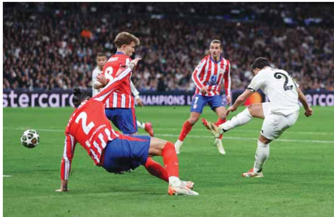
Real Madrid's Brahim Diaz scores against Atletico de Madrid at the Santiago Bernabeu Stadium.