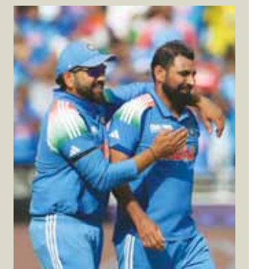
India's Mohammed Shami (right) celebrates with captain Rohit Sharma during their ICC Champions Trophy match against Australia in Dubai, on Tuesday.

swing with the old ball got Shami pleading with cricket authorities to allow the use of saliva to polish the ball in the 50-over format. The International Cricket Council in 2022 made a ban on saliva - brought in during the Covid pandemic - permanent.