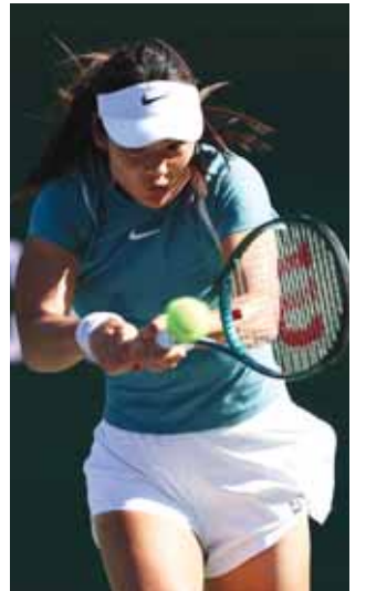
Emma Raducanu of Great Britain plays a backhand during her practice session in Indian Wells, California.

"I literally couldn't see the ball through the tears, I could barely breathe. I was playing Karolina, who's like top 17 in the