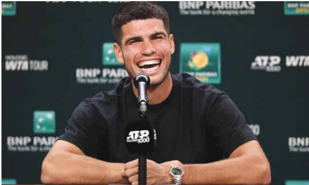
Carlos Alcaraz of Spain fields questions from the media during the BNP Paribas Open at Indian Wells Tennis Garden in Indian Wells, California.

Alcaraz, coming off a quarter-final defeat in the Qatar Open, is seeded second behind Germany's Alexander Zverev, who finished runner-up at the Australian Open to Italian world number one Jannik Sinner. Sinner last month accepted a belated three-month ban after testing positive a year ago for traces of banned Clostebol. The case initially saw him exonerated when authorities accepted his ex-