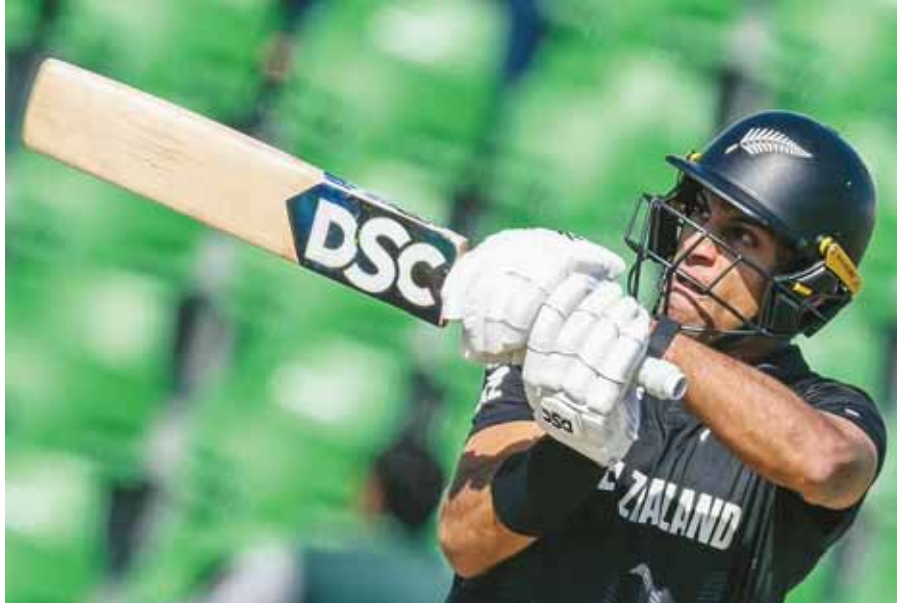
New Zealand's Rachin Ravindra plays a shot during the ICC Champions Trophy match against South Africa at the Gaddafi Stadium in Lahore yesterday. Right: South Africa's David Miller is congratulated by New Zealand's Kane Williamson for scoring a century yesterday.

Ravindra and Williamson combined in a mammoth second-wicket stand in what looked like the coming together of the present