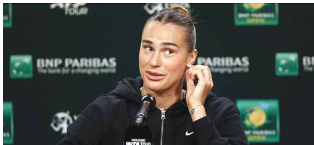
Aryna Sabalenka addressing the media during the BNP Paribas Open at Indian Wells Tennis Garden in Indian Wells, California.