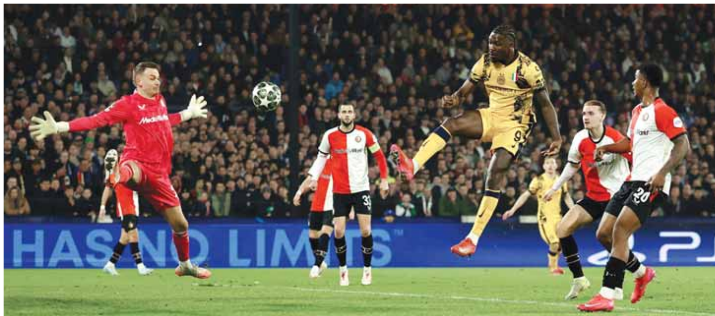
Inter Milan's Marcus Thuram (centre) scores against Feyenoord during the Champions League last 16 first leg match in Rotterdam.

Thuram and Martinez score a goal each for the Italian side